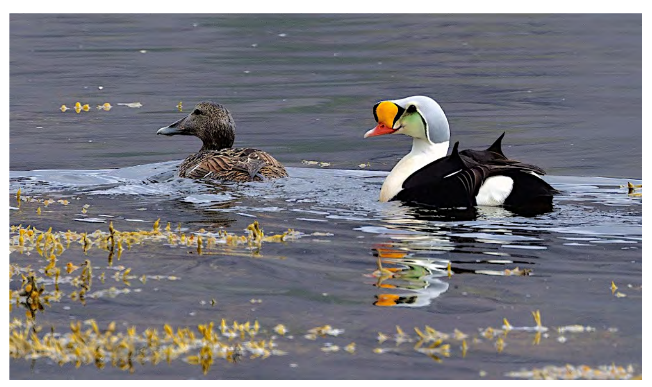
The breeding birds we'll see include many northern ducks, such as the spectacular King Eider.