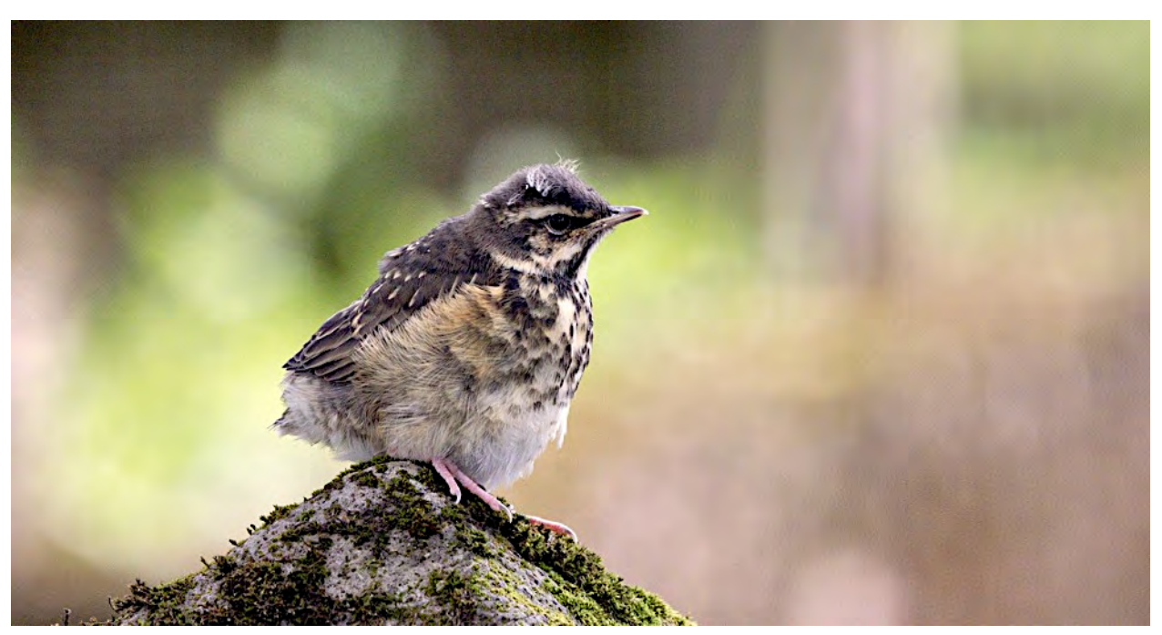
Iceland has relatively few passerine breeders; one that is common throughout our tour is the Redwing. These lovely thrushes are seen across the island, and we should also find many juveniles like this one.

Day 4, Mon, 10 Jun. Lake Myvatn to Dettifoss. This morning will be dedicated to birding this waterfowl-rich area. Species we will target include: Tufted Duck, Barrow's Goldeneye, Eurasian Wigeon, Harlequin Duck, Red-throated Loon, and Horned Grebe. The concentration of waterbirds is the principal reason for visiting; furthermore, this area is our best chance to catch up to Gyrfalcon, which are few and far between. The rare Merlin and Short-eared Owl patrol the region as well. Red-necked Phalaropes are common here, and we will watch for Eurasian Wren and Meadow Pipit too. We'll search for Great Skua along the coast northeast of Husavik. Later in the afternoon, we'll find ourselves marveling at one of Europe's most powerful waterfalls: Dettifoss. Iceland's volcanic origin is on full display in this region. Night near Lake Myvatn.