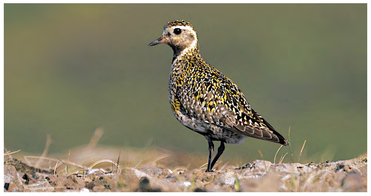
Iceland is a major breeding ground for shorebirds, such as the gorgeous European Golden-Plover.

We include here information for those interested in the 2024 Field Guides Iceland tour: