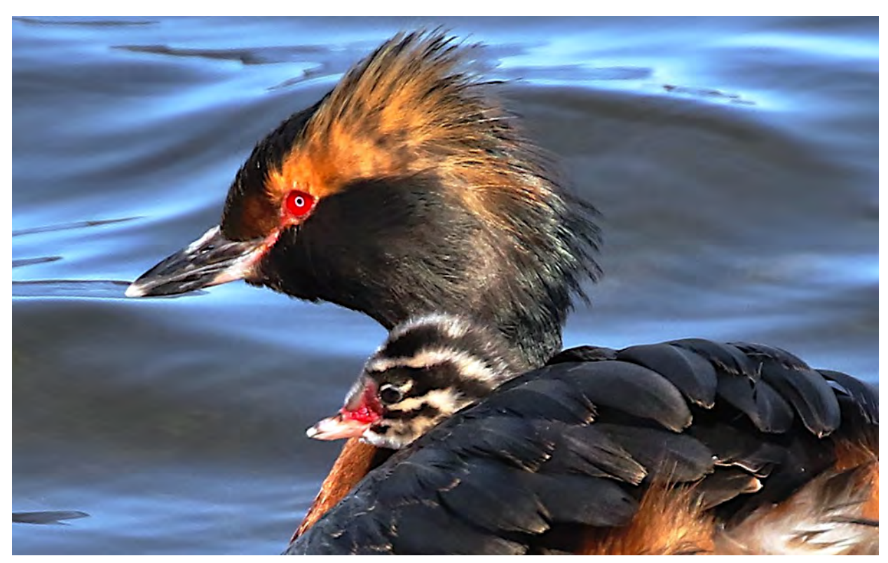
The breeding birds we'll see include many northern ducks, and other waterbirds such as the elegant Horned Grebe.