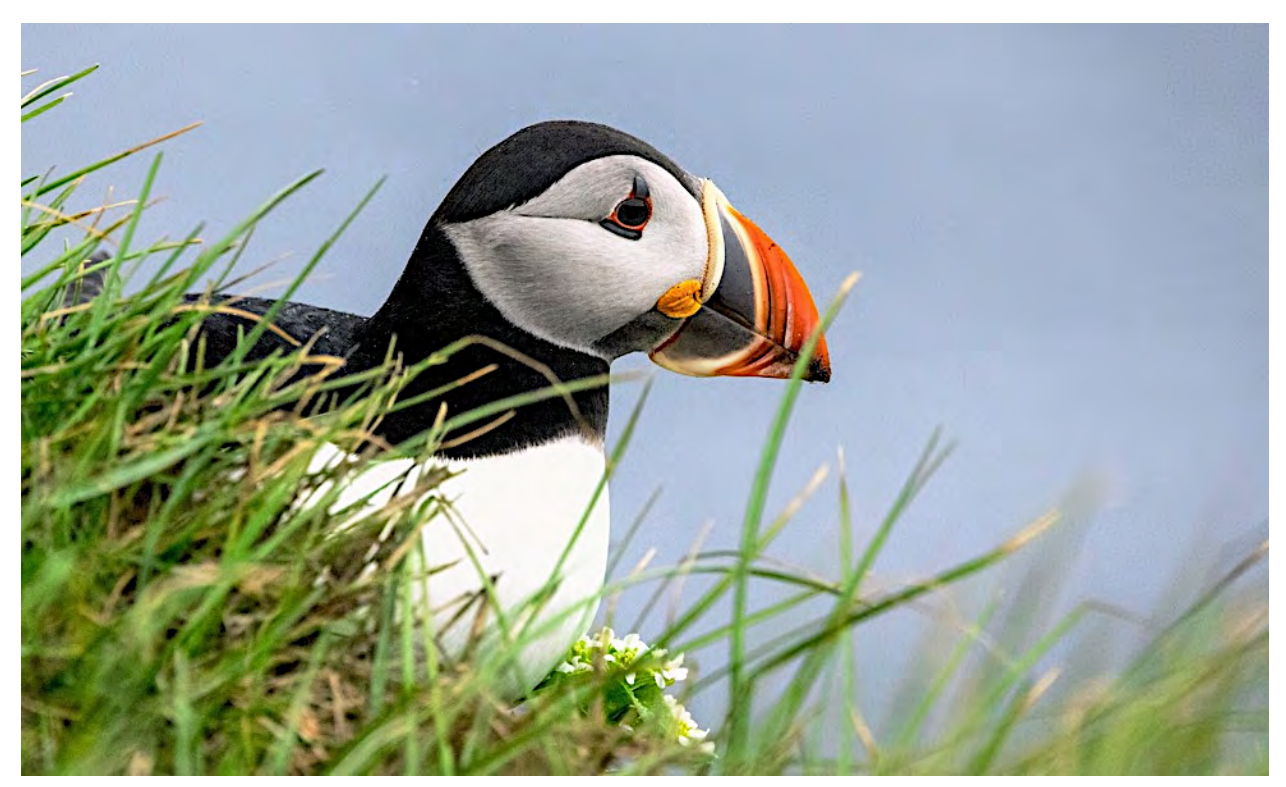
It's just not a trip to Iceland with out Atlantic Puffins! These charismatic little seabirds are always a favorite, and we should see them well at Latrabjarg.