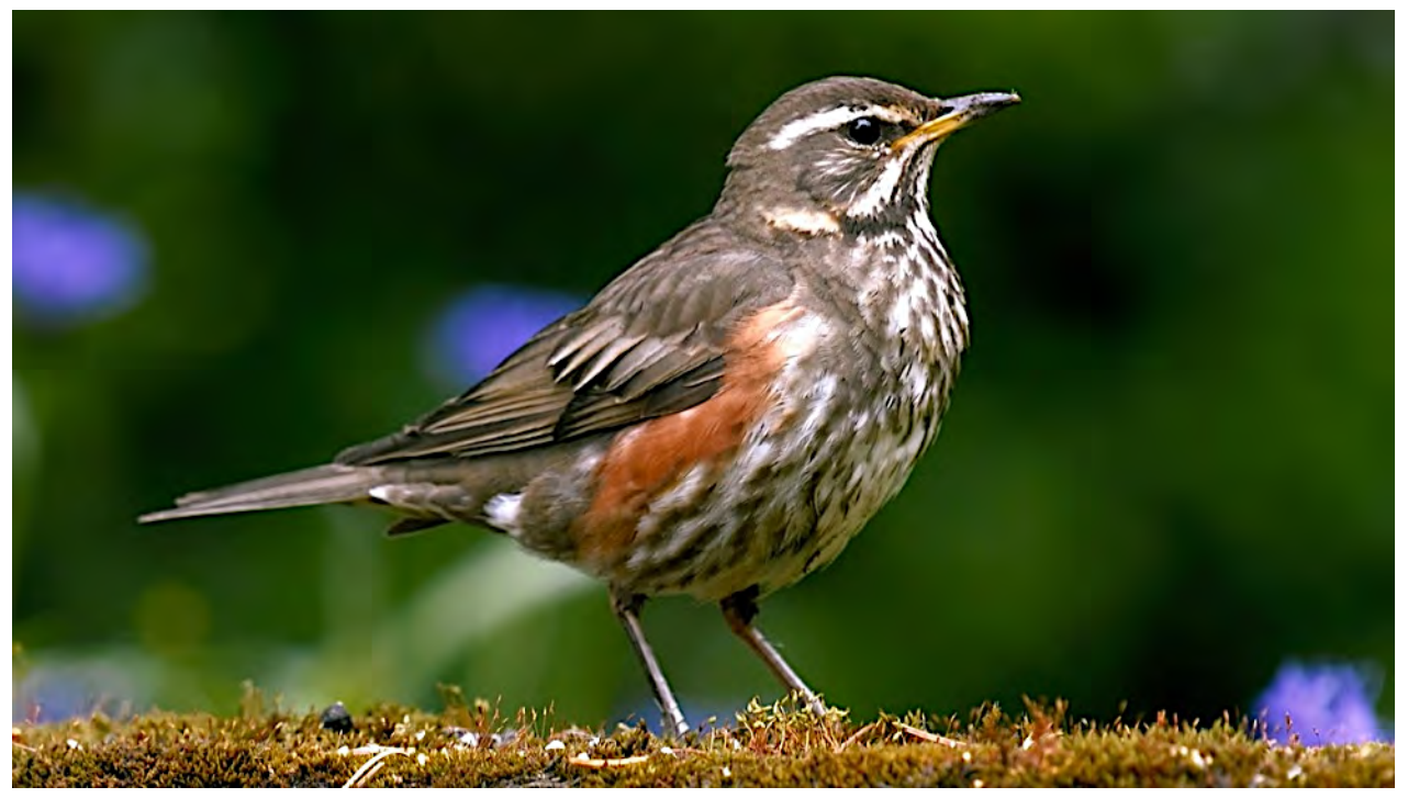
The Redwing is one of the few passerines that breed in Iceland. This subspecies differs from that of mainland Europe, and of the three thrushes found in Iceland, this is the most abundant.

We include here information for those interested in the 2025 Field Guides Iceland tour: