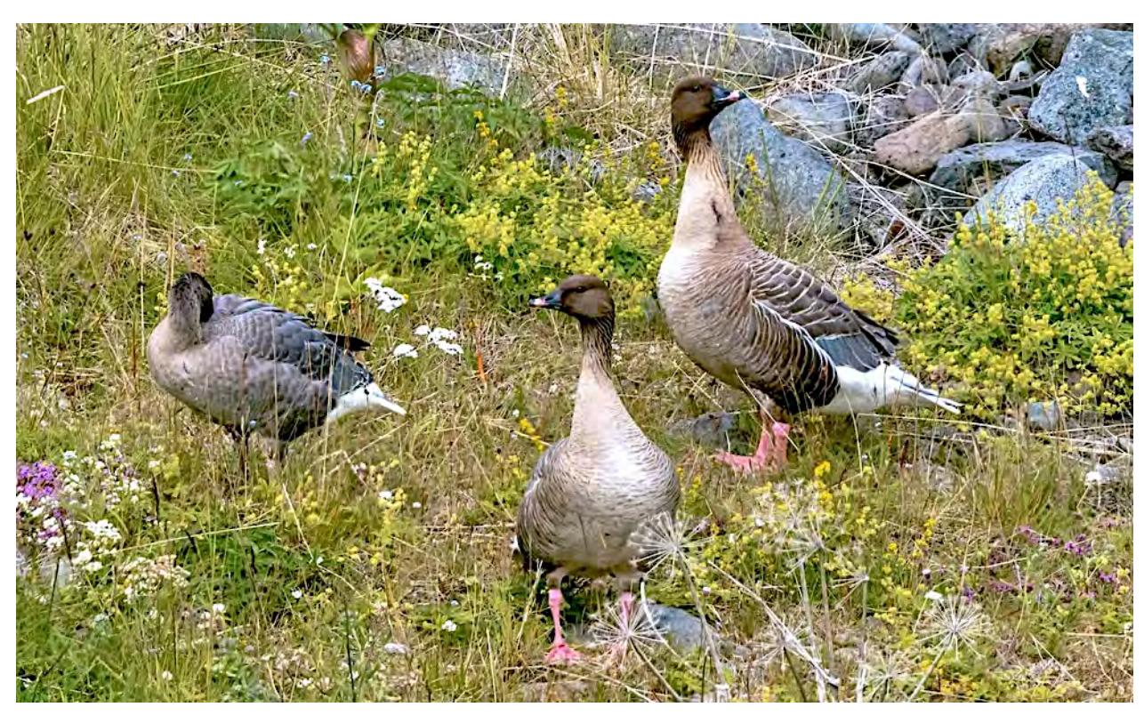
The Pink-footed Goose breeds in just a few places in the far north, including Iceland.

Day 4, Wed, 18 Jun. Lake Myvatn to Dettifoss. This morning will be dedicated to birding this waterfowl-rich area. Species we will target include: Tufted Duck, Barrow's Goldeneye, Eurasian Wigeon, Harlequin Duck, Red-throated Loon, and Horned Grebe. The concentration of waterbirds is the principal reason for visiting; furthermore, this area is our best chance to catch up to Gyrfalcon, which are few and far between. The rare Merlin and Short-eared Owl patrol the region as well. Red-necked Phalaropes are common here, and we will watch for Eurasian Wren and Meadow Pipit too. We'll search for Great Skua along the coast northeast of Husavik. Later in the afternoon, we'll find ourselves marveling at one of Europe's most powerful waterfalls: Dettifoss. Iceland's volcanic origin is on full display in this region. Night near Lake Myvatn.