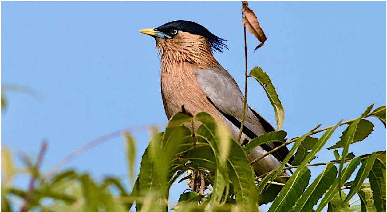
The handsome Brahminy Starling is locally common in some of the areas we will visit. We've seen them near Bharatpur and Ramnagar on previous tours.