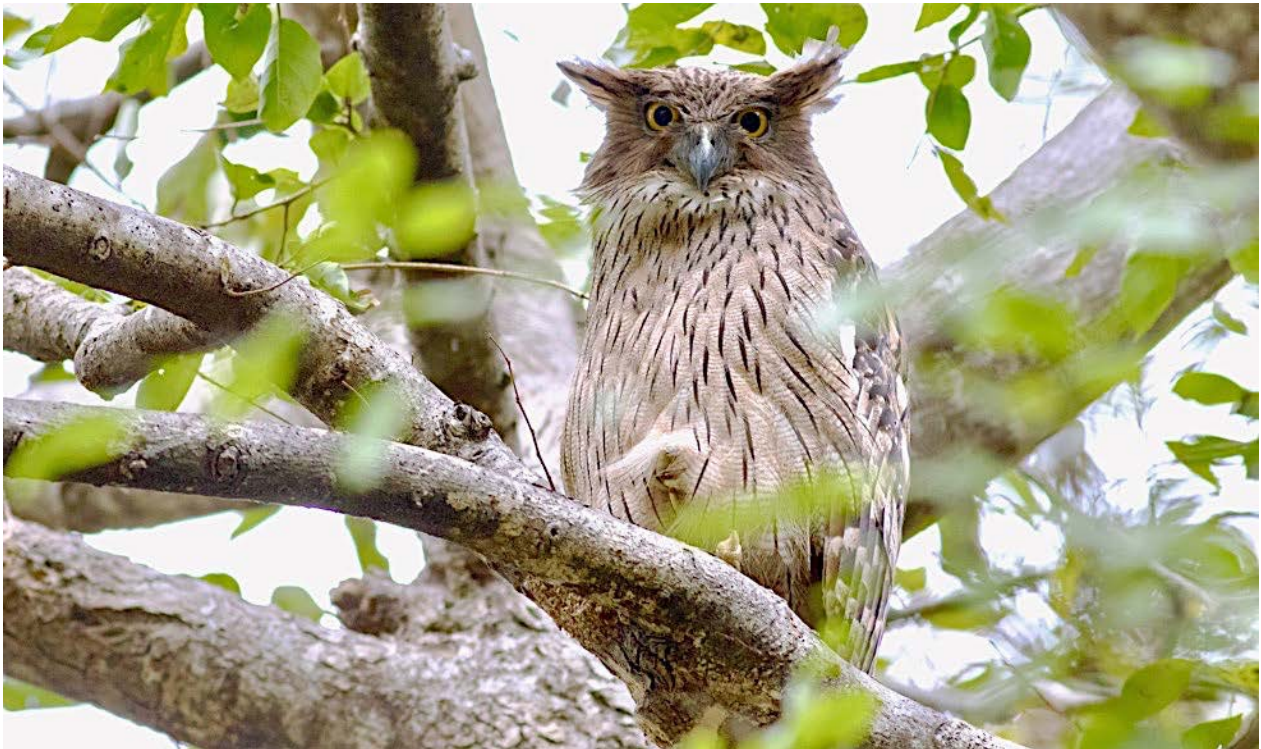
The imposing Brown Fish-Owl is wide-spread across India.

Day 12, Wed, 8 Feb. The Ramnagar-Kumeria area. Located outside the park where the problem of large predators is reduced and we have more freedom to walk, our hotel and the area around it is a prime birding area. We'll spend the day birding in the nearby forest and alongside the rushing Kosi River. Here we may find Orange-bellied Leafbird, Hair-crested Drongo and Scarlet Minivets in the canopy, while overhead we'll look for Crested Treeswifts and a good selection of raptors. The rocky watercourses hold some wonderful species, including Tawny Fish-Owl, Brown Dipper, jaunty Spotted and Little forktails, numerous White-capped and Plumbeous redstarts, and hopefully a wintering Wallcreeper somewhere among the boulders. Our first taste of mixed-species flocks may include White-throated Fantail, Yellow-bellied Fairy-Fantail, Pale-rumped Warbler and Velvet-fronted Nuthatch. If trees are fruiting, Slaty-headed and Red-breasted parakeets may be seen, and Blue Whistling-Thrush (normally a shy species) are numerous and tame here. Night at The Den.