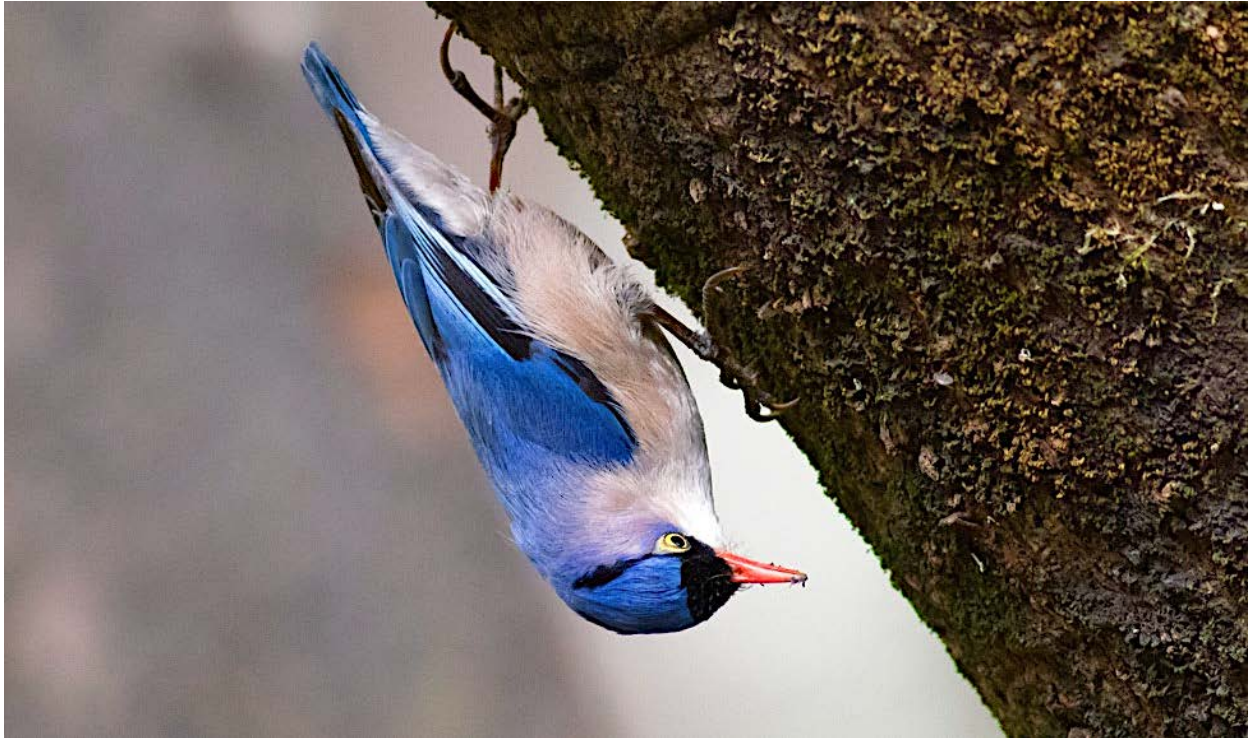
We'll visit the foothills of the Himalayas, where we'll find birds like this beautiful Velvet-fronted Nuthatch.

Agra is also our base for a day trip to the Chambal River, where we’ll travel by boat as we make our way from flocks of Indian Skimmers to pairs of Red-naped Ibis, with giant Gharials (long-nosed fish eating crocodiles) basking on the sand banks and Black-bellied Terns flitting by.