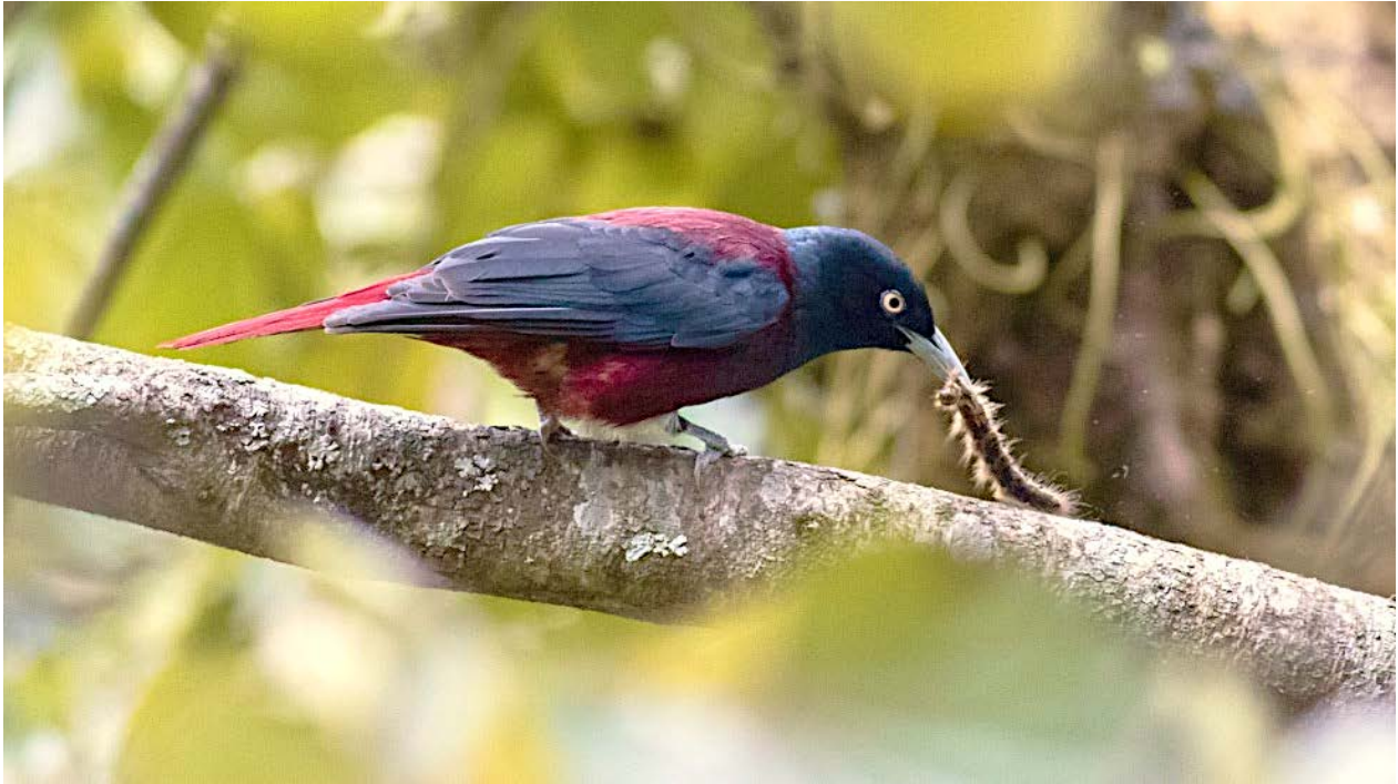
The uniquely colored Maroon Oriole is one of the birds we will seek in the Himalayan foothills near Nainital.

Day 15, Sat, 11 Feb. To Nainital. After breakfast we'll begin our drive to Nainital (in the Himalayan foothills), but first if still necessary, take time to stop at a well known site for Wallcreeper, and if we're really lucky, the magnificent Ibisbill. Later, as we ascend the rocky mountains, the vegetation will gradually change from dry, deciduous forest to light coniferous woodland interspersed with areas of ragged vertical bare rock. A new, fascinating, and diverse avifauna awaits us with likely first encounters including Blue-capped Redstart, Green-backed and Black-throated tits, Bar-tailed Treecreeper, and Rock Bunting. Night at Vikram Vintage Inn, Nainital.