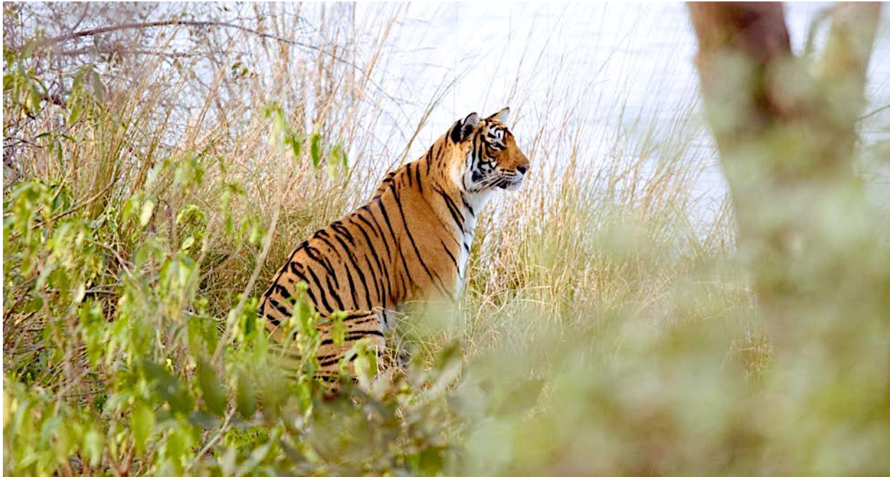
A Tiger sighting is always among the most anticipated experiences on this tour. Participant Linda Rudolph captured this image on our 2020 tour.

We include here information for those interested in the 2023 Field Guides Northern India tour: