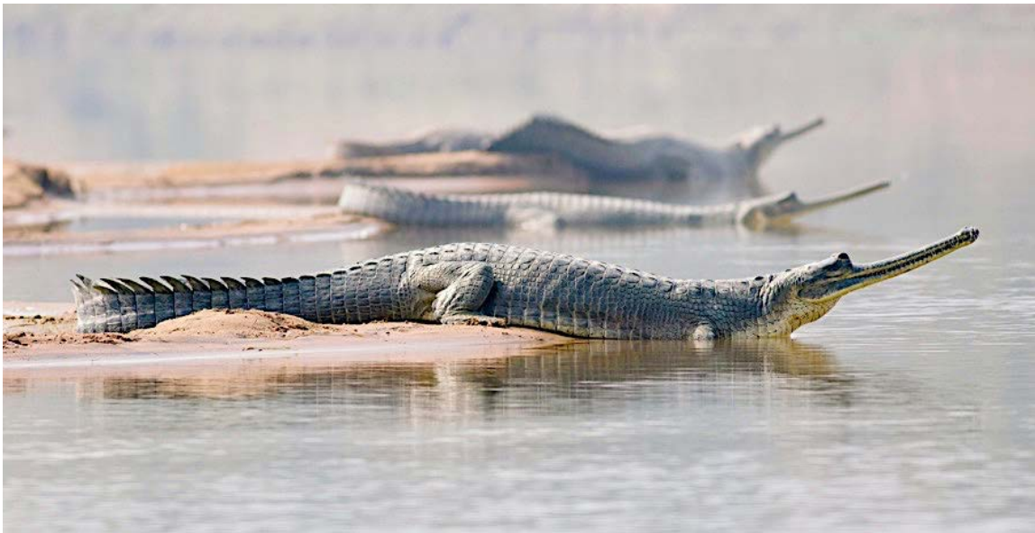
On a boat trip along the Chambal River, we'll have a chance to see Gharial, as well as some interesting waterbirds such as the rare Indian Skimmer.

Day 9, Sun, 5 Feb. The Chambal River. Today we'll travel for about two hours by bus to a little known area (but one which is fast becoming known to birders), the Chambal River. This is one of the most unpolluted rivers in northern India and will undoubtedly be our best chance to see the increasingly rare Indian Skimmer. During a two-hour boat trip the Skimmer will be our main target species, but we'll also see a whole array of other birds, perhaps including Lesser Whistling-Duck, Red-naped Ibis, Great Thick-knee, Black-bellied and River terns, and Sand Lark. It's also a good place for Gharial (a long-snouted fish-eating crocodile) and even the rare Ganges Dolphin. In the afternoon we'll return to Agra. Night at the Trident Hotel.