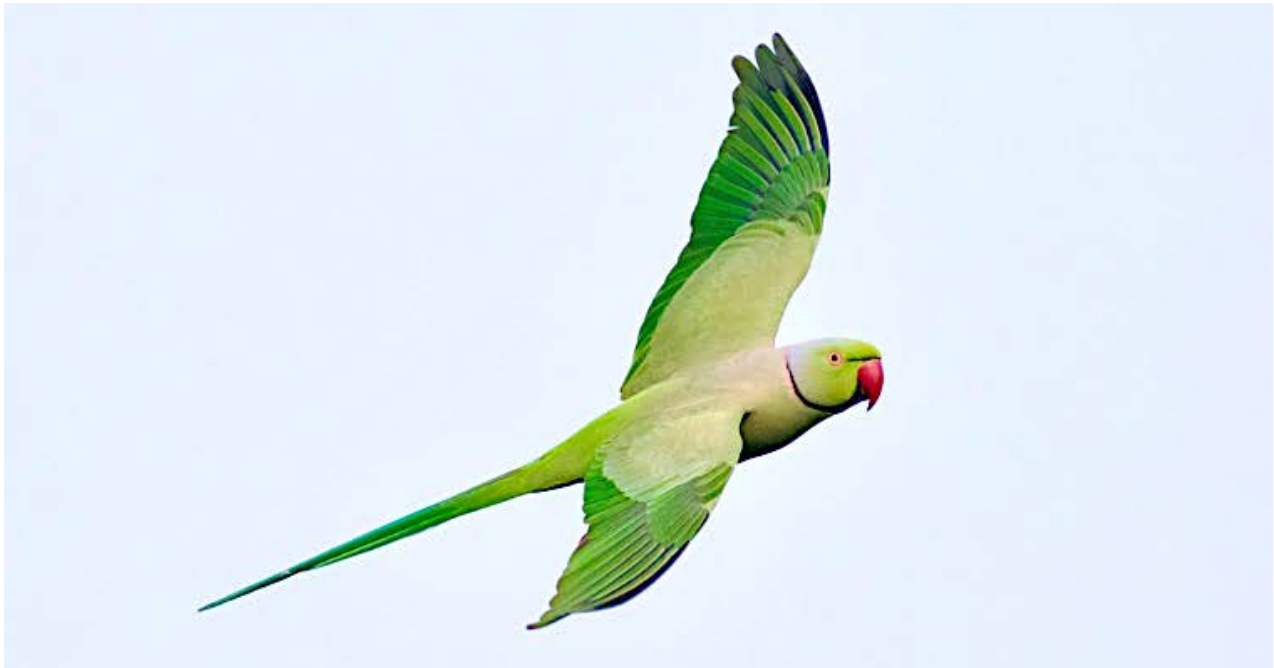
The Rose-ringed Parakeet is common across much of India.

If you are uncertain about whether this tour is a good match for your abilities, please don't hesitate to contact our office; if they cannot directly answer your queries, they will put you in touch with the guide.