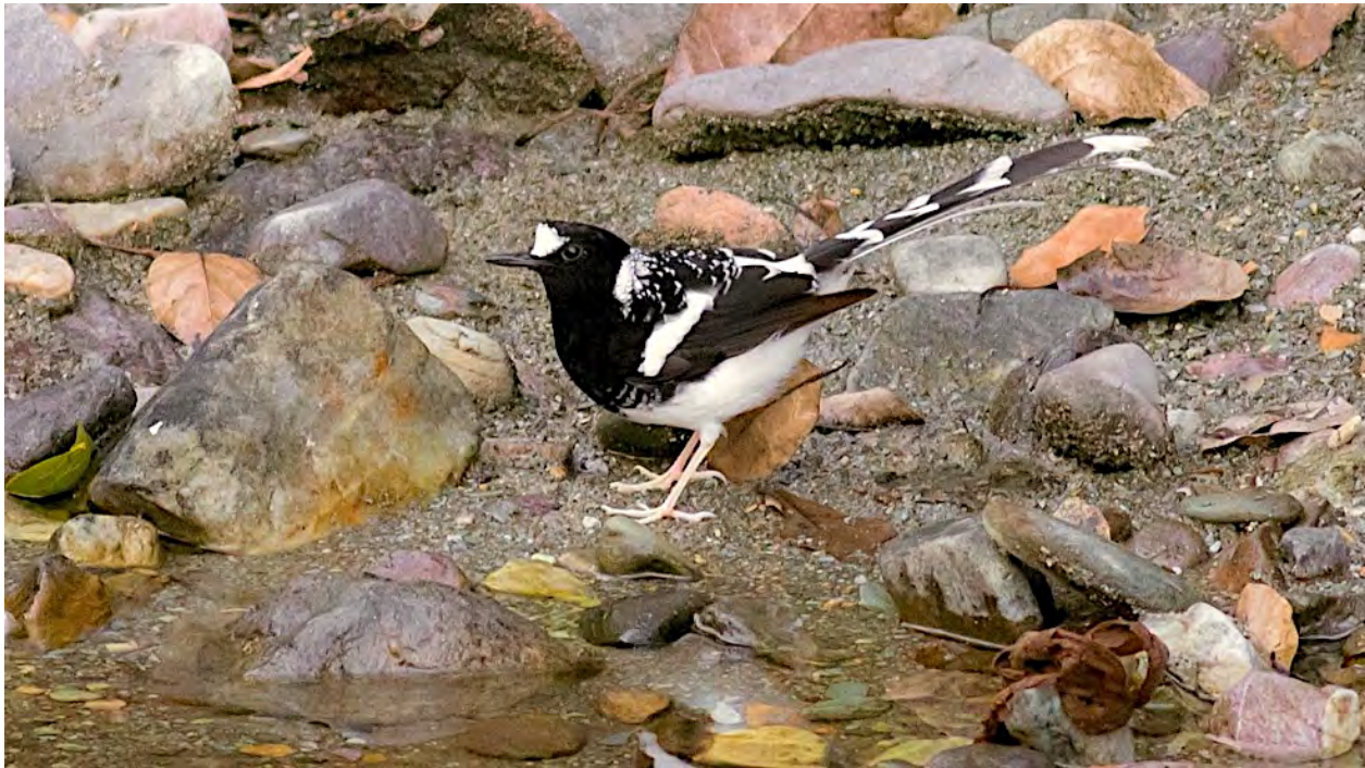
The beautiful Spotted Forktail is found along fast-moving streams in the higher elevations.

Day 12, Wed, 7 Feb. The Ramnagar-Kumeria area. Located outside the park, where the problem of large predators is reduced and we have more freedom to walk, our hotel and the area around it is a prime birding area. We'll spend the day birding in the nearby forest and alongside the rushing Kosi River. Here we may find Orange-bellied Leafbird, Hair-crested Drongo and Scarlet Minivets in the canopy, while overhead we'll look for Crested Treeswifts and a good selection of raptors. The rocky watercourses hold some wonderful species, including Tawny Fish-Owl, Brown Dipper, jaunty Spotted and Little forktails, numerous White-capped and Plumbeous redstarts, and hopefully a wintering Wallcreeper somewhere among the boulders. Our first taste of mixed-species flocks may include White-throated Fantail, Yellow-bellied Fairy-Fantail, Pale-rumped Warbler and Velvet-fronted Nuthatch. If trees are fruiting, Slaty-headed and Red-breasted parakeets may be seen, and Blue Whistling-Thrush (normally a shy species) are numerous and tame here. Night at The Den.