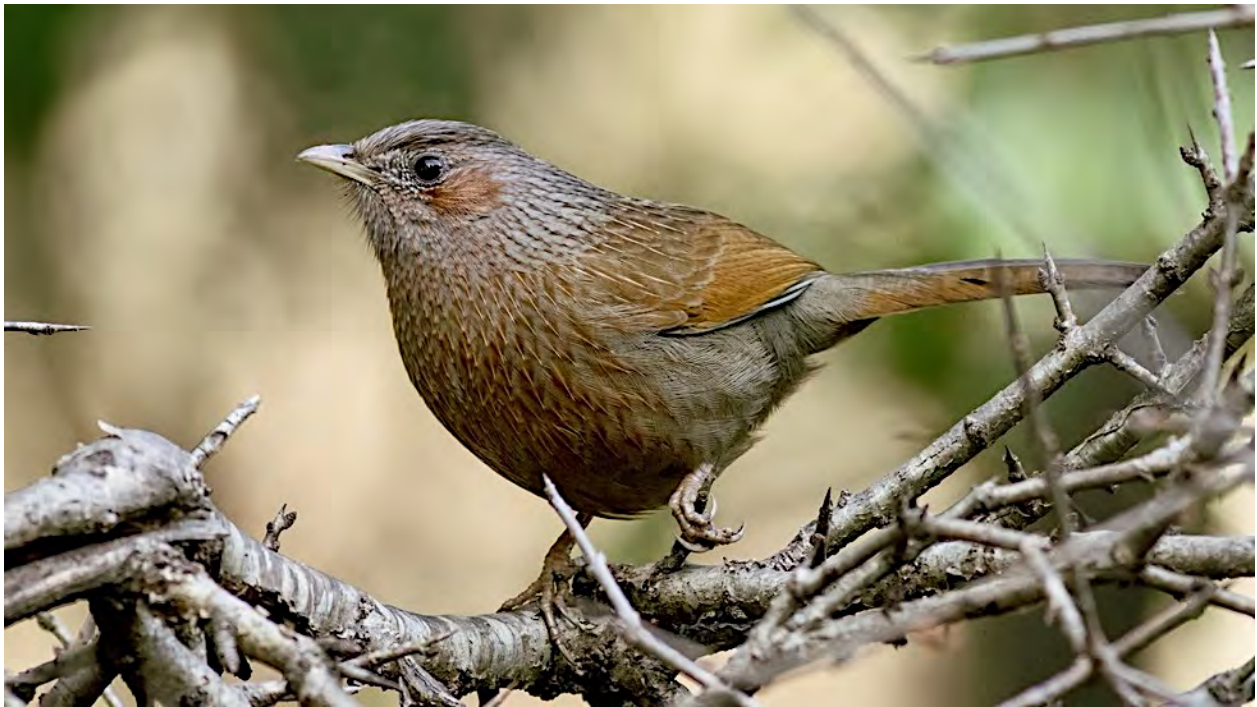
The Streaked Laughingthrush is a bird of the higher elevations that we'll seek in the foothills of the Himalayas.

Day 15, Sat, 10 Feb. To Nainital. After breakfast we'll begin our drive to Nainital (in the Himalayan foothills), but first if still necessary, take time to stop at a well-known site for Wallcreeper, and if we're really lucky, the magnificent Ibisbill. Later, as we ascend the rocky mountains, the vegetation will gradually change from dry, deciduous forest to light coniferous woodland interspersed with areas of ragged vertical bare rock. A new, fascinating, and diverse avifauna awaits us with likely first encounters including Blue-capped Redstart, Green-backed and Black-throated tits, Bar-tailed Treecreeper, and Rock Bunting. Night at Vikram Vintage Inn, Nainital.