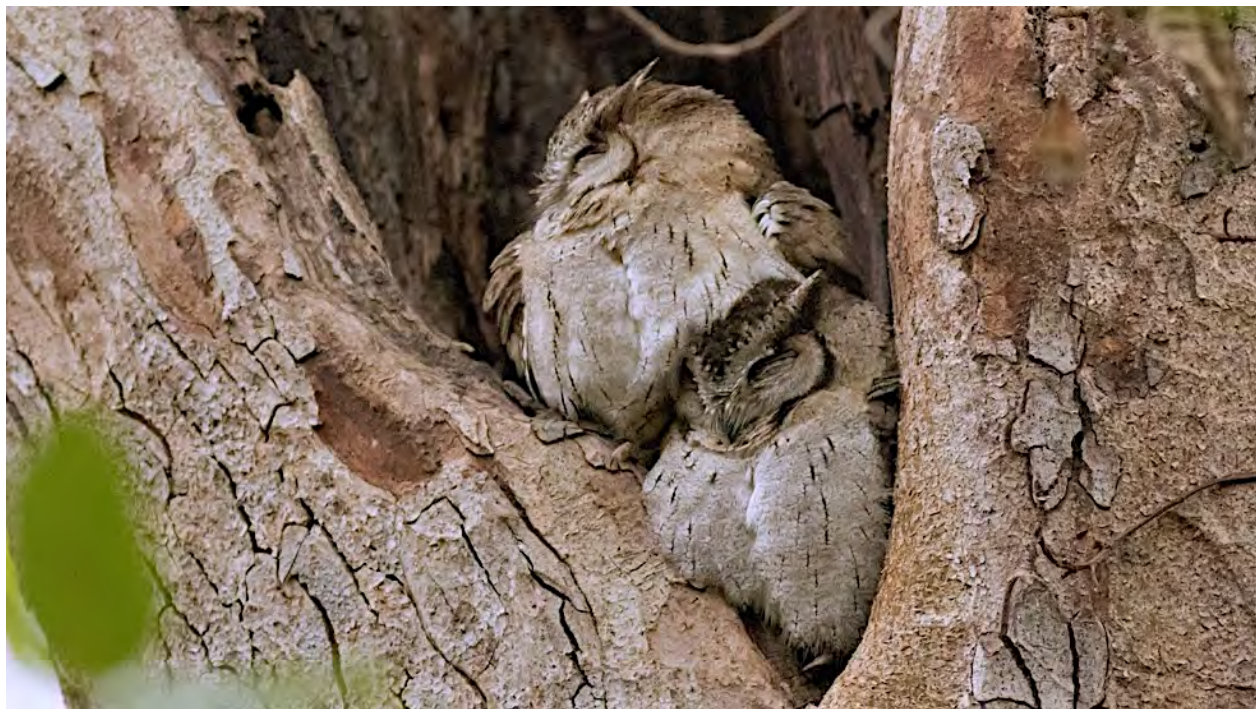
Indian Scops-Owl is one of several owl species we'll watch for when we visit Bharatpur.

After lunch in Agra we'll drive about 1½ hours towards Bharatpur and stop at the abandoned red sandstone city of Fatehpur Sikri. Formerly the residence of Akbar the Great, the palaces and other adjoining buildings are quite simply magnificent. Egyptian Vultures, Dusky Crag-Martins and Indian Chats also find the buildings to their liking, helping to ensure that our visit to this mysterious place is not purely cultural. We'll then make another short drive and our base for the next two nights just a few kilometers from the Keoladeo National Park. Night at Kadamb Kunj, Bharatpur.