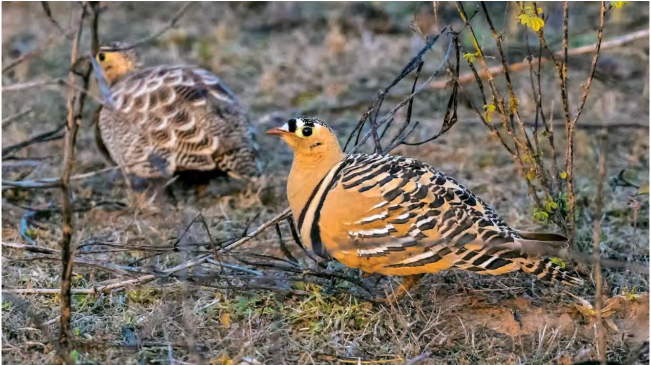
Painted Sandgrouse are found across much of India; we'll look for them at Ranthambore, where this lovely pair was seen in 2023.

Our final stop in Rajasthan is Ranthambore, one of the best places in all India to see that most magnificent of wild creatures—the Tiger! Against a backdrop of the rugged Vindhya Hills, the setting itself is superb, enhanced by a rich variety of mammals and birds that include such specialties as Painted Spurfowl, Painted Sandgrouse, and the critically endangered Indian Vulture, as well as many more widespread species, including the amazing albeit familiar Indian Peafowl. Tiger remains our principal quarry here, although with so elusive and heavily persecuted an animal there can never be any guarantees. Should we strike lucky, then few reserves are more appropriate to seeing the world's most dramatic carnivore than wonderful Ranthambore.