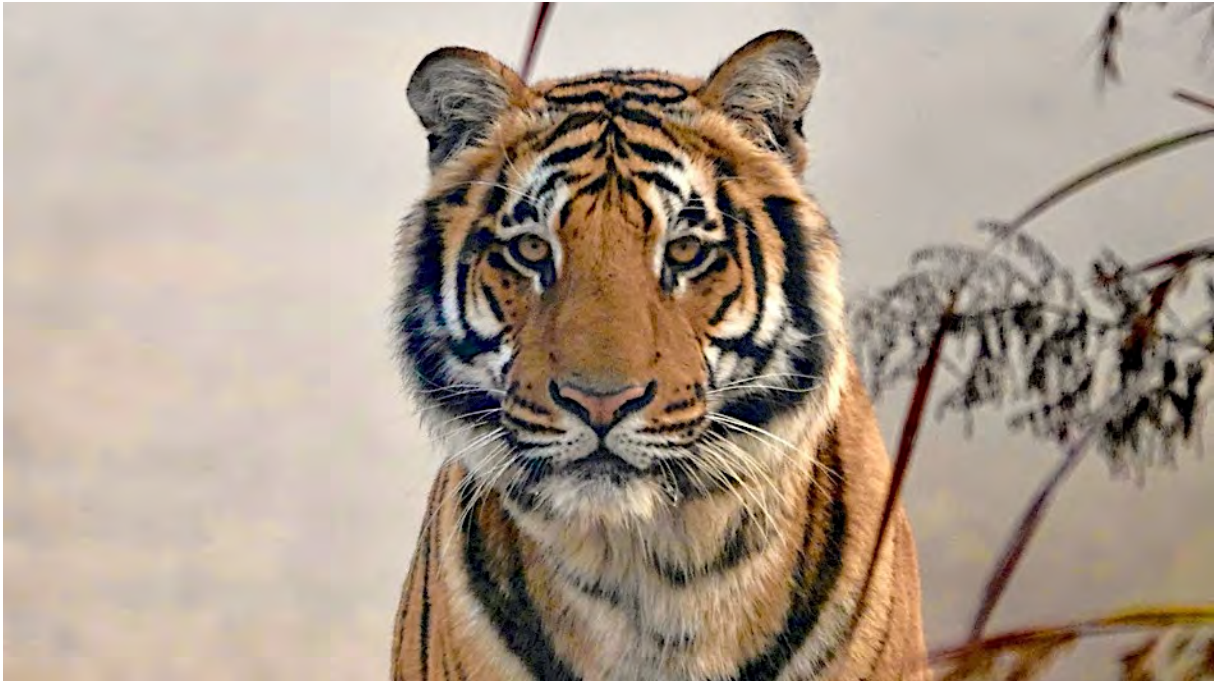
A highlight of this tour is the opportunity to see Tigers in the wild. This impressive beast showed well for our group on a foggy morning in Corbett National Park.

If you are uncertain about whether this tour is a good match for your abilities, please don't hesitate to contact our office; if they cannot directly answer your queries, they will put you in touch with the guide.