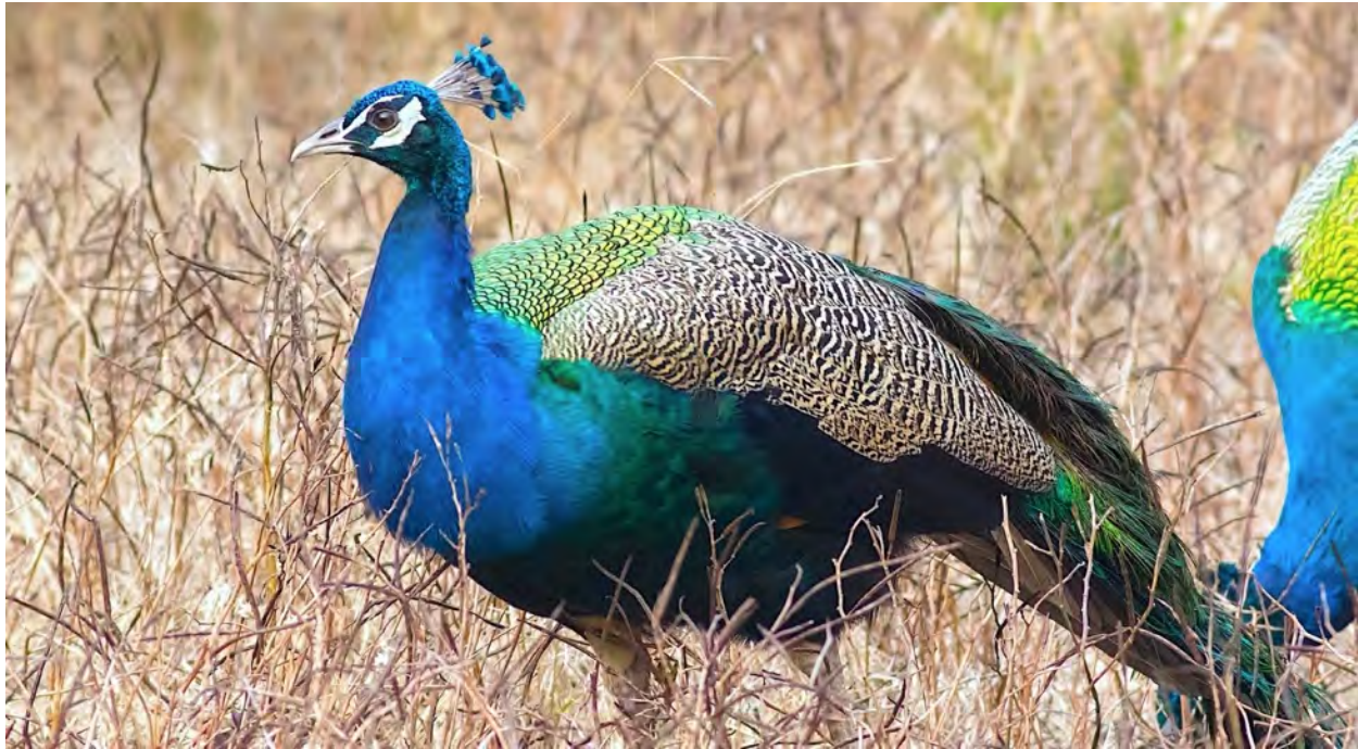
The majestic Indian Peafowl is a common bird in zoos and collections, but we will have a chance to see these beautiful birds in their native habitat.

We include here information for those interested in the 2024 Field Guides Northern India tour: