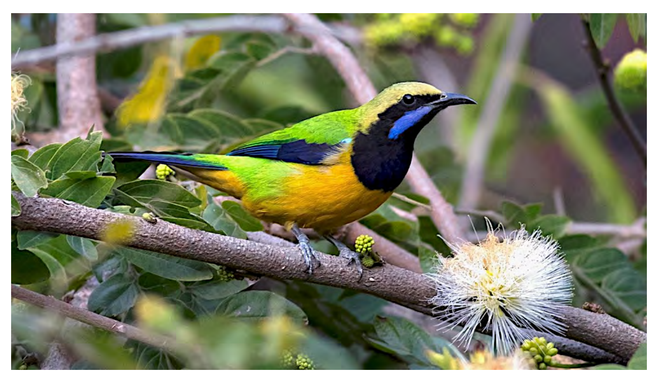
Orange-bellied Leafbird is a canopy-dweller that can be difficult to see, as they blend in well with the leaves. We have gotten good views of these colorful songsters on past tours.

Day 12, Thu, 12 Feb. The Ramnagar-Kumeria area. Located outside the park, where the problem of large predators is reduced and we have more freedom to walk, our hotel and the area around it is a prime birding area. We'll spend the day birding in the nearby forest and alongside the rushing Kosi River. Here we may find Orange-bellied Leafbird, Hair-crested Drongo and Scarlet Minivets in the canopy, while overhead we'll look for Crested Treeswifts and a good selection of raptors. The rocky watercourses hold some wonderful species, including Tawny Fish-Owl, Brown Dipper, jaunty Spotted and Little forktails, numerous White-capped and Plumbeous redstarts, and hopefully a wintering Wallcreeper somewhere among the boulders. Our first taste of mixed-species flocks may include White-throated Fantail, Yellow-bellied Fairy-Fantail, Pale-rumped Warbler and Velvet-fronted Nuthatch. If trees are fruiting, Slaty-headed and Red-breasted parakeets may be seen, and Blue Whistling-Thrush (normally a shy species) are numerous and tame here. Night at The Den.