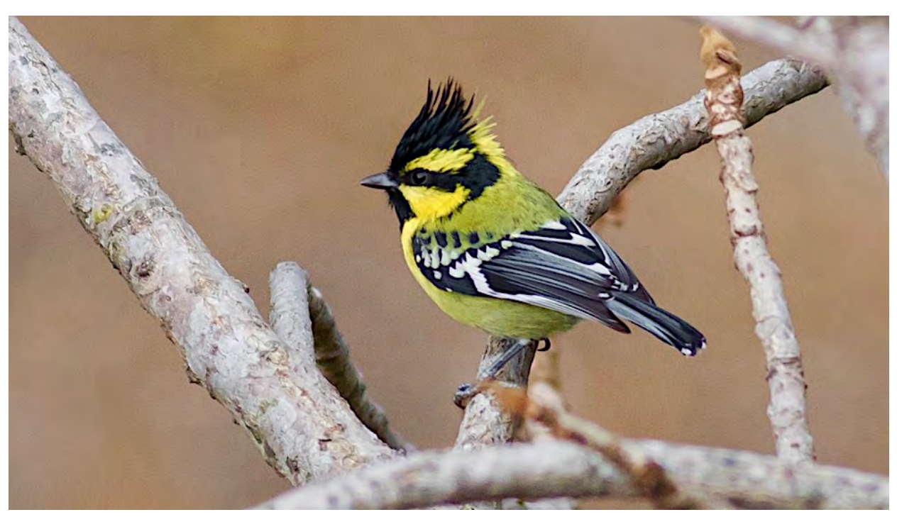
In the foothills of the Himalayas, we'll watch for a number of species restricted to the higher elevations, such as the beautiful Himalayan Black-lored Tit.

Day 15, Sun, 15 Feb. To Nainital. After breakfast we'll begin our drive to Nainital (in the Himalayan foothills), but first if still necessary, take time to stop at a well-known site for Wallcreeper, and if we're really lucky, the magnificent Ibisbill. Later, as we ascend the rocky mountains, the vegetation will gradually change from dry, deciduous forest to light coniferous woodland interspersed with areas of ragged vertical bare rock. A new, fascinating, and diverse avifauna awaits us with likely first encounters including Blue-capped Redstart, Green-backed and Black-throated tits, Bar-tailed Treecreeper, and Rock Bunting. Night at Vikram Vintage Inn, Nainital.