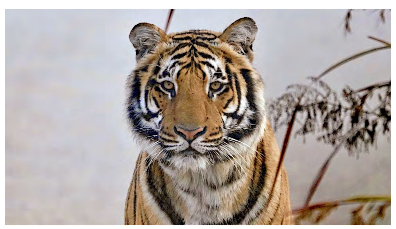
We have enjoyed wonderful encounters with Tiger when we've visited Ranthambhore.