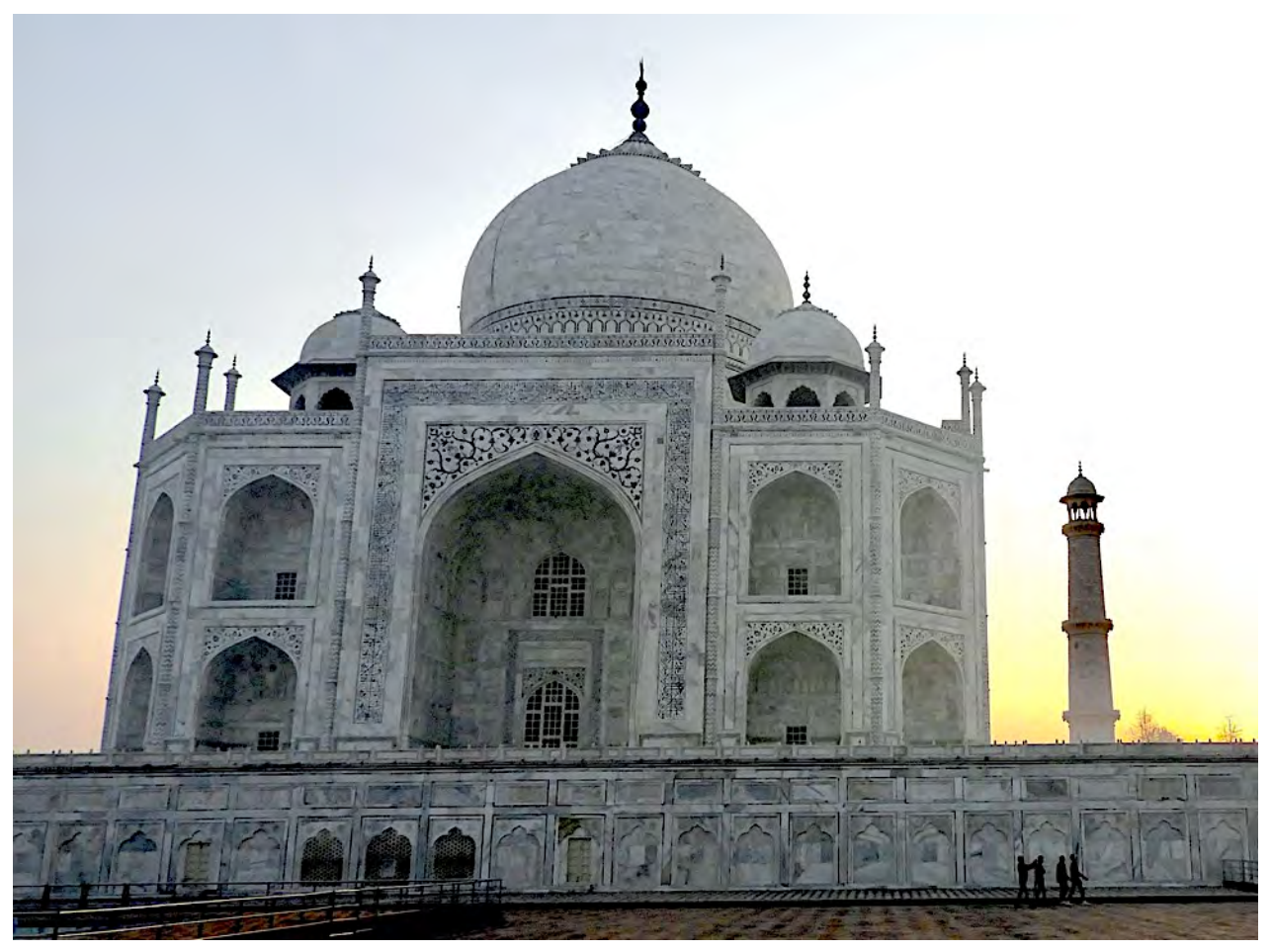
We'll visit the amazing Taj Mahal and other landmarks in Agra during a two-night stay. While there, we'll have a chance to go to the Chambal River where we'll find Indian Skimmers.

From Bharatpur we'll then take a short drive to Agra, and make an excursion to a place more sublime than Bharatpur itself—that most ethereal of India's monuments, the majestic Taj Mahal. During a two-night stay in Agra we'll visit the Taj Mahal and also a couple of India's other magnificent monuments—including the Agra Fort and the palaces of Akbar the Great at Fatehpur Sikri. Agra is also our base for a day trip to the Chambal River, where we'll travel by boat as we make our way from flocks of Indian Skimmers to pairs of Red-naped Ibis, with giant Gharials (long-nosed fish-eating crocodiles) basking on the sand banks and Black-bellied Terns flitting by.