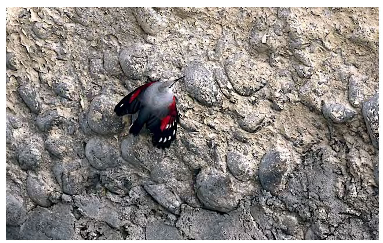
The Wallcreeper is a beautiful species found in high elevation rocky habitats across southern Europe and Central Asia. We've seen them near Ramnagar.

After Corbett, we will ascend through the foothills, birding as we go. One of the highlights along our route to Nainital will be a stop at a regular wintering site for the elusive and beautiful Wallcreeper - and with luck perhaps a wintering lbisbill.