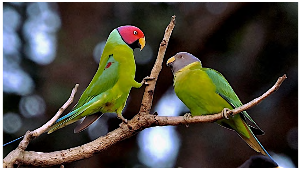
The Plum-headed Parakeet is endemic to the Indian subcontinent. We've seen them well at Ranthambore and other parks.

We include here information for those interested in the 2026 Field Guides Northern India tour: