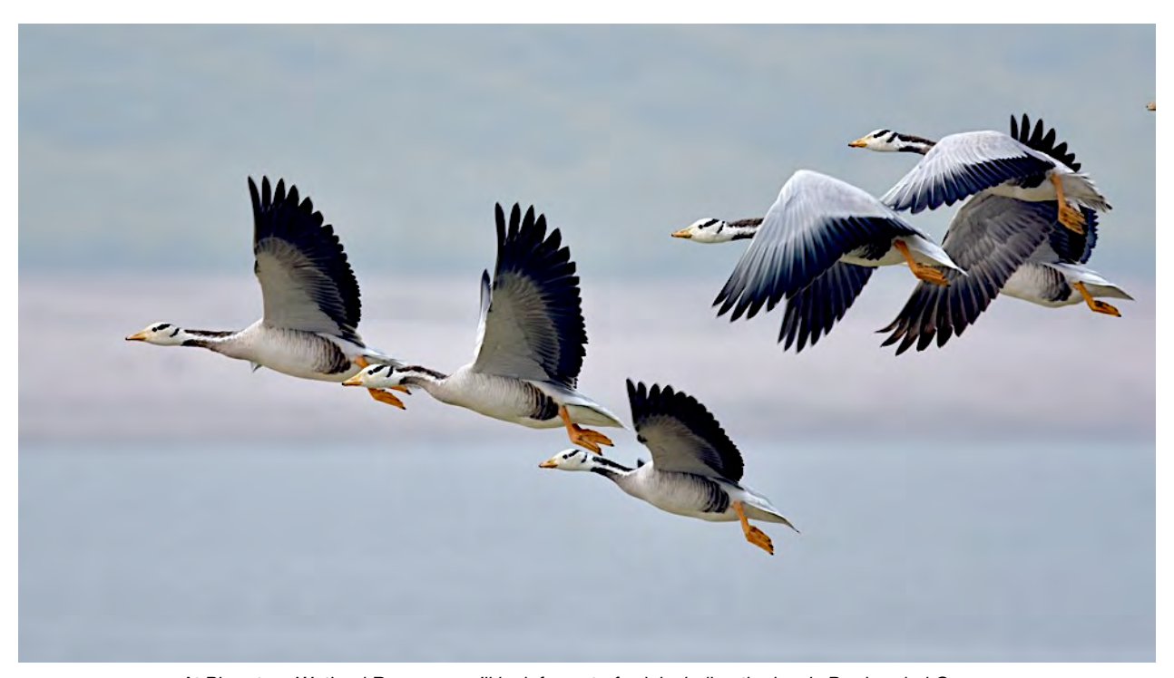
At Bharatpur Wetland Reserve, we'll look for waterfowl, including the lovely Bar-headed Goose.

With no large predators to worry about (either inside or outside the reserve), we'll be free to wander at will, enjoying our birding on foot; the tree-lined walkways are the wintering haunts of Hume's Warbler, Blyth's Reed-Warbler, Lesser Whitethroat, Bluethroat, and the occasional Siberian Rubythroat. Uniquely, we'll also travel by battery-powered rickshaw, which not only lets us travel further afield, but allows the sharp-eyed and knowledgeable rickshaw drivers to show us roosting owls – perhaps Dusky Eagle-Owl, Spotted Owlet, and Indian Scops-Owl, or nightjars. In dry years the rickshaws also allow access to the arid fields beyond the wetlands, which can be excellent for Yellow-wattled Lapwing and the elusive Indian Courser. No matter what conditions we encounter, Bharatpur is always a wonderful place for birds, and whether we're watching migrant raptors crossing the skies, or searching the woodlands for resident species such as Indian Gray Hornbill, Coppersmith and Brown-headed barbets, Common Woodshrike and Brahminy Starling, there will be plenty to enjoy here. Nights at Kadamb Kunj, Bharatpur.