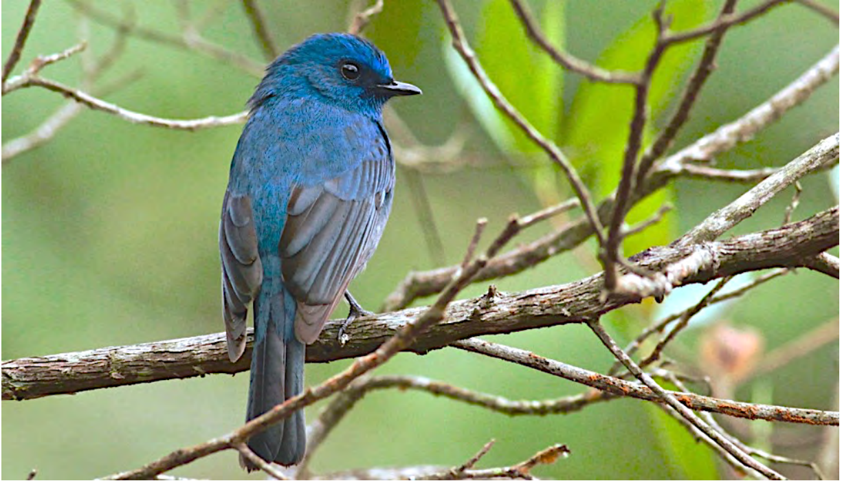
The beautiful Nilgiri Flycatcher is endemic to the Western Ghats region, where they have a restricted range, but are common within the higher elevations.

We'll begin our journey in the low country at Bangalore and visit the famous Nagarhole National Park, where endemic Malabar Parakeets and White-cheeked Barbets call from our lodge grounds, and Indian Elephants and Gaur inhabit the forests and lakeshore. We'll then continue to the Nilgiri and Anamalai mountains, visiting a variety of forests where most of the endemic birds survive—Malabar Barbet and White-bellied Treepie often give themselves away with their loud and distinctive calls, Malabar Trogon is a real treat, but so are Gray Junglefowl (far more beautiful than its name suggests), White-bellied Blue-Flycatcher, and Crimson-backed Sunbird. In the undergrowth we'll search for the rare Wynaad Laughingthrush and the secretive White-bellied and Nilgiri sholakilis; the middle levels are better for Gray-headed Bulbul, Nilgiri Flycatcher, and Indian Scimitar-Babbler, while overhead the loud swoosh of wings at any time may signal Great or Malabar Pied hornbills.