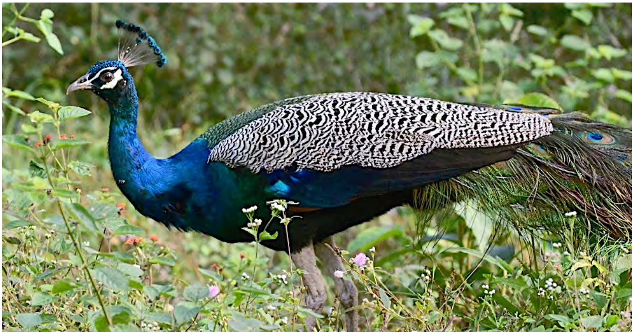
Indian Peafowl might be seen in several places on the tour, including Nagarhole and Munnar.

After local birding we'll drive back to Ooty and spend the night at Taj Savoy Hotel, where the first buildings were originally constructed in 1829. It became a hotel in 1841 and since then has been refurbished many times. We should enjoy our night in this historic hotel, full of character and a little bit of simple old-fashioned luxury. Ooty is 2200 meters above sea level. Night at Taj Savoy Hotel.