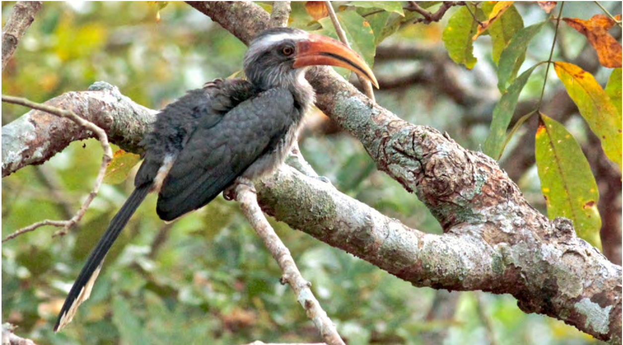
The Malabar Gray Hornbill is another Indian endemic, found in the wet forests of the Western Ghats.

Day 12, Thu, 10 Nov. To Periyar. Once again we'll drive south today, this time heading for Thekkady, a small tourist town at the edge of the Periyar Tiger Sanctuary. We'll stop along the way to look for the very localized Yellow-throated Bulbul and hopefully Blue-faced Malkoha, which inhabit a wooded escarpment here. Then, on arrival in Thekkady, the guide will have to spend some time making arrangements with the park authorities for our permits, which we'll need for the following days. During this break, those who like shopping may wish to spend a couple of hours checking out the numerous handicraft shops that are found here. Alternatively, you may wish to watch for Loten's Sunbird, which frequently occur in the grounds of our hotel. Night at Spice Village; a lovely arrangement of thatched cottages within attractive walled grounds.