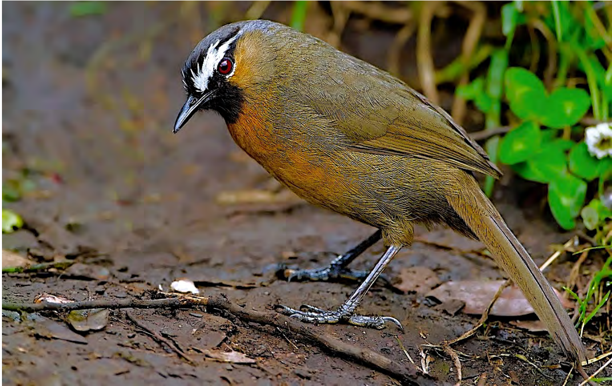
One of the endemics we'll seek is the attractive Nilgiri Laughingthrush. These endangered birds have an extremely restricted range in the Nilgiri Hills near Ooty.

We include here information for those interested in the 2022 Field Guides Southern India: Western Ghats Endemics tour: