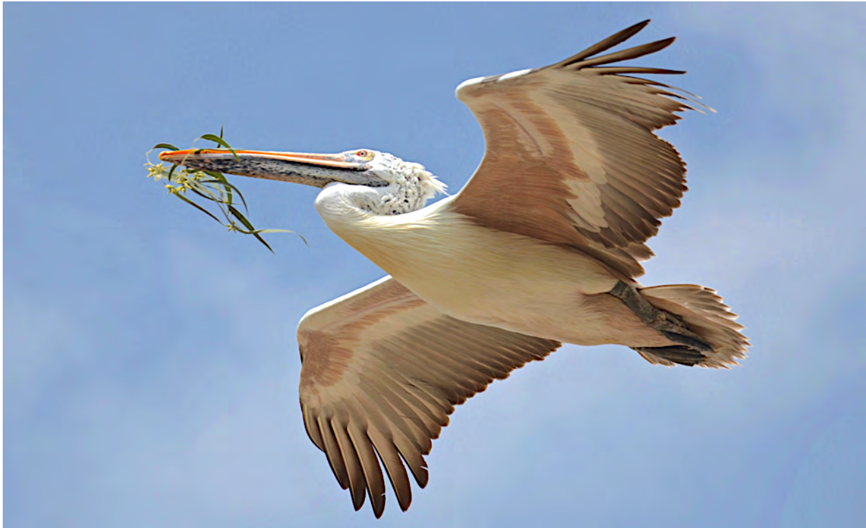
On our way to Mysore, we'll watch for nesting Spot-billed Pelicans near a small village. This species is declining, but the colony at Kokkare Bellur is doing better than most.

If you are uncertain about whether this tour is a good match for your abilities, please don't hesitate to contact our office; if they cannot directly answer your queries, they will put you in touch with your guide for the tour.