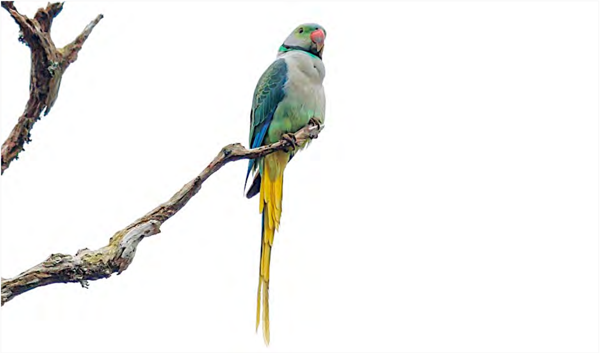
The beautiful Malabar Parakeet is an endemic of the Western Ghats. We've seen good numbers of them on the tour in recent years.

We'll begin our journey in the low country at Bangalore and visit the famous Nagarhole National Park, where endemic Malabar Parakeets and White-cheeked Barbets call from our lodge grounds, and Indian Elephants and Gaur inhabit the forests and lakeshore. We'll then continue to the Nilgiri and Anamalai mountains, visiting a variety of forests where most of the endemic birds survive—Malabar Barbet and White-bellied Treepie often give themselves away with their loud and distinctive calls, Malabar Trogon is a real treat, but so are Gray Junglefowl (far more beautiful than its name suggests), White-bellied Blue-Flycatcher, and Crimson-backed Sunbird. In the undergrowth we'll search for the rare Wayanad Laughingthrush and the secretive White-bellied and Nilgiri sholakilis; the middle levels are better for Gray-headed Bulbul, Nilgiri Flycatcher, and Indian Scimitar-Babbler, while overhead the loud swoosh of wings at any time may signal Great or Malabar Pied hornbills.