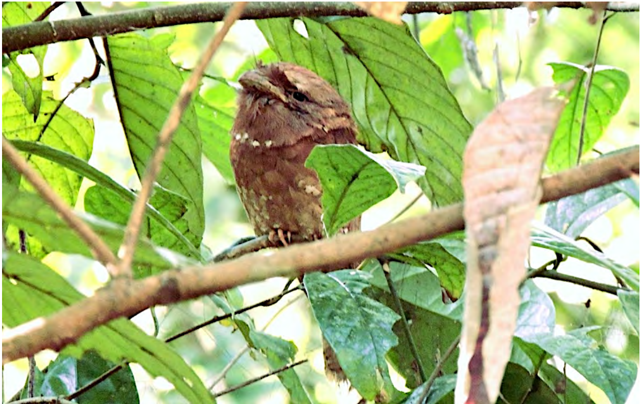
Among the night-birds we will look for is the Sri Lanka Frogmouth. These birds are found in Sri Lanka and the Western Ghats, and we've seen them well on this tour.