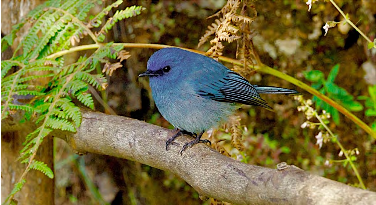
The Nilgiri Flycatcher is one of several small, blue flycatchers we'll watch for.

Day 10, Wed, 20 Nov. To Munnar. It's a very long drive today as we head south to yet another mountain block. Our destination this afternoon is Munnar, a picturesque hill station town surrounded by tea estates. In the late afternoon we'll bird at a small remnant patch of forest (locally known as a 'shola') where we might see Gray-headed Canary-Flycatcher, Indian Yellow Tit, Tickell's Leaf-Warbler, and Palani (Kerala) Laughingthrush. Night at Tea County, a modern, clean, and very efficient hotel situated at 1600 meters overlooking the town.