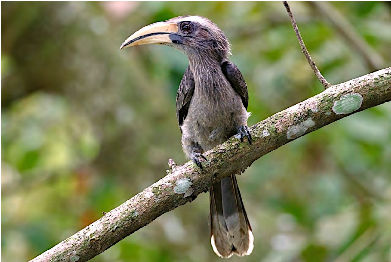
Malabar Gray Hornbill is another endemic of the Western Ghats region that we'll seek.

The moister woodlands here are home to another great selection of birds, and we'll be making a special excursion to look for the very localized Gray-headed Bulbul and a host of other species including Crested Serpent-Eagle, Crested Hawk-Eagle, Brown Fish-Owl (sometimes right in the lodge grounds), Indian Swiftlet, Crested Treeswift, Malabar Gray Hornbill, Blue-bearded Bee-eater, Brown-capped Pygmy and Streak-throated woodpeckers, Black-headed Cuckooshrike, Malabar Whistling-Thrush, Indian Blue Robin, Verditer Flycatcher, Indian Paradise-Flycatcher, Puff-throated Babbler, and Nilgiri Flowerpecker. Night at Bamboo Banks.