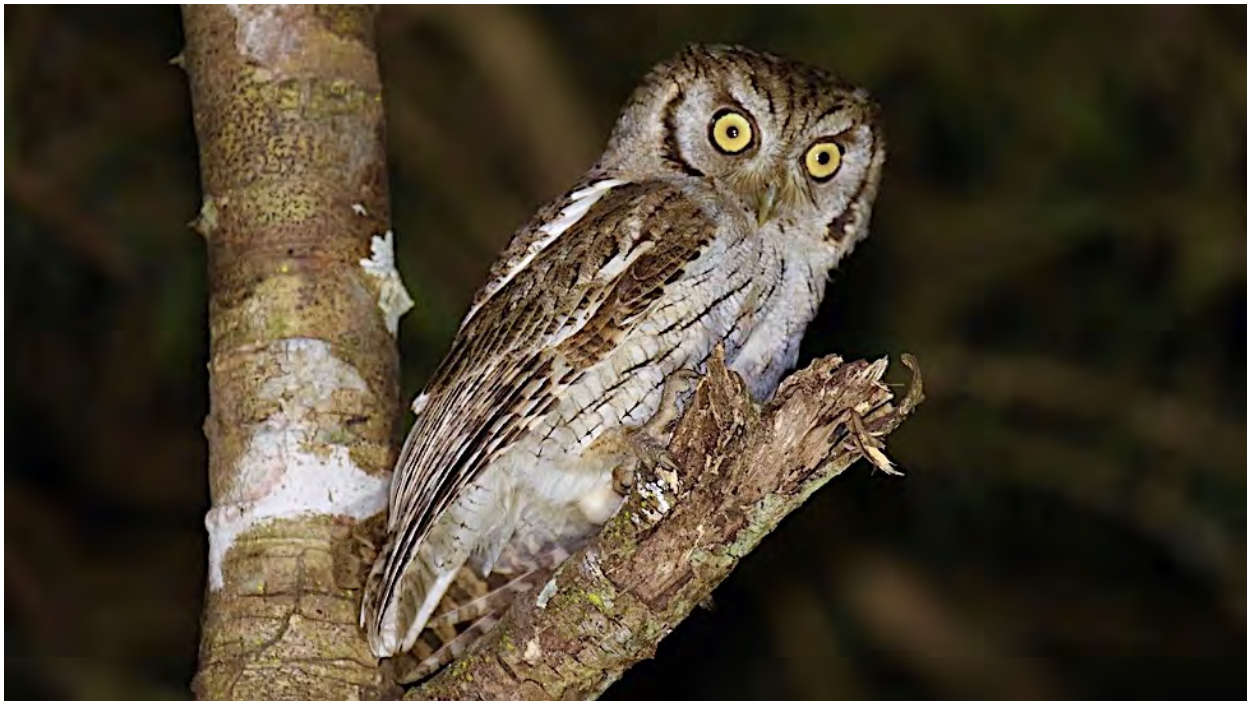
We'll have time to do some owling in search of nightbirds such as this Tropical Screech-Owl.

Days 8-9, Sat-Sun, 16-17 Jul. or 23-24 Jul. Porto Jofre. Exactly how we spend these two days will be determined by our luck in spotting a Jaguar, but in general we can expect to have breakfast pre-dawn and then head out by boat for the morning, returning for a late lunch followed by a siesta. Late-afternoon excursions may be by boat or by birding along the road at one of the many great locations close to our lodge. One way or another, we're bound to see a wide variety of birds, ranging from the noisy Hyacinth Macaw and Toco Toucan to the remarkable Red-billed Scythebill and Gray-crested Cacholote. Our boat outings are also sure to produce a nice variety of birds that may include Pied Lapwing, Large-billed and Yellow-billed terns, Rufous-tailed Jacamar, Blue-crowned Trogon, and Cream-colored Woodpecker. Nights at Porto Jofre.