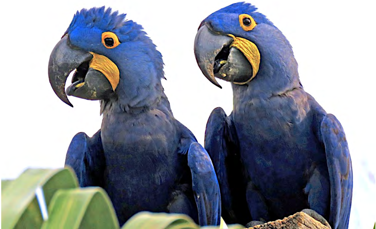
Hyacinth Macaws are the "poster birds" of the Pantanal. We'll get some great views of these magnificent parrots on this tour.