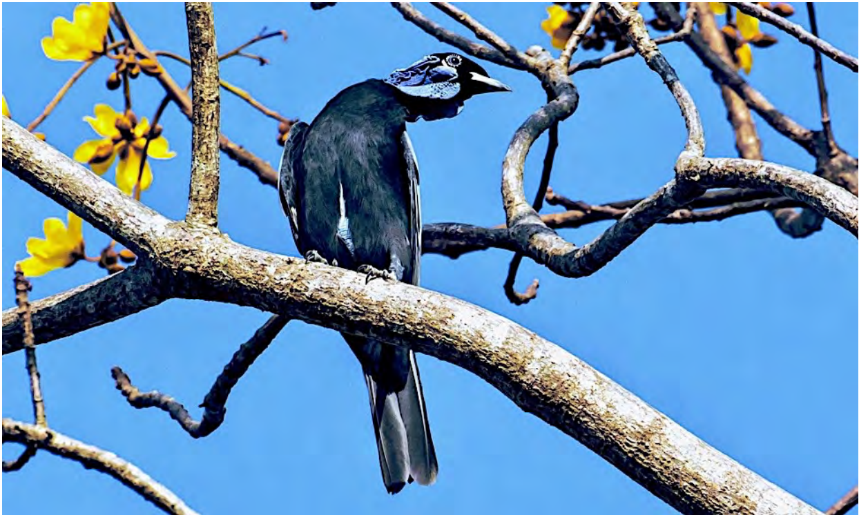
A number of interesting cotingas, including the Bare-necked Fruitcrow, might be found around the Garden of the Amazon.

Days 3-5, Mon-Wed, 11-13 Jul. or 18-20 Jul. Garden of the Amazon. With plenty of time to enjoy the birding here, we'll make our way along the trails as we search for a number of Amazonian specialties including Black-girdled Barbet, Tooth-billed Wren, Gould's Toucanet, Black-tailed, Collared, and Green-backed trogons, the stunning Red-necked Woodpecker, and perhaps even a Rufous-capped Nunlet. We'll listen for mixed-species flocks that may reveal a wealth of birds such as Paradise, Yellow-rumped, and Turquoise tanagers, and understory species that may include Spix's Warbling-Antbird, Cinereous Antshrike, and Elegant Woodcreeper. As we explore the mostly level terrain, we will also keep an eye out for displaying Red-headed, Snow-capped, and Flame-crested manakins, while watching, too, for an antswarm that may yield Black-spotted Bare-eye, White-backed Fire-eye, and Scale-backed Antbird. Exploring the beautiful Rio Claro will also prove to be a delightful experience, as we search for the legendary Cone-billed Tanager, Amazonian Umbrellabird, Pompadour Cotinga, or perhaps a Great Potoo sitting along the river at night. Birding right around the lodge may well produce some friendly Brown Jacamars, a gorgeous Long-billed Starthroat, the minute Short-tailed Pygmy-Tyrant, or the equally small Reddish Hermit. Nights at Garden of the Amazon.