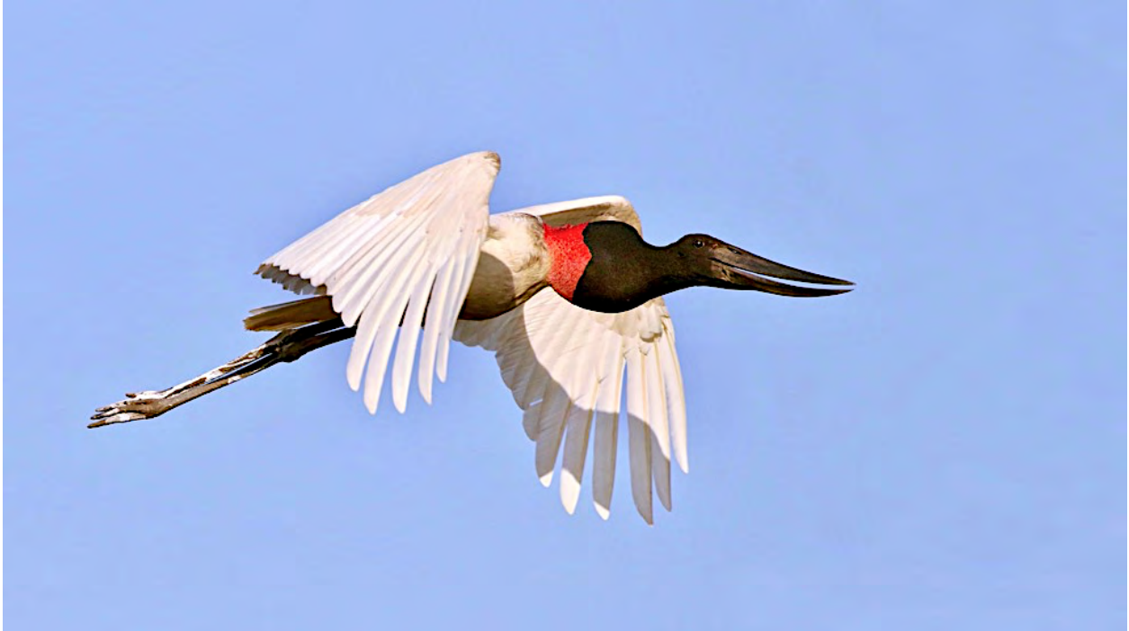
In the Pantanal, we'll see large waders like Jabiru, Wood Stork, Roseate Spoonbill and many others.

the Pantanal, and as the human pressure has significantly decreased in certain areas, we've had more frequent encounters with this great cat, and we finally feel that we can put together a tour that offers a good chance of seeing Jaguar.