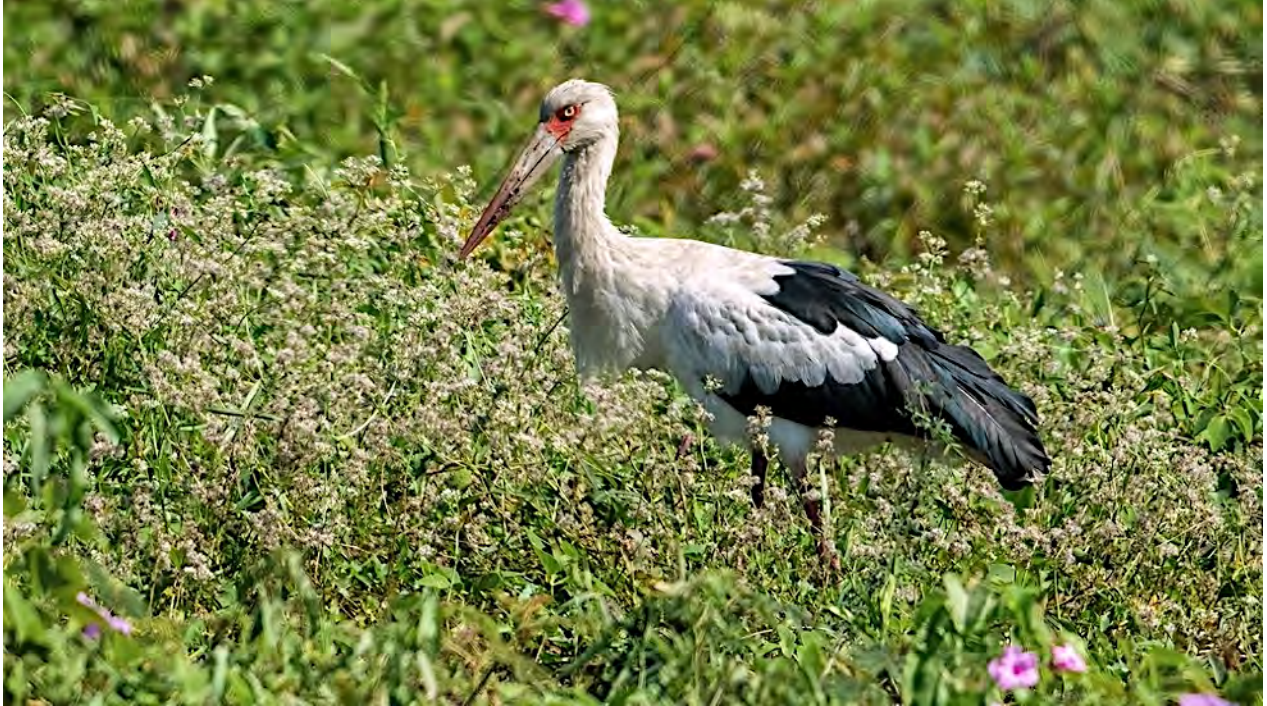
In the Pantanal, we'll see large waders like this Maguari Stork, plus Jabiru, Roseate Spoonbill and many others.

the Pantanal, and as the human pressure has significantly decreased in certain areas, we've had more frequent encounters with this great cat, and we finally feel that we can put together a tour that offers a good chance of seeing Jaguar.