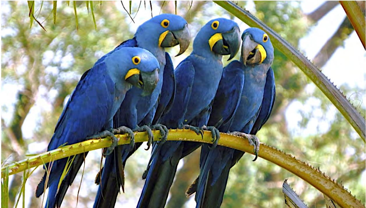
Hyacinth Macaws are the "poster birds" of the Pantanal. We'll get some great views of these magnificent parrots on this tour.