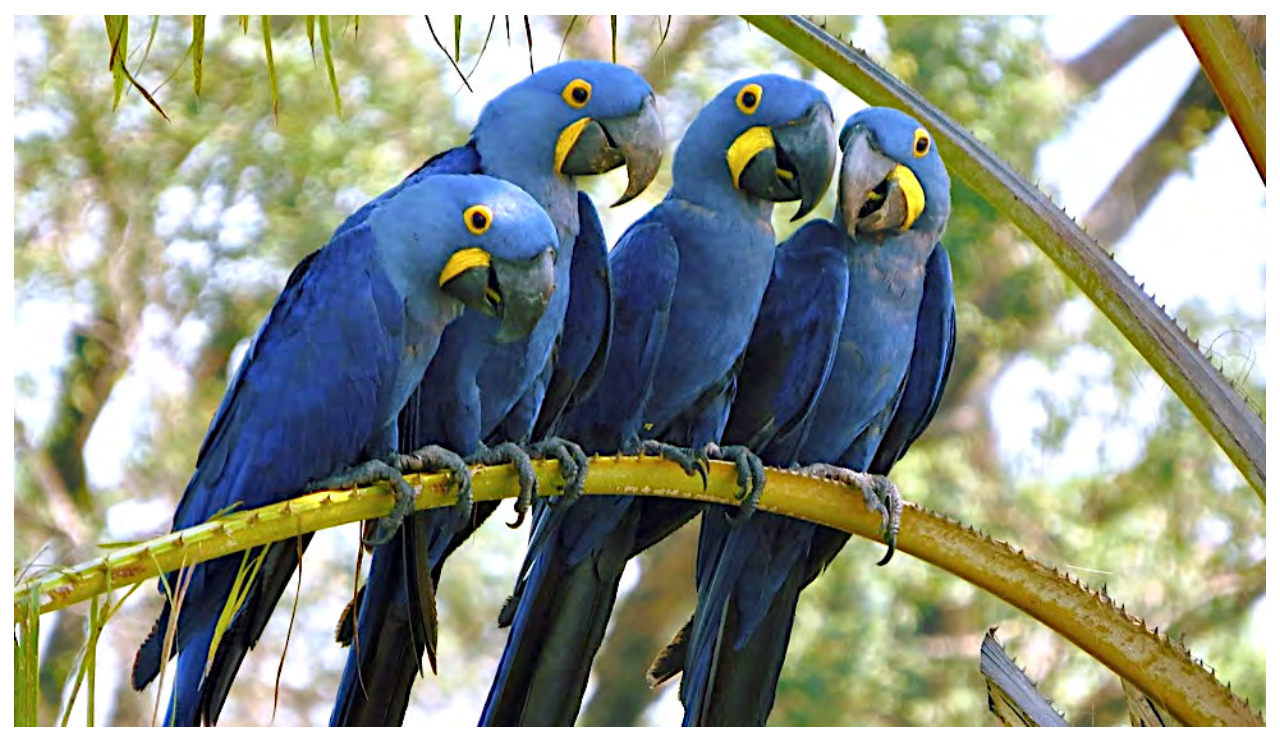
Hyacinth Macaws are the "poster birds" of the Pantanal. We'll get some great views of these magnificent parrots on this tour.

hummingbirds, Spot-backed Puffbird, White-wedged Piculet, White and Pale-crested woodpeckers, Campo Flicker, Chotoy, Cinereous-breasted, White-lored, and Rusty-backed spinetails, Gray-crested Cacholote, Narrow-billed, Planalto, and Great Rufous woodcreepers, Red-billed Scythebill, Planalto Slaty-Antshrike, Rusty-backed Antwren, Mato Grosso Antbird, Campo Suiriri Flycatcher, Ashy-headed Greenlet, Red-crested and Yellow-billed cardinals, White-bellied and Rusty-collared seedeaters, and Unicolored and Scarlet-headed blackbirds (catch your breath)...and the hot, humid Pantanal will certainly be the highlight of the trip!