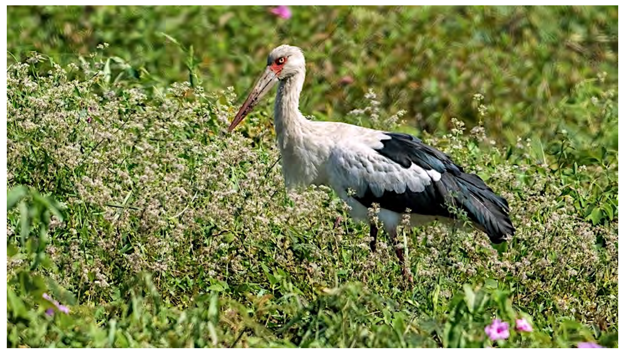
In the Pantanal, we'll see large waders like this Maguari Stork, plus Jabiru, Roseate Spoonbill and many others.

Our tour will begin north of the Pantanal at Garden of the Amazon, a delightful little family-run lodge that sits at the ecotone between the Cerrado and Amazon. There we'll search for the ultra-rare and only recently rediscovered Conebilled Tanager (yes, we have its address!) as well as a great variety of Amazonian specialties such as Gould's Toucanet, Black-girdled Barbet, Blue-cheeked Jacamar, Tooth-billed Wren, six species of manakins, and much more! We will reach the Pantanal just as water levels are receding and hundreds of Jabirus, Wood Storks, Limpkins, Roseate Spoonbills and thousands of other waders, Paraguayan Caiman ('gators), and Capybaras congregate around the shrinking ponds—and the few remaining bodies of water become popular hangouts for Jaguars stalking their prey. We will keep our eyes peeled for these massive cats on quiet, relaxing boat trips packed with kingfishers, curassows, Agami Herons, Sungrebes, and Sunbitterns, and we'll take walks through the forest to see everything from Hyacinth Macaws to woodcreepers, antbirds, and spinetails. On drives along the Transpantaneira park road, which we will cover from beginning to end, we'll have the birding time of our lives as we immerse ourselves in one of the richest places for wildlife on Earth.