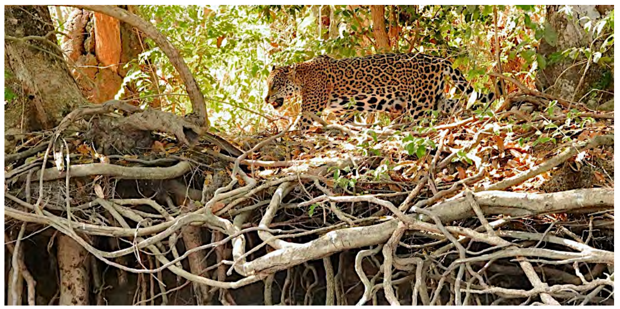
We have had wonderful luck finding Jaguars, and having extraordinary views of them. While we're searching for these elusive big cats, we'll also see some amazing birds, such as Jabirus, Hyacinth Macaws, and Sungrebes.

I. July 6 - 17, 2024 II. July 20 - 31, 2024