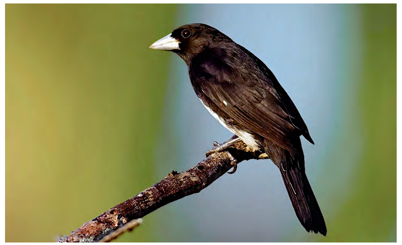
We'll look for the endangered Cone-billed Tanager at the Garden of the Amazon.

be a delightful experience, as we search for the legendary Cone-billed Tanager, Amazonian Umbrellabird, Pompadour Cotinga, or perhaps a Great Potoo sitting along the river at night. Birding right around the lodge may well produce some friendly Brown Jacamars, a gorgeous Long-billed Starthroat, the minute Short-tailed Pygmy-Tyrant, or the equally small Reddish Hermit. Nights at Garden of the Amazon.