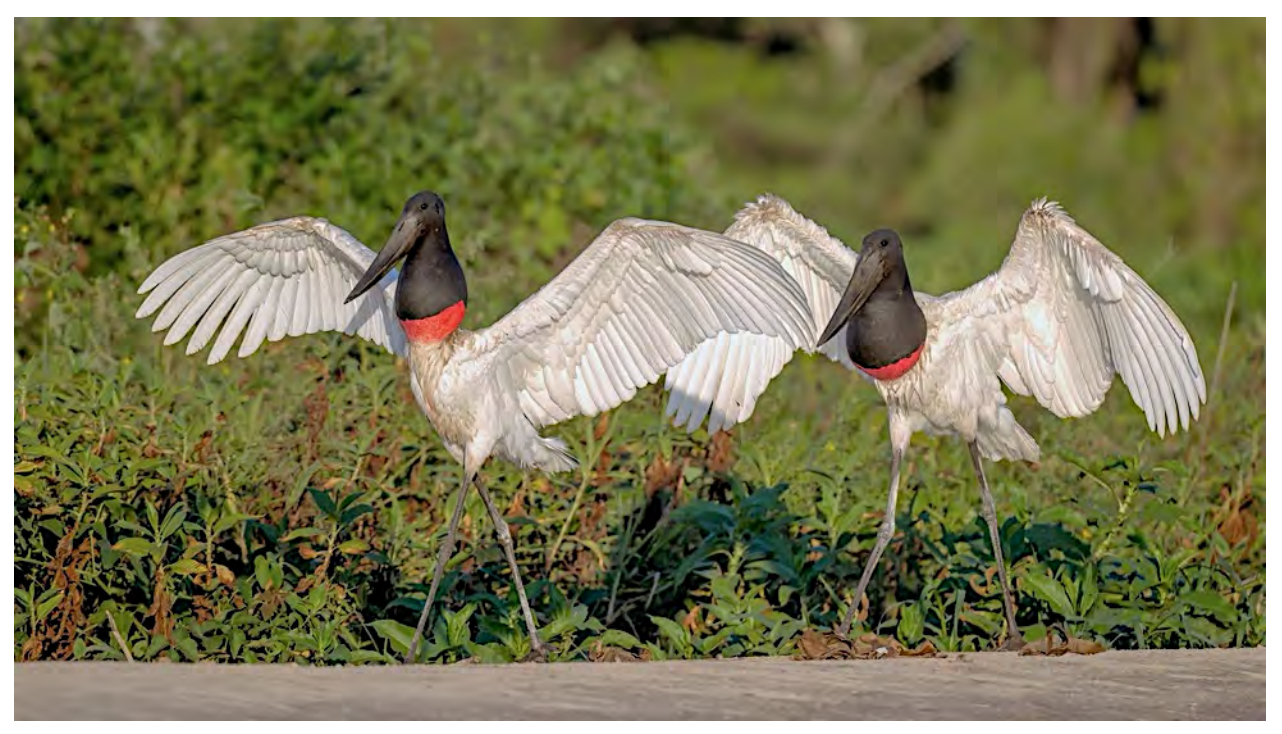
Jabirus are common in the Pantanal, and we will get great views of these large waders.

Chotoy, Cinereous-breasted, White-lored, and Rusty-backed spinetails, Gray-crested Cacholote, Narrow-billed, Planalto, and Great Rufous woodcreepers, Red-billed Scythebill, Planalto Slaty-Antshrike, Rusty-backed Antwren, Mato Grosso Antbird, Campo Suiriri Flycatcher, Ashy-headed Greenlet, Red-crested and Yellow-billed cardinals, White-bellied and Rusty-collared seedeaters, and Unicolored and Scarlet-headed blackbirds (catch your breath)... and the hot, humid Pantanal will certainly be the highlight of the trip!