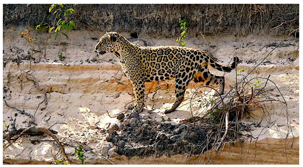
We have had wonderful luck finding Jaguars, and having extraordinary views of them. While we're searching for these elusive big cats, we'll also see some amazing birds, such as Jabirus, Hyacinth Macaws, and Sungrebes.

We include here information for those interested in the 2025 Field Guides Jaguar Spotting: Pantanal & Garden of the Amazon tour: