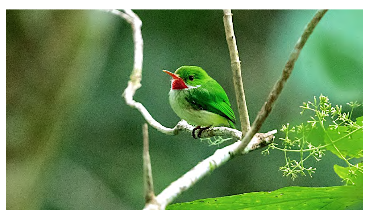
The tiny Jamaican Tody is always a favorite! We should get good looks at this charmer on our tour.

Rockland's Bird Sanctuary : Have you ever experienced a hummingbird on your finger? Well, you can hand-feed both endemic hummingbirds here. This site will serve as our grand finale. Over the course of many years, quite a few of the endemic species have become remarkably habituated at this elaborate feeding station. Photographic opportunities abound. Northern Potoo and Jamaican Owl are sometimes found on their day roosts at this site as well.