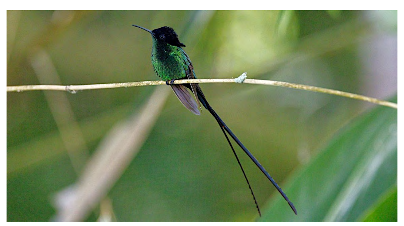
The elegant Black-billed Streamertail is the most-recently recognized Jamaican endemic. This beautiful, range-restricted hummingbird was split from the widespread Red-billed Streamertail. They can be easily seen on the grounds of our hotel.

Goblin Hill is a comfortable retreat with inviting trails circuitously winding through lush habitat. The extremely range-restricted Black-billed Streamertail was recently elevated to full species status and is easily observed on the grounds. The regal Chestnut-bellied Cuckoo may be working its way through the canopy of mature trees, while Jamaican Woodpeckers work the trunk, spritely Jamaican Todies and active Sad Flycatchers forage in the understory and White-chinned Thrushes hop across the ground. Numerous other endemics can be found here as well. The Caribbean breeze, a dip in the inviting pool, a good book, and a rum punch or fresh-squeezed juice might be really tempting. The beauty of staying at the same hotel for most of the tour is you are welcome to succumb to temptation and pass on any outing you wish (except for when we head west to Montego Bay).