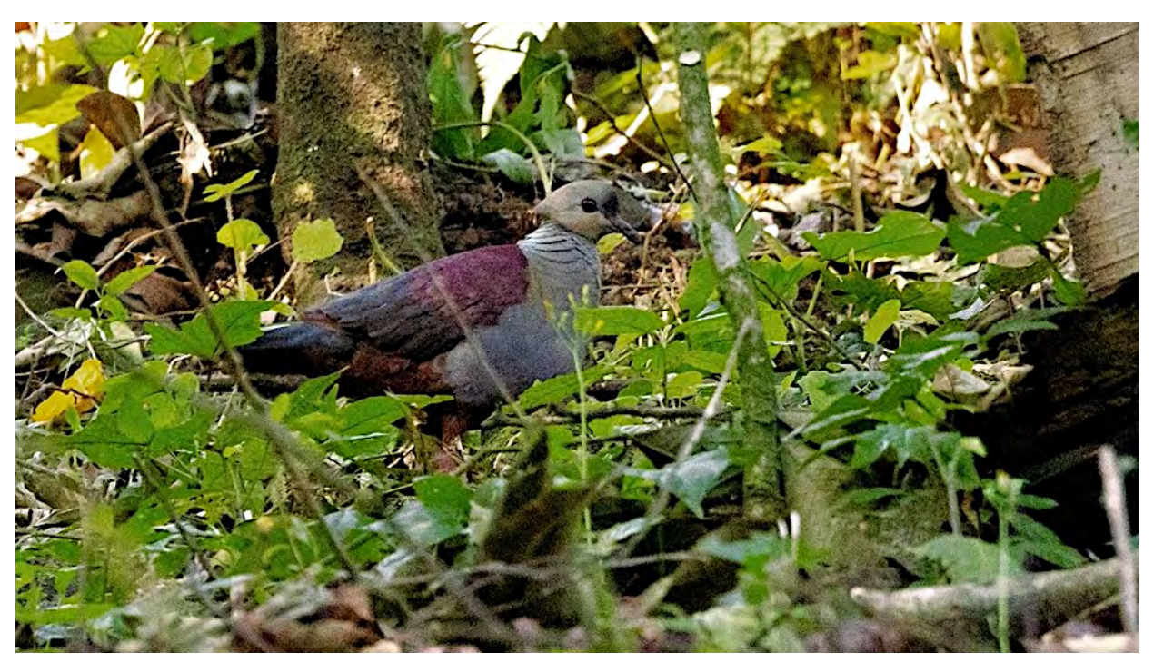
The enigmatic Crested Quail-Dove is a much wanted species that we'll make a concerted effort to find.

Day 4, Blue Mountains. This will be an early departure to Hardwar Gap. At Buff Bay on the coast, we will turn inland and wind our way up to approximately 4000 feet. The two most challenging endemics to see are Crested Quail-Dove and Jamaican Blackbird. Along with Blue Mountain Vireo and Chestnut-bellied Cuckoo, those four species will be the endemics we are most focused on in the Blue Mountains if we don't have them already. Other endemics at elevation include: Ring-tailed Pigeon, Jamaican Vireo, Rufous-tailed Flycatcher, Jamaican Pewee, Jamaican Spindalis, Arrowhead Warbler, and Jamaican Elaenia. The hauntingly beautiful song of the Rufous-throated Solitaire will be one of the highlights of the morning. The footing will be good as we bird along the road. Expect to walk several miles over a gentle slope, but in one stretch it is rather steep. To help round out our Jamaican experience, will make a quick visit to a coffee plantation for a tasting. Night at Goblin Hill outside Port Antonio.