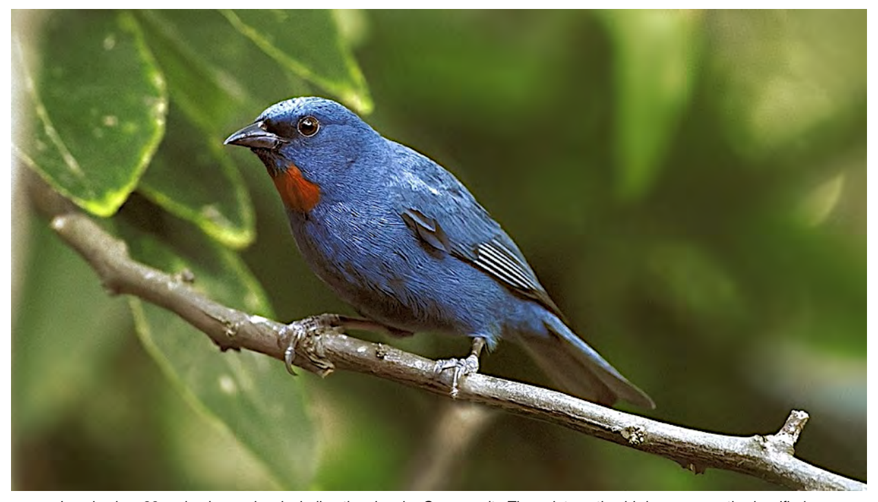
Jamaica has 28 endemic species, including the singular Orangequit. These interesting birds are currently classified as tanagers, and are the only members of their genus. They are found throughout the island, and we should get great views of them.

Tour I: February 28-March 7, 2025 Tour II: March 8-15, 2025 Tour III: November 22-29, 2025