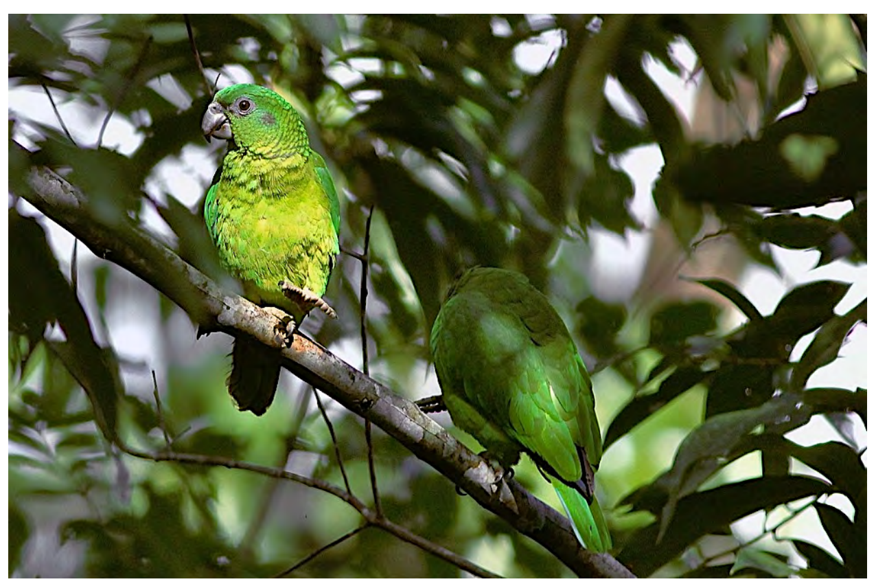
The endangered Black-billed Parrot is the less common of the two endemic Jamaican parrots. Both species can be found in the Cockpit Country of central Jamaica.

Day 6, Crossing the island to Montego Bay and Rocklands Bird Sanctuary. We will say goodbye to the wonderful staff at Goblin Hill and venture west along the north coast of the island. During this significant drive we will have to try to put the blinders on because our goal is to get to Montego Bay ahead of afternoon traffic. Our motivation for the expedited commute is a visit to the spectacular Rockland's Bird Sanctuary. Decades of feeding wild birds at this private home has led to a number of endemic species becoming remarkably habituated. Here you can have Red-billed Streamertails and Jamaican Mangoes sip sugar water from handheld feeders while Orangequits, Jamaican Orioles, Caribbean Doves, Bananaquits, and grassquits visit feeders little more than an arm's length away. On the way back to our hotel, we will visit the Montego Bay Sewage Ponds for great looks at a number of waterbirds. It is not uncommon for us to add a dozen new species to our triplist here (ducks, shorebirds, grebes). Night at Mynt Retreat in Montego Bay.