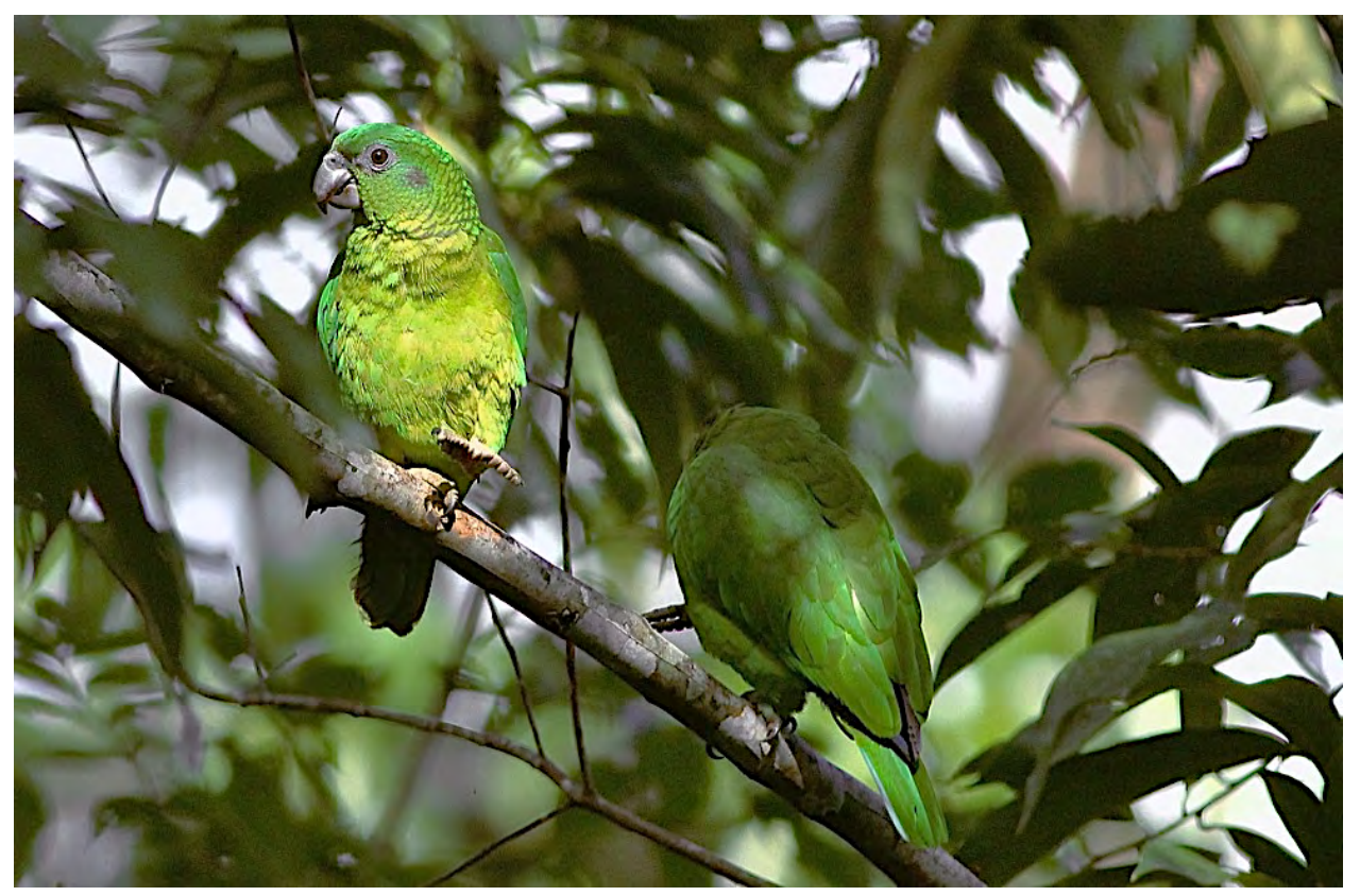
The endangered Black-billed Parrot is the less common of the two endemic Jamaican parrots. Both species can be found in the Cockpit Country of central Jamaica.

Day 6, Crossing the island to Montego Bay and Rocklands Bird Sanctuary. We will say goodbye to the wonderful staff at Goblin Hill and venture west along the north coast of the island. During this significant drive we will have to try to put the blinders on because our goal is to get to Montego Bay ahead of afternoon traffic. Our motivation for the expedited commute is a visit to the spectacular Rockland's Bird Sanctuary. Decades of feeding wild birds at this private home has led to a number of endemic species becoming remarkably habituated. Here you can have Red-billed Streamertails and Jamaican Mangoes sip sugar water from handheld feeders while Orangequits, Jamaican Orioles, Caribbean Doves, Bananaquits, and grassquits visit feeders little more than an arm's length away. On the way back to our hotel, we will visit the Montego Bay Sewage Ponds for great looks at a number of waterbirds. It is not uncommon for us to add a dozen new species to our triplist here (ducks, shorebirds, grebes). Night at Mynt Retreat in Montego Bay.