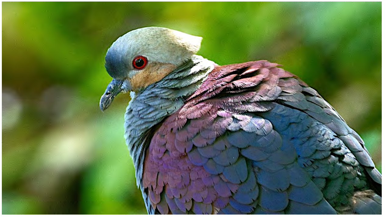
Jamaica has 28 endemic species, including the Crested Quail-Dove. This is one of the most sought-after of the endemics, and can be difficult to see, but we've had great luck with them!.

We include here information for those interested in the 2026 Field Guides Jamaica tour: