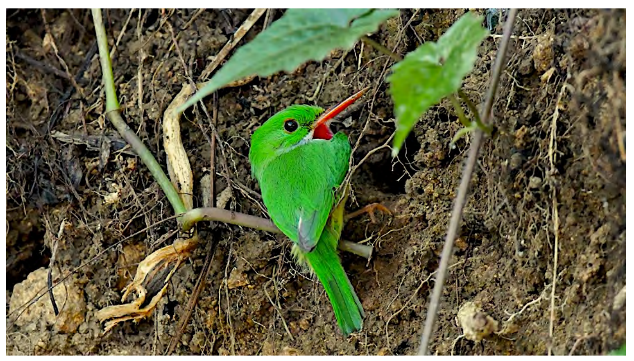
The tiny Jamaican Tody is related to kingfishers, and like them, digs holes into banks for nesting. These little gems are favorites, and we should get great looks at them during the tour.

Goblin Hill is a comfortable retreat with inviting trails circuitously winding through lush habitat. The extremely rangerestricted Black-billed Streamertail was recently elevated to full species status and is easily observed on the grounds. The regal Chestnut-bellied Cuckoo may be working its way through the canopy of mature trees, while Jamaican Woodpeckers work the trunk, spritely Jamaican Todies and active Sad Flycatchers forage in the understory and White-chinned Thrushes hop across the ground. Numerous other endemics can be found here as well. The Caribbean breeze, a dip in the inviting pool, a good book, and a rum punch or fresh-squeezed juice might be really tempting. The beauty of staying at the same hotel for most of the tour is you are welcome to succumb to temptation and pass on any outing you wish (except for when we head west to Montego Bay).