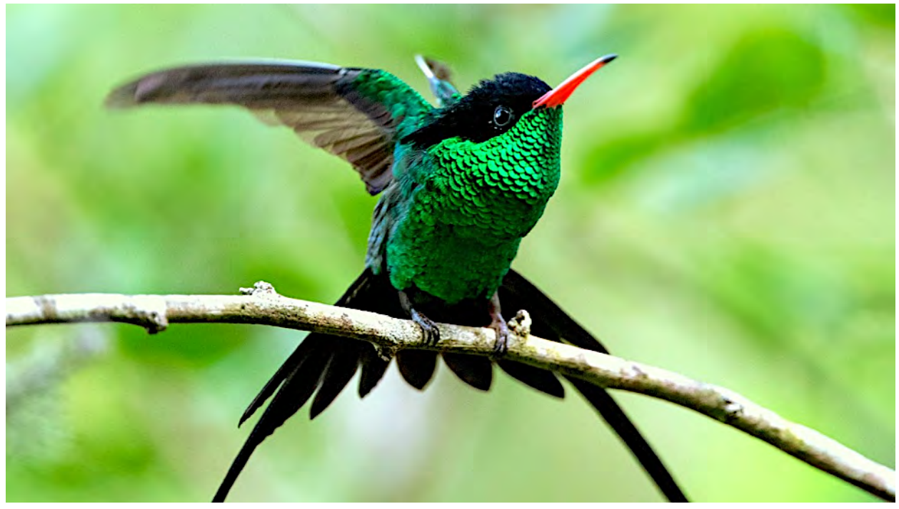
The fancy Red-billed Streamertail is Jamaica's national bird. This endemic is found across most of the island, and we'll be able to get up close to them at the Rockland's Bird Sanctuary.

Rockland's Bird Sanctuary : Have you ever experienced a hummingbird on your finger? Well, you can hand-feed both endemic hummingbirds here. This site will serve as our grand finale. Over the course of many years, quite a few of the endemic species have become remarkably habituated at this elaborate feeding station. Photographic opportunities abound. Northern Potoo and Jamaican Owl are sometimes found on their day roosts at this site as well.