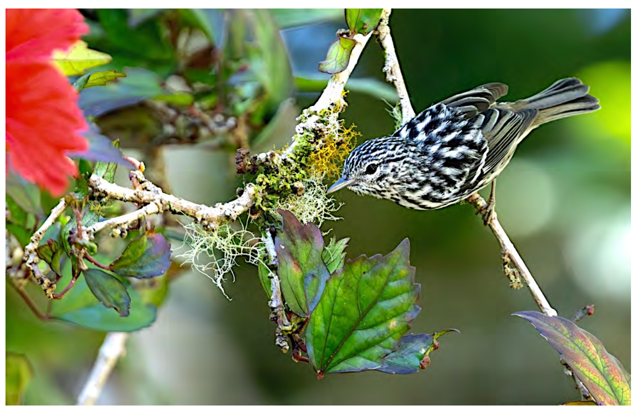
The Arrowhead Warbler is found in the higher elevations of Jamaica. We'll look for them in the John Crow and Blue mountains.

Day 4, Blue Mountains. This will be an early departure to Hardwar Gap. At Buff Bay on the coast, we will turn inland and wind our way up to approximately 4000 feet. The two most challenging endemics to see are Crested Quail-Dove and Jamaican Blackbird. Along with Blue Mountain Vireo and Chestnut-bellied Cuckoo, those four species will be the endemics we are most focused on in the Blue Mountains if we don't have them already. Other endemics at elevation include: Ring-tailed Pigeon, Jamaican Vireo, Rufous-tailed Flycatcher, Jamaican Pewee, Jamaican Spindalis, Arrowhead Warbler, and Jamaican Elaenia. The hauntingly beautiful song of the Rufous-throated Solitaire will be one of the highlights of the morning. The footing will be good as we bird along the road. Expect to walk several miles over a gentle slope, but in one stretch it is rather steep. To help round out our Jamaican experience, will make a quick visit to a coffee plantation for a tasting. Night at Goblin Hill outside Port Antonio.