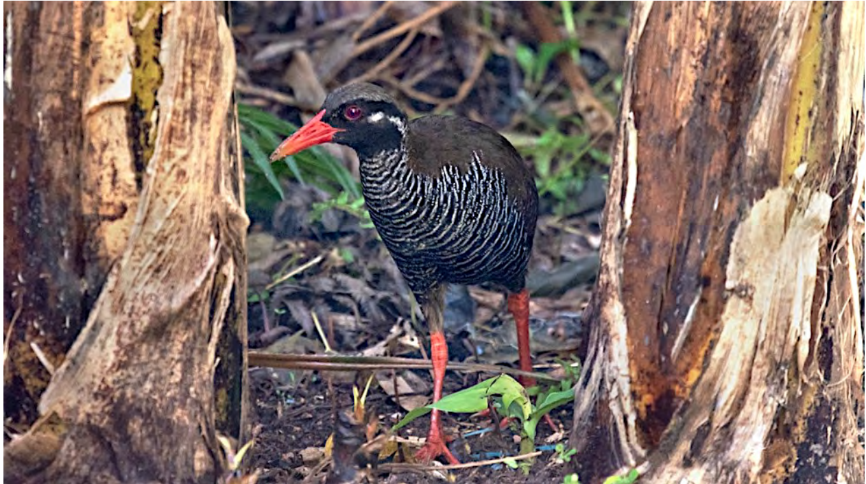
One of the special birds we'll seek is the Okinawa Rail. This flightless endemic is at risk from introduced mongoose, however, a control program is in place, and the rails are doing well.

We include here information for those interested in the 2021 Field Guides Japan in Spring tour: