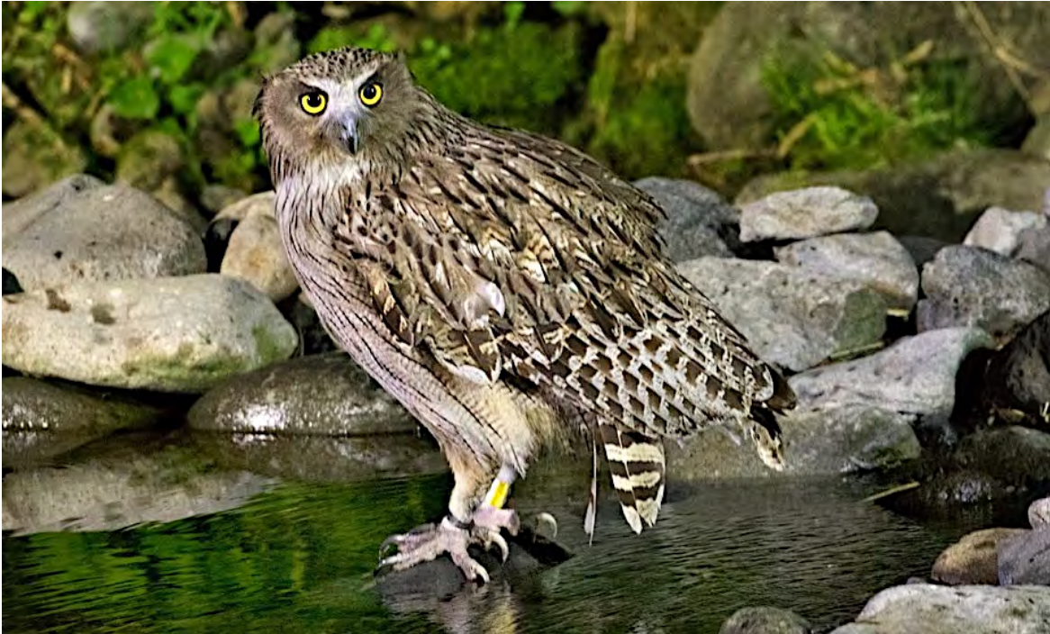
The immense Blakiston's Fish-Owl is one of the rarest birds in the world, and one of the largest of the owls. We've had amazing luck in seeing these wonderful creatures at our lodging on Hokkaido.

Day 14, 28 May or 15 Jun. Ishigaki to Naha on Okinawa, then flight to Haneda and connection for Hokkaido. The least populated of Japan's major islands, Hokkaido has large areas of forest, a windswept coastline and is an important agricultural area. Famous in winter for its large flocks of Red-crowned Cranes, at this time of year the flocks have dispersed but we will see some of these impressive birds, probably with youngsters too. Most of our birding will take place in the north east of the island. Night on Hokkaido.