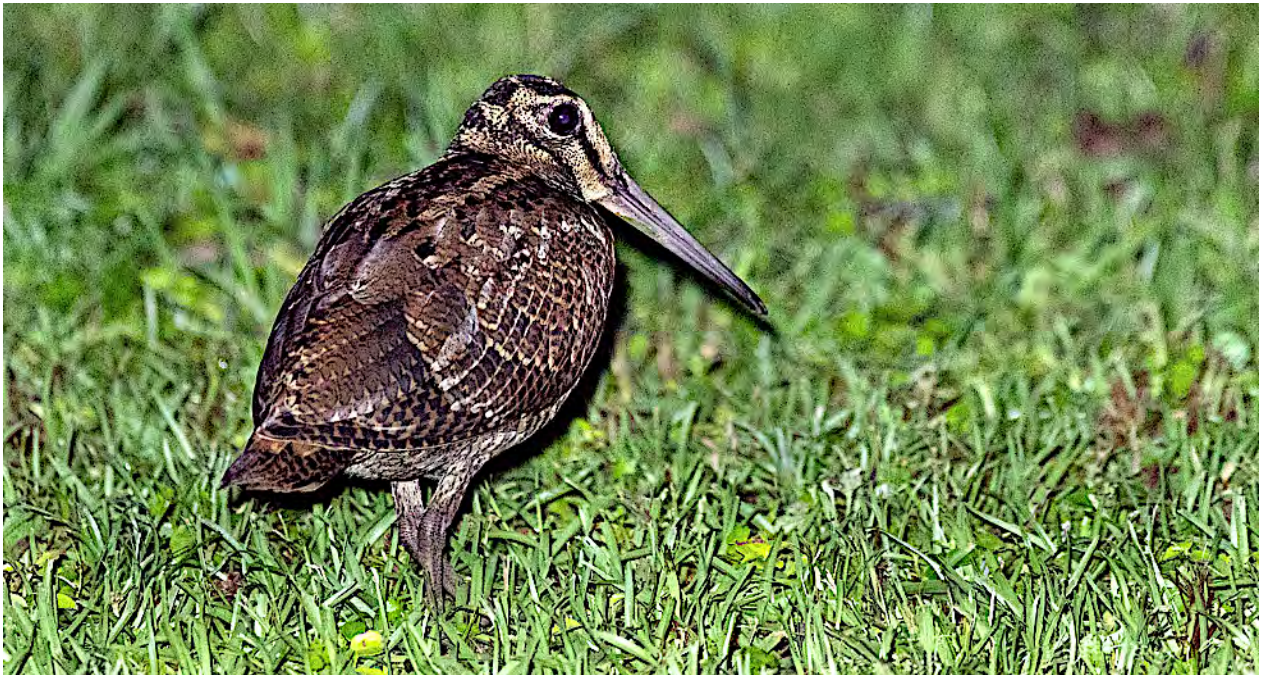
We have been able to get some great views of the shy Amami Woodcock.

Day 6, 20 May or 7 Jun. Disembark around 0500 and explore Miyake-jima. We will be looking for the endemic Izu Island Thrush, plus Ijima's Leaf Warbler, Pleske's (Styan's) Grasshopper Warbler, Izu (Japanese) Robin, and the recently split Owston's (Izu) Tit, plus Chinese Bamboo-Partridge. The return crossing to Tokyo is in daylight and we will be looking for Streaked and Short-tailed Shearwaters, and perhaps Tristram's Storm Petrel and more. Night in the Haneda area.