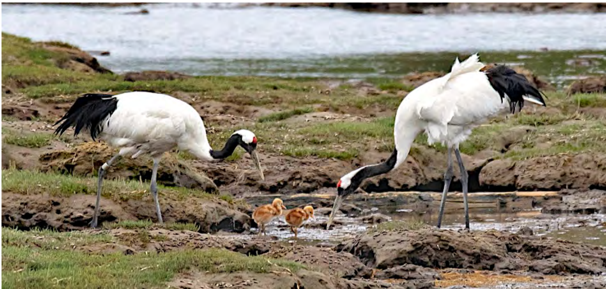
When we visit Hokkaido, we'll watch for pairs of Red-crowned Cranes in the marshes, possibly with youngsters.