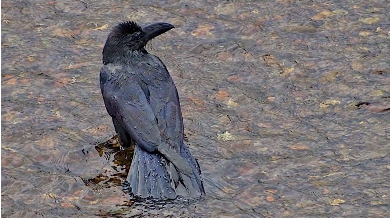
The well-named Large-billed Crow is a common sight in much of Japan.

Japanese culture is also a feature of the trip, with one of our lodgings in a traditional Japanese guest-house or minshuku, with sliding walls, tatami rush matting and futon bedding. The food is also very distinct, with a fantastic selection of sauces for the elaborate fish, rice, and vegetable dishes, which make up the traditional cuisine, and we will have some memorable and varied meals.