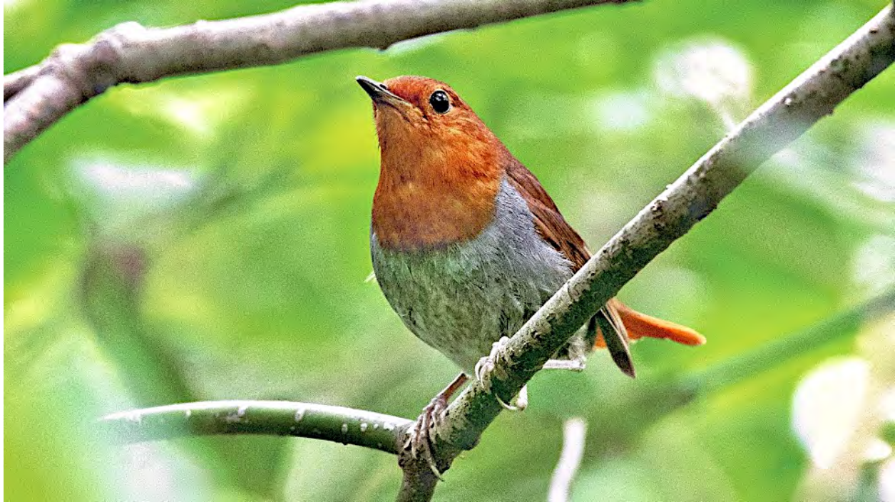
The Izu Robin is found only on the Izu Islands, near Tokyo. We'll visit Miyake Island to see these attractive small birds and several other island endemics.

We include here information for those interested in the 2024 Field Guides Spring Japan tour: