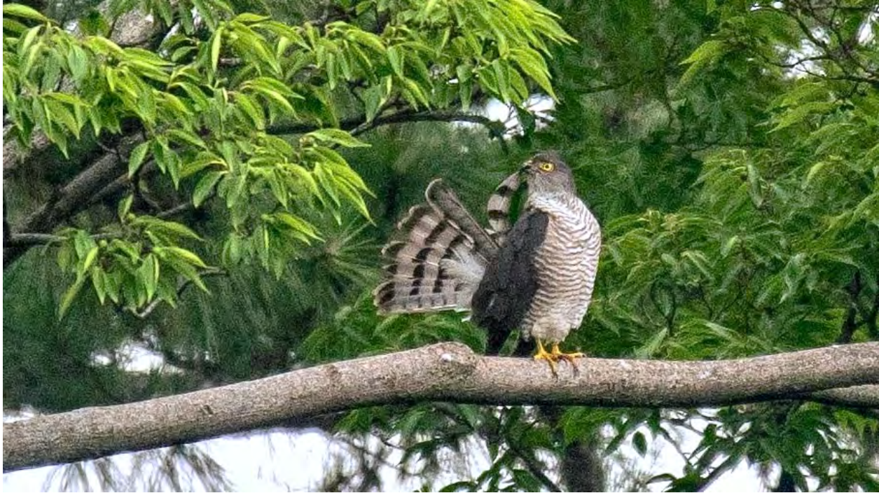
In the forests around Mt Fuji, we'll keep a lookout for the Japanese Sparrowhawk.

Day 5, Wed, 15 May. A full day exploring the forested slopes around Mt Fuji and Lake Yamanaka . Raptors such as Japanese Sparrowhawk and Oriental Honey Buzzard, plus passerines such as Japanese Yellow Bunting, Eurasian Nutcracker, Red-flanked Bluetail, and Siberian Blue Robin will be amongst our targets today, as will Siberian, Brown-headed and Japanese thrushes, also Japanese Yellow Bunting and Gray Bunting. Night at Shigakogen.