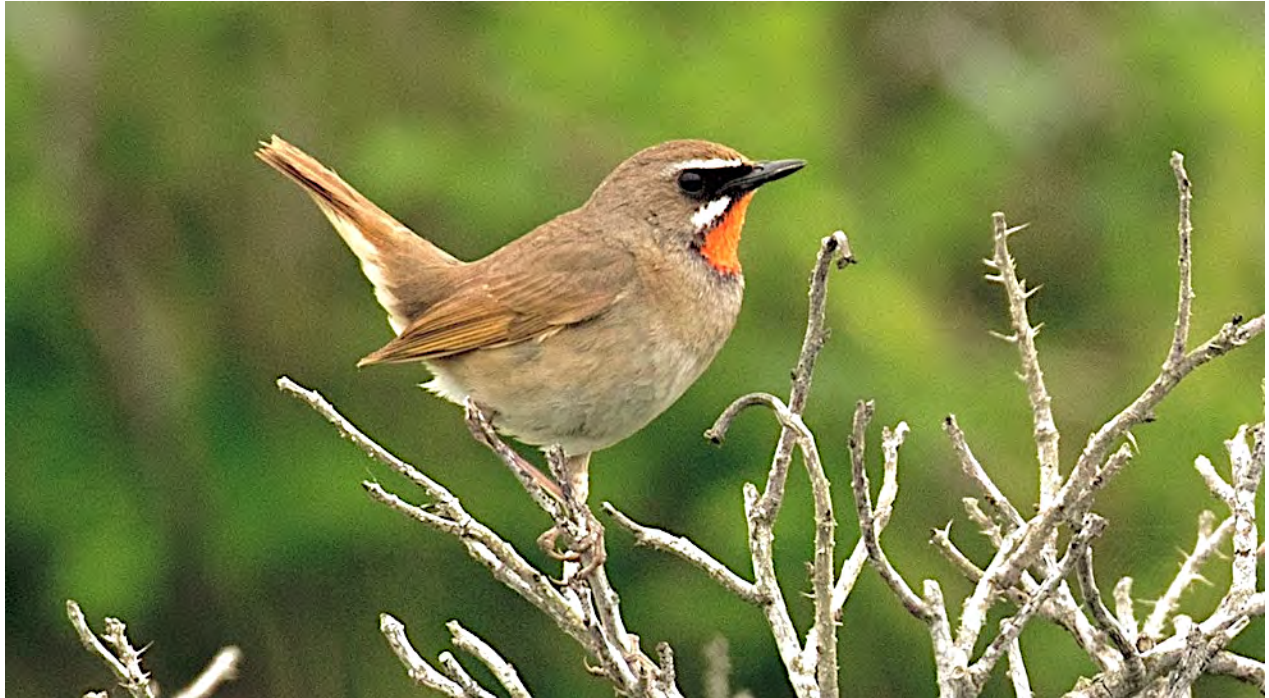
We'll keep watch for small birds such as the Siberian Rubythroat when we are on Hokkaido.

Day 16, Sun, May 26. Full day birding Hokkaido looking for the Red-crowned cranes, and any other species we may still be missing. The coastal islands and rock stacks around Cape Nosappu are home to large breeding colonies of seabirds, including Pelagic and the rare Red-faced Cormorants. The grassy headlands with patches of dwarf bamboo are often good for Lanceolated and Middendorf's Grasshopper Warbler and Siberian Rubythroat. Overnight Nemuro.