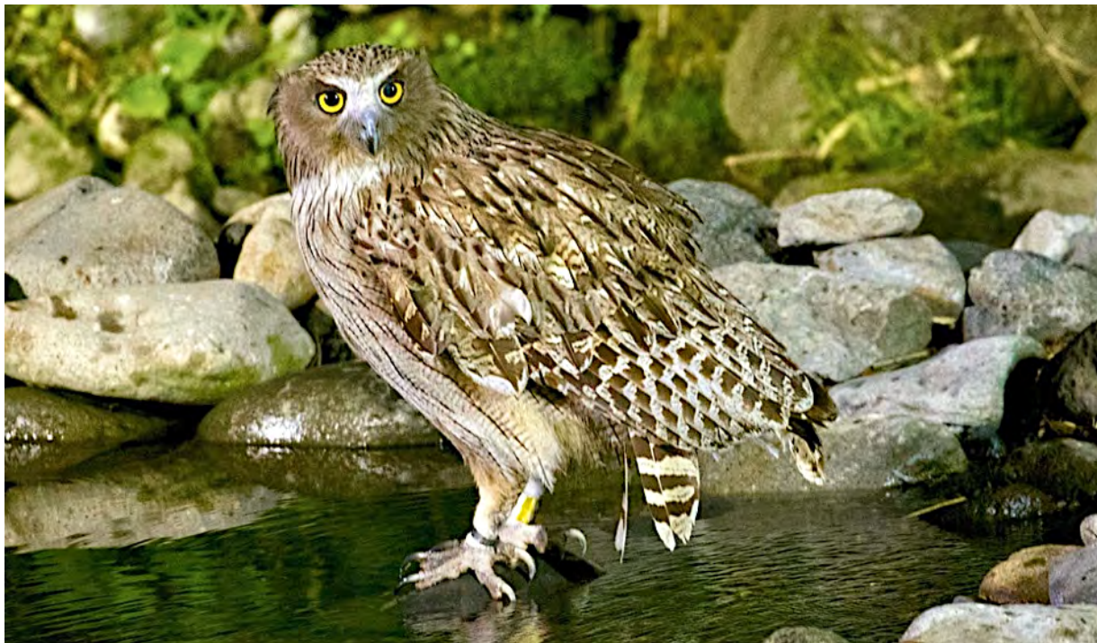
This wonderful Blakiston's Fish-Owl posed beautifully for us on our 2019 tour. We'll stay at a small lodge where we've seen them in the past, and we should be able to view them well!

Day 14, Fri, 24 May. Kushiro Forest Park for Sakhalin Leaf Warbler, Eastern Crowned Warbler, Japanese Robin and perhaps Black Woodpecker. Notsuke Peninsula for White-tailed Eagle, Siberian Rubythroat, Middendorf's Grasshopper Warbler, Amur Stonechat, Sika Deer and Red Fox. Drive to Rausu and check the harbor for gulls, then to nearby Washino-Yado minshuku for a delightful Japanese dinner and an overnight with a good chance of the amazing Blakiston's Fish Owl, visible from the simple futon bedrooms.