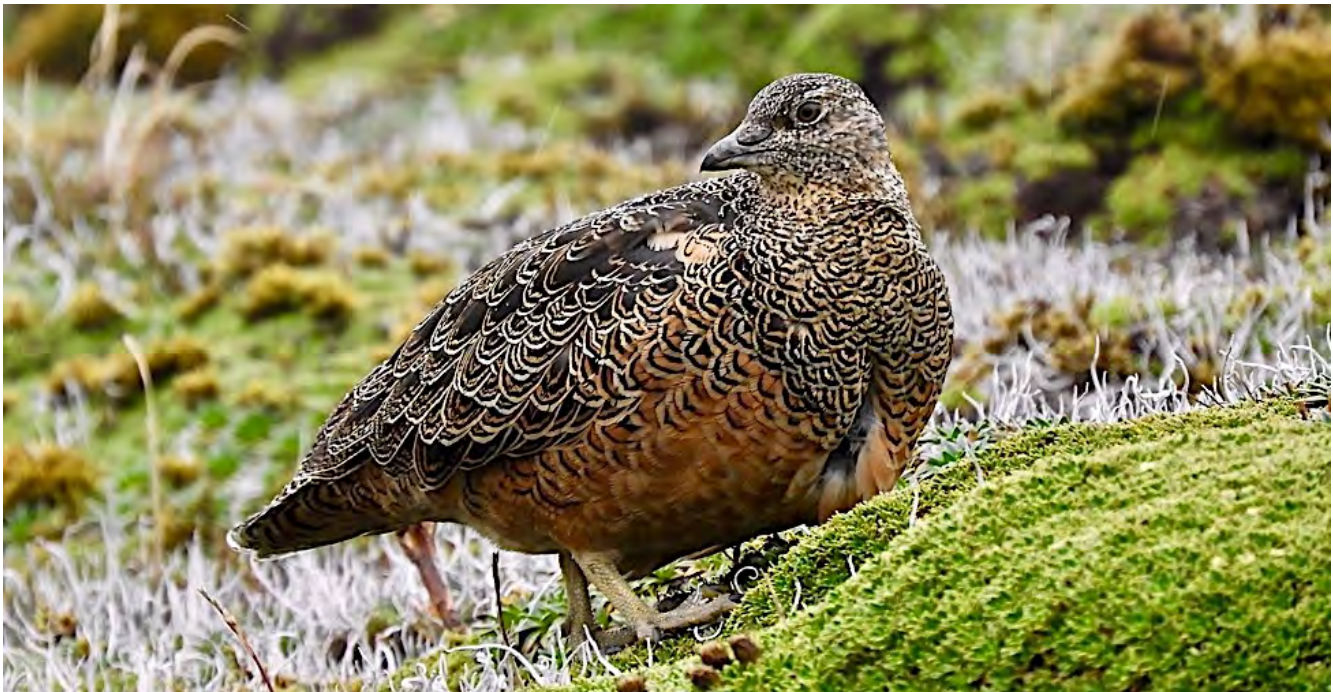
Seedsnipes are a group of shorebirds that have adapted to feeding on vegetation. The Rufous-bellied Seedsnipe is the largest in this group, and Papallacta Pass is one of the most northerly places that this species can be found.

Continuing through increasingly natural habitat, the road crosses the eastern cordillera at Papallacta Pass—at 13,000 feet (4000 m)—where it runs for a short distance through paramo at elevations well above 12,000 feet (3650 m), thence down the east slope into the lowlands. The wet grassland near the pass is especially fine, the bunch grass rank, and the landscape everywhere inflected with Puya bloom stalks. The many scattered marshes support a small population of Noble Snipe, and the highest slopes, covered with colorful lichens and cushion plants, are home to the Rufous-bellied Seedsnipe, here at the northern extent of its lofty range. Sizable, if shrinking, stands of Polylepis still grace the more sheltered slopes and flats near the pass and harbor the likes of Viridian Metaltail, Red-rumped Bush-Tyrant, Paramo Tapaculo, Andean Tit-Spinetail, White-chinned Thistletail, Many-striped Canastero, Red-crested Cotinga, Pale-naped Brush-Finch, and Black-backed Bush-Tanager.