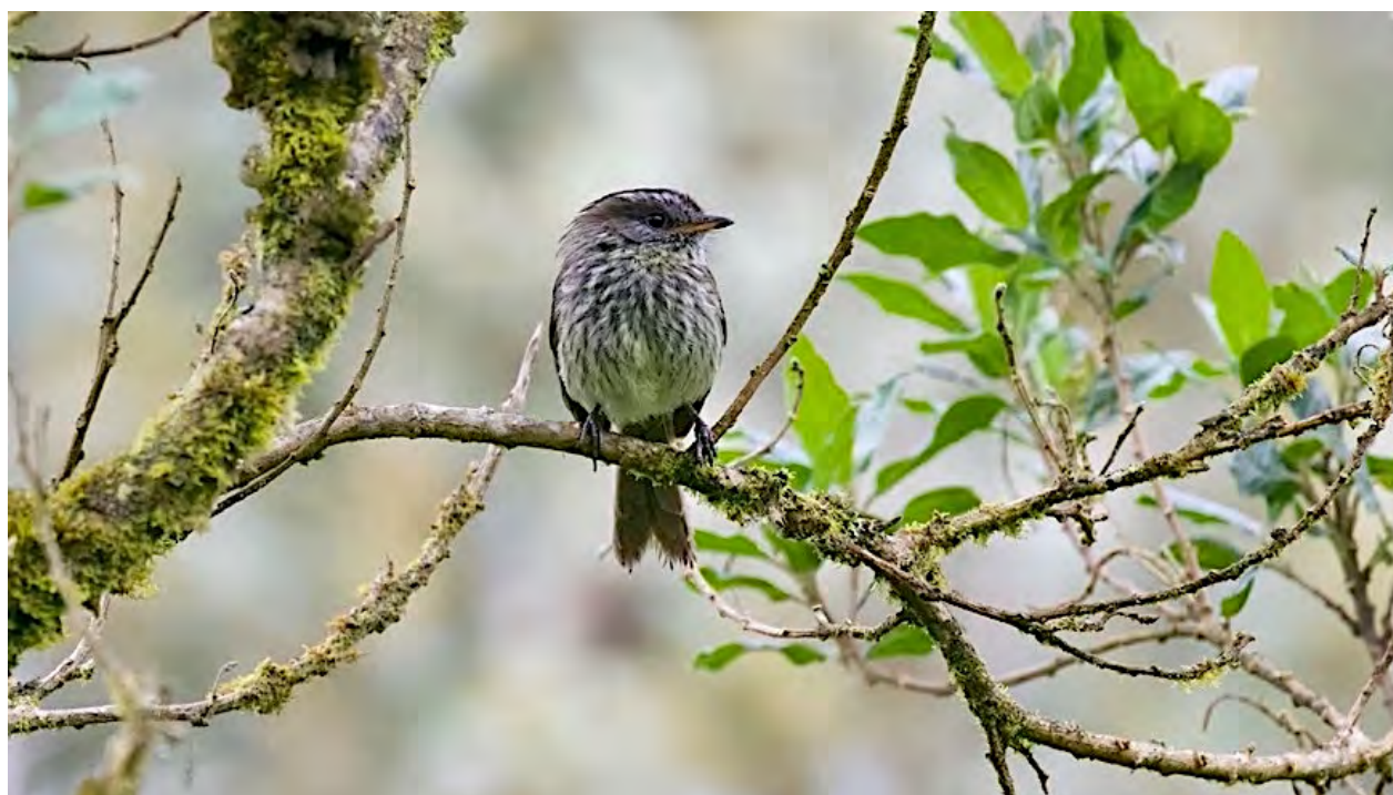
The tiny Agile Tit-Tyrant is found with mixed species flocks at higher elevations of the Andes in Ecuador.

Day 6, Tue, 24 Feb. Saraguro- Acacana. After a 6.00 a.m. breakfast, we'll spend our day in Huashapamba and Acacana, isolated patches of humid montane forest—some of which extend to treeline—to try especially for the scarce and erratic Red-faced Parrot and the rare and elusive Crescent-faced Antpitta, perhaps the fanciest of the little Grallariculas . We will go back to Saraguro for lunch, and later we will go higher to look for such treeline species as Golden-plumed Parakeet, Ocellated Tapaculo, Orange-banded Flycatcher, Golden-crowned Tanager, Gray-hooded Bush-Tanager, and Black-headed Hemispingus have proven to be more easily seen here than at Podocarpus. Other scarce specialties of these high forest patches include Andean Pygmy-Owl, Viridian Metaltail, Glowing Puffleg, Rainbow-bearded Thornbill, Mouse-colored Thistletail, Ash-colored Tapaculo, and Agile Tit-Tyrant (especially in bamboo). Night at Saraguro.