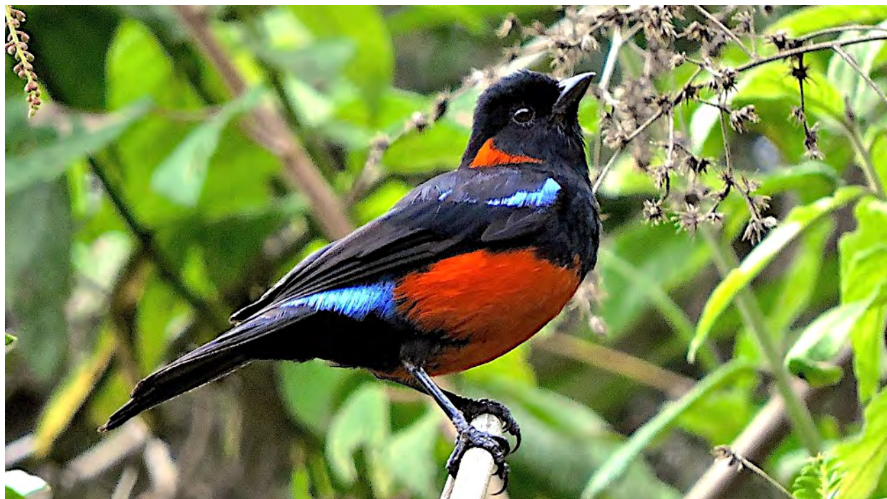
The brilliant Scarlet-bellied Mountain-Tanager is an Andean species that we'll look for at Yanacocha, where we've seen them well on past tours.

faced, and Scaly-naped parrots, Andean Motmot, Black-billed Mountain-Toucan (the subtropical, east-slope representative of the striking genus Andigena ), Crimson-mantled Woodpecker, Spotted Barbtail, Flammulated, Striped, and Black-billed treehunters, Montane Foliage-gleaner, Olive-backed and Montane woodcreepers, Streak-headed Antbird, Ash-colored, Long-tailed, Spillmann's, and Blackish tapaculos, Rufous-crowned Tody-Flycatcher, Rufous-breasted, Handsome, and Flavescent flycatchers, Yellow-bellied Chat-Tyrant, Black-chested (rare) and Green-and-black fruiteaters, Andean Solitaire, Chestnut-bellied Thrush, Black-billed Peppershrike, Scarlet-rumped (Subtropical) and Mountain caciques, many species of tanagers (including such rarities as Vermilion and Blue-browed), and some interesting mixed-species flocks with such tantalizing, if outrageous, possibilities as Greater Scythebill and White-faced Nunbird. The spectacular Barred Anthrush, Bicolored Antvireo, and even the little-known Peruvian Antpitta are all rare possibilities here.