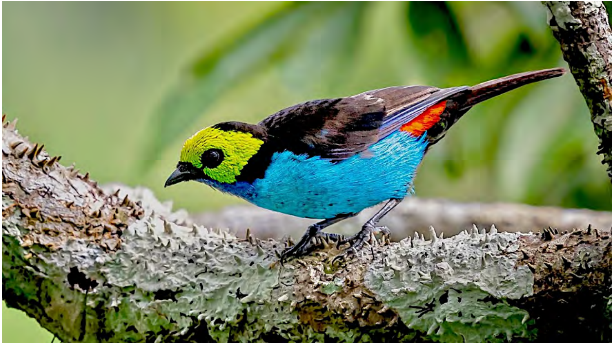
The gorgeous Paradise Tanager is a fine example of the feathered gems we will seek on this tour.

We include here information for those interested in the 2026 Field Guides Jewels of Ecuador: Hummers, Tanagers, & Antpittas tour: