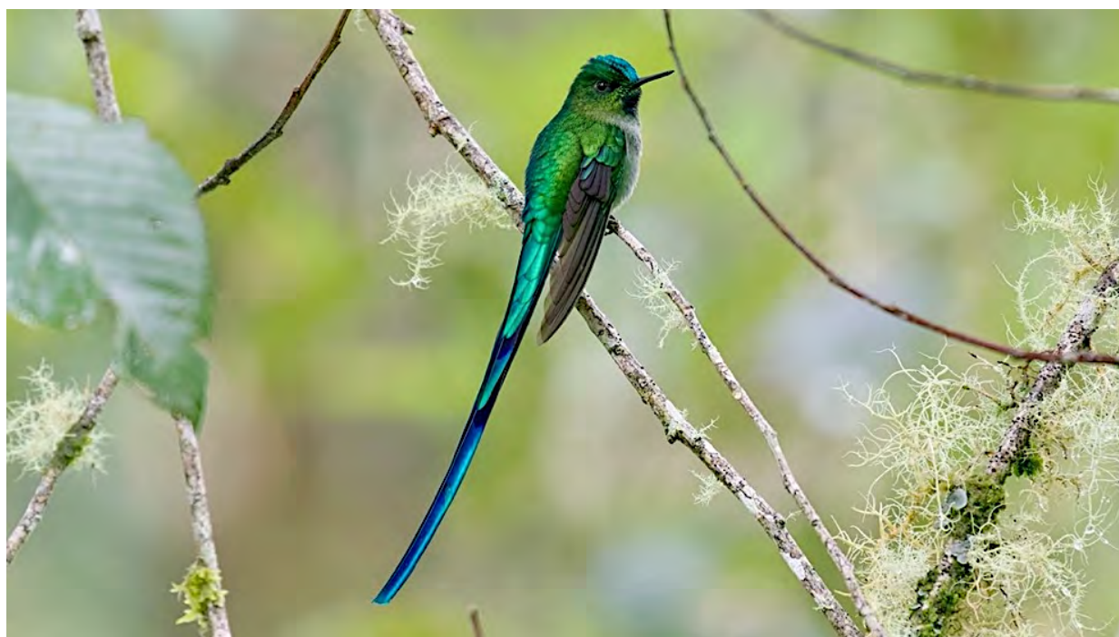
The spectacular Long-tailed Sylph is one of many jewel-like hummingbirds we'll see at San Isidro.

When the cock show is over, we'll work back up the trail network slowly, with our hosts Angel and Rodrigo Paz, stopping to try for four species of antpittas and for the wood-quail that they have trained to come to the trail for earthworms. We'll sit and watch the fruit feeders for a while, check out the hummingbird feeders, and doubtless spend most of the morning enjoying the magic of Refugio Paz de las Aves. When we get back up to the top of the hill, we'll have a hot breakfast (or mid-morning brunch) prepared by Angel's wife while we watch for raptors and tanager flocks from an open-air dining area. We have the remainder of the day, with a picnic lunch, to work on whatever still eludes us, back in Angel's Forest, along the Tandayapa Ridge, or the old Nono/Mindo road. Whatever we do, we'll spend the afternoon traveling back to Quito, with a few well-appointed stops at higher elevations, night at Hotel San Jose de Puembo.