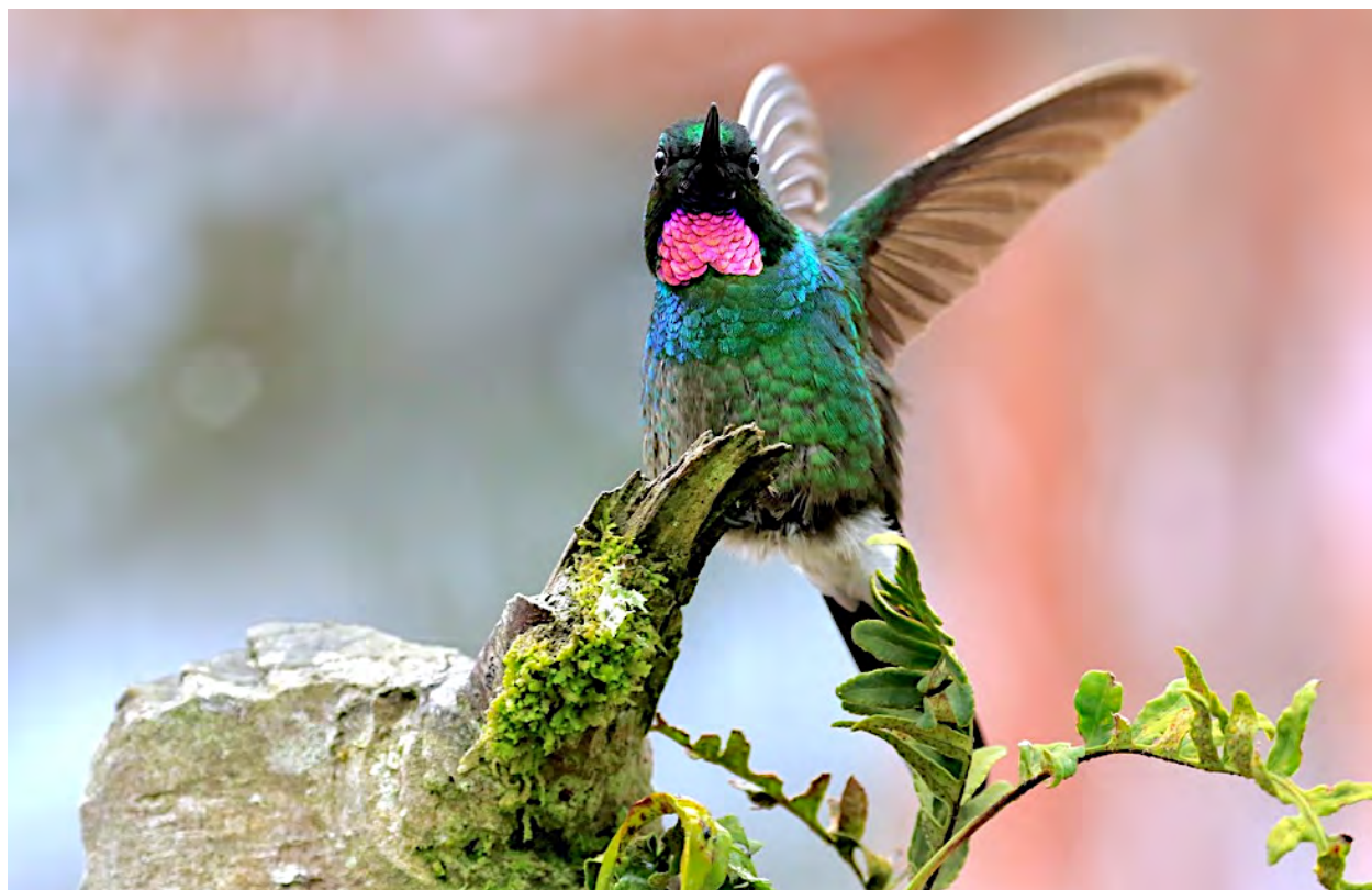
Tourmaline Sunangel is a gorgeous hummingbird that we'll look for at Guango lodge when we stop there.

On our way down the east slope toward Baeza and San Isidro, we plan a birding (and lunch) stop at Guango, around 8900 feet (2700 m). Well-established hummingbird feeders just outside the dining room attract fabulous Sword-billed Hummingbirds, lots of Tourmaline Sunangels, Long-tailed Sylph, Chestnut-breasted Coronet, White-bellied Woodstar, an occasional Gorgeted Woodstar, and, rarely, a Mountain Avocetbill, among others. If the weather's right, in the temperate forest bordering the pasture here, we could encounter Gray-breasted Mountain-Toucan, a rare Dusky Piha, Pearled Treerunner, Turquoise Jay, Black-capped and Black-eared hemispinguses, Plushcap, Slaty Brush-Finch, and Mountain Cacique. It was here, too, that we saw a Mountain Tapir on one trip.