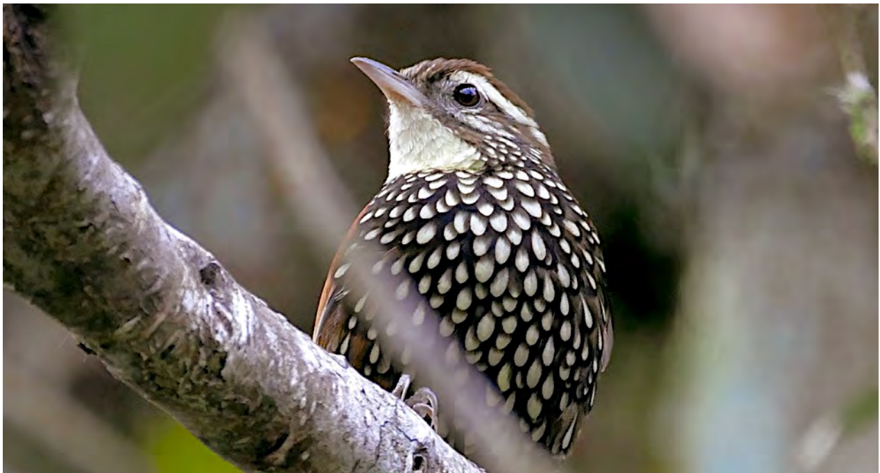
The lovely Pearled Treerunner is one of the prettiest of the furnariids. It is found in Andean cloud-forests from Venezuela to Bolivia, and tends to travel in mixed-species flocks. We'll watch for this beauty at Yanacocha.

Yanacocha- Zuroloma. Around the northern slope of Volcan Pichincha, at an elevation of 10,000-11,500 feet (3000-3500 m), lies a beautiful treeline forest known as Yanacocha. Protecting one of the sources of Quito's drinking water—some of which still runs through an ancient Inca canal—in 2001, this humid forest was converted to a Jocotoco Foundation Reserve. It offers temperate-forest birding easily accessible from Quito, as well as the possibility of a few highly sought rarities. With a wonderful variety of blossoms throughout the year—and with well-maintained bebederos along the trail—Yanacocha is a veritable hummingbird haven, where one gets excellent views of a nice variety of species. Possibilities include such dazzlers as Mountain Velvetbreast, Great Sapphirewing, Buff-winged Starfrontlet, Sapphire-vented Puffleg, Golden-breasted Puffleg, Rainbow-bearded Thornbill, and the amazing Sword-billed Hummingbird. Andean Pygmy-Owl inhabits the slopes in low density, as do Bar-bellied Woodpecker, White-browed Spinetail, Equatorial and Tawny antpittas, Blackish Tapaculo, Streak-throated and Smoky bush-tyrants, Crowned Chat-Tyrant, and Barred Fruiteater. Mixed-species flocks may contain Pearled Treerunner, Streaked Tuftedcheek, Rufous Wren, Blue-backed Conebill, Superciliaried Hemispingus, Glossy and Masked flowerpiercers, Golden-crowned Tanager, Scarlet-bellied Mountain-Tanager, and the scarce Black-chested Mountain-Tanager.