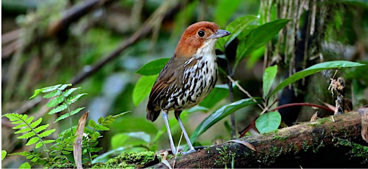
One of 14 species of antpittas we might see on this tour, the Chestnut-crowned Antpitta is said to be one of the easiest to observe, and it may be one of the prettiest. This individual was seen near San Isidro.

Throughout tiny Ecuador, every year brings new developments in the ecotourism infrastructure, from new preserves and lodges to new “eco-trails” and hummingbird pavilions. Some places boast comederos , or earthworm feeders for antpittas! Our itinerary is flexible enough to incorporate the best of these new developments as they arise. Taken together, they reflect an exciting transition to a more ecotourism-based economy that contributes to improved conservation and awareness of the country’s incredible biodiversity.