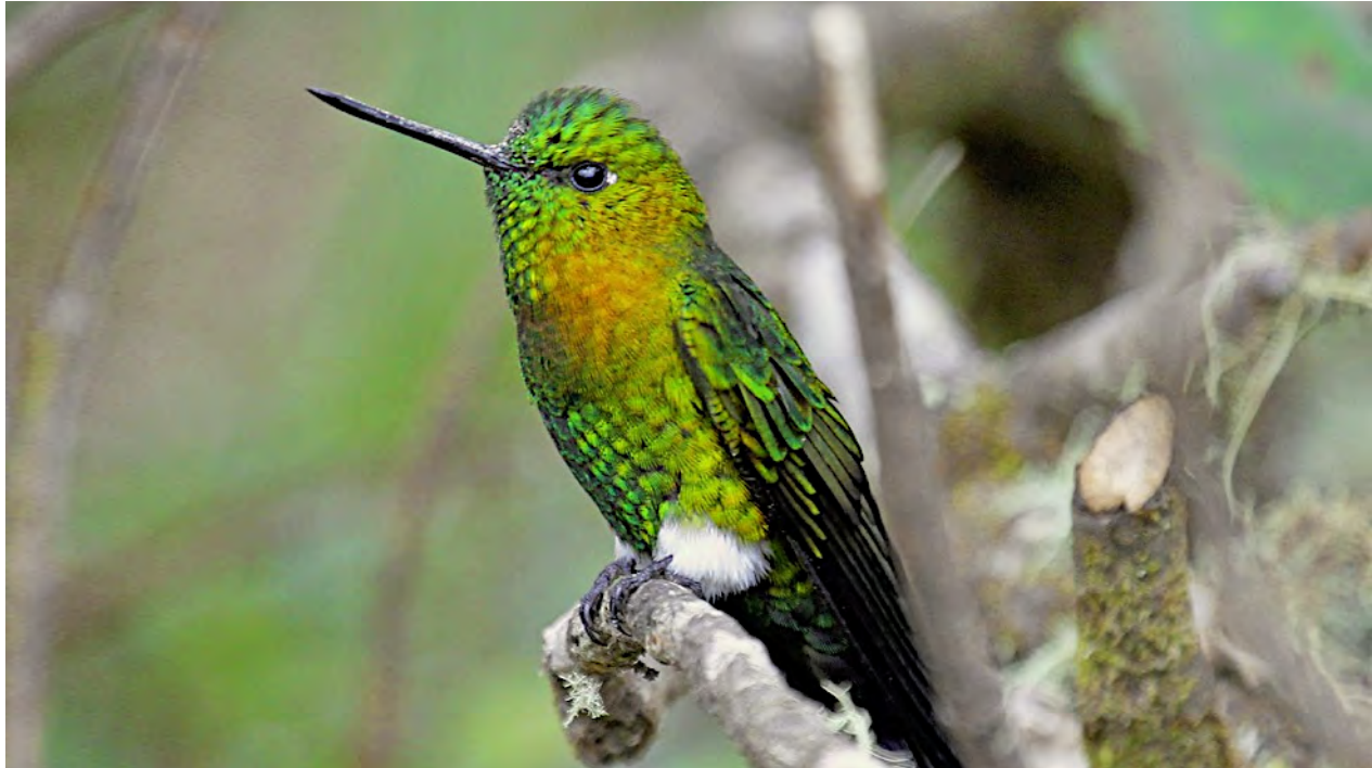
The Golden-breasted Puffleg is a high-elevation species of the Andes in Ecuador and Colombia.

We'll then drive to Cuenca, where magnificent El Cajas National Park awaits, characterized by paramo grassland studded with big Polylepis groves and sparkling Andean lakes. Such is the habitat of the fabulous Giant Conebill and the Tit-like Dacnis, as well as a very local endemic hummer, the Violet-throated Metaltail, and another almost-endemic, the striking Ecuadorian Hillstar. It's a land of breathtaking scenery where, at any moment, a Carunculated Caracara or a magnificent Andean Condor could sail overhead.