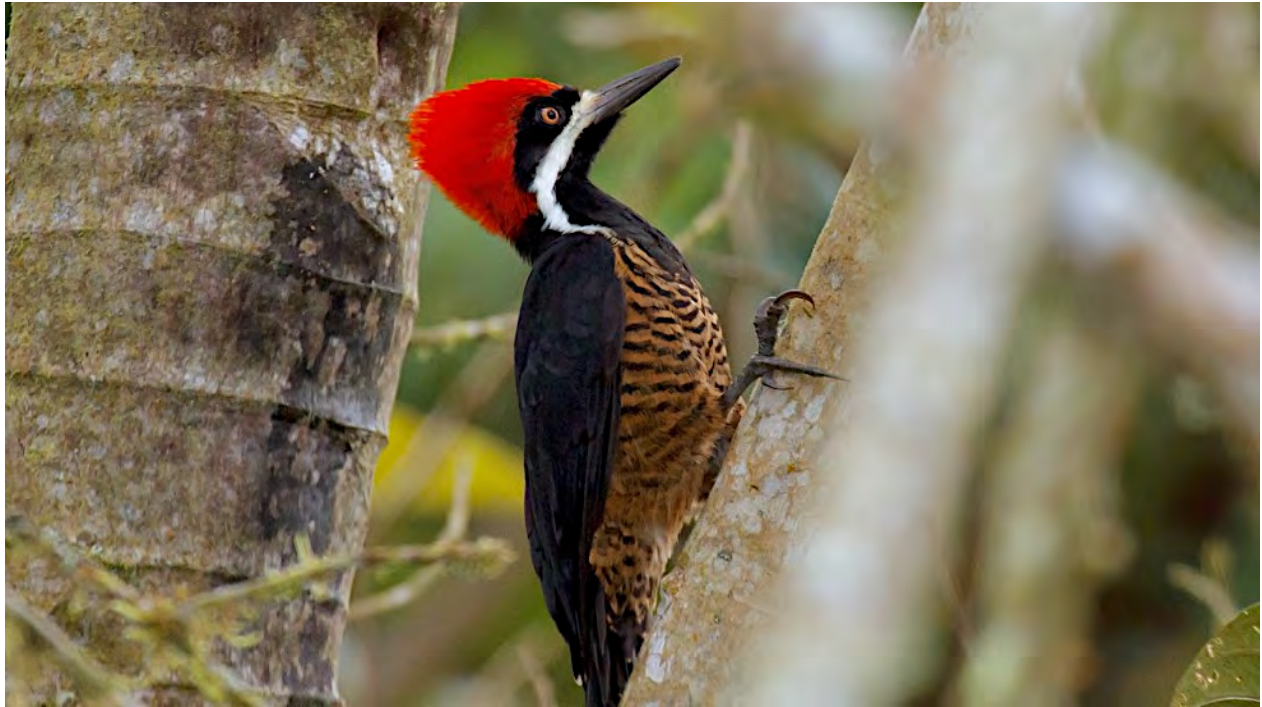
The beautiful Powerful Woodpecker is a large bird found in the mature forests of the northern Andes. Though not considered rare, these birds are not often seen, but we have a good chance to find a pair on the road to Mindo.

Beautiful Jay (also confined to the west slope). Bright sunny weather can cause the forest to go quiet, but it brings out such raptors as Barred Hawk and Black-and-chestnut Eagle.