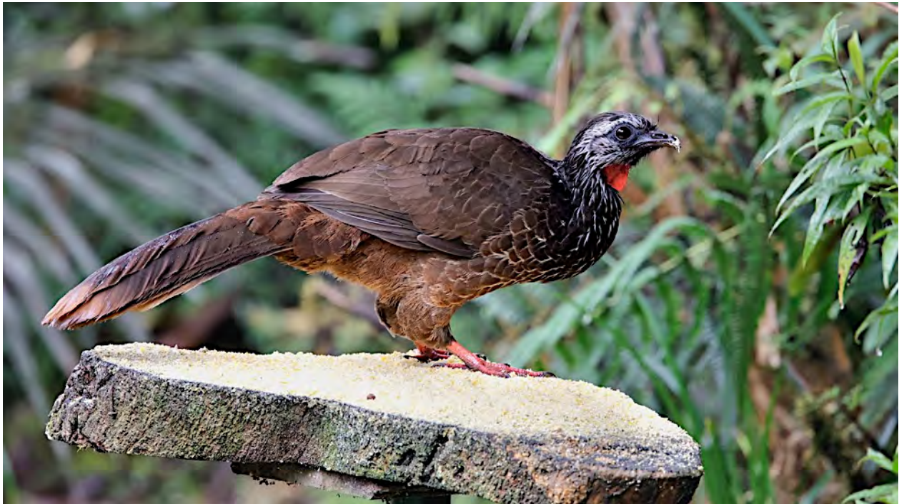
The Bearded Guan has a limited distribution in southern Ecuador and northern Peru. Like other cracids, it faces problems of habitat loss, but it can still be found in good habitat.

and Lemon-browed flycatchers, Foothill Elaenia (a little Myiopagis flycatcher that was officially described after the Ecuador text went to press), Amazonian Umbrellabird, Andean Cock-of-the-rock, Blue-rumped Manakin (rare), White-crowned Manakin, Slaty-capped Shrike-Vireo, Orange-billed Sparrow, Olive Finch, and dozens of glittering tanagers, including Blue-naped Chlorophonia, Orange-eared, Paradise, Golden, Golden-eared, Yellow-bellied, Spotted, and Blue-necked. The well-designed trails climb gradually upriver through absolutely glorious forest.