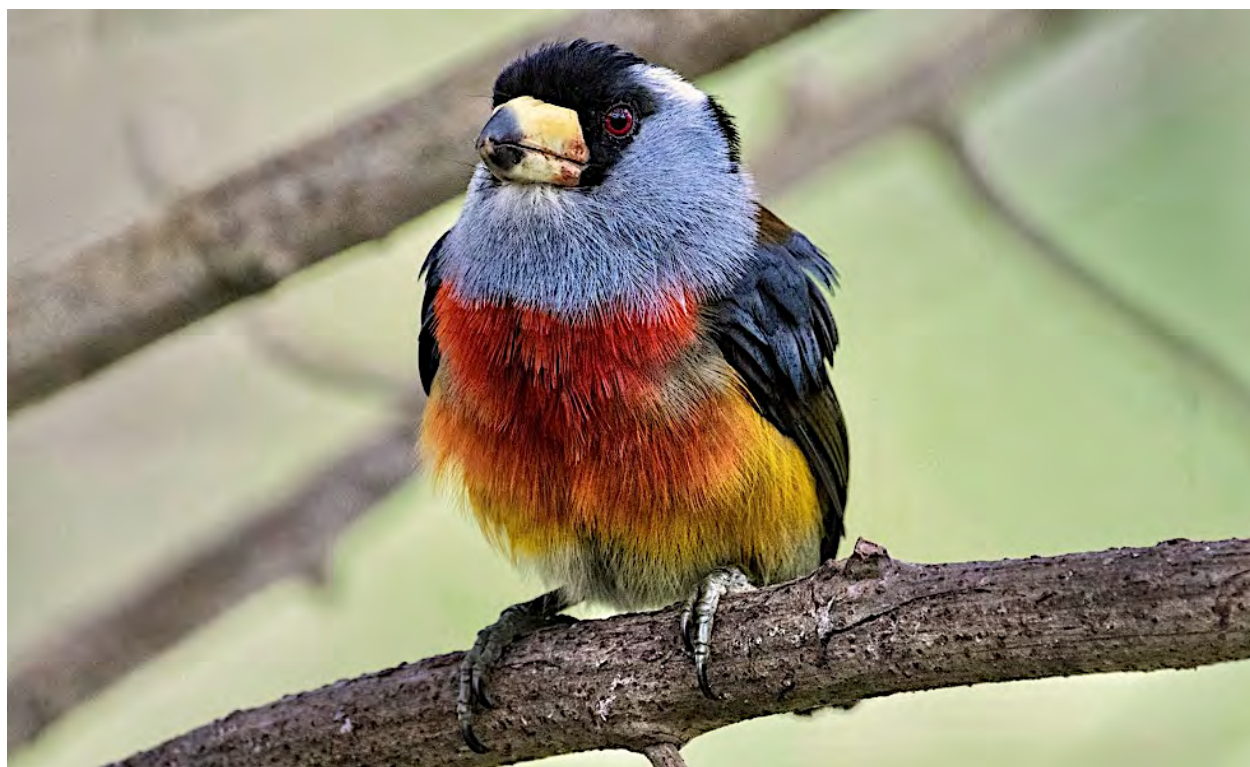
We'll watch for the colorful Toucan Barbet in the Mindo area.

Our base at Mindo is a comfortable lodge just off the Mindo entrance road. Night at Septimo Paraiso near Mindo.