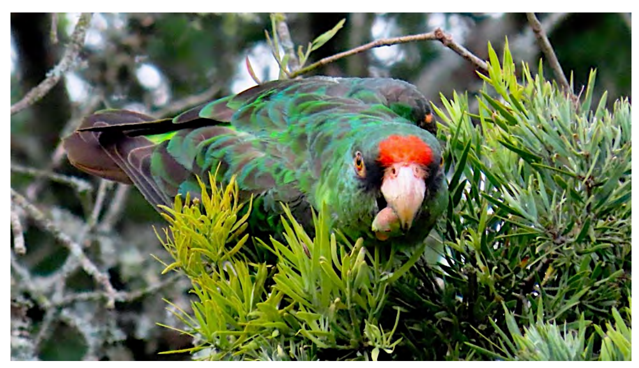
Fond of Podocarpus trees, we've had excellent views of Red-fronted Parrot at Naro Moru and near The Ark.

Special mammals of Buffalo Springs/Samburu are the endangered Grevy's Zebra, Beisa Oryx, Reticulated Giraffe, Gerenuk, Cheetah, and Leopard. But not all mammals are so large, and we'll also be watching for Unstriped Ground Squirrel, and parties of Eastern Dwarf Mongoose that foraging amongst the fallen logs and termite hills. Nights at Ashnil Samburu Camp.