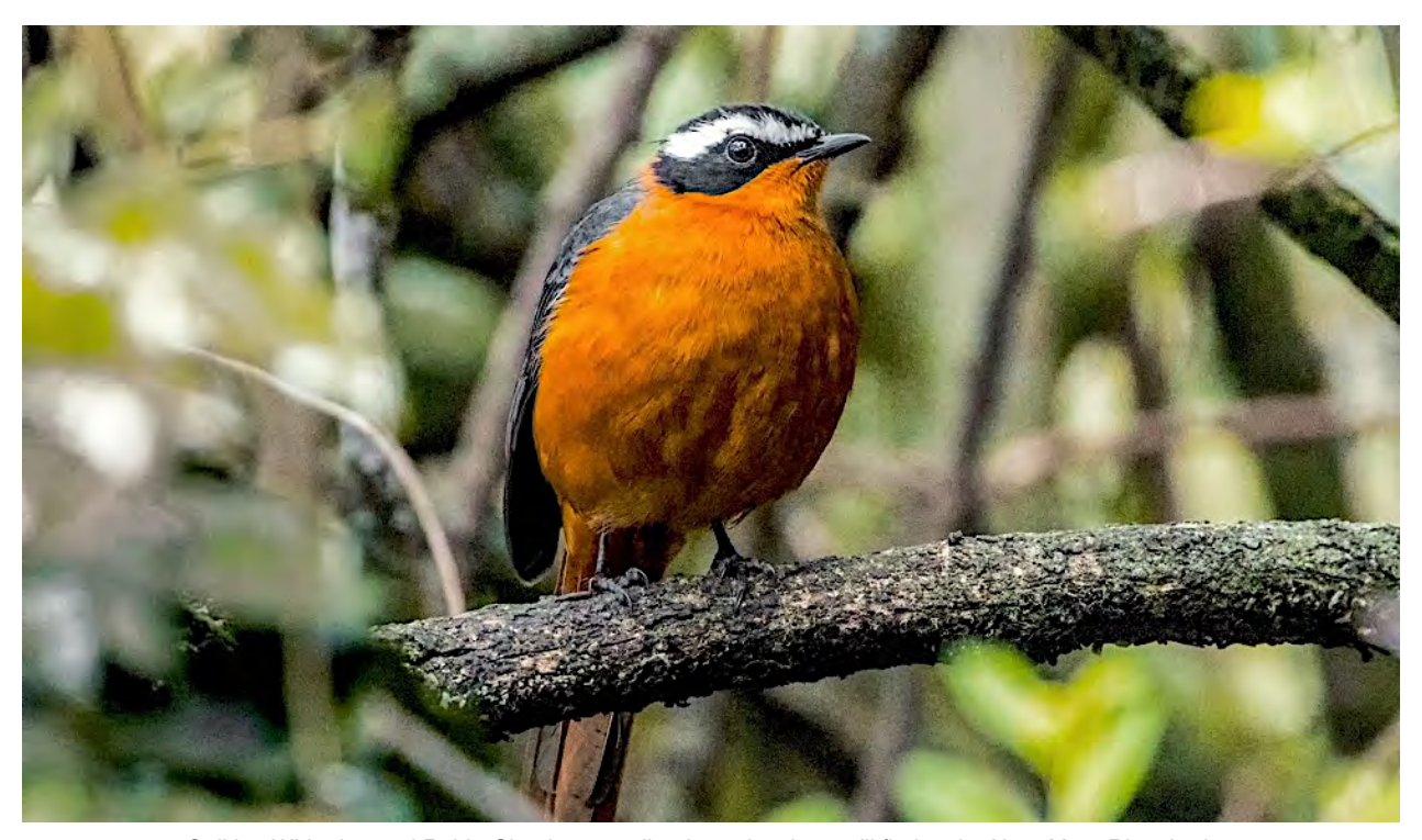
Striking White-browed Robin-Chat is a woodland species that we'll find at the Naro Moru River Lodge.

Day 6, Thu, 1 Aug. To Naro Moru. Today we'll take a picnic lunch and climb out of the Great Rift Valley as we head east to Naro Moru River Lodge – an older type series of rooms and cottages set in attractive gardens along the Naro Moru River. We expect to arrive there by mid-afternoon, and we'll then walk the delightful grounds where flowering shrubs attract as many as nine species of sunbirds. White-browed Robin-Chats sing loudly from thickets, the beautiful African Paradise-Flycatcher is often present, as are Black-backed Puffback and Red-headed Weaver. Tonight we'll sleep to the sound of Tree Hyrax, which call loudly from the riverine forest outside our rooms at Naro Moru River Lodge.