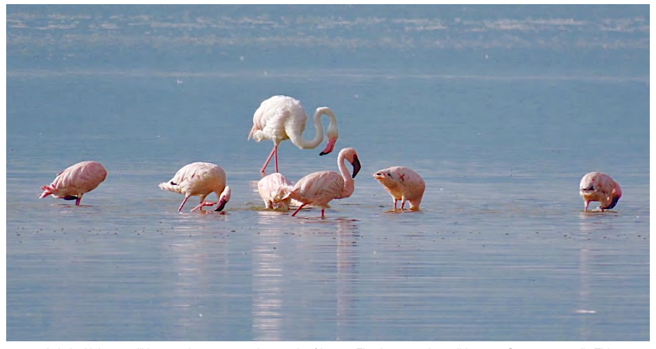
At Lake Nakuru we'll have a chance to see thousands of Lesser Flamingos, and possibly some Greaters as well. This peaceful scene shows the size and coloration differences of these two species.

If you are uncertain about whether this tour is a good match for your abilities, please don't hesitate to contact our office; if they cannot directly answer your queries, they will put you in touch with the guide, or help you to find the tour that is right for you!