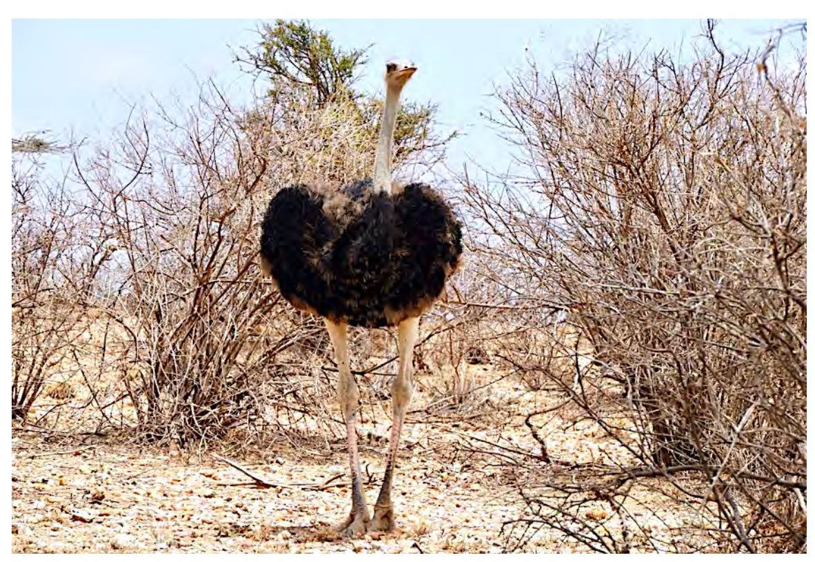
We should see both species of Ostrich. This one, the Somali Ostrich, is confined to the arid parts of East Africa, so we'll look for them at Samburu.