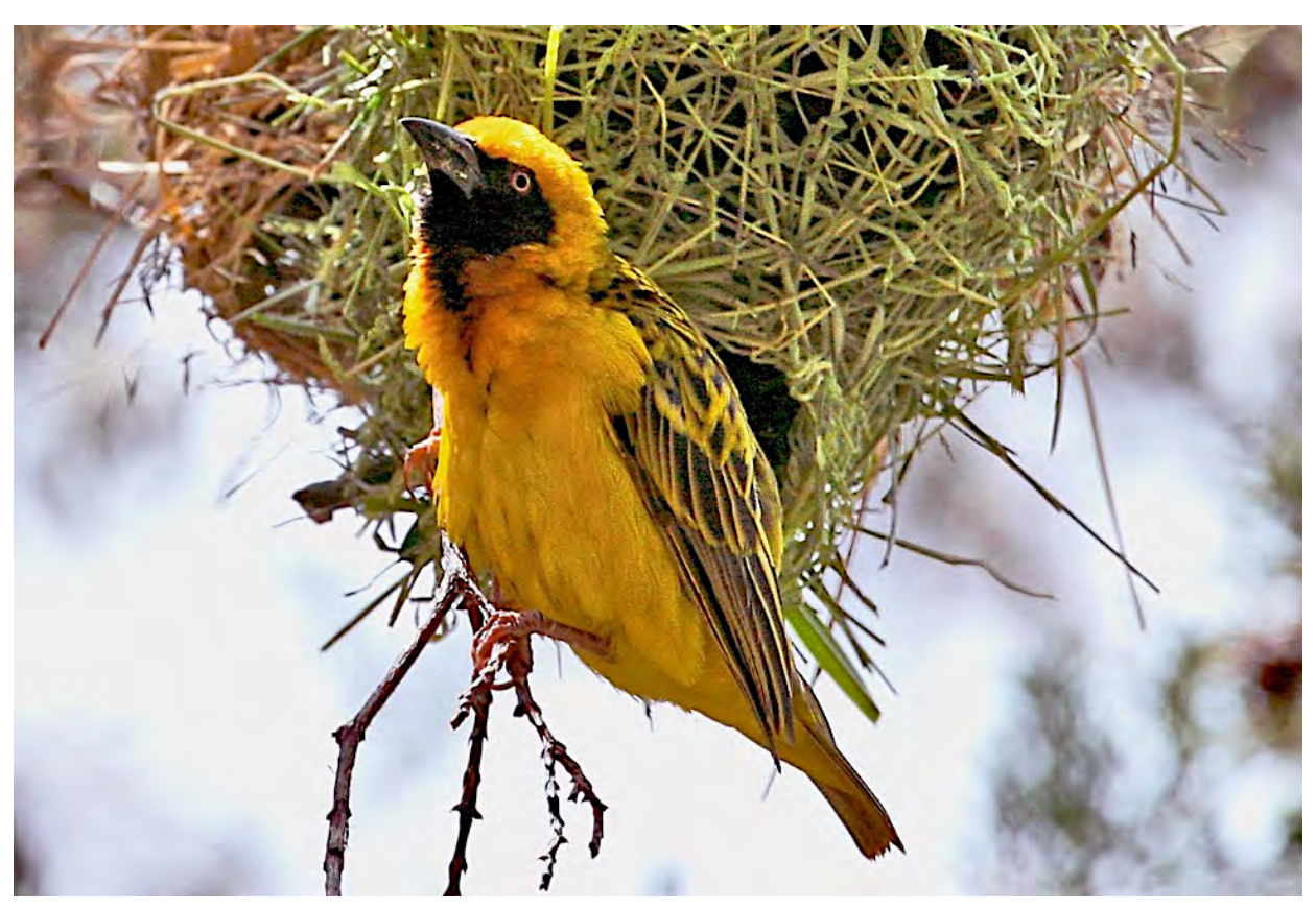
The woven nests of Ploceus weavers are a common sight in the much of Africa. Typical is Speke's Weaver, and we expect to see these attractive birds at their colonies at several locations on the tour.

Common Giraffe. Watch for Lion and Black Rhino among the herds of Common Eland and gazelles. In areas of large Yellow-barked Acacia trees, the 'fever tree' of the early explorers, we may encounter our first mixed species flock, perhaps including Mountain Gray Woodpecker, Black Cuckooshrike, Chinspot Batis, African Paradise-Flycatcher, White-bellied Tit, Yellow-breasted Apalis, Northern Pied-Babbler, and Scarlet-chested Sunbird. Elsewhere on the drive possibilities are Helmeted Guineafowl, Yellow-necked Spurfowl, White-backed Vulture, Crowned and Blacksmith lapwings, Hartlaub's Bustard, Striped, and Gray-headed kingfishers, Kenya (Abyssinian) White-eye, Superb Starling, Long-tailed Shrike, Speke's Weaver, Red-billed Firefinch, and Purple Grenadier. We'll return to our hotel in the late afternoon in time for more birding there. Night at The Residences, Karen Country Club, Nairobi.