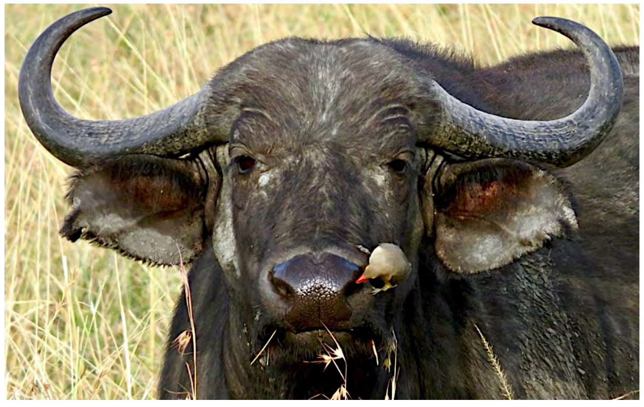
This tour offers a chance to see some of Africa's iconic mammals and birds in wonderful, intimate settings, away from the crowds at the bigger lodges. This African Buffalo with its attendant Red-billed Oxpecker was seen in the Masai Mara on one of our previous departures. Photograph by participant Lucy Tyrell.

We include here information for those interested in the 2024 Field Guides Wild Kenya: A Tented Camp Safari tour: