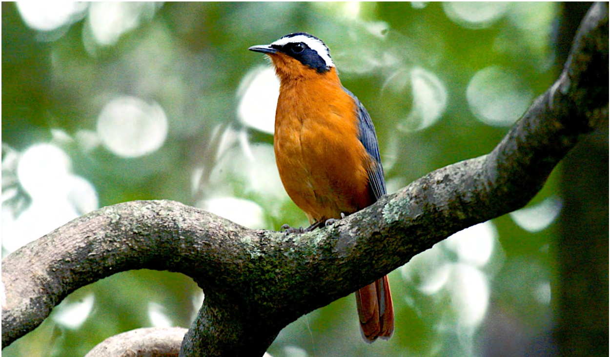
The striking White-browed Robin-Chat is a woodland species that we'll find at the Naro Moru River Lodge.

Day 6, Thu, 31 Jul. To Naro Moru. Today we'll take a picnic lunch and climb out of the Great Rift Valley as we head east to Naro Moru River Lodge – an older type series of rooms and cottages set in attractive gardens along the Naro Moru River. We expect to arrive there by mid-afternoon, and we'll then walk the delightful grounds where flowering shrubs attract as many as nine species of sunbirds. White-browed Robin-Chats sing loudly from thickets, the beautiful African Paradise-Flycatcher is often present, as are Black-backed Puffback and Red-headed Weaver. Tonight we'll sleep to the sound of Tree Hyrax, which call loudly from the riverine forest outside our rooms at Naro Moru River Lodge.