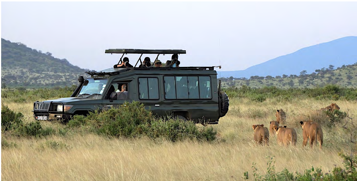
Many animals ignore safari vehicles, allowing us to view them from quite close range at times! We'll spend a lot of time in these vehicles, and you'll need to be able to climb in and out as required.

The mammalian spectacle in East Africa is unsurpassed and the many splendid views of large mammals will constitute a highlight of the tour. It takes repeated visits to actually observe such fascinating behavior as a Cheetah taking down a Thomson's Gazelle, a pride of Lionesses stalking and killing a buffalo, or a secretive Leopard walking a forest trail, but we've seen all these on previous Kenya tours. This safari has a good chance of producing most of the spectacular big game, plus a variety of monkeys, lesser-known species like Giant Forest Hog and Suni, and at night perhaps White-tailed Mongoose or Large-spotted Genet.