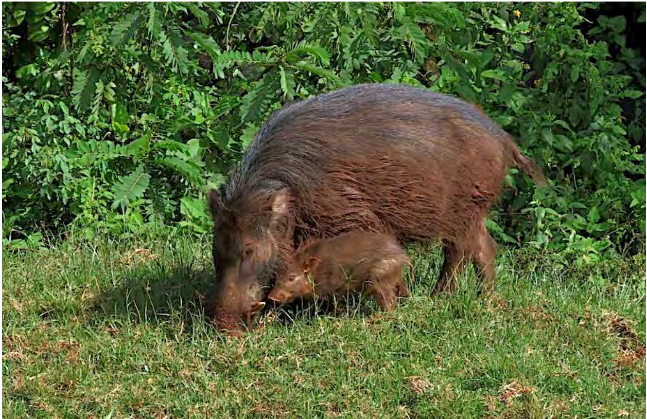
The Giant Forest Hog is a rare mammal in Kenya; we'll watch for them when we visit the Ark in the Aberdare Mountains.

At the Ark itself African Buffalo, Bushbuck, and Defassa Waterbuck, are attracted to the natural mineral lick and watering hole, watch too, for Sykes' Monkeys (along the forest edge) and for the striking Mantled Guereza, whose territorial vocalization is reminiscent of a nearby generator. However, the star mammal here is the massive Giant Forest Hog and we have extremely good chances of seeing at least one! Verreaux's Eagle-Owl sometimes emerge at dusk, and a night overlooking the salt-lick gives us a chance for our first White-tailed or Marsh mongoose, and the cat-like Large-spotted Genet. Night at The Ark.