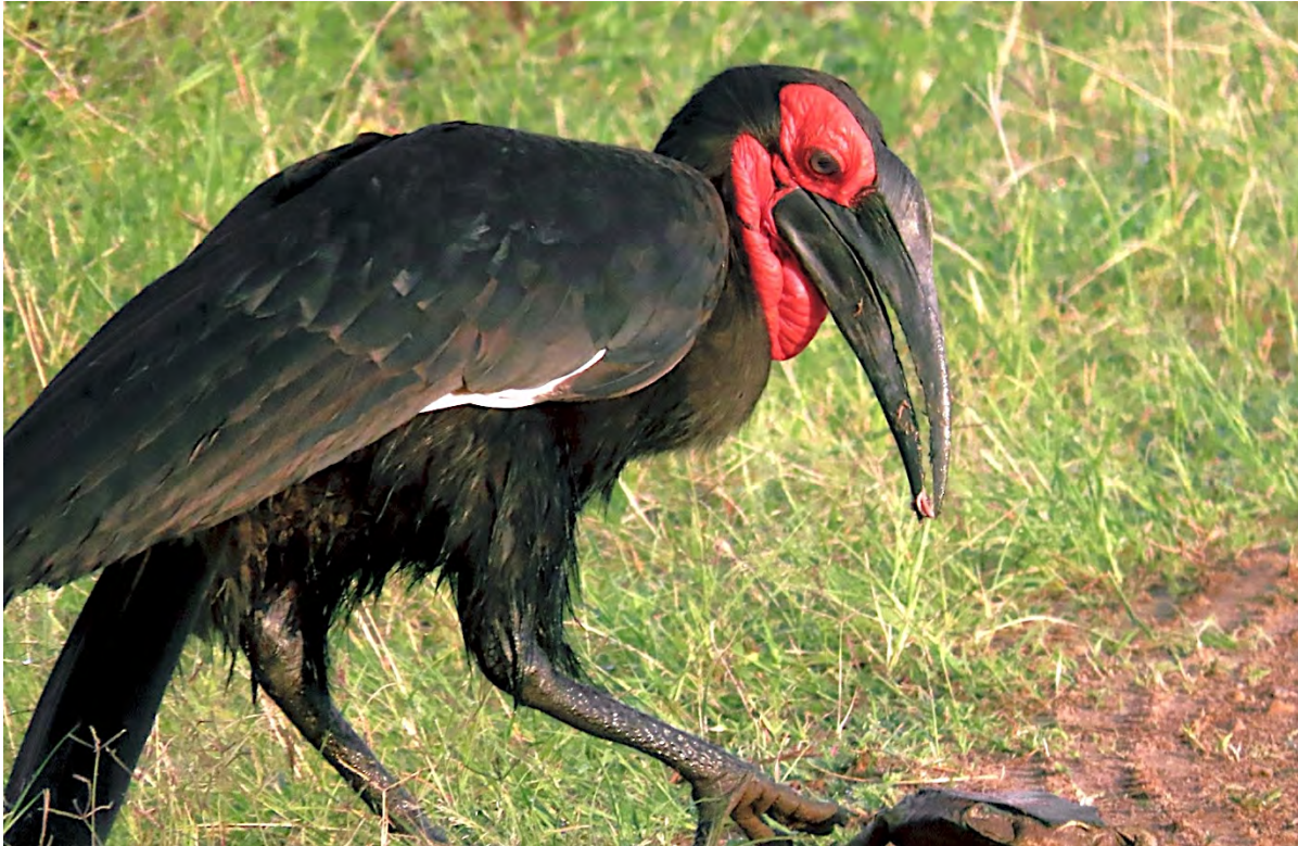
Southern Ground-Hornbill is found in the savannas of southern Kenya. These large birds are cooperative breeders, and can often be seen in small groups. We'll watch for them in the Masai Mara.

Ecologically a part of the Serengeti of Tanzania, the Mara is a land of immense vistas—of vast rolling plains and rounded hills, of scattered acacia woodlands and thornbush thickets, and of luxuriant riparian woodland along the Mara River. In every direction are herds of ungulates, especially Burchell's Zebra, Topi, and Thomson's and Grant's gazelles. Elephant, buffalo, and hyenas are common, and with luck during our stay we could encounter a family of Cheetahs, or a pride of hunting Lions. After arrival, we will transfer the short distance to our camp, and then, after lunch take our open-sided four-wheel drive for our first adventure across the plains. Night at Little Governors' Camp, Masai Mara.