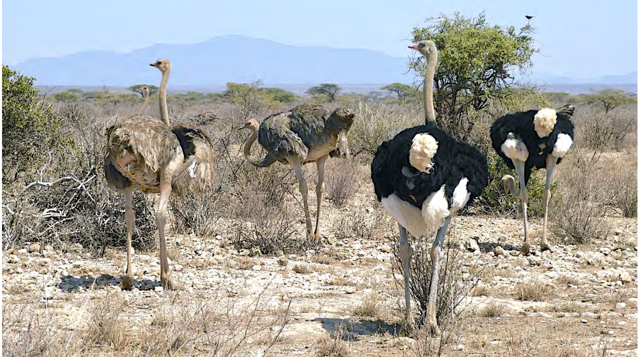
Somali Ostrich is an East African specialty, distinguished from the Common Ostrich by the male's blue neck and legs. We'll watch for these giants when we're at Samburu.

We include here information for those interested in the 2025 Field Guides Wild Kenya: A Tented Camp Safari tour: