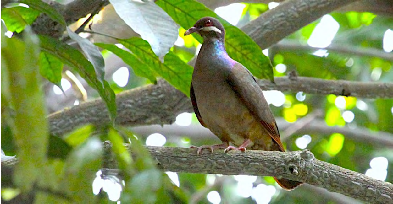
The shy Bridled Quail-Dove is a regional endemic, found from St. Lucia northward to Puerto Rico.

Barbuda —Flat, dry Barbuda is one of the East Caribbean's least-visited islands and is home to one endemic species of bird, Barbuda Warbler. Our day-visit here will be focused on finding this bird, but we should also have the chance to take a boat trip in Codrington Lagoon to visit the largest frigatebird colony in the Lesser Antilles. A visit to Barbuda or Montserrat can be done either by plane or ferry.