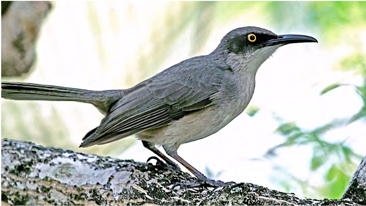
Found on only St. Lucia and Martinique, the Gray Trembler is a unique mimid that we’ll watch for.

Martinique —This is one of two French islands we’ll visit on our trip. We will spend time in the dry, lowland forest of Presqu’île de la Caravelle for the odd White-breasted Thrasher and the beautiful Martinique Oriole. The thrasher, one of the rarest birds in the Caribbean (with possibly fewer than 100 remaining on Martinique), can be found on only two islands—here (where we have the best chance of finding it) and on neighboring St. Lucia.