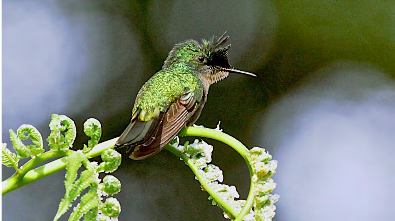
The Antillean Crested Hummingbird is endemic to the Lesser Antilles, and is found on all of the islands. This individual is from Dominica.

We include here information for those interested in the 2020 Field Guides Lesser Antilles tour: