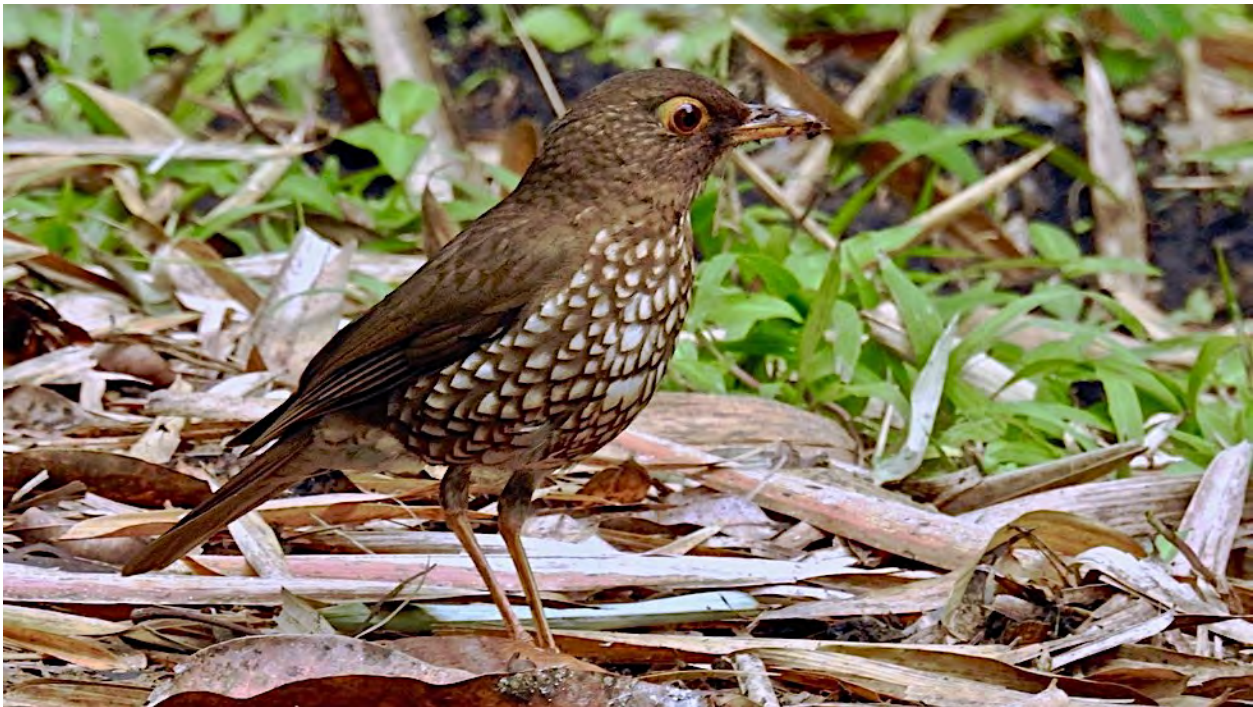
The lovely Forest Thrush is one of our goals when we visit Guadeloupe. They might be found in moist forests on Dominica, Montserrat and St. Lucia as well, but the species is uncommon to rare, and the largest population is found on Guadeloupe.

Day 10, Sat, 12 Dec. Martinique to Guadeloupe. Flight schedule dependent, we may have a morning to sleep-in and relax a bit. We will fly from Martinique to Guadeloupe, get checked-in to our hotel, and explore any nearby forest patches for the endemic woodpecker. Night on Guadeloupe.