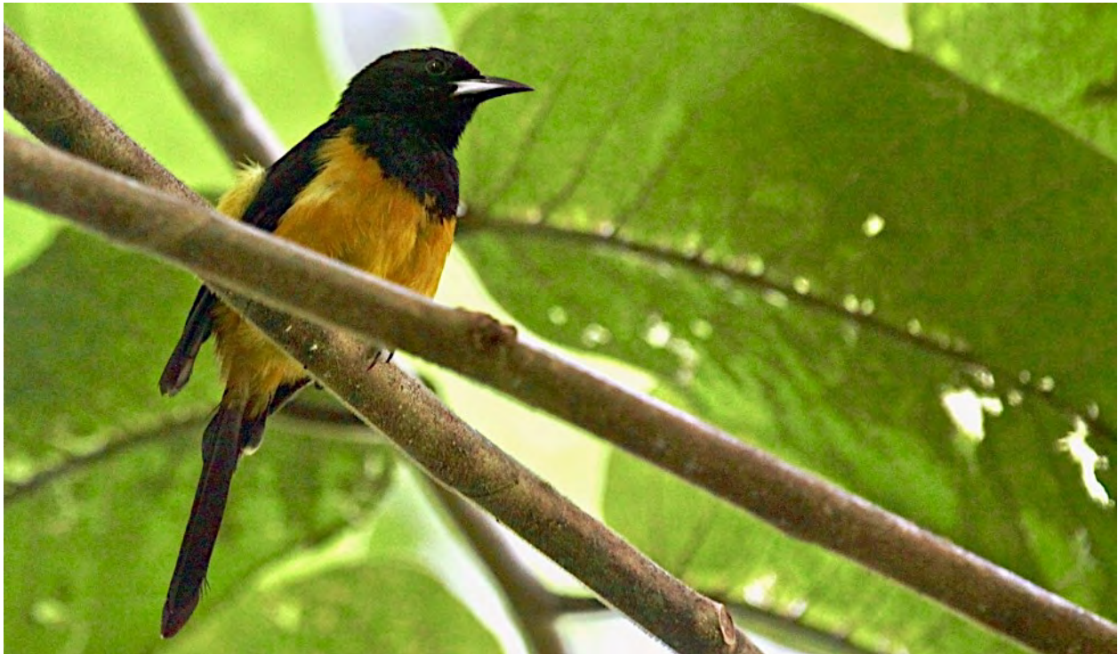
The endemic Montserrat Oriole is threatened by loss of habitat due to volcanic eruptions on the island.

Day 15, Thu, 17 Dec. Day trip to Barbuda. A short flight or longer ferry ride this morning will take us across to the island of Barbuda, home of the endemic Barbuda Warbler. Once we have seen the warbler, we should have sufficient time remaining to make a boat trip to the frigatebird colony in Codrington Lagoon, as well as the cliffs on the islands east coast, where Red-billed Tropicbird is known to breed. We should also have time to check a couple of coastal sites where we may find Least and Roseate terns as well as a variety of shorebirds. We will return to Antigua late in the afternoon either by plane or ferry. Night on Antigua.