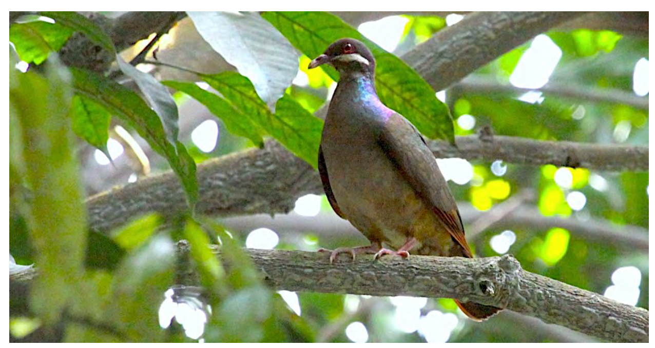
The shy Bridled Quail-Dove is a regional endemic, found from St. Lucia northward to Puerto Rico.

Barbuda —Flat, dry Barbuda is one of the East Caribbean's least-visited islands and is home to one endemic species of bird, Barbuda Warbler. Our day-visit here will be focused on finding this bird, but we should also have the chance to take a boat trip in Codrington Lagoon to visit the largest frigatebird colony in the Lesser Antilles. A visit to Barbuda or Montserrat can be done either by plane or ferry.