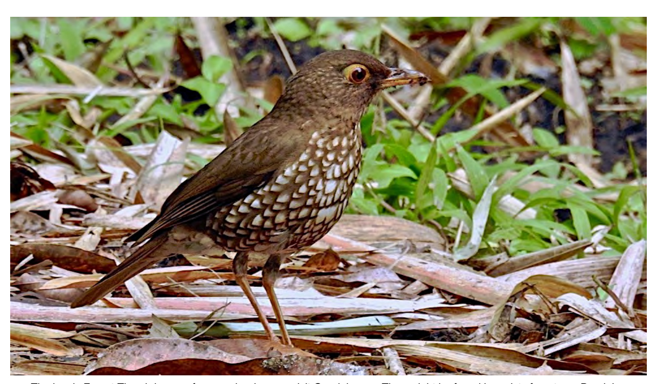
The lovely Forest Thrush is one of our goals when we visit Guadeloupe. They might be found in moists forests on Dominica, Montserrat and St. Lucia as well, but the species is uncommon to rare, and the largest population is found on Guadeloupe.

Day 10, Sun, 14 Apr. Martinique to Guadeloupe. Flight schedule dependent, we may have a morning to sleep-in and relax a bit. We will fly from Martinique to Guadeloupe, get checked-in to our hotel, and explore any nearby forest patches for the endemic woodpecker. Night on Guadeloupe.