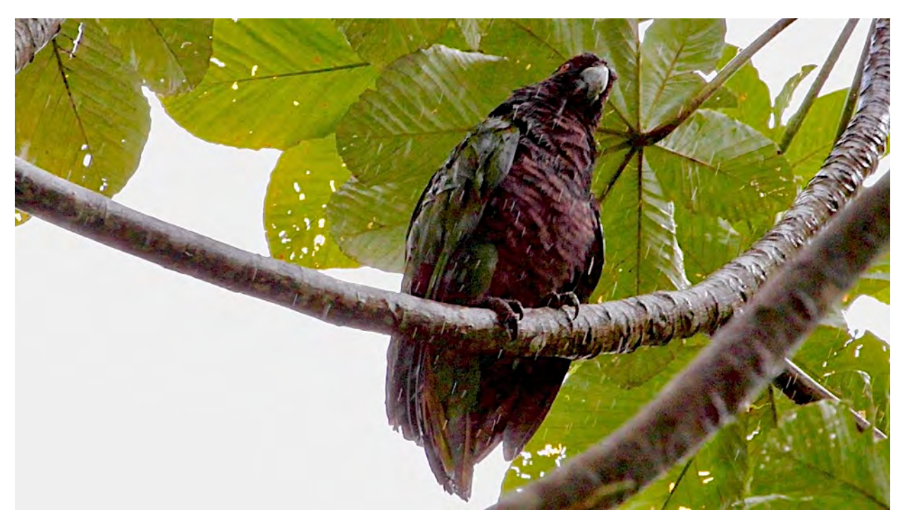
The Imperial Parrot of Dominica is one of the largest of its genus, and one of the rarest. These endangered birds have benefited from conservation work, but are still threatened by hurricanes and habitat loss. This wet individual was seen in 2010, and we had reasonable scope views in 2019.

The natural habitat on most of these islands has been significantly fragmented and altered by human settlement, accounting for the scarcity of many endemic birds. However, conservation efforts on most islands have been very effective and public awareness of the unique nature of this island avifauna has been elevated to new heights. Several species, especially the four Amazona parrots, have greatly benefited. Since good birding habitat is so localized or usually confined to the highlands on most of these islands, a single morning's visit to one trail in appropriate habitat is usually sufficient for seeing all of an island's specialties. This should enable us to be quite flexible with our afternoon schedules, allowing time to laze on a sunny beach or tour other sites on the islands.