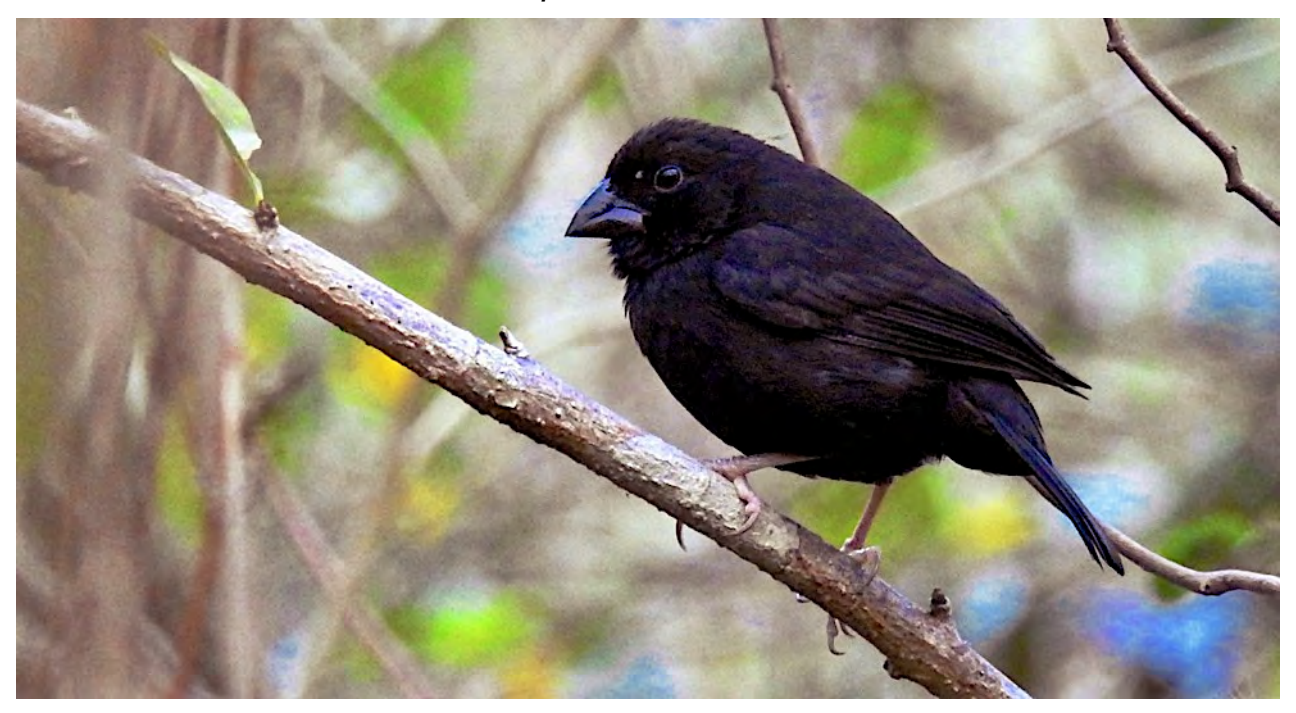
The St. Lucia Black Finch can be difficult to see, but we've been successful on our tours. This is one of five endemic species we will look for on the lovely island of St. Lucia.

We include here information for those interested in the 2024 Field Guides Lesser Antilles tour: