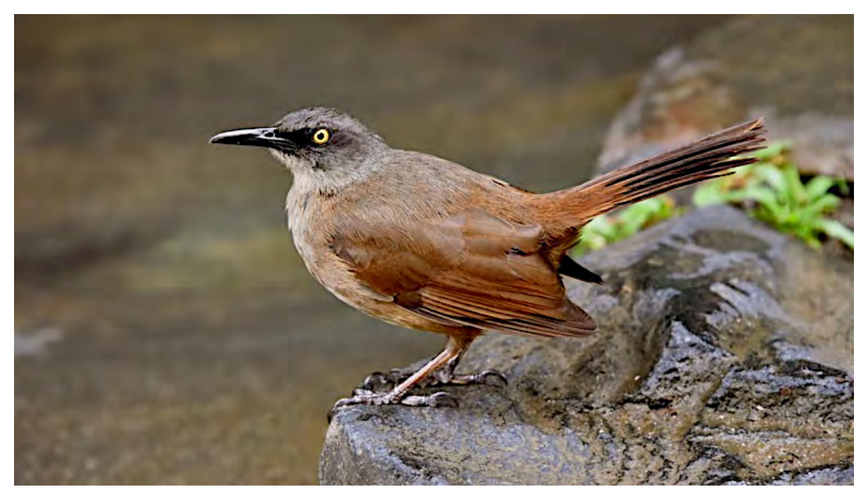
The Brown Trembler is a mimid endemic to the Lesser Antilles.

If you are uncertain about whether this tour is a good match for your abilities, please don't hesitate to contact our office; if they cannot directly answer your queries, they will put you in touch with one of the guides.