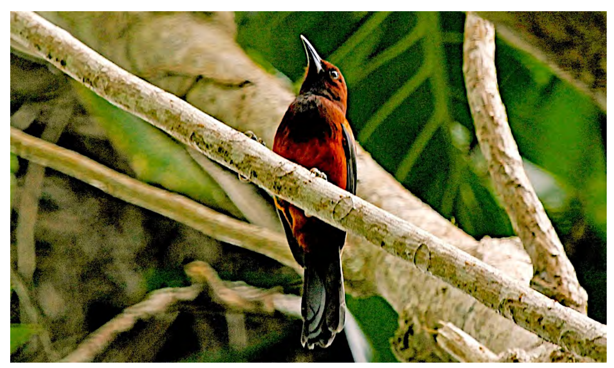
The Martinique Oriole is a distinctive bird that is fairly widespread on the island.

Martinique —This is one of two French islands we'll visit on our trip. We will spend time in the dry, lowland forest of Presqu'ile de la Caravelle for the odd White-breasted Thrasher and the beautiful Martinique Oriole. The thrasher, one of the rarest birds in the Caribbean (with possibly fewer than 100 remaining on Martinique), can be found on only two islands—here (where we have the best chance of finding it) and on neighboring St. Lucia.