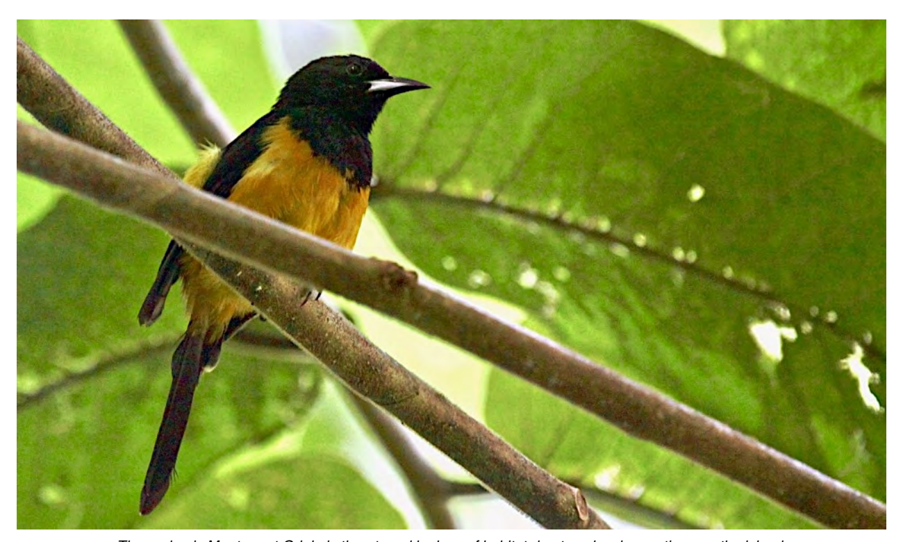
The endemic Montserrat Oriole is threatened by loss of habitat due to volcanic eruptions on the island.

Day 15, Fri, Apr 19. Day trip to Barbuda. A short flight or longer ferry ride this morning will take us across to the island of Barbuda, home of the endemic Barbuda Warbler. Once we have seen the warbler, we should have sufficient time remaining to make a boat trip to the frigatebird colony in Codrington Lagoon, as well as the cliffs on the islands east coast, where Red-billed Tropicbird is known to breed. We should also have time to check a couple of coastal sites where we may find Least and Roseate terns as well as a variety of shorebirds. We will return to Antigua late in the afternoon either by plane or ferry. Night on Antigua.