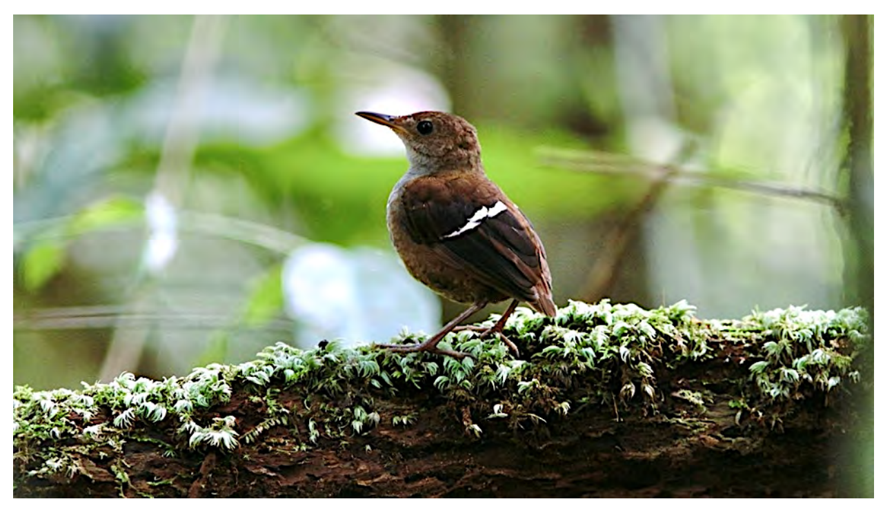
In Jaú National Park, we'll have a chance to find Wing-banded Wren and other small forest-dwellers.

possibility (much more likely heard than seen, but we'll certainly try to be lucky). All five species of kingfishers are around the Anavilhanas and over the next few days, at Jaú National Park. After repositioning during our midday siesta, we'll bird in a different part of the archipelago. There are usually lots of both species of river dolphins (Tucuxi [Gray] and Amazon [Pink]) in this area. Band-tailed Nighthawks, of two different species, will be around us dawn and dusk. Night aboard Dorinha .