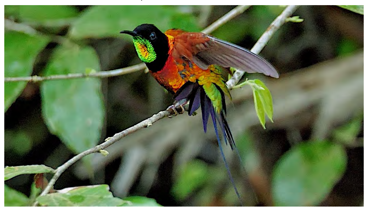
The Fiery Topaz is a spectacular humminabird of the lowland Amazonian forests. We've added a new site near Manacapuru where we should find this beauty.

We include here information for those interested the 2023 Field Guides Rio Negro Paradise: Manaus, Brazil tours: