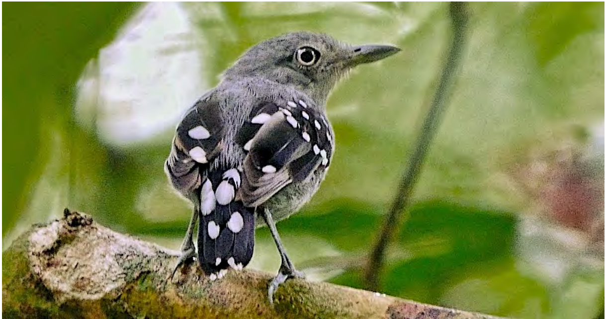
Among the "ant things" we'll watch for is the lovely Pearly Antshrike. We saw this bird well in Jaú National Park in 2023.

Day 10, Thu, 19 Sep. Anavilhanas NP and transfer to Jaú NP. We'll have dropped anchor sometime in the night, just off one of the myriad islands in the middle Anavilhanas Archipelago. This puts us in position for this morning's dawn chorus of antbirds and other species we'll seek, foremost among them Blackish-gray and Black-crested antshrikes, Klages' and Leaden antwrens, Ash-breasted and Black-chinned antbirds, Zimmer's Woodcreeper, Speckled and Rusty-backed spinetails, and Wire-tailed Manakin. We also expect Festive Parrot, Green-tailed Jacamar, Cream-colored and perhaps Ringed woodpeckers, Streak-throated Hermit, and Sneathlodge's Tody-Tyrant. Crestless Curassow is a rare possibility (much more likely heard than seen, but we'll certainly try to be lucky). All five species of kingfishers are around the Anavilhanas and over the next few days, at Jaú National Park. After repositioning during our midday siesta, we'll bird in a different part of the archipelago, watching especially for Amazonian Umbrellabird. There are usually lots of both species of river dolphins (Tucuxi [Gray] and Amazon [Pink]) in this area. Band-tailed Nighthawks, of two different species, will be around us dawn and dusk, and we've had pretty good luck finding a pair of Spectacled Owls in this area, as well. Night aboard Dorinha .