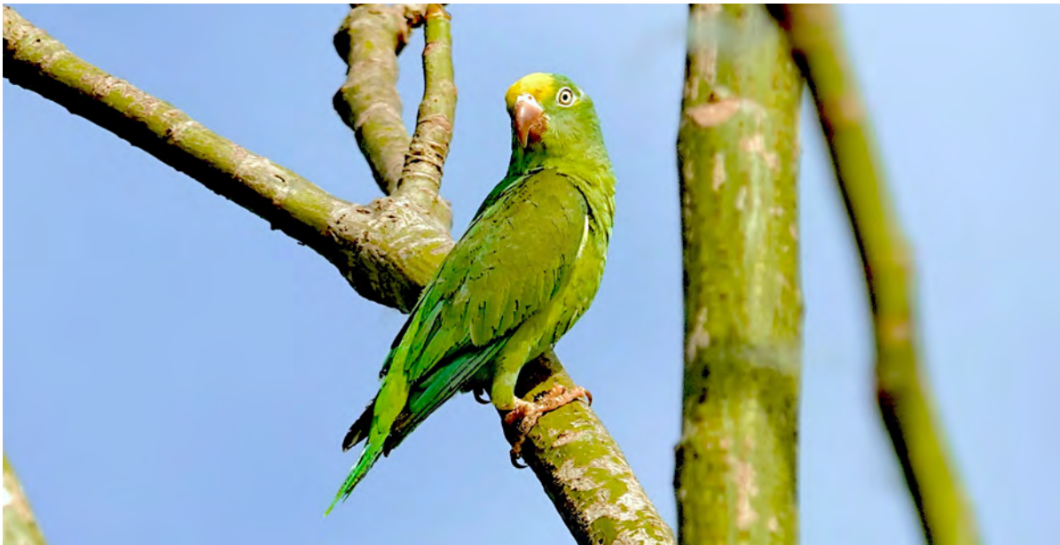
The Tui Parakeet is one of over 20 parrot species we’re likely to see. These small parrots are found in the river-bank forests of the Amazon and Rio Negro.

Day 9, Wed, 18 Sep. Birding the “whitewater” river islands and the Meeting of the Waters. This morning will be all about the “whitewater” avifauna, and species new to our list will be popping up on all sides! The Rio Solimões is “whitewater,” meaning that it is laden with fine silt, and the vegetation is quite different from that will see on upcoming days on the islands of the Anavilhanas. There is a large suite of “island endemics” to be sought on the Solimões and its major whitewater tributaries, such as Varzea Piculet (difficult this far west), Olive-spotted Hummingbird, Green-throated Mango, Castelnau’s Antshrike, Black-and-white Antbird, Lesser Hornero, Dark-breasted, Pale-breasted, White-bellied, Yellow-chinned, Red-and-white, and Parker’s spinetails (not all strictly endemic but whew, that’s a prickly lot of spinetails to absorb!), Brownish Elaenia, Riverside Tyrant, River Tyrannulet, and Pearly-breasted and Bicolored conebills. Short-tailed Parrots and Tui Parakeets will be everywhere, with good numbers of White-winged Parakeets and Chestnut-fronted Macaws around as well. Some years there are hundreds or thousands of Purple Martins in the skies here, having recently arrived on migration from North America.