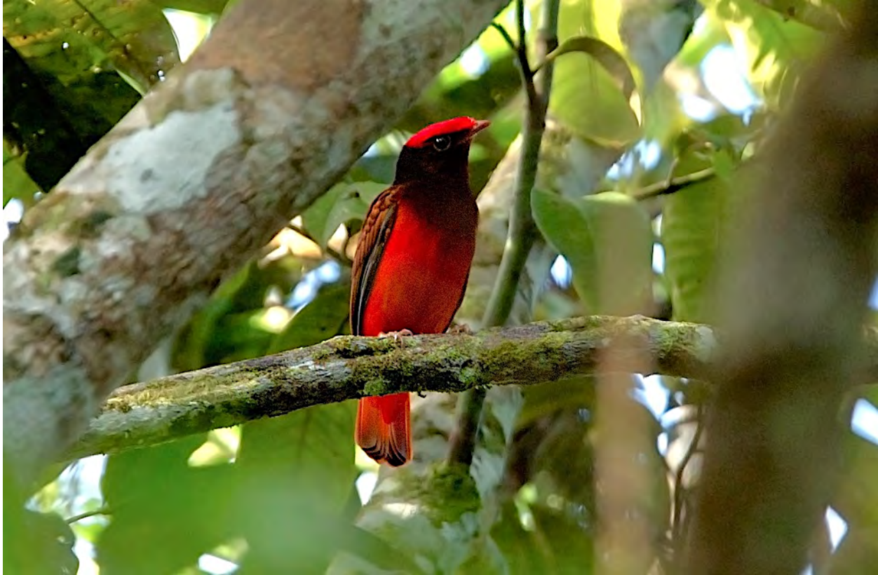
The gorgeous Guianan Red-Cotinga is one of the Guianan Shield specialties we'll watch for in the forests near Manaus.

We include here information for those interested the 2024 Field Guides Rio Negro Paradise: Manaus, Brazil tours: