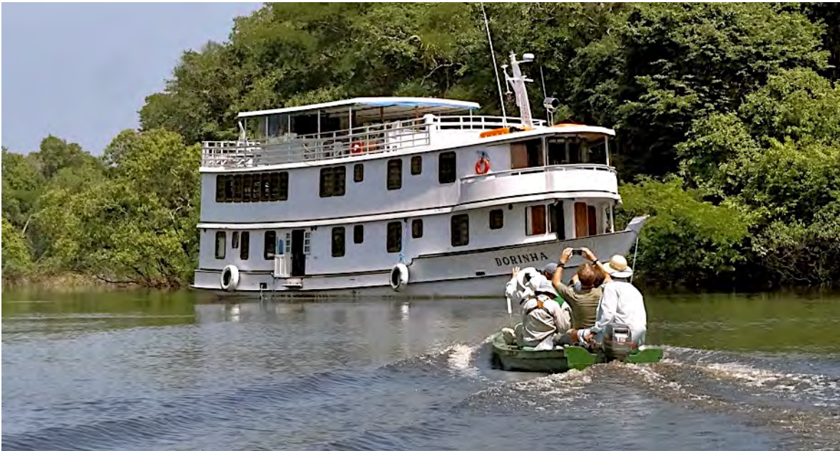
We'll have five days to explore the Rio Negro about the Dorinha. Along the way, we'll make stops so that we can take smaller boats to a number of river islands, and then return to the "mother ship".