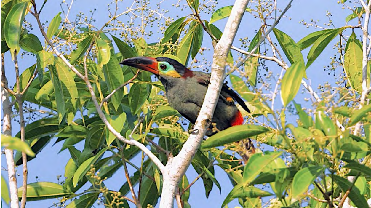
The Guianan Toucanet is one of the Guianan Shield specialties we'll watch for in the forests near Manaus.

We include here information for those interested the 2025 Field Guides Rio Negro Paradise: Manaus, Brazil tours: