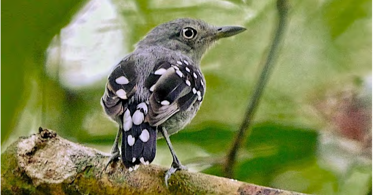
Among the “ant things” we’ll watch for is the lovely Pearly Antshrike. We saw this bird well in Jaú National Park in 2023.

possibility (much more likely heard than seen, but we'll certainly try to be lucky). All five species of kingfishers are around the Anavilhanas and over the next few days, at Jaú National Park. After repositioning during our midday siesta, we'll bird in a different part of the archipelago, watching especially for Amazonian Umbrellabird. There are usually lots of both species of river dolphins (Tucuxi [Gray] and Amazon [Pink]) in this area. Band-tailed Nighthawks, of two different species, will be around us dawn and dusk, and we've had pretty good luck finding a pair of Spectacled Owls in this area, as well. Night aboard Dorinha .