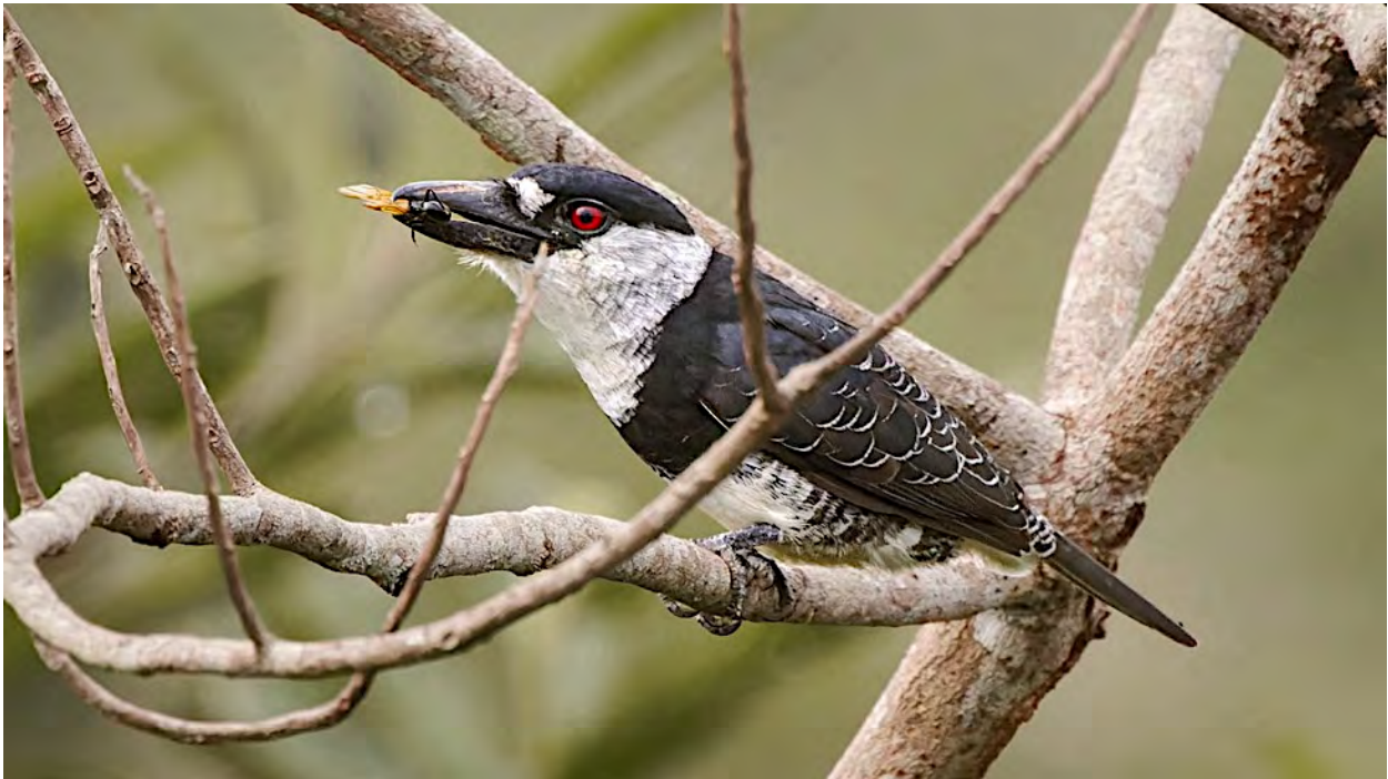
We'll visit the famous INPA tower, where we'll be able to get up in the canopy to see birds much better than we can from ground level. One of these may be the Guianan Puffbird.

This afternoon is special. After a fabulous lunch spread and a little time off, we'll head straight to a lek of Guianan Cock-of-the-Rock. Words cannot describe this bird—it has to be seen to be believed, so that's exactly what we'll do! If we're real lucky, we'll come away with good views of the little-known Pelzel's Tody-Tyrant as well—from the exquisite to the obscure, all fascinating birds! Night in Presidente Figueiredo.