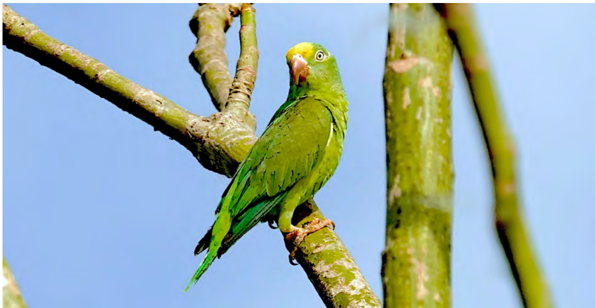
The Tui Parakeet is one of over 20 parrot species we're likely to see. These small parrots are found in the river-bank forests of the Amazon and Rio Negro.

Negro), we'll meet the captain and crew of Dorinha , go over safety protocols, workings of the ship (AC, bar and meals, laundry, etc.). Night aboard Dorinha .