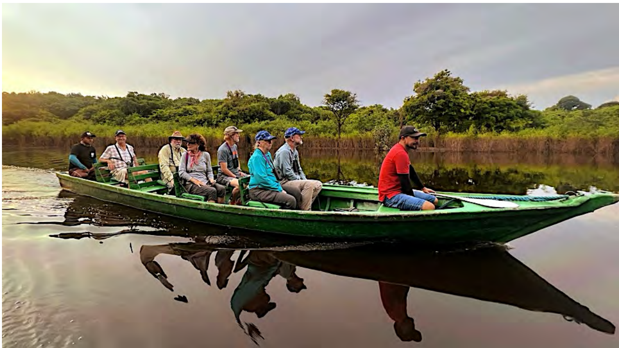
We'll use motorized canoes to get out to the islands and to explore small channels where our large boat cannot go.

If you are uncertain about whether this tour is a good match for your abilities, please don't hesitate to contact our office; if they cannot directly answer your queries, they will put you in touch with one of the guides for the tour.