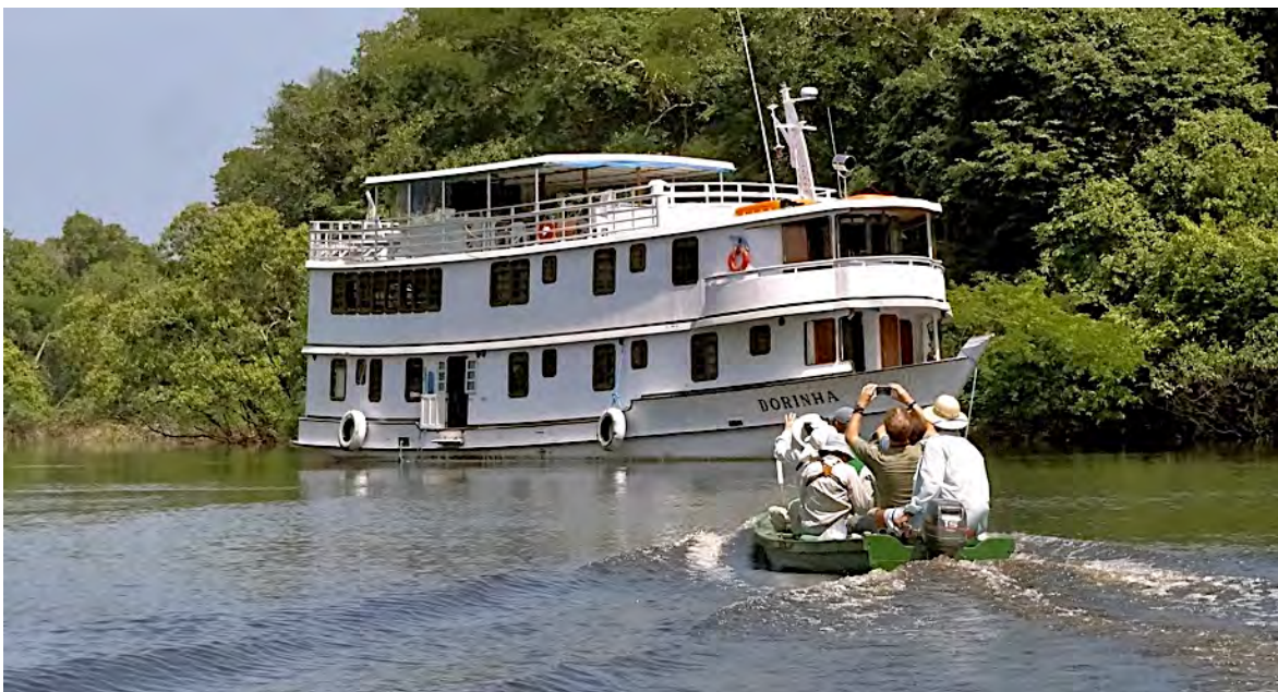
We'll have five days to explore the Rio Negro about the Dorinha. Along the way, we'll make stops so that we can take smaller boats to a number of river islands, and then return to the "mother ship".

Solimões/Amazonas River islands —River islands in the whitewater Rio Solimões are highly dynamic landforms. At the upstream end of the islands, material is constantly being eroded, the flow of the river eating away at the substrate under what is often tall and mature forest that has stood on larger islands for decades. The downstream end of the islands, by contrast, has a marked progression of successional plant stages, from last year's silty tip with its emerging grass and shrubbery to progressively older, mixed stands of cane grass, Cecropias, morning-glory tangles, and other fast-growing vegetation farther back. This early successional plant community harbors a specialized avifauna. Birds unlikely to be found elsewhere on our trip include Ladder-tailed Nightjar, Short-tailed Parrot, Green-throated Mango, Olive-spotted Hummingbird, Scaled, Parker's, White-bellied, and Red-and-white spinetails, Castelnau's Antshrike, Black-and-white Antbird (diminutive and beautiful), River Tyrannulet, Riverside Tyrant, Orange-headed Tanager, and Oriole Blackbird to mention just a few—the islands are very birdy!