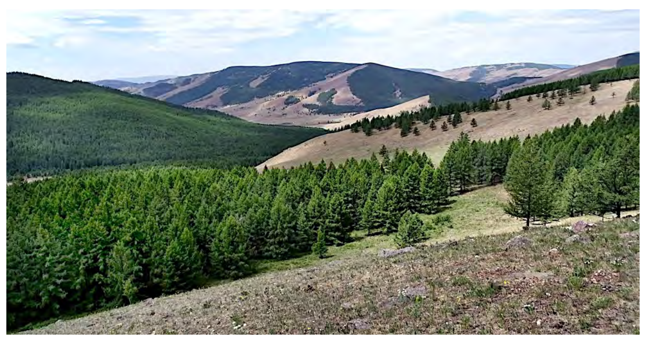
We'll see a wide variety of landscapes on this tour, from the boreal forests at Tumen Khaan, shown here, to the dry steppes of Khustai, dune fields of the Gobi, and some very productive wetlands.

For anyone interested in Asian or Palaearctic birds, or in travel to a very different location, Mongolia has a great deal to offer. It has a tiny population of only three million scattered across a huge area and is one of the least densely settled countries on earth. Happily, and despite the impact of various forms of communism, it is still a true wilderness, where much of the wildlife still remains. The socio-political systems are fast changing, but Mongolia remains a fascinating transition zone of east Asia, where to the north is the southern edge of the great Siberian boreal forest (or taiga), in the centre the seemingly endless steppe and in the south the daunting sands of the Gobi Desert. As if this was not enough, you can then add to the diversity the vast mountains of the Altai, Gobi Altai, Khangay and Khentiy, and a multiplicity of lakes and marshes rich in wildfowl, shorebirds and cranes.