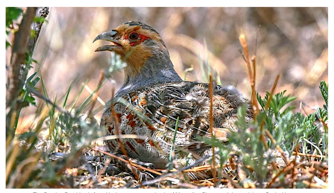
The Daurian Partridge is found in the steppe grasslands of Mongolia.

Khustai (Hustai) Nuruu National Park is where Przewalski's Wild Horse ( Equus przewalskii ) is being re-introduced in the country. Bird species here should include Golden Eagle, Saker Falcon, Cinereous Vulture, Himalayan Vulture, Meadow Bunting, Daurian Partridge, Amur Falcons, Eurasian Hobby, Daurian Jackdaws, Black Stork, and Isabelline Shrike, Mongolian Lark and Meadow Bunting. After extensive birding, we will drive to a small spring where the wild horses drink water.