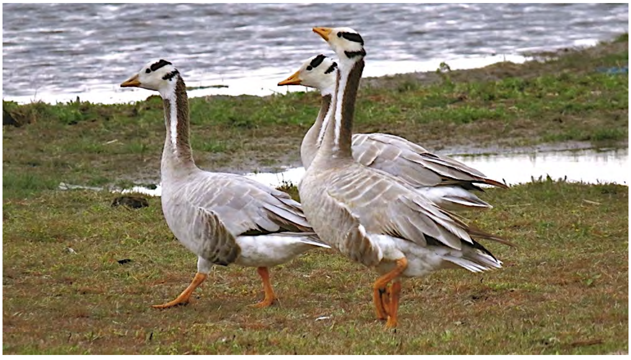
Wetlands such as Elsen Tasarkhai and Ugii Lake provide breeding habitat for Bar-headed Geese and other wetland birds.

We include here information for those interested in this 2023 Field Guides Mongolia: The Gobi Desert, Steppe & Taiga