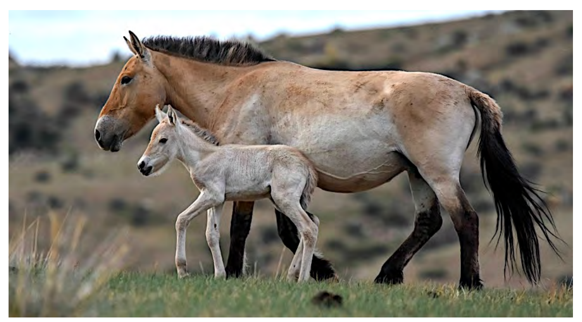
At Khustai National Park, we'll see a re-introduced herd of Przewalki's Wild Horses. These beautiful animals were nearly extinct, but are currently doing well, with about 200 roaming the steppes in Khustai.

Day 6, Thu, 8 Jun. Tumen Khaan area. We will spend today birding boreal forest sites, plus riparian woodland looking for Red-throated Thrush, Lesser-spotted and White-backed Woodpecker, and maybe roosting Ural Owl. Overnight at Tumen Khaan.