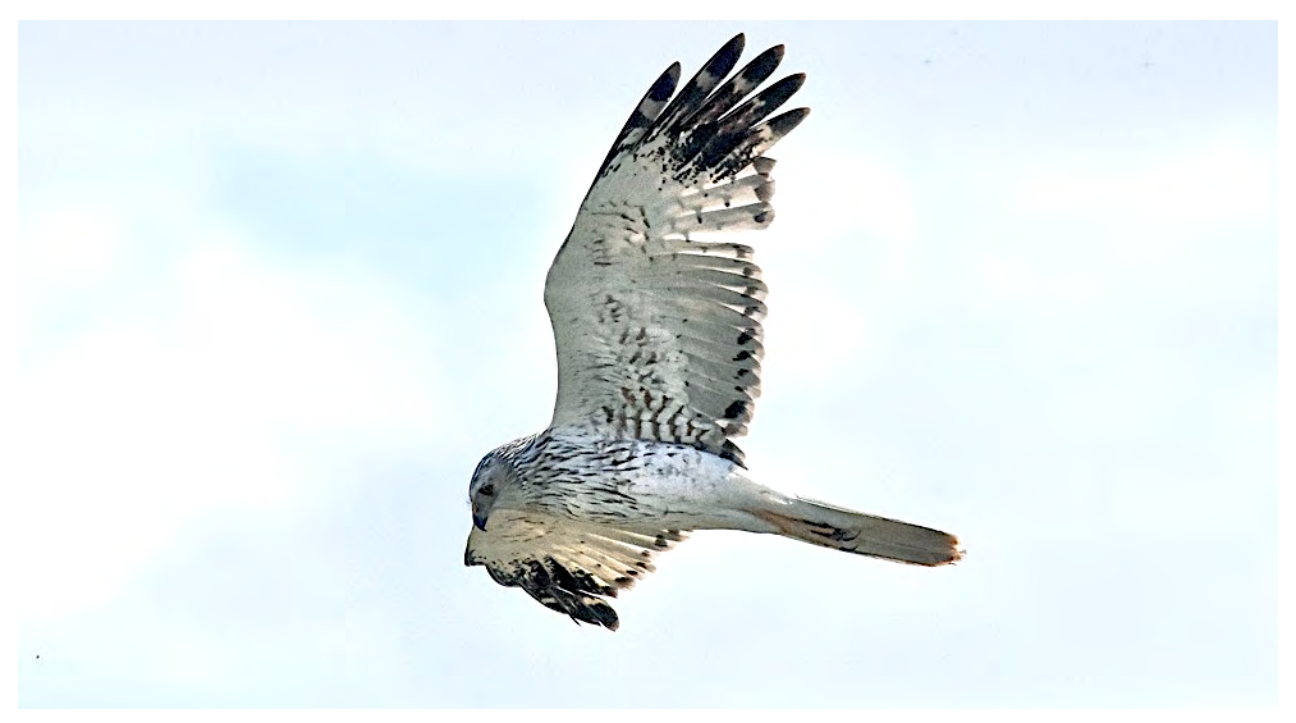
One of the raptors we'll watch for is the Eastern Marsh-Harrier. Like other harrier species, these birds are frequently seen in marshy areas.

We will then drive to the east to get to sand dunes and a wetland in the middle of a steppe area. We should see the breeding Arctic (Black-throated) Loon/Diver, Eastern Marsh Harrier, White-naped Crane, Bar-headed Goose, Oriental Reed Warbler and Chinese Spot-billed Duck in ponds with reeds, with a chance of Asian Dowitcher. Here we'll stay in a simple clean tourist camp at Hoyor Zagal, which may now have en-suite gers available.