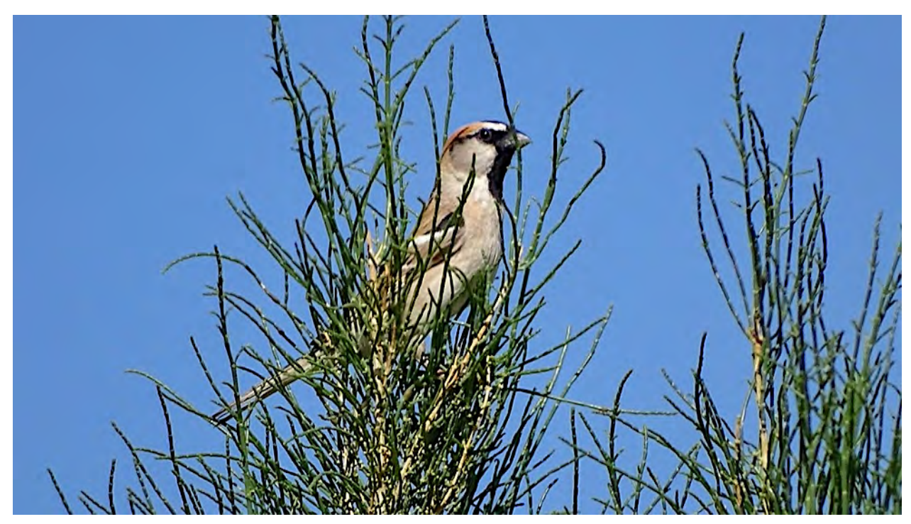
The Saxaul Sparrow is found in a patchy distribution across central Asia, in association with the Saxaul tree, a small, desert-adapted shrub.

Day 15, Sat, 17 Jun. Khongoryn Els - Gobi desert sand dunes and saxaul forest. We have a long drive today on dusty tracks, but will make stops for any interesting birds or scenery along the way. We will arrive at our next location, the famous dunes of Khongoryn Els, in the afternoon. We will find many of the Gobi species here, including, Desert Wheatear, Asian Desert Warbler, Henderson's Ground Jay, Saxaul Sparrow, Long-legged Buzzard, and Great Grey Shrike. The remainder of the day is free to relax following the drive. Overnight Gobi Erdene ger camp, hopefully staying in the new en-suite cabins there!