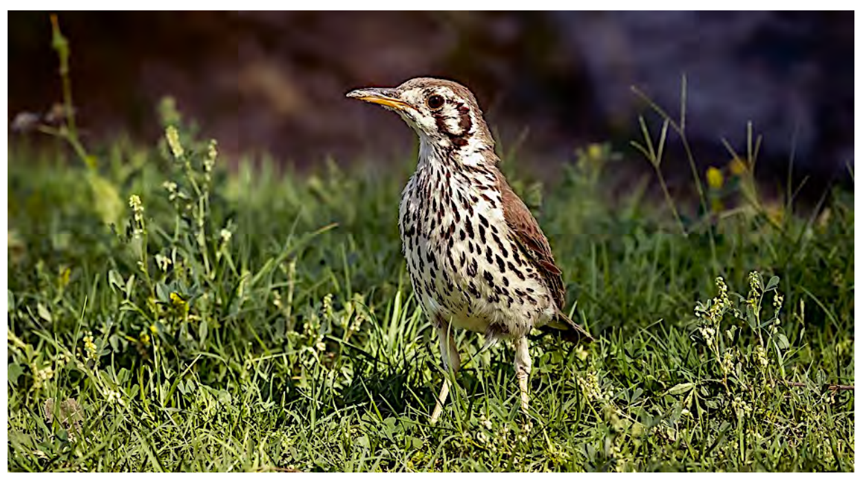
The Groundscraper Thrush is reminiscent of many thrushes, and has similar habits; it is primarily terrestrial and looks for prey in fallen leaves and other detritus. It is found in grasslands and open woodlands in much of southern Africa.

Nights at Okaukuejo and Halali Park Department bungalows (within the park), and at Mokuti Etosha Lodge or Mushara Lodge (outside the park) as we traverse the area from west to east.