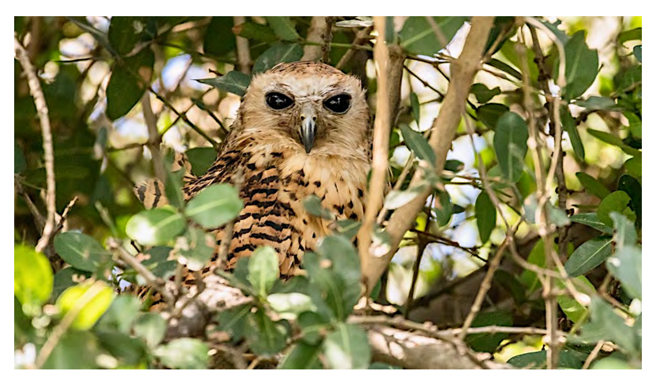
Pel's Fishing-Owl is one of the star birds of this tour. We've gotten some great views of this rather shy nocturnal hunter when we visit the Okavango Panhandle.

After a picnic lunch in the park, we'll cross the border (usually a simple procedure) and transfer to our very pleasant camp, isolated on a peninsula within the "panhandle." During two nights, we'll be birding and mammal viewing both on foot and from boats. The woodlands immediately around the camp are good for Meyer's Parrot, Green Woodhoopoe, Woodland Kingfisher, Crested Barbet, Golden-tailed and Bennett's woodpeckers, African Golden Oriole, Terrestrial Brownbul and Ashy Flycatcher. While the wetlands are excellent for hippos and crocodiles, and if we are lucky, the rare Sitatunga (a swamp-dwelling antelope with long splayed hooves which allow it to move through the floating vegetation without sinking). In addition to many water birds which may include African Pygmy-goose, African Fish-Eagle and Lesser Jacana, we'll be checking overhanging trees for White-backed Night-Heron (a real super-skulker) and the reed beds for Greater Swamp-Warbler, Chirping Cisticola and Southern Brown-throated Weaver. Our main target, however, will be the enormous Pel's Fishing-Owl—for many birders, one of the most wanted birds in the whole of Africa! Nights at Xaro Lodge or Drotsky's Lodge.