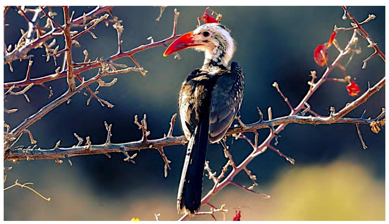
The Damara Red-billed Hornbill is a near endemic that we'll watch for when we visit the Erongo Mountains.

Day 8, Mon, 4 Nov. The southern Erongo Mountains. Early this morning we will begin our search for the elusive Herero Chat (one of the region's most difficult endemics), and then, as the day progresses, we'll bird the rocky arid bush country and perhaps a dry river bed as we look for Red-billed Francolin, Lanner Falcon, Monteiro's and Damara Red-billed hornbills, Rueppell's Parrot, White-tailed Shrike, Bokmakierie, Carp's Tit, Rockrunner, Burchell's Starling and White-throated Canary. Night at Hohenstein Lodge, near Usakos.