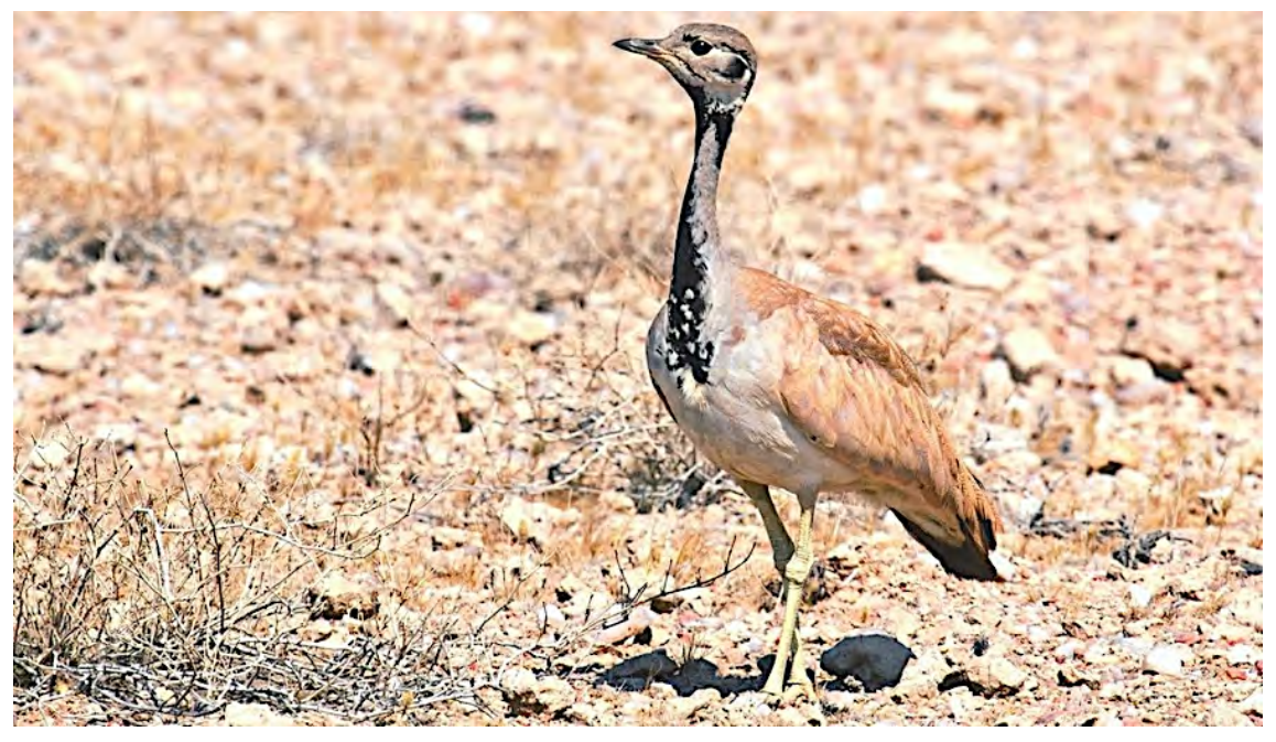
Rueppell's Bustard is a near-endemic, with a range from western Namibia to southern Angola, where it is found in dry, gravelly places such as the Namib Desert.

If you are uncertain whether this tour is a good match for your abilities, please don't hesitate to contact our office; if they cannot directly answer your queries, they will put you in touch with the guide.