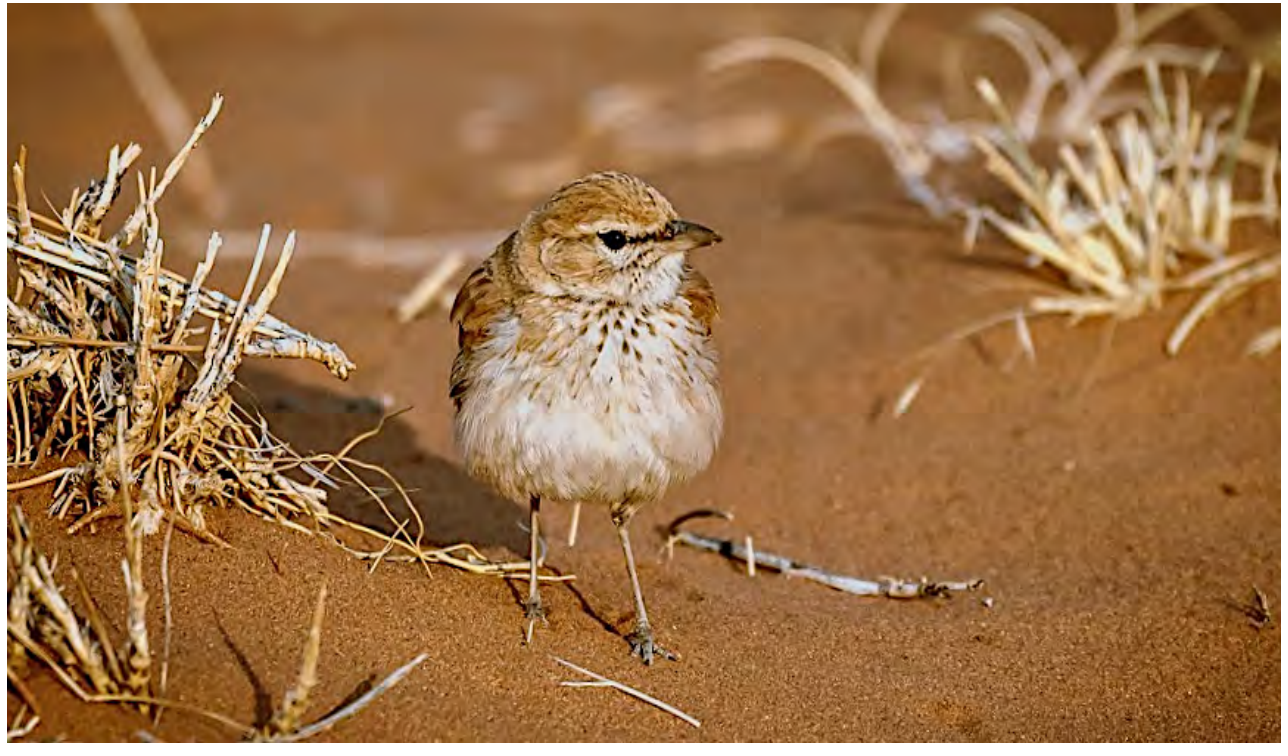
The Dune Lark is one of the endemics we'll seek on this tour. These birds are found in a small part of Namibia's coastal plain, where there is little vegetation, and it is often very sandy and dry. We'll seek this special bird in the red sands of Sossusvlei.

We include here information for those interested in the 2024 Namibia & Botswana tours: