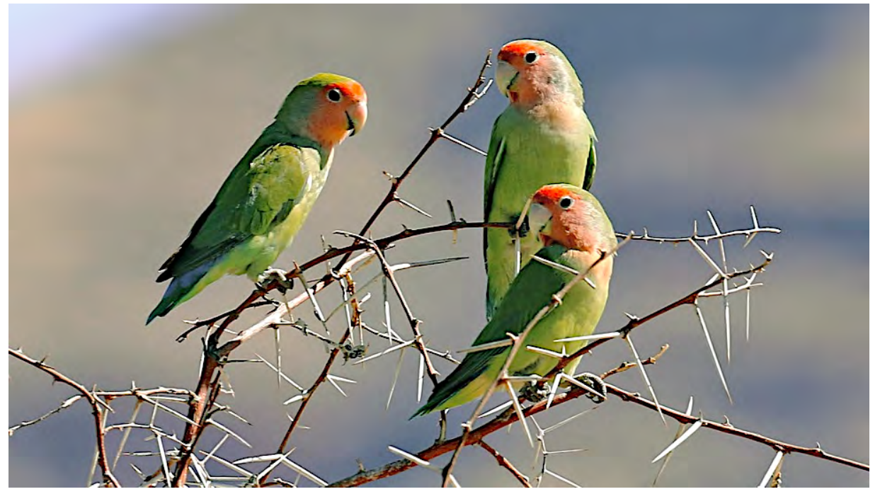
Rosy-faced Lovebird is a near-endemic, with a range from southern Angola through the arid woodlands of Namibia. We'll find these hardy little parrots near Omaruru.