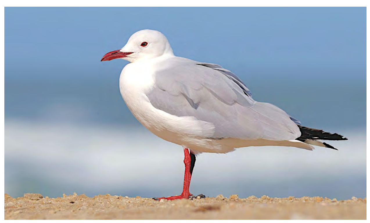
Hartlaub's Gull is a small gull endemic to the west coast of South Africa and Namibia. We'll see them when we visit Walvis Bay and Swakopmund.

A short distance to the east of the dunes is an area of gravel plains cut here and there by small, lightly wooded, dry river beds. We'll search this area for Burchell's Courser, Namaqua Sandgrouse, Pygmy Falcon, Speckled Pigeon, Ashy Tit, Yellow-bellied Eremomela, Mountain Wheatear, Dusky Sunbird, White-throated Canary, Cape Sparrow, and Scaly Weaver (Scaly-feathered Finch). Night at Desert Hills Lodge or Namib Desert Lodge.