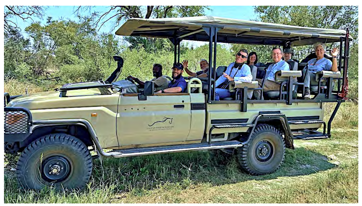
In the Okavango, we'll travel in safari vehicles which allow us to get great views of the wildlife, but they also require a certain degree of dexterity to get into and out of.

If you are uncertain whether this tour is a good match for your abilities, please don't hesitate to contact our office; if they cannot directly answer your queries, they will put you in touch with the guide.