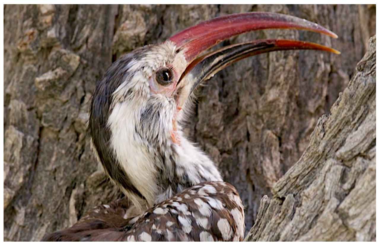
The Damara Red-billed Hornbill is a near endemic that we'll watch for when we visit the Erongo Mountains.

Day 8, Tue, 22 Apr. or 4 Nov. The southern Erongo Mountains. Early this morning we will begin our search for the elusive Herero Chat (one of the region's most difficult endemics), and then, as the day progresses, we'll bird the rocky arid bush country and perhaps a dry river bed as we look for Red-billed Francolin, Lanner Falcon, Monteiro's and Damara Red-billed hornbills, Rueppell's Parrot, White-tailed Shrike, Bokmakierie, Carp's Tit, Rockrunner, Burchell's Starling and White-throated Canary. Night near Usakos.