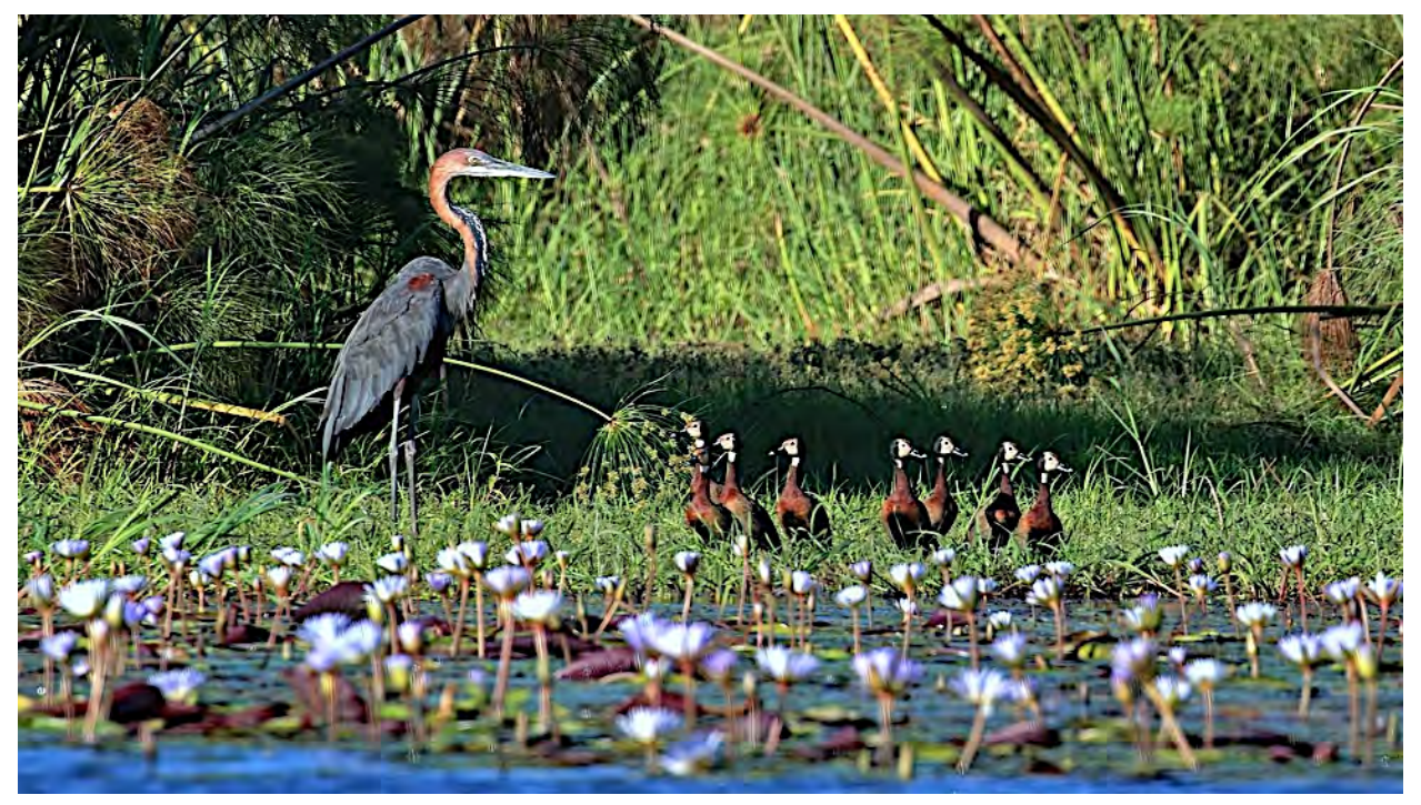
The Okavango Delta in Botswana is one of Africa's special places. Here, we'll see the immense Goliath Heron and many other waterbirds, including White-faced Whistling Ducks.

April 15-May 4, 2025 October 28-November 16, 2025