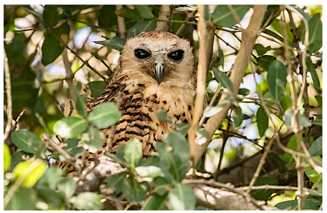
Pel's Fishing-Owl is one of the star birds of this tour. We've gotten some great views of this rather shy nocturnal hunter when we visit the Okavango Panhandle.

Woodland Kingfisher, Crested Barbet, Golden-tailed and Bennett's woodpeckers, African Golden Oriole, Terrestrial Brownbul and Ashy Flycatcher. While the wetlands are excellent for hippos and crocodiles, and if we are lucky, the rare Sitatunga (a swamp-dwelling antelope with long splayed hooves which allow it to move through the floating vegetation without sinking). In addition to many water birds which may include African Pygmy-goose, African Fish-Eagle and Lesser Jacana, we'll be checking overhanging trees for White-backed Night-Heron (a real super-skulker) and the reed beds for Greater Swamp-Warbler, Chirping Cisticola and Southern Brown-throated Weaver. Our main target, however, will be the enormous Pel's Fishing-Owl—for many birders, one of the most wanted birds in the whole of Africa! Nights at Xaro Lodge or Drotsky's Lodge.