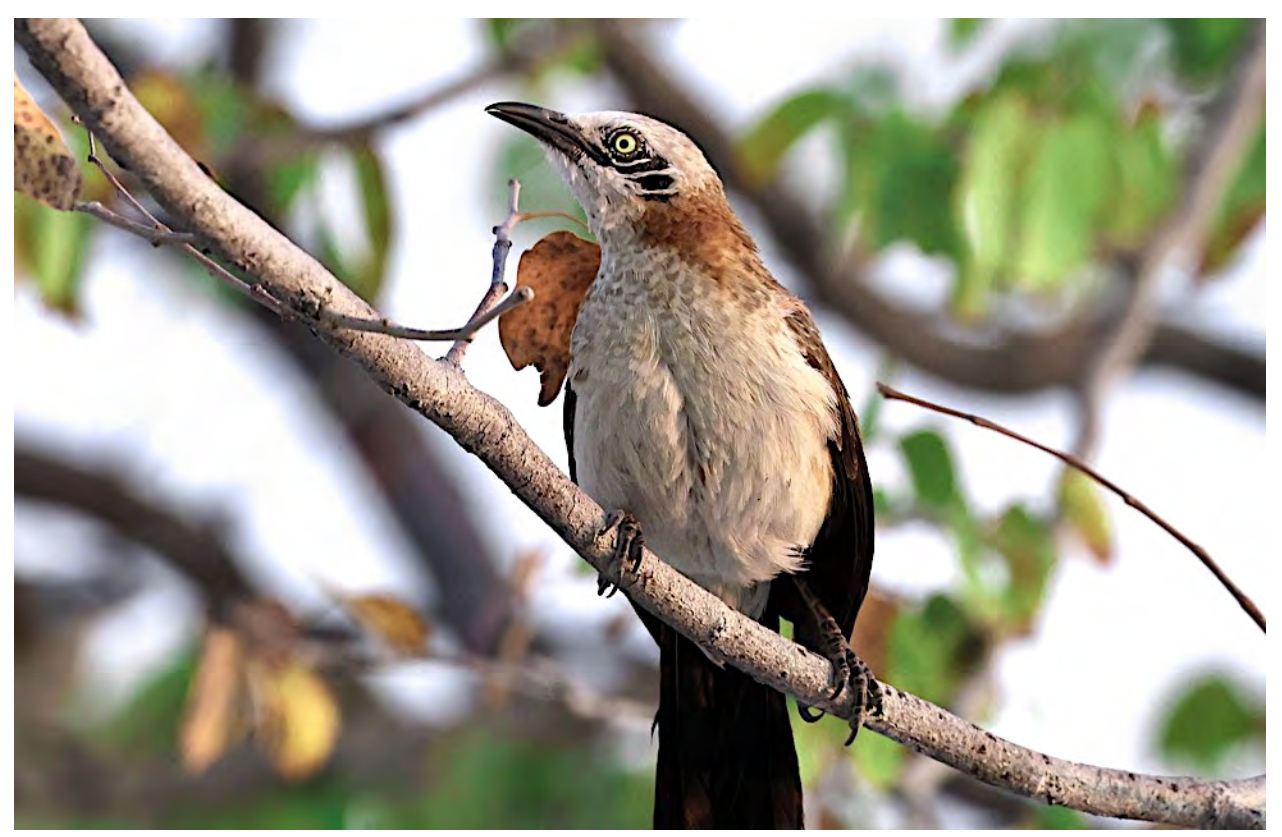
Bare-cheeked Babbler is another near-endemic that we'll watch for. These birds tend to be found in family groups, and we've had good luck in seeing them at Etosha.

Nights at Okaukuejo and Halali Park Department bungalows (within the park), and at Mokuti Etosha Lodge or Mushara Lodge (outside the park) as we traverse the area from west to east.