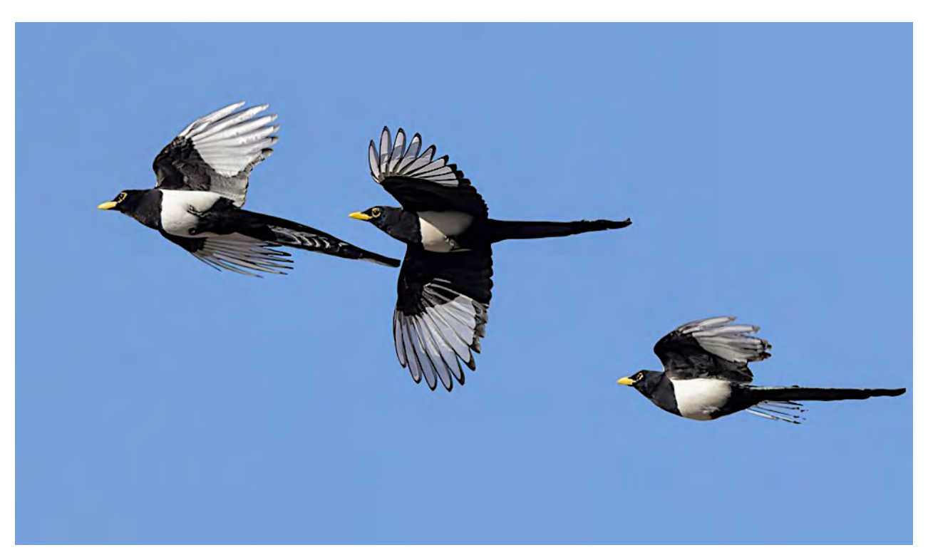
Yellow-billed Magpie is a California endemic found in the oak savannahs of the Central Valley.

We'll spend the remainder of the trip exploring the San Francisco Bay Area in depth. In summer, coastal fog comes in off the ocean and is caught by the coast slopes, often only passing through the famous Golden Gate or low passes in the hills. This creates an incredible moisture gradient, giving each region of the Bay Area a different climate and habitat type. We will be covering the rocky coast, coast slope, San Francisco Bay itself, as well as the inland Diablo range—each with different avifaunas. The diversity within the Bay Area makes for great birding. A highlight will be a pelagic trip to the rich waters of the Pacific, where our main quest will be a diversity of seabirds, from shearwaters, to storm-petrels, phalaropes, and yes, even a Black-footed Albatross. Most common at this time of year are Sooty and Pink-footed shearwaters, Common Murre, Cassin's (if there is krill) and Rhinoceros auklets, and who knows what else—the ocean always holds surprises. Mammal watching tends to be spectacular during our pelagic trip.