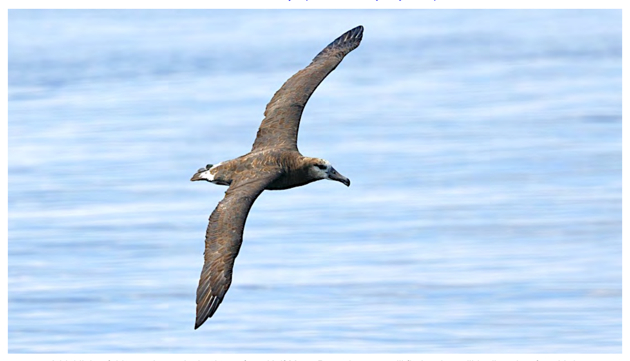
A highlight of this tour is a pelagic trip out from Half Moon Bay, where we will find an incredible diversity of seabirds. Black-footed Albatross is one of the possibilities. These birds breed on Midway Atoll, but spend much of their time cruising the Pacific, including the coast of California.

These two departures run the route in different order. Click on the dates above to jump to the itinerary for your departure.