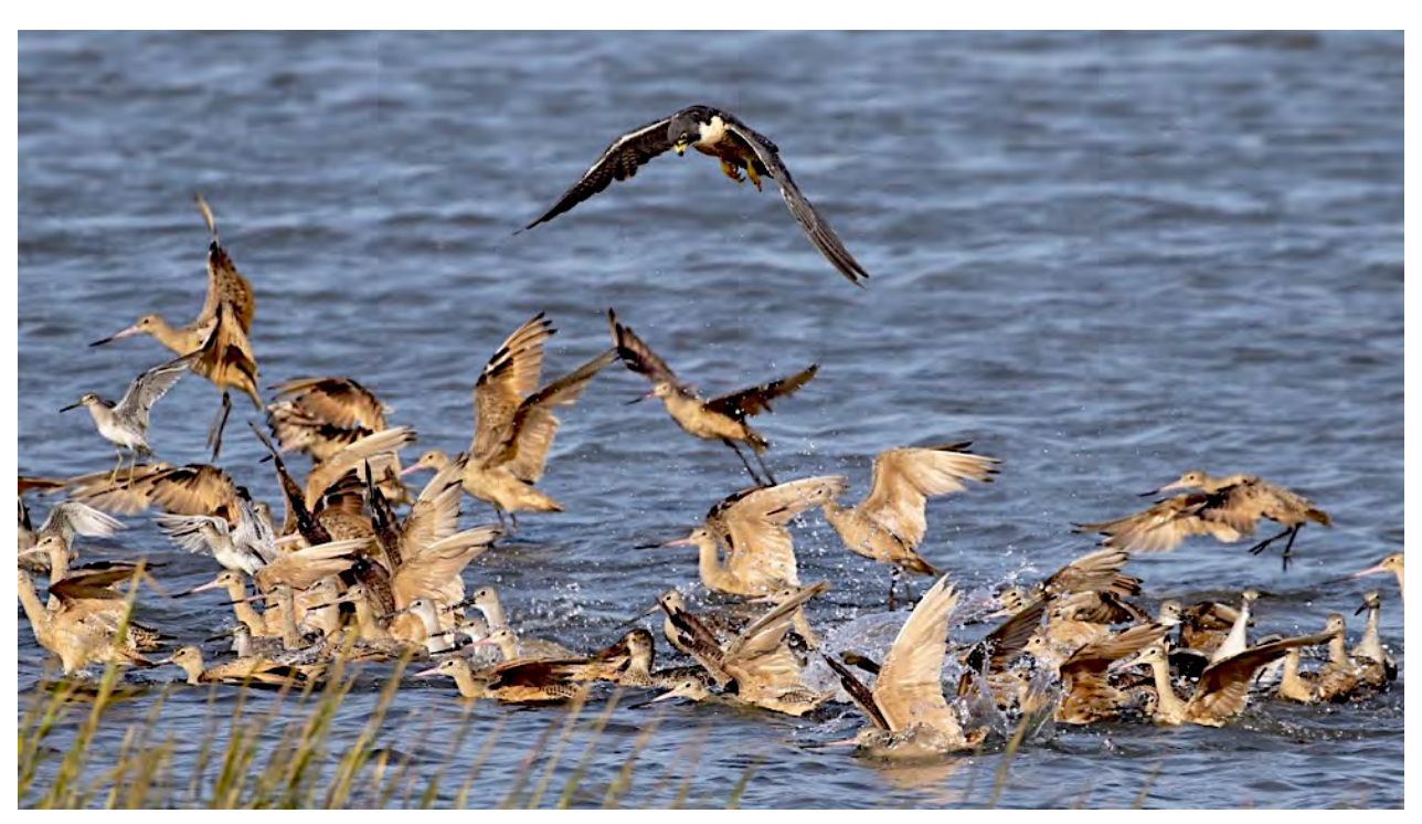
The wetlands of California's central coast attract many shorebirds, which in turn attract predators such as the Peregrine Falcon. We'll watch for dramatic scenes like this as we bird this area.

Coastal birding throughout the county might reveal Pacific Loons, Western Grebes, or Surf Scoter, or maybe some shorebirds such as Willet, Marbled Godwit, and Snowy Plovers. Other common coastal birds include Brown Pelican, Brandt's and Pelagic cormorants, and Western and Heermann's gulls. As shorebirds will be heading south at this time of year, we will make sure to visit some great shorebirding sites in the Bay Area.