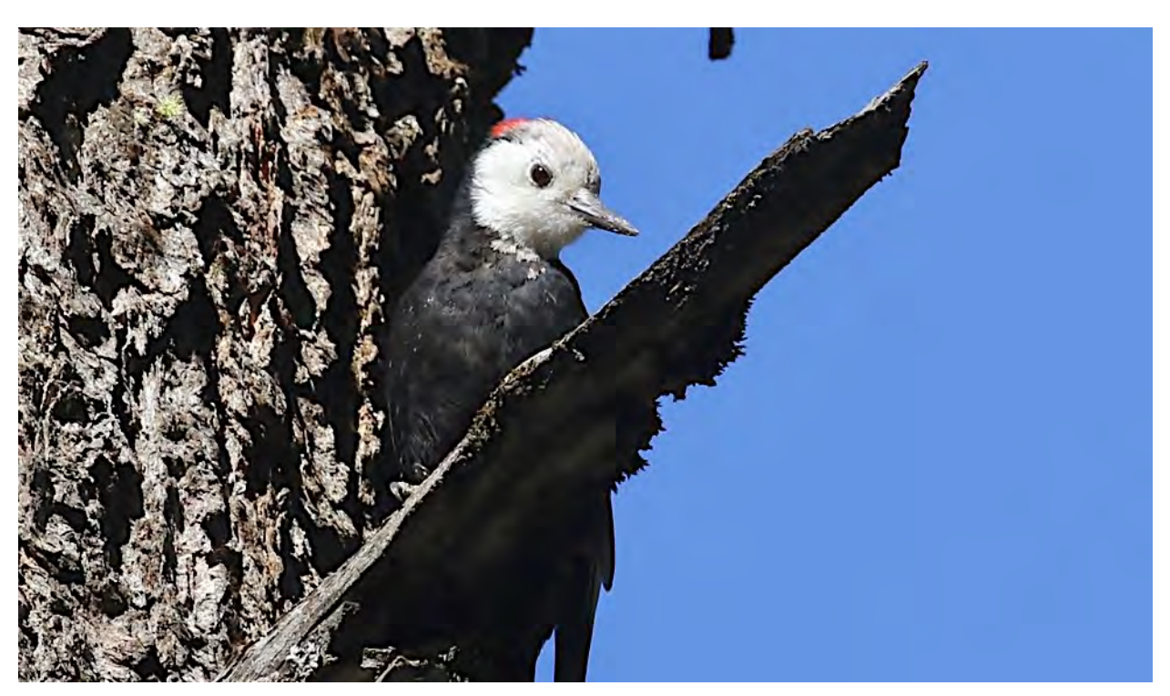
The distinctive White-headed Woodpecker is a specialty of coniferous forests of the far western US. We'll look for them when we visit the Calaveras Big Trees State Park.

Day 10, Sat,13 Sep. Departure for home. We'll leave for the airport this morning (about thirty minutes away) at around 8:00 a.m. (for 11:00 a.m. flights). If you plan to leave later (or earlier), you may take a taxi to the airport (around $70). Have a safe trip!