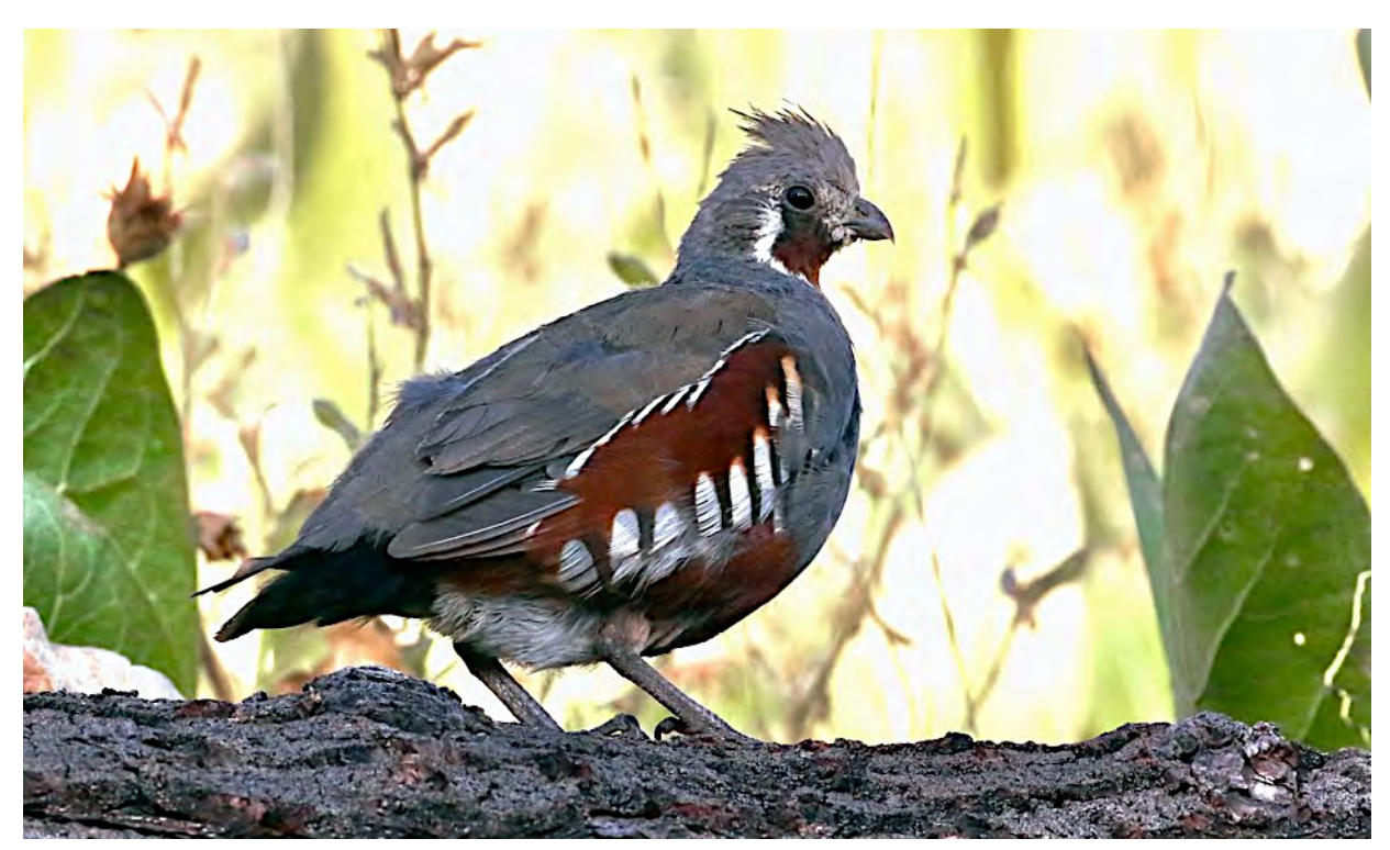
The enigmatic Mountain Quail is one of our targets in the higher elevations of the Sierra.