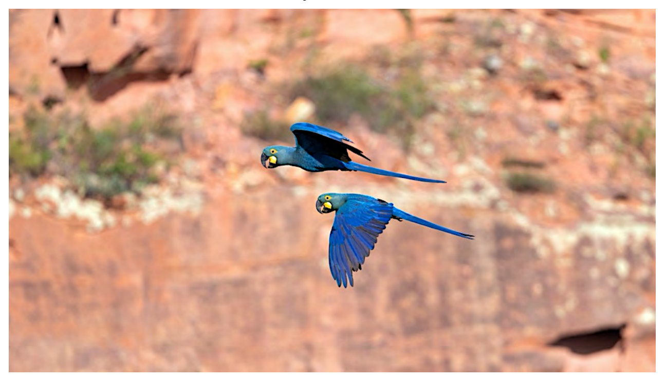
A highlight of the tour is visiting the breeding cliffs of the endangered Indigo Macaw at the Raso da Catarina near Canudos.

January 13-30, 2026 Fernando de Noronha Pre-Tour Extension January 11-14, 2026