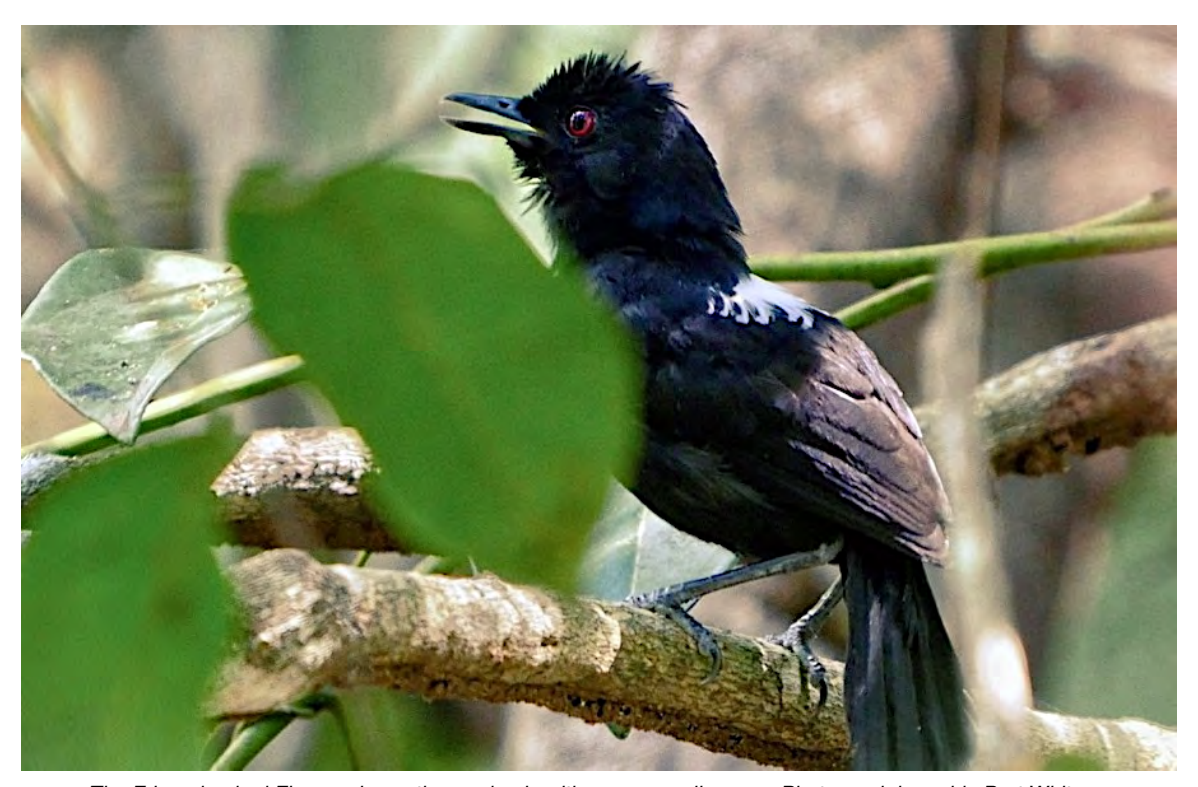
The Fringe-backed Fire-eye is another endemic with a very small range.

We'll head back to our hotel mid-morning to pack up and continue east, stopping for lunch (breakfast was a long time ago!) then settling in for a long afternoon of driving, but also making an important birding stop or two in hopes of Pectoral Antwren and perhaps Golden-capped Parakeets. Keep an eye open for Red-legged Seriemas stalking the surrounding grasslands and White Monjitas on the fences as we make our way to the town of Catu, where we'll be close to good habitat for the rare Fringe-backed Fire-eye. Night in Catu.