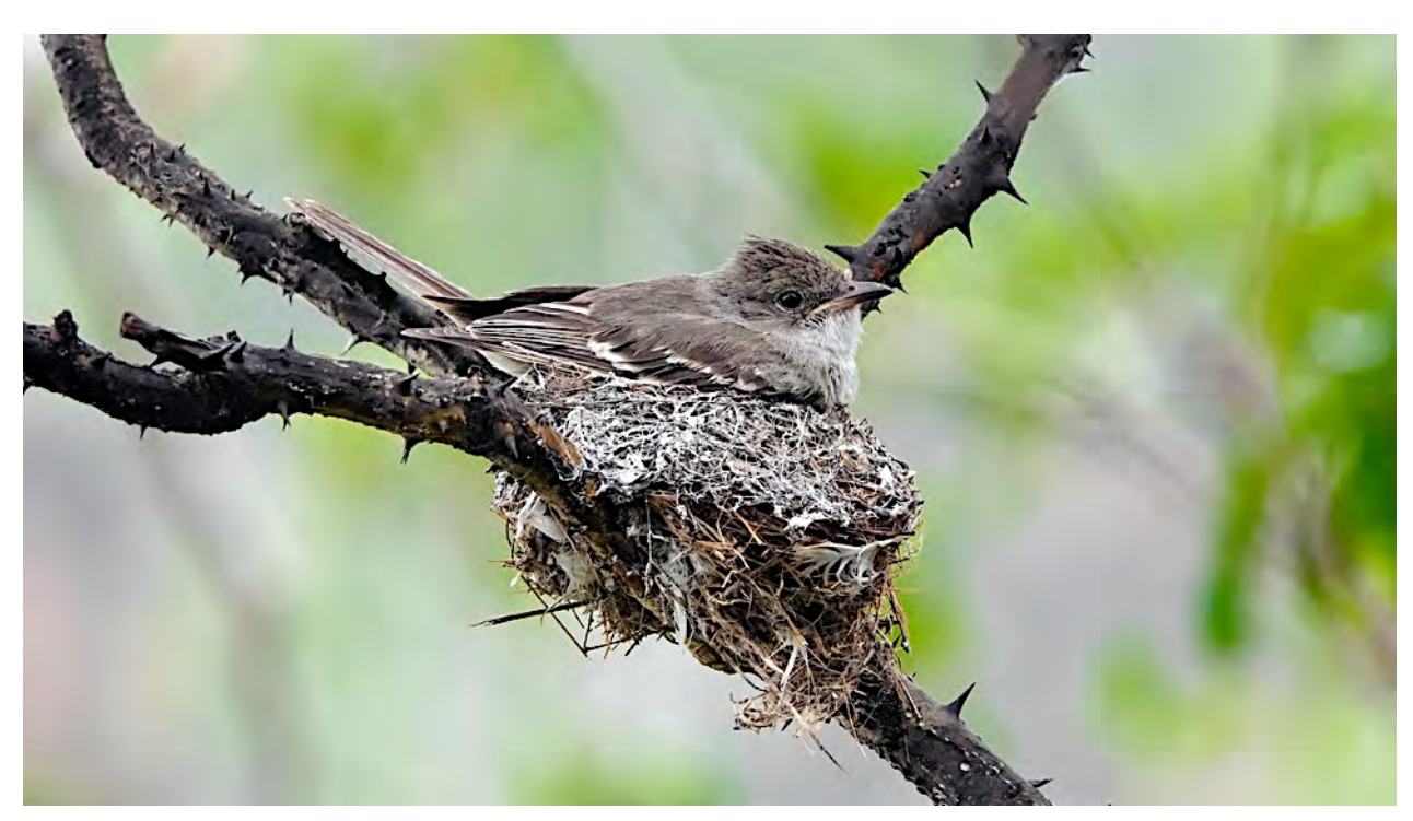
The Noronha Elaenia is one of two endemics we'll see on Fernando de Noronha.