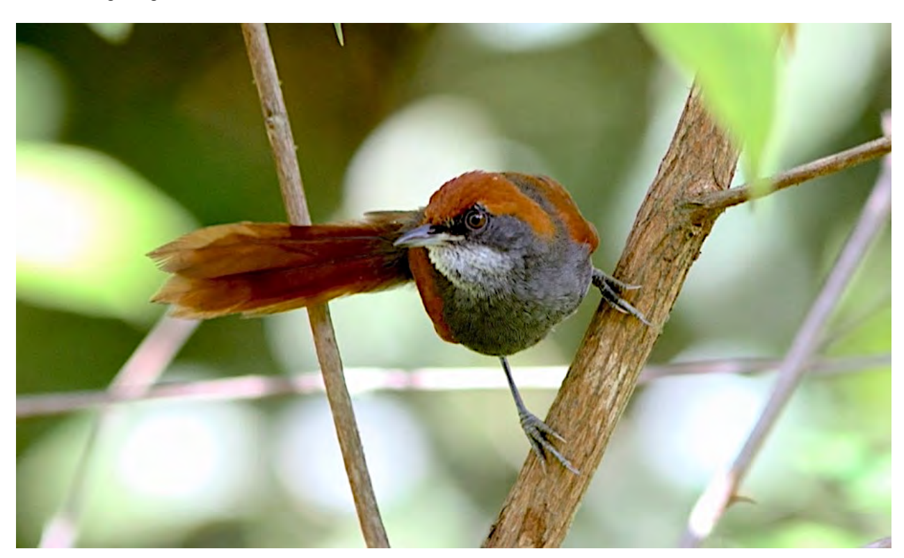
Pinto's Spinetail is known from only a handful of localities in northeast Brazil.

Day 4, Fri, 16 Jan. Tamandare area. A productive morning of birding near Tamandare could produce, among many other birds, Mantled Hawk, Jandaya Parakeet, Golden-tailed Parrotlet (often just high fly-overs, but we have a habit of getting lucky), White-shouldered Antshrike (endemic subspecies distans ), Chestnut-backed Antshrike, Pinto's Spinetail, the obscure Forbes's Blackbird (which has a small population in this region), Seven-colored Tanager, and Yellow-faced Siskin. White-collared Kite is also possible here, and scan carefully for White-winged Cotingas perched on tall treetops early in the morning. Night in Tamandare.