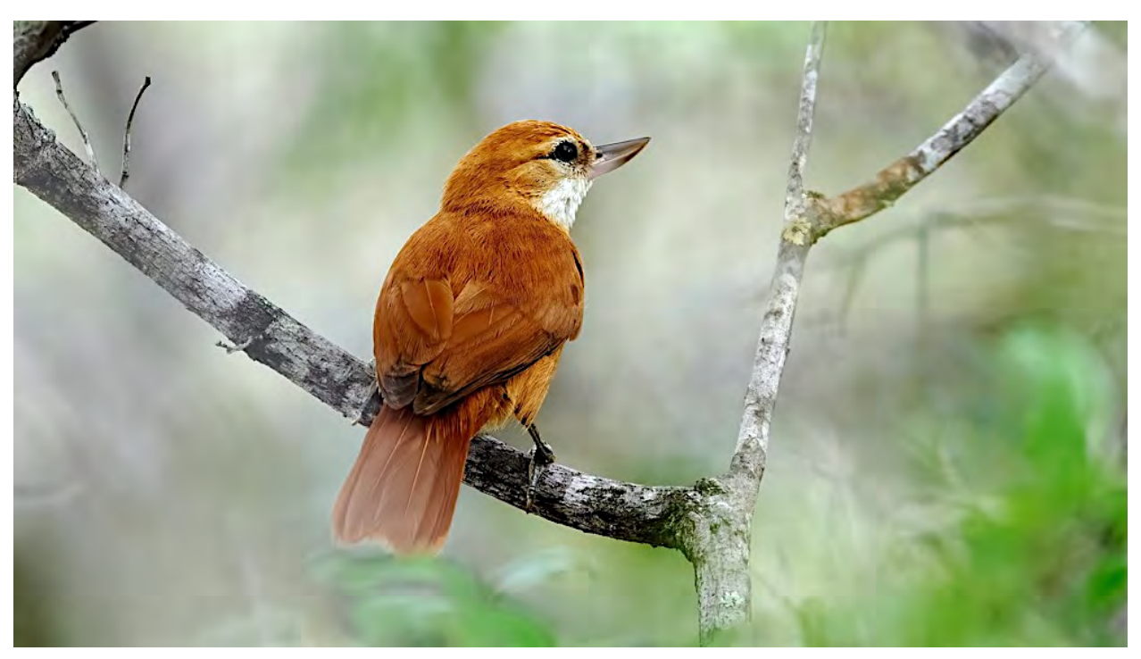
The Great Xenops is found in the caatinga where it uses its odd bill to pry off pieces of bark to search for insects.

Day 15, Tue, 27 Jan. Chapada Diamantina: Mucuge. The fire-adapted savanna scrublands typical of the Brazilian planalto, called cerrados , support a community of birds that, in the Chapada region, are near the eastern edges of their ranges. These include White-eared Puffbird, Horned Sungem (if we're real lucky!), Collared Crescentchest, Gray-backed Tachuri, Rufous-sided Scrub-Tyrant, White-banded Tanager, Wedge-tailed Grass-Finch, and Stripe-tailed Yellow-Finch. We'll likely also have a natural-classroom "Elaenia identification workshop," often being able to compare multiple individuals of Yellow-bellied, Small-headed, Lesser, and Plain-crested (and sometimes also Large) elaenias in a single morning! The Mucuge area is fabulous birding, and we'll have a chance to see several "mata-de-cipo" (vine forest) specialties as well, such as Great Xenops (if we missed it earlier, heaven forbid), Southern Silvery-cheeked Antshrike, Narrow-billed Antwren, Caatinga Antwren, White-browed Antpitta, and Hangnest Tody-Tyrant. Night in Mucuge.