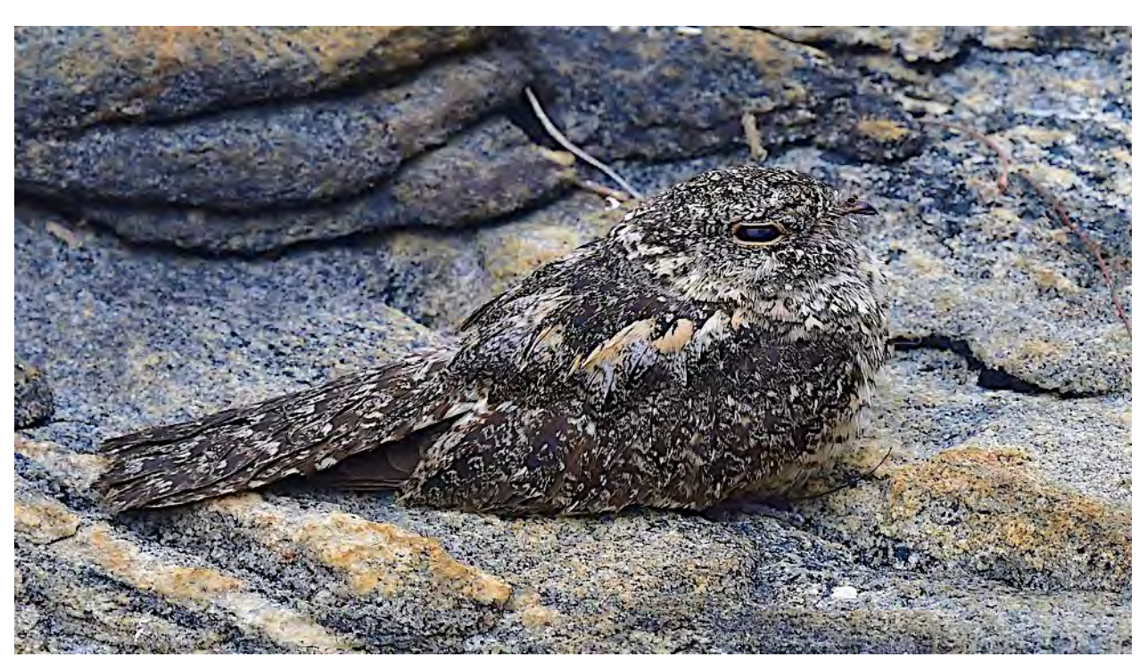
The Pygmy Nightjar has a wide distribution in Northeast Brazil, but as this image shows, it can be difficult to see!

Day 7, Mon, 19 Jan. Baturite to Quixada. We'll have this morning to go for any species that may have eluded us yesterday, then pack up for the 90-minute drive south to the little town of Quixada. We'll have left those evergreen forests behind to find ourselves in an other-worldly landscape dominated by ancient igneous plugs towering above semideciduous forests, at the gateway to the caatinga . Here in the rainshadow of the mountains, the region is very much drier, and if recent rains have not been frequent or extensive, the landscape may even be leafless. After lunch and a little time to digest, we'll make our first foray into the caatinga proper, with lots of new birds on the docket. Night near Quixada.