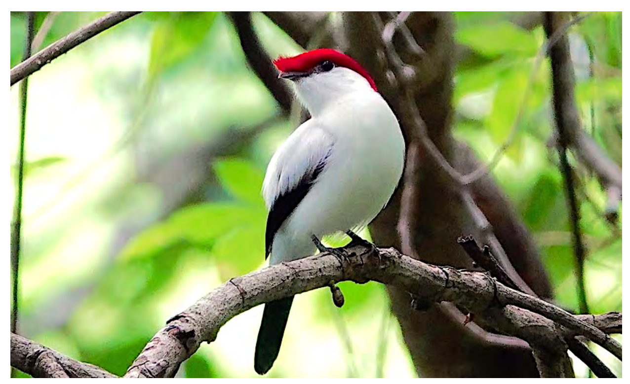
Another spectacular and range-limited endemic is the Araripe Manakin. We've had wonderful views of this distinctive bird on previous tours.

We'll roll into Crato late this afternoon. Our little hotel is set on a hillside with a grand view to the Chapada do Araripe plateau. Night in Crato.