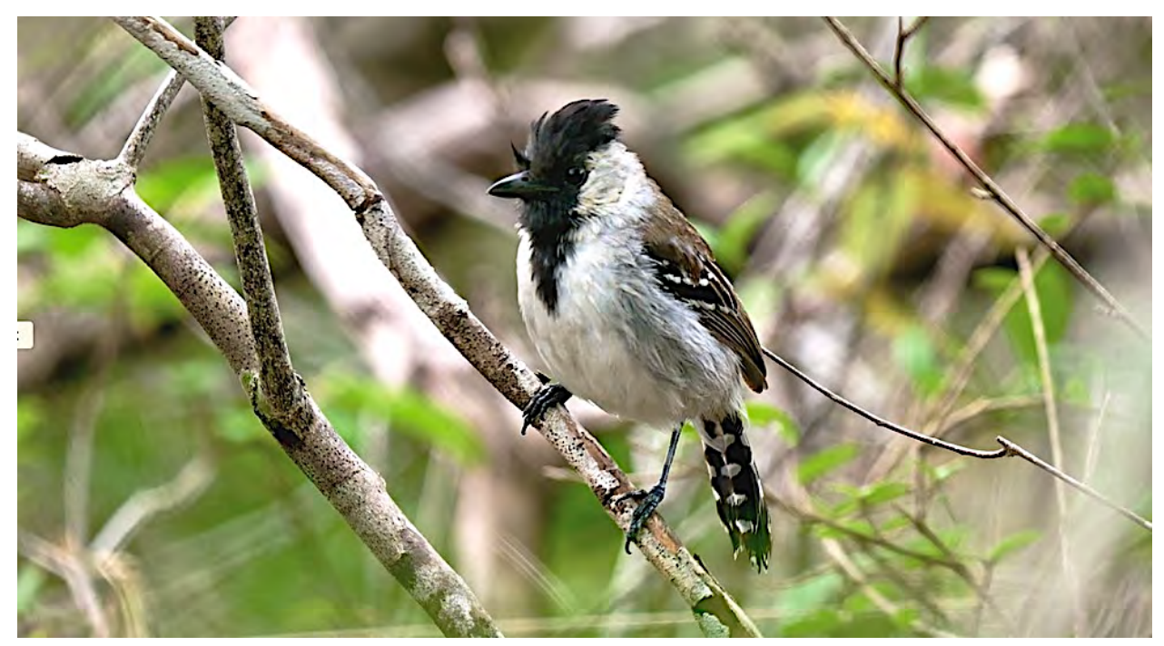
As of 2024, the Northern Silvery-cheeked Antshrike was recognized as a species, giving us yet another endemic to look for! We saw this lovely male in 2025.

Day 4, Wed, 14 Jan. Fernando de Noronha to Recife. After a final morning on the archipelago, we'll depart the islands for Recife. This afternoon we'll head out for our first taste of birding on the Continent en route to the small town of Palmares, about 3 hours south of Recife. Night in Palmares.