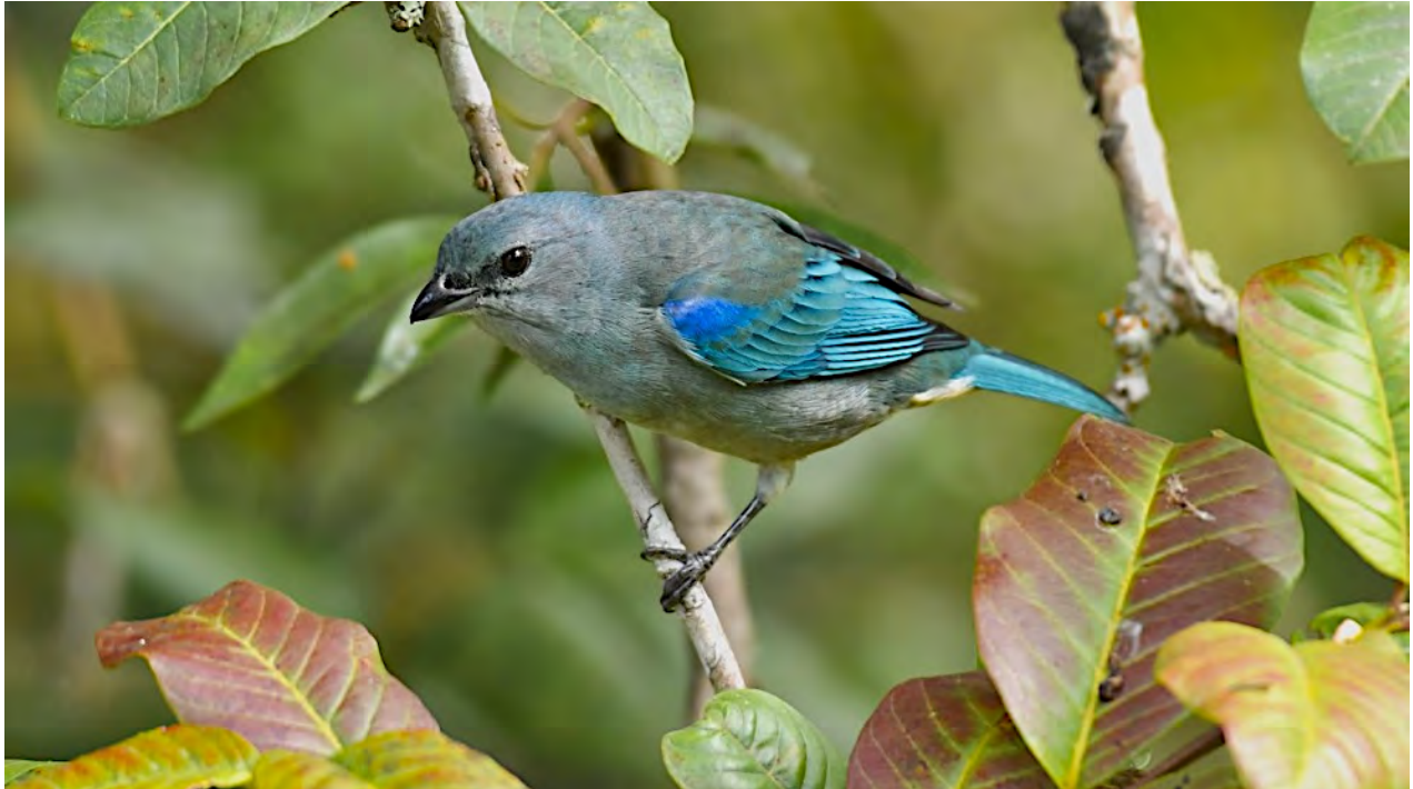
The gorgeous Azure-shouldered Tanager is one of a number of lovely endemics we'll see on this tour.

We include here information for those interested in the 2023 Field Guides Brazil Nutshell: Intervales, Iguazu Falls & Pantanal tour: