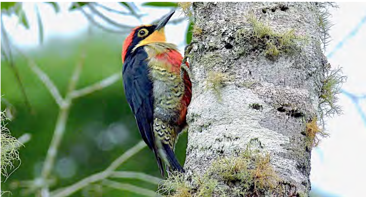
The showy Yellow-fronted Woodpecker is one of the most beautiful of the genus Melanerpes. It is almost endemic to the Atlantic Forest of Brazil.

Mention of a few additional target birds here must include the very rare Blue-bellied Parrot (seldom seen), Rufous-capped Motmot, Buff-bellied and Crescent-chested puffbirds, the very rare Helmeted Woodpecker, Orange-breasted Thornbird ( Phacellodomus ferrugineigula , recently split from Red-eyed Thornbird), White-bearded Antshrike, Squamate Antbird, Variegated Antpitta, Black-cheeked Gnateater, Spotted Bamboowren, White-breasted and Mouse-colored tapaculos, Gray-hooded Attila, the little-known Black-legged Dacnis, and Green-chinned Euphonia. Owling is great at Intervales, and we'll take advantage of clear nights to look especially for Rusty-barred and Tawny-browed owls and Long-tufted and Tropical screech-owls. We'll try to come up with a Least Pygmy-Owl during the day. Nights in Intervales State Park.