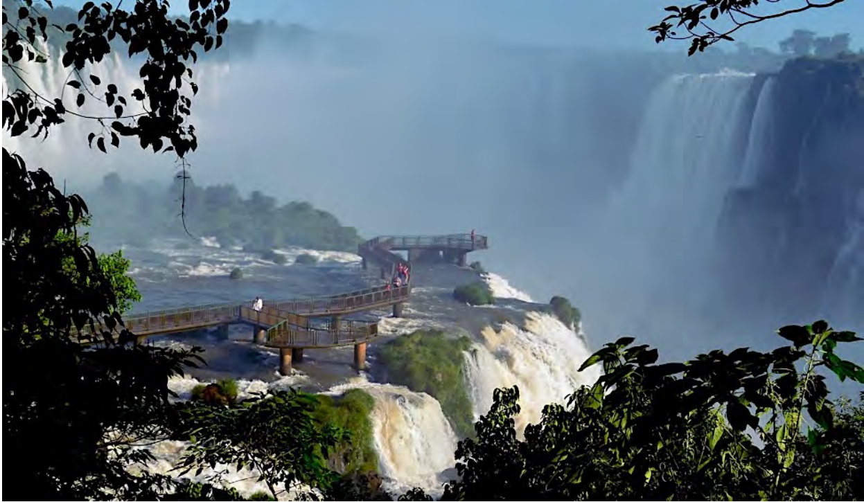
Spectacular Iguazu Falls, which we'll visit on both the Brazilian and Argentine sides, provides a wonderful backdrop for our birding at one of the three venues on this great itinerary.

Our first stop, Intervalles State Park, is well known for its avian riches and for sheltering a large number of endemics and endangered species of the Atlantic Forest biome, such as Blue-bellied Parrot, Helmeted Woodpecker, Black-fronted Piping-Guan, and even an undescribed species of bristlefront (that's a weird tapaculo!). Our second venue is truly stunning, for Iguazu Falls are the largest in the world. And, while the sight and sound of this awesome place will live long in the memory, the birding round about is pretty fabulous, too! In striking contrast to the forested mountains of Intervalles and the roaring waters of Iguazu, our final stop will be amidst the seasonally flooded grasslands of southwestern Brazil: the famed Pantanal. Water birds abound, but there is one species that has come to symbolize the wilds of the Pantanal—the magnificent Hyacinth Macaw, the largest and now one of the rarest parrots in the world. It's sure to be a fine conclusion to a relaxing and educational tour.