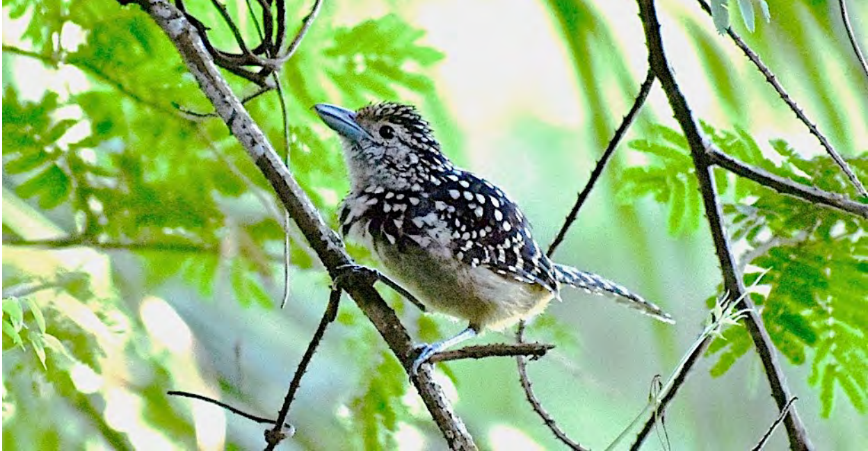
We'll look for the Spot-backed Antshrike in the moist forests near Iguazu Falls.

Day 6, Thu, 16 Mar. To Iguazu Falls. On this last morning at Intervalles we'll have a couple of early hours of birding before we transfer to Sao Paulo, where we will enjoy a quick lunch at the airport and then catch our afternoon flight. Upon arrival at Iguazu, we'll board our bus and transfer directly to the Argentine side, where we'll spend our first two nights. Our lovely, modern hotel sits a few minutes away from the park's entrance and is nestled in a lovely patch of forest! The grounds and nearby trails are great for birding, too, and we'll have time this afternoon to enjoy a walk around our hotel and get to know some of the local birds, which may include the secretive Spot-backed Antshrike and the rare Buff-bellied Puffbird as well as the lovely Rufous-capped Motmot. Night at Iguazu Falls/Argentine side.