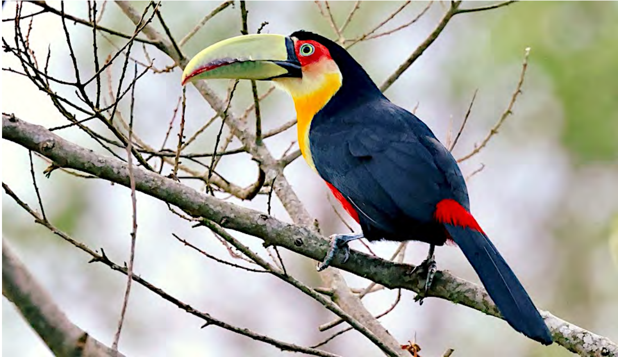
The Red-breasted Toucan is one of a number of colorful birds we'll see at Intervales State Park on this tour.

We include here information for those interested in the 2025 Field Guides Brazil Nutshell: Intervales, Iguazu Falls & Pantanal tour: