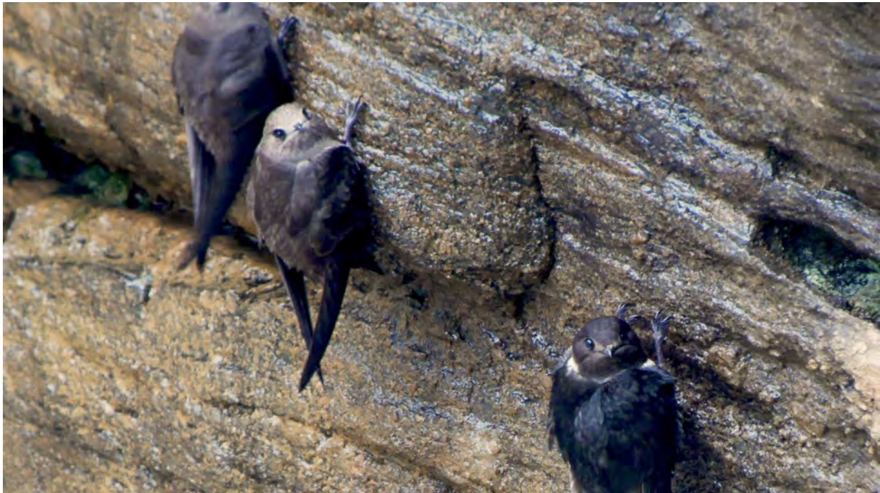
Great Dusky and White-collared swifts roost behind that falls at Iguazu.

Day 6, Thu, 13 Mar. To Iguazu Falls. On this last morning at Intervales we'll pack up and start birding our way back to Sao Paulo looking for species such as White-eared Puffbird, Streamer-tailed Tyrant and many other, we will enjoy a quick lunch on the way to the airport and then catch our afternoon flight. Upon arrival at Iguazu, we'll board our bus and transfer directly to the Argentine side, where we'll spend our first two nights. Our lovely, modern hotel sits a few minutes away from the park's entrance and is nestled in a lovely patch of forest! The grounds and nearby trails are great for birding, too, and we'll have time this afternoon to enjoy a walk around our hotel and get to know some of the local birds, which may include the secretive Spot-backed Antshrike and the rare Buff-bellied Puffbird as well as the lovely Rufous-capped Motmot. Night at Iguazu Falls/Argentine side.