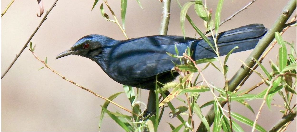
The Blue Mockingbird is a Mexican endemic found through much of the country. Unlike the familiar Northern Mockingbird, these are skulkers and can be difficult to see, but we have gotten some great views of them on this tour.

goal of finding the endemic and specialty birds of the region. Our daily destinations will be announced by the guides, usually at dinnertime the night before, and will include all major habitats and proven birding sites in the vicinity. We will certainly visit the lush forests of Cerro San Felipe on at least two days, and we'll pay a visit to the ruins of Monte Alban, Yagul, and Mitla. While the focus of the tour will be on birding, there will be ample opportunity to sample the rich Zapotec culture, both in the markets and shops of the city (where you may wish to spend an afternoon) and in the outlying villages. Nights in Oaxaca City.