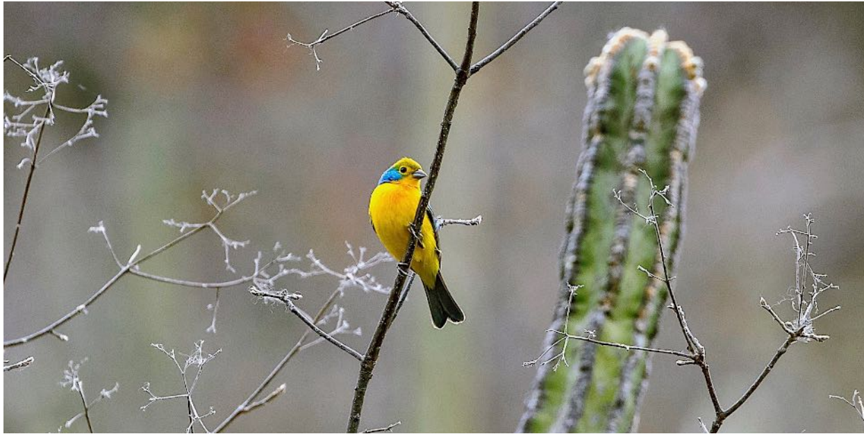
The Orange-breasted Bunting is a colorful speck in the dry habitats of Oaxaca. These endemics are found only along the Pacific slope of Mexico; Oaxaca is in the central part of their range.

We include here information for those interested in the 2021 Field Guides Oaxaca tour: