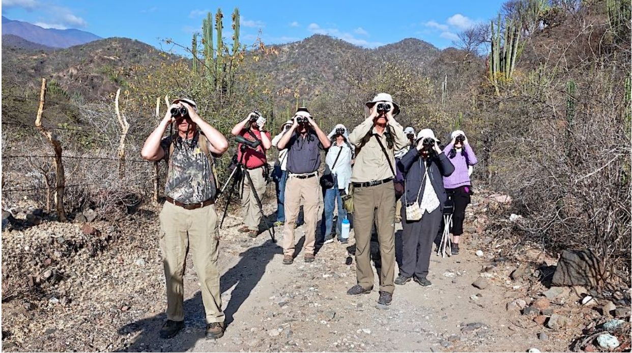
We bird in some very interesting habitats on this tour, ranging from warm and dry in the lower valleys, to cooler and moister (though not truly wet) in the mountains.

Oaxaca is located at the crossroads of several major biogeographic regions of Mexico, and its bird life is influenced by all of these. The resultant mixture includes nearly two-dozen species endemic to Mexico. Some of these include West Mexican Chachalaca, Boucard's and Gray-barred wrens, White-throated and Collared towhees, Dusky and Beautiful hummingbirds, Bridled and Oaxaca sparrows, Gray-breasted Woodpecker, Dwarf Jay, Rufous-capped Brushfinch, Russet Nightingale-Thrush, Ocellated Thrasher, Blue Mockingbird, Red Warbler, and Slaty and Dwarf vireos.