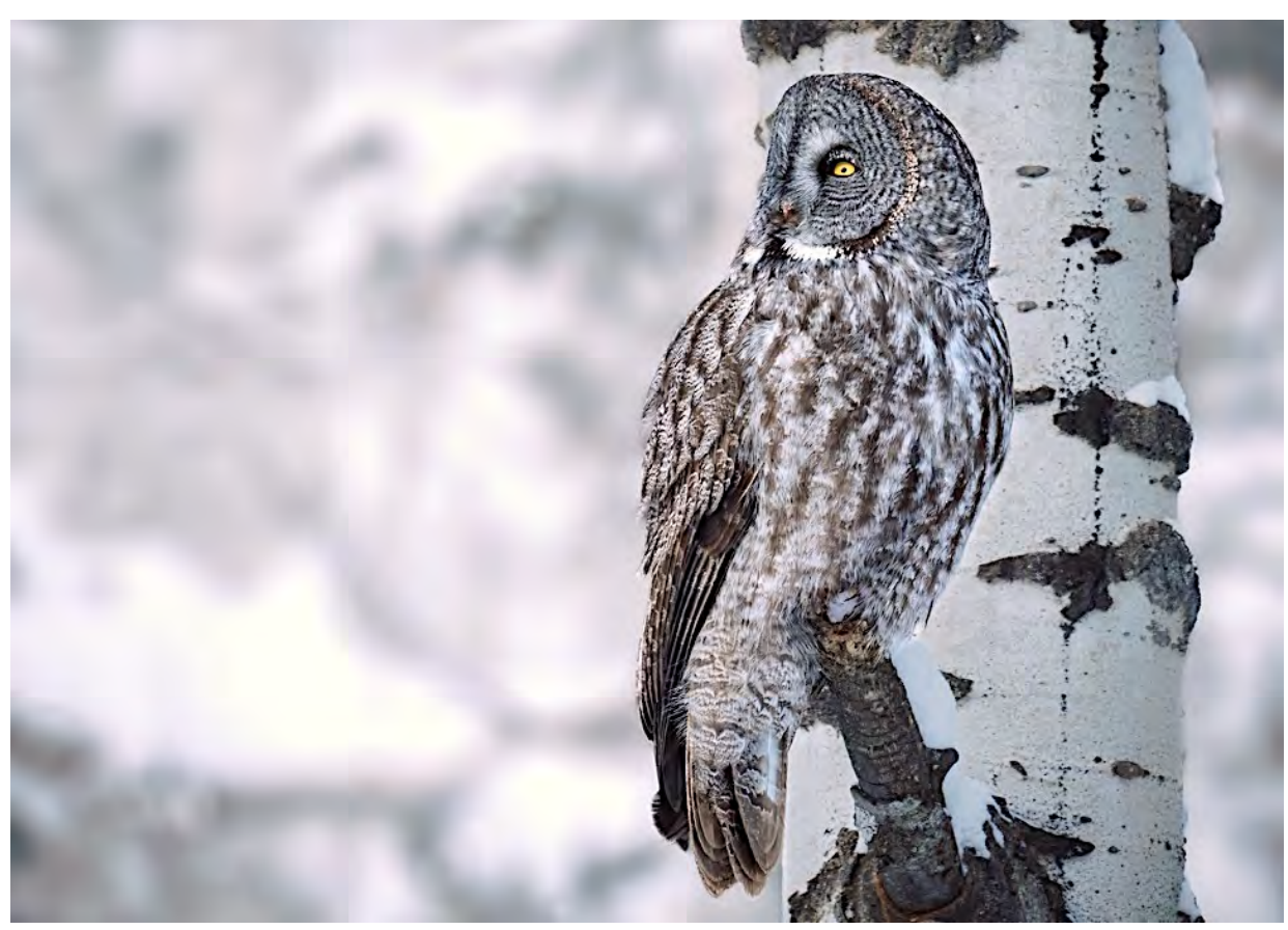
The Great Grey Owl is another much-wanted species on the tour, and in recent years we've done well with finding individuals such as this imposing specimen.