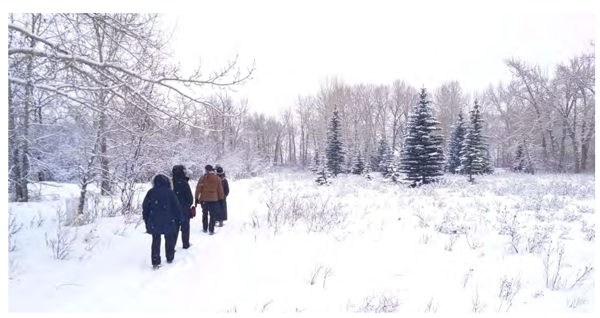
We won't do a lot of hiking, but we will venture out into the elements a time or two, so it is important to be prepared! Here, a Field Guides group checks the woods at Carburn Park.

From Edmonton we'll move southward to Calgary, situated along the Bow River, at the eastern foot of the Rockies, and the western edge of the prairies. Calgary's location between these two major ecozones makes it an ideal base from which to explore both regions. To the east, the broad, open prairies host Snowy and Short-eared owls, Golden Eagles, Rough-legged Hawks, Gray Partridge, Horned Larks, and Snow Buntings, while the foothill forests to the west hold American Three-toed Woodpecker, Mountain and Boreal chickadees, Canada Jay, Clark's Nutcracker, and a variety of winter finches including Pine Grosbeak, Common Redpoll, Pine Siskin, Red and White-winged crossbills, and, in exceptional years, Gray-crowned Rosy-Finch. Open water along the Bow River can attract good numbers of wintering waterfowl (with the possibility of Barrow's Goldeneye and Harlequin Duck among the more common species), Bald Eagles, and the occasional American Dipper. And, if the Edmonton region has failed to produce Great Gray and Northern Hawk owls, we'll have an excellent back up location in another nearby area. Plus there's always the possibility of something like Gyrfalcon, Northern Saw-whet Owl, Northern Pygmy-Owl, or Hoary Redpoll to liven up most winters in the area.