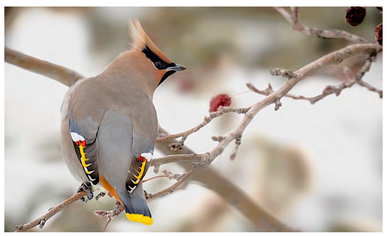
Numbers of the lovely Bohemian Waxwing can vary greatly from year-to year, but we'll hope for a good sighting of these beauties.

Day 5, Wed, 21 Feb. Calgary region. Today will find us heading out east into the prairies. This wide open country allows for limitless vistas, and an abundance of rodent life in the grasslands and agricultural areas can attract a good number of raptors. Snowy Owl numbers vary from year to year, but there are almost always a few around somewhere. Other aerial predators that we can encounter include Short-eared Owl, Golden Eagle, and Rough-legged Hawk, and Gray Partridge, Black-billed Magpie, Horned Lark, Snow Bunting, and Common Redpoll are among the other open-country species we may see today. Night in Calgary.