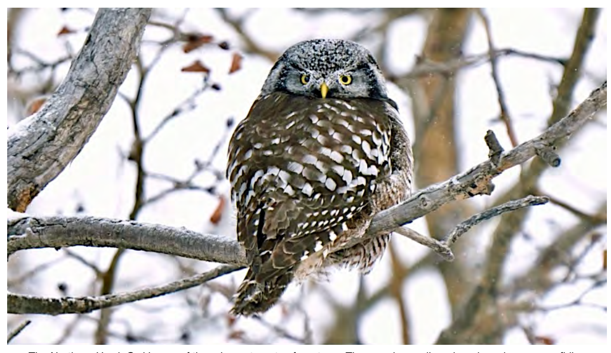
The Northern Hawk Owl is one of the primary targets of our tour. These owls are diurnal, and can be very confiding; we had a wonderful encounter with this one on last year's tour.

We include here information for those interested in the 2024 Field Guides Owlberta: Alberta's Owls & More tour: