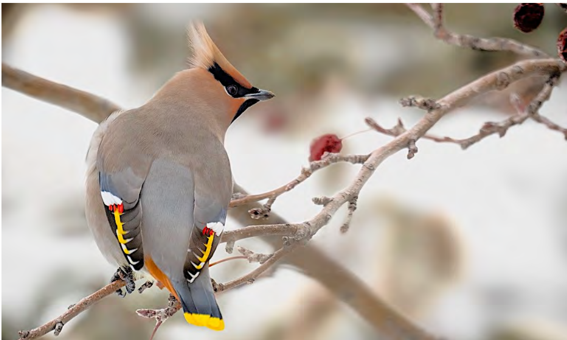
Numbers of the lovely Bohemian Waxwing can vary greatly from year-to-year, but we'll hope for a good sighting of these beauties.

Calgary region —The city of Calgary provides easy access to a good variety of habitats, and we'll divide our time between birding in the prairies to the east, the foothill forest to the west and the riverside parks within the city itself, as conditions dictate, and based upon our needs and what target species are present. Prairie birding will be primarily roadside, as we scan the open country for Snowy Owl, Golden Eagle, Rough-legged Hawk, and other species of the windswept plains. In the forested regions and within Calgary's parks we may spend more time on foot as we search for a variety of waterfowl, raptors, woodpeckers, and winter finches.