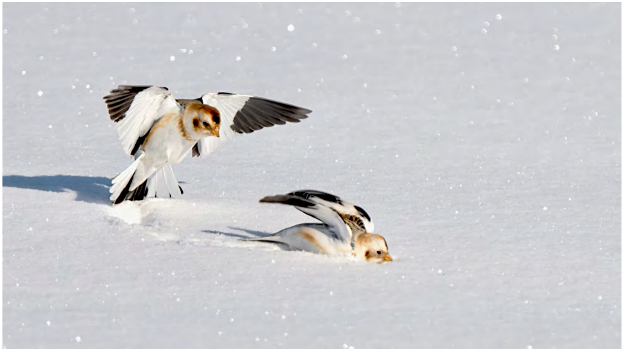
The Snow Bunting is found in open areas, where they forage on the ground for seeds. These hardy little finches breed in the Arctic and winter as far south as the northern US.

From Edmonton we'll move southward to Calgary, situated along the Bow River, at the eastern foot of the Rockies, and the western edge of the prairies. Calgary's location between these two major ecozones makes it an ideal base from which to explore both regions. To the east, the broad, open prairies host Snowy and Short-eared owls, Golden Eagles, Rough-legged Hawks, Gray Partridge, Horned Larks, and Snow Buntings, while the foothill forests to the west hold American Three-toed Woodpecker, Mountain and Boreal chickadees, Canada Jay, Clark's Nutcracker, and a variety of winter finches including Pine Grosbeak, Redpoll, Pine Siskin, Red and White-winged crossbills, and, in exceptional years, Gray-crowned Rosy-Finch. Open water along the Bow River can attract good numbers of wintering waterfowl (with the possibility of Barrow's Goldeneye and Harlequin Duck among the more common species), Bald Eagles, and the occasional American Dipper. And, if the Edmonton region has failed to produce Great Gray and Northern Hawk owls, we'll have an excellent back up location in another nearby area. Plus there's always the possibility of something like Gyrfalcon, American Goshawk, Northern Saw-whet Owl, or Northern Pygmy-Owl, to liven up most winters in the area.