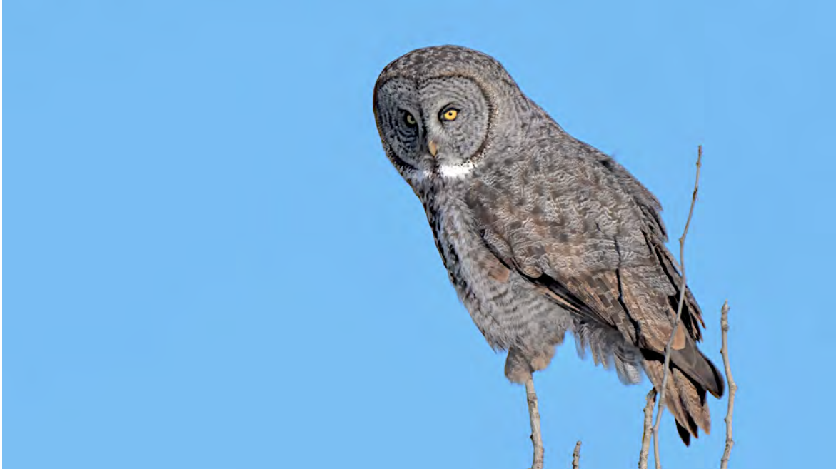
The Great Gray Owl is a much-wanted species for many birders. Some years are better than others for these impressive owls, but we've had luck finding them on our tours.

We include here information for those interested in the 2027 Field Guides Owlberta: Alberta's Owls & More tour: