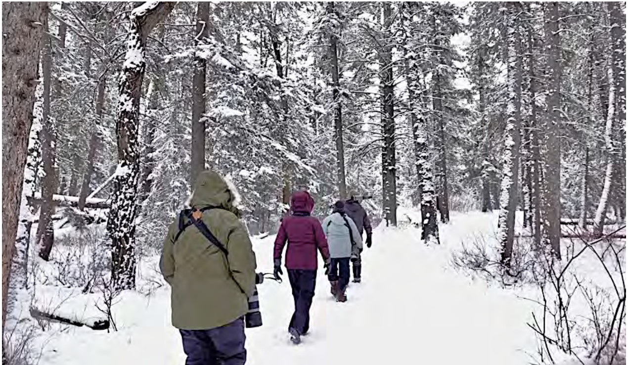
We won't do a lot of hiking, but we will venture out into the elements a time or two, so it is important to be prepared! Here, a Field Guides group checks the woods at Fishcreek Park.

Participants need to come prepared for cold conditions, with adequate clothing for the climate, including warm, waterproof winter boots and warm gloves. Though no mid-afternoon siesta breaks will be possible, we will retreat to the warmth of a café or restaurant for our lunches, and the vehicles will generally always be nearby for anyone who feels the need to remain inside to keep warm.