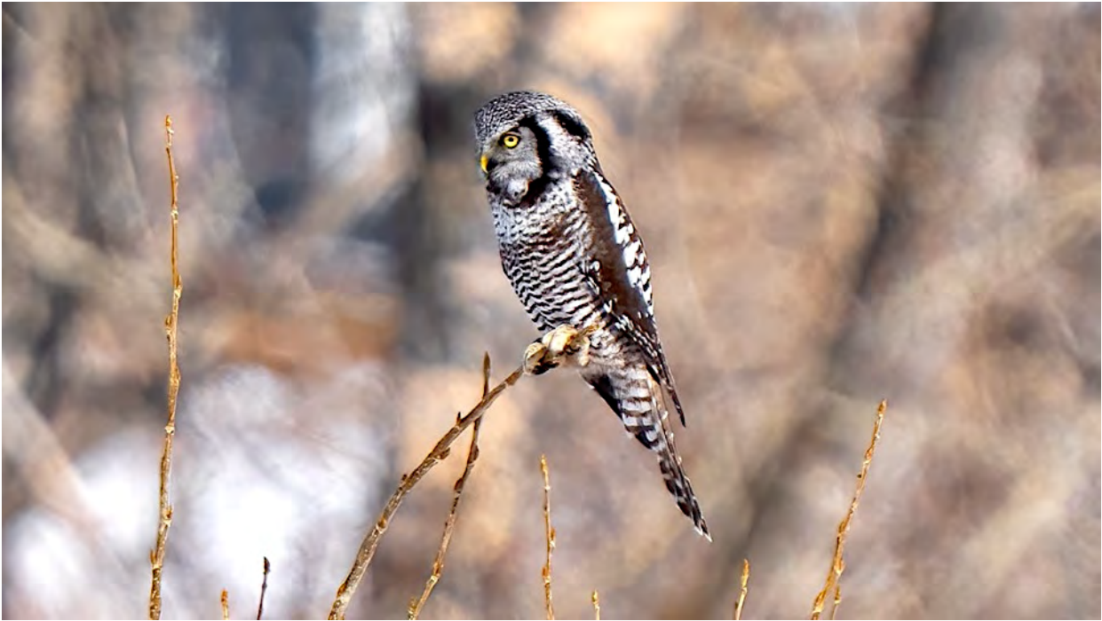
The Northern Hawk-Owl is another much-wanted species on the tour. These small owls are boreal nesters, and movements seem tied to the abundance of small animal prey.