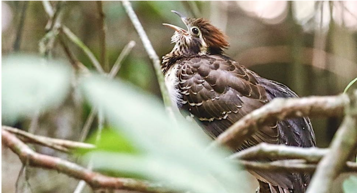
The Pheasant Cuckoo is widespread in the Neotropics, but it is elusive and difficult to see. We have gotten some wonderful views of these birds along Pipeline Road, and often hear them singing.

We include here information for those interested in the 2021 Field Guides Panama's Canopy Tower tour: