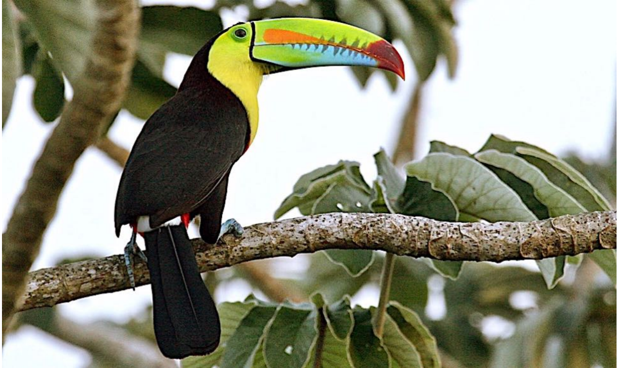
Keel-billed Toucan is one of the iconic tropical species we'll see from the top of the Canopy Tower.

swarm can be very impressive, with attendant antbirds and woodcreepers seemingly tame, so preoccupied are they with foraging. The most characteristic army ant followers of the Panama lowlands are Northern Barred- and Plain-brown woodcreepers, Bicolored, Spotted, and Ocellated antbirds, and Gray-headed Tanager. Sometimes a Barred Forest-Falcon will make regular visits to a swarm, perhaps not only for large insects, but for an occasional unwary bird.