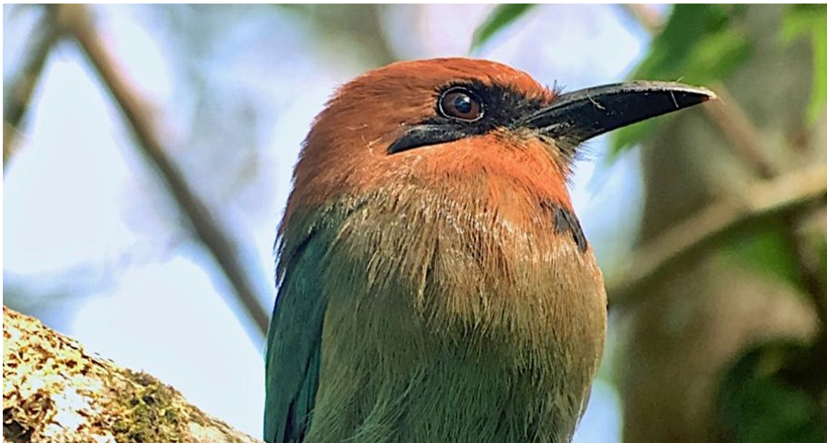
The Broad-billed Motmot is one of three motmot species we'll watch for.

Our tour is limited to eight participants in order to eliminate the confusion that sometimes ensues with a large group at the Canopy Tower. This way we are ensured of riding in the same Canopy vehicle when we travel to and from birding sites and of having a better participant-to-ornithologist/guide ratio in the field and at meals; this is especially valuable on our night drive in the Rainfomobile when everyone is able to be in the same open-air vehicle with the guide who is using the spotlight. As with all Canopy birding groups, ours are accompanied by a local Tower guide who has the most up-to-date knowledge of the area and is excellent at finding birds and quickly putting them in the spotting scope for everyone to see. In a small group our Field Guides leader can more effectively impart a wealth of knowledge that is otherwise difficult to get from local guides who have not had the breadth and depth of Neotropical experience that characterizes all our Panama guides. And both guides have fewer folks to satisfy with scope views. It is more expensive for us to operate small groups to the Canopy Tower, and so our fee is somewhat higher than most of our competitors. However, based on the response from our clients—who remark on the pleasure they take in learning so much about what they encounter—this intimacy and expertise are well worth a slight premium.