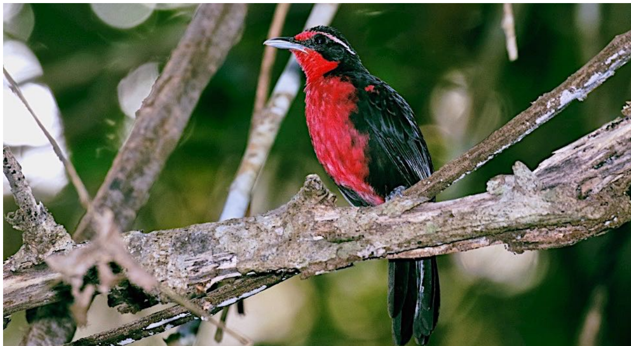
Rosy Thrush-Tanager is an understory species that can be difficult, but we've had success on previous tours.

We want to be sure you are on the right tour! Below is a description of the physical requirements of the tour. If you are concerned about the difficulty, please contact us about this and be sure to fully explain your concerns. We want to make sure you have a wonderful time with us, so if you are uncomfortable with the requirements, just let us know and we can help you find a better fitting tour! Field Guides will not charge you a change or cancellation fee if you opt out within 10 days of depositing.