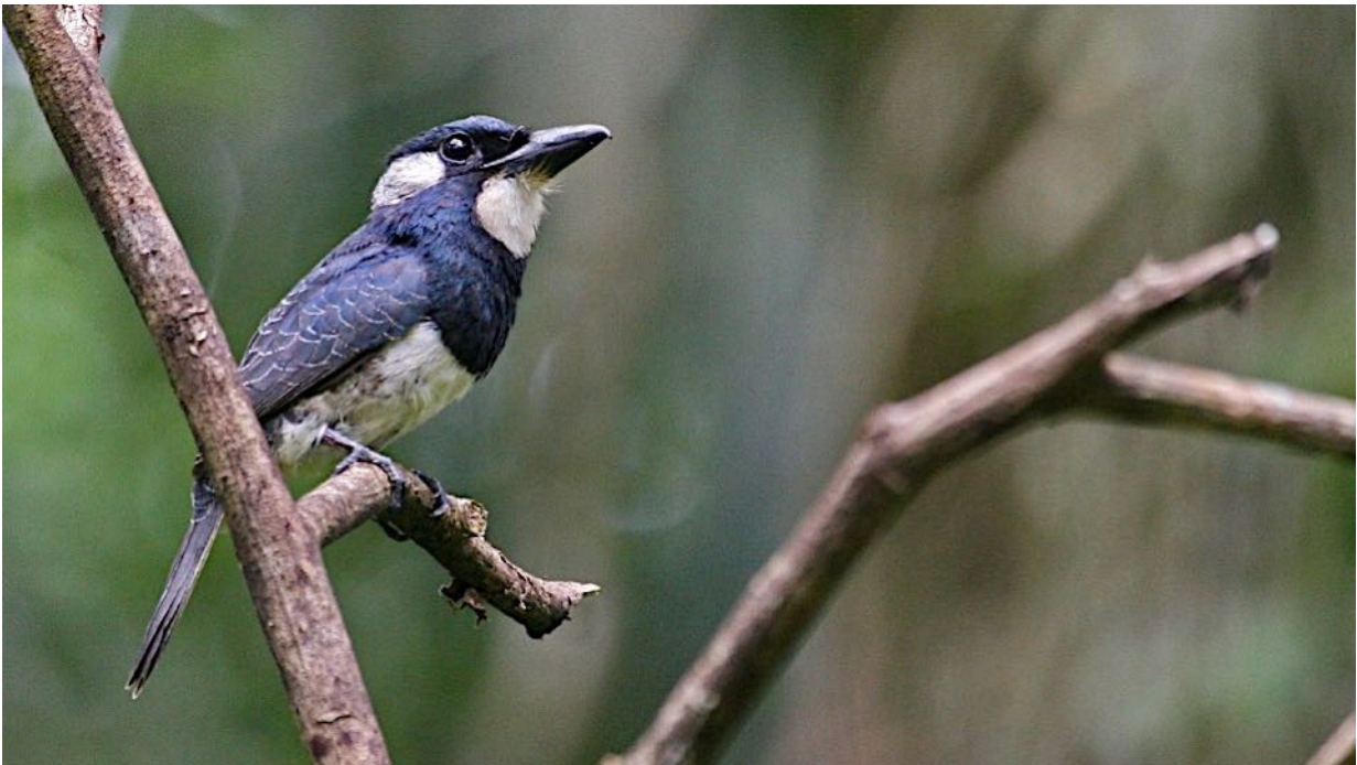
Puffbirds are another neotropical group we'll find at the Canopy Tower. This is the Black-breasted Puffbird, one of four species we'll seek on Pipeline Road.

Day 7, Sat, 6 Feb. Departure. After an early breakfast at the Tower (for those who have mid-morning or later flights), we'll transfer to the Panama International Airport for our flights home. For those being picked up before dawn for an early morning flight, we will have said our farewells after dinner the previous night! Buen viaje!