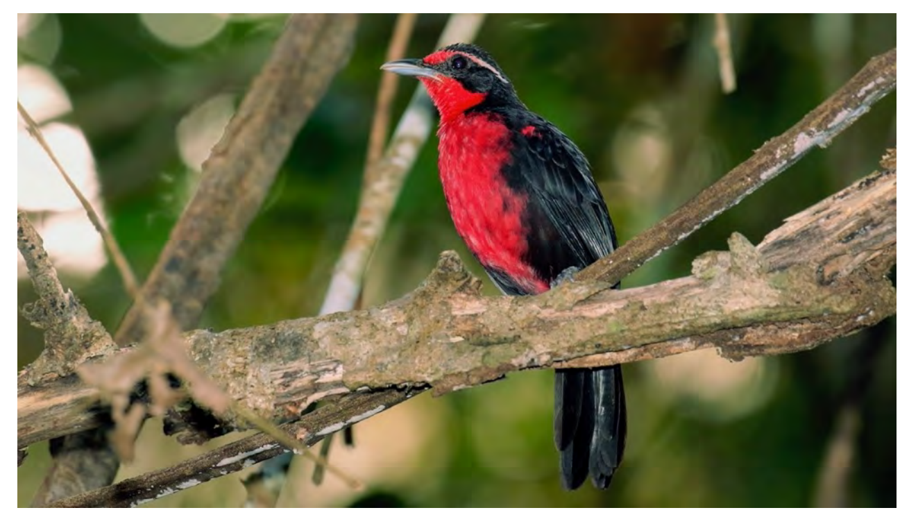
Rosy Thrush-Tanager is an understory species that can be difficult, but we've had success on previous tours.

small groups to the Canopy Tower, and so our fee is somewhat higher than most of our competitors. However, based on the response from our clients—who remark on the pleasure they take in learning so much about what they encounter—this intimacy and expertise are well worth a slight premium.