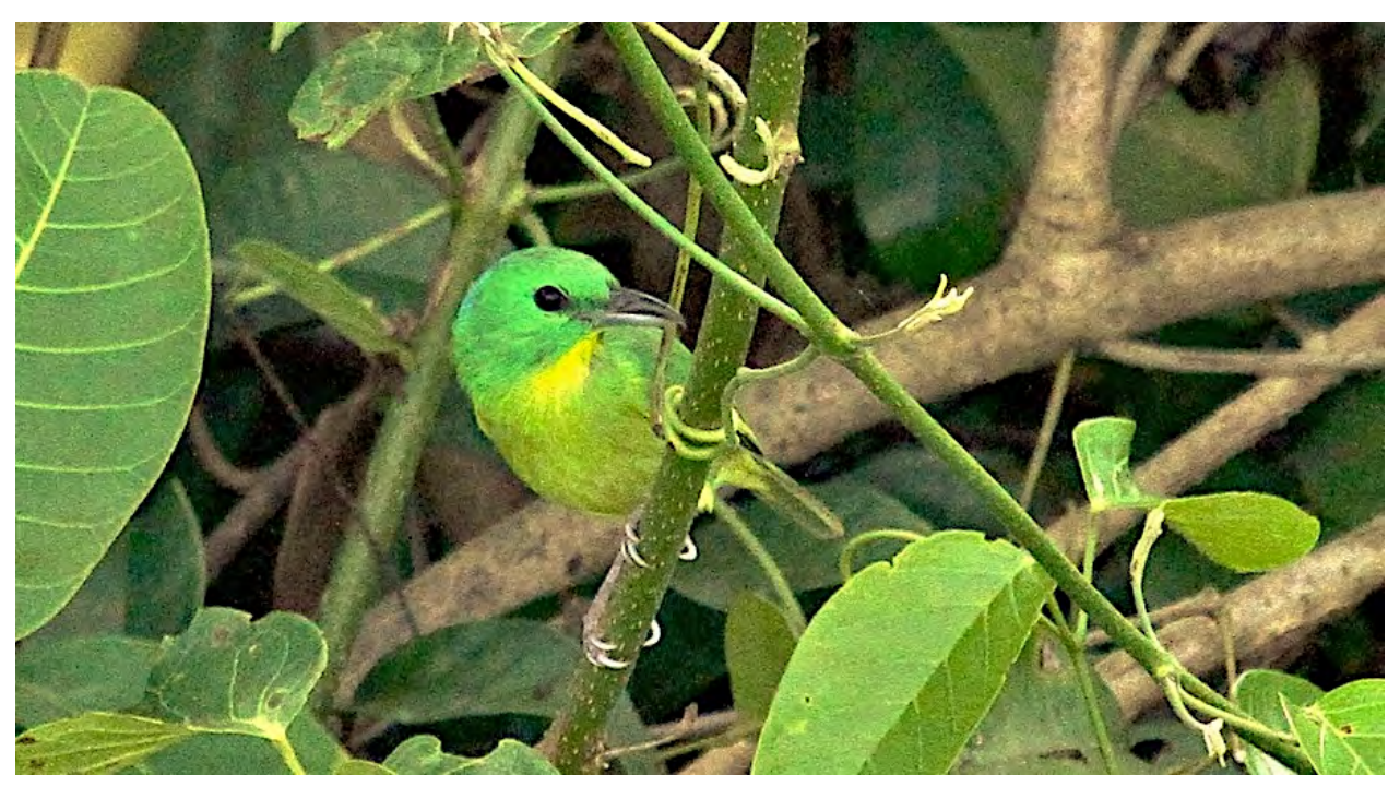
The Green Shrike-Vireo is found from southern Mexico to Panama, but it can be difficult to see in the green canopy. We have seen them well from the Canopy Tower.

If you've never birded the American tropics, you'll find that little is quite as exciting as coming upon your first army ant swarm, attended—sometimes feverishly—by Ocellated, Bicolored, and Spotted antbirds, Plain-brown, Northern Barred-, Cocoa, and Black-striped woodcreepers, and Gray-headed Tanager; or a Cecropia tree full of frugivorous birds from Keelbilled and Yellow-throated (formerly Chestnut-mandibled) toucans to Red-capped and Velvety (Blue-crowned) manakins; and lethargic species like trogons, puffbirds, and motmots that sit almost motionless, seemingly content to watch forest life go by.