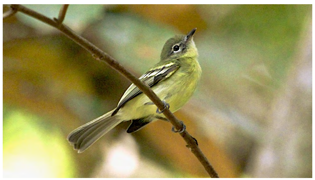
We'll look for the endemic Yellow-green Tyrannulet, a tiny flycatcher that's often found in mixed species flocks.

fascinating of tropical ecology. A number of species of birds feed primarily on insects disturbed by army ant raids. Some, considered obligate army ant followers, are rarely seen away from ant swarms, even when feeding young! One such species in Panama is the Rufous-vented Ground-Cuckoo, a terrestrial, bronze-and-green cuckoo with an enormous bill which it snaps, Roadrunner-like, as it forages for lizards and large insects in the path of the swarming ants. While we might not encounter such a prize on Pipeline, our chances for finding at least a small swarm are good. And even a small swarm can be very impressive, with attendant antbirds and woodcreepers seemingly tame, so preoccupied are they with foraging. The most characteristic army ant followers of the Panama lowlands are Northern Barred- and Plain-brown woodcreepers, Bicolored, Spotted, and Ocellated antbirds, and Gray-headed Tanager. Sometimes a Barred Forest-Falcon will make regular visits to a swarm, perhaps not only for large insects, but for an occasional unwary bird.