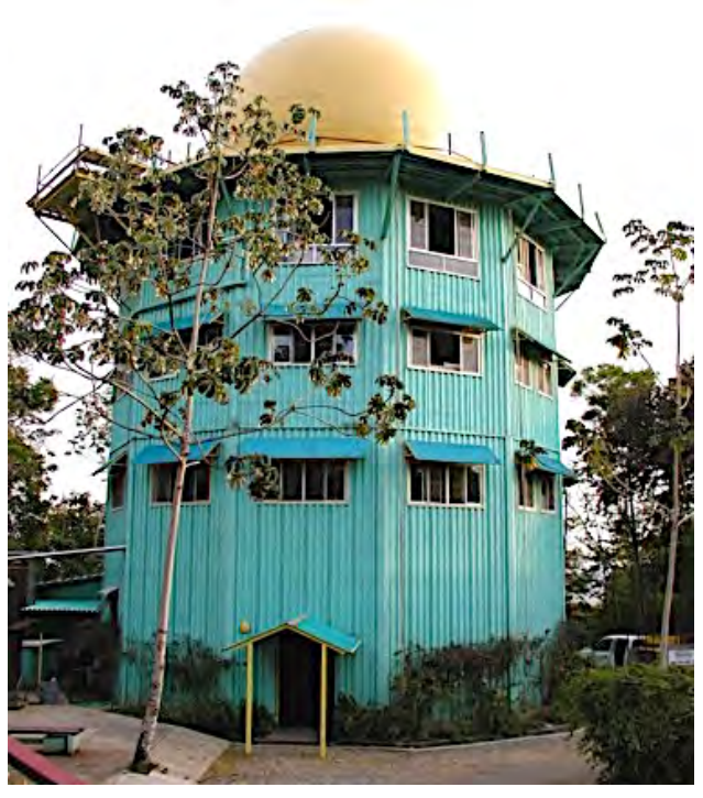
The Canopy Tower is a very unique accommodation! Guest rooms are on the second and third levels, and there is an observation deck on the top.

AIR ARRANGEMENTS : Please call our office for the best fare from your home. Field Guides is a full service travel agency and your tour manager will be happy to assist you with flights to join this tour. Field Guides does not charge a service fee for these services to clients booking a tour. However, we