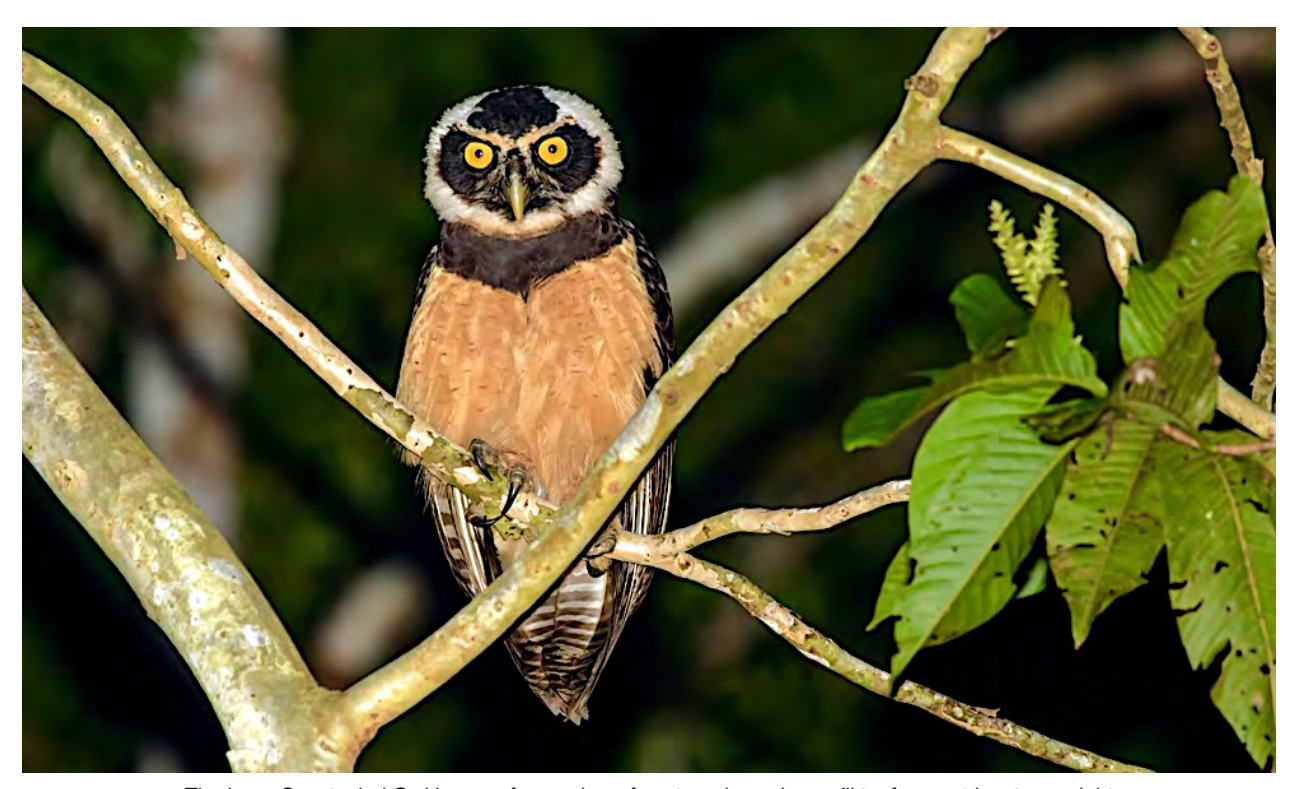
The large Spectacled Owl is one of a number of nocturnal species we'll try for on at least one night.

After lunch at the Tower and some time off, we'll bird parts of the Old Gamboa Road and Summit Pond, where the possibilities include Boat-billed Heron (often nesting there), American Pygmy, Green, and Amazon kingfishers, Jet Antbird, and possibly a day-roosting Spectacled Owl, as well as other species.