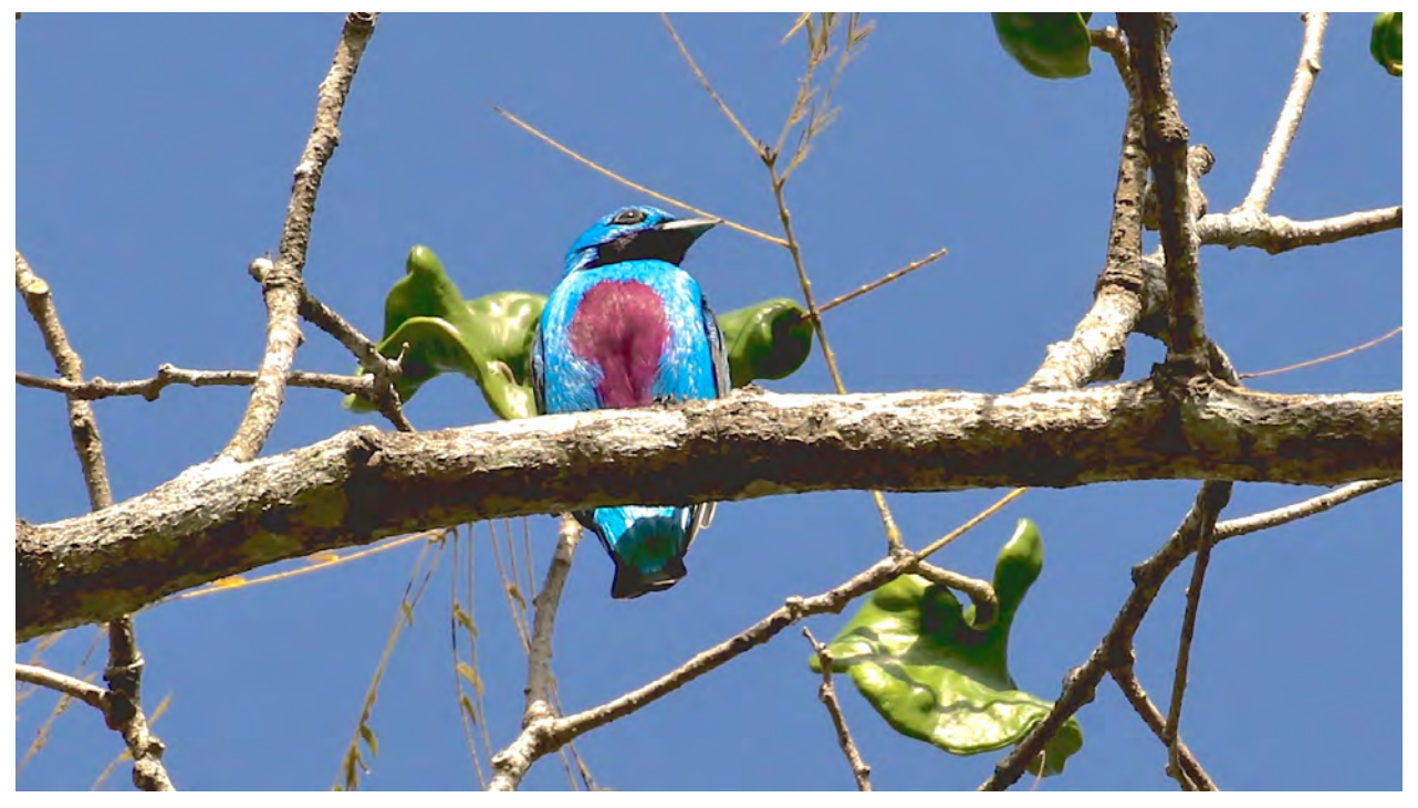
The brilliant Blue Cotinga has a limited distribution which includes Panama. We've had great views of this canopy-dweller from the Discovery Center Tower.

We include here information for those interested in the 2024 Field Guides Panama's Canopy Tower tour: