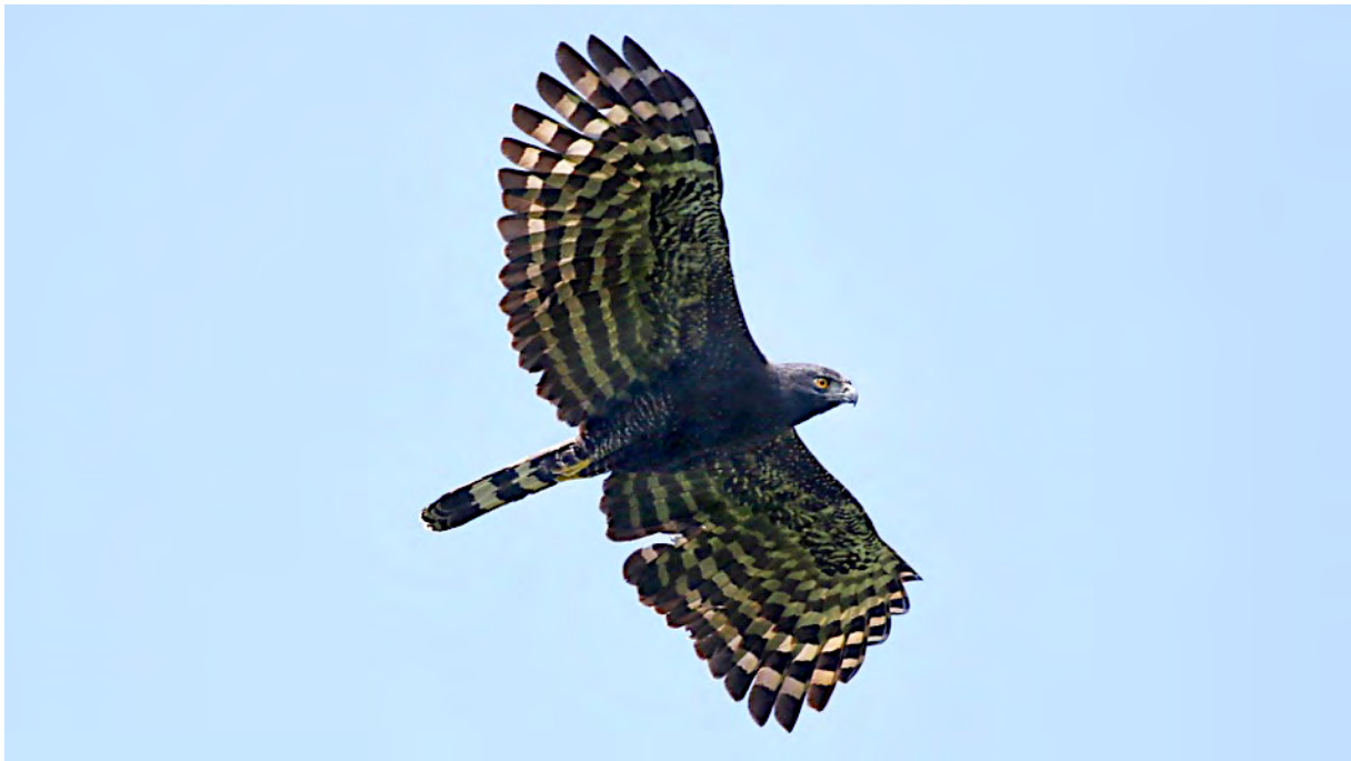
While Harpy Eagle is the most-wanted raptor for many birders (and we've had very good luck seeing them on recent tours!), we will also watch for a number of other large raptors, such as this beautiful Black Hawk-Eagle.

Day 5, Tue, 31 Dec. Boat trip on the Rio Chucunaque and its tributaries. After breakfast, we will likely take a boat trip on the Rio Chucunaque which may entail a drive to the town of Yaviza at the end of the Pan-American Highway or a closer locale depending on where the best birding has been at the time. We'll explore the inlets and waterways of the area and this could give us access to a Harpy Eagle site if a nest has been discovered. We will be out most of the day with a picnic lunch, returning to the camp in the late afternoon. Night at Canopy Camp.