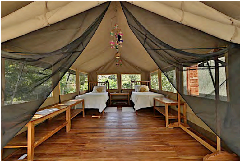
The Standard safari tents at the Canopy Camp are quite comfortable.