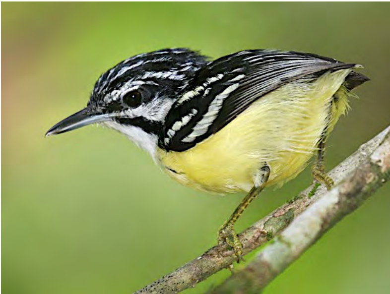
The tiny Moustached Antwren is one of 20 or so antbirds we'll watch for at the Canopy Camp. This species has an interesting distribution, found in eastern Panama and northern Colombia, and in a large area of northwestern Amazonia. These populations may represent different species.

About the Physical Requirements & Pace: This tour does not demand much physically and it will operate at a comfortable pace throughout. Participants should be able to walk up to two miles at a "birder's" pace and be able to walk trails that ascend a couple of hundred feet in elevation. Birding will take place along roads, wide tracks, forested trails, and from our boats along the rivers. While the heat may slow us down some during the middle of the day, temperatures early and late in the day are pleasant, and it is usually comfortable inside the forest. With this in mind, it is important to be in the field early to catch the peak of the bird activity.