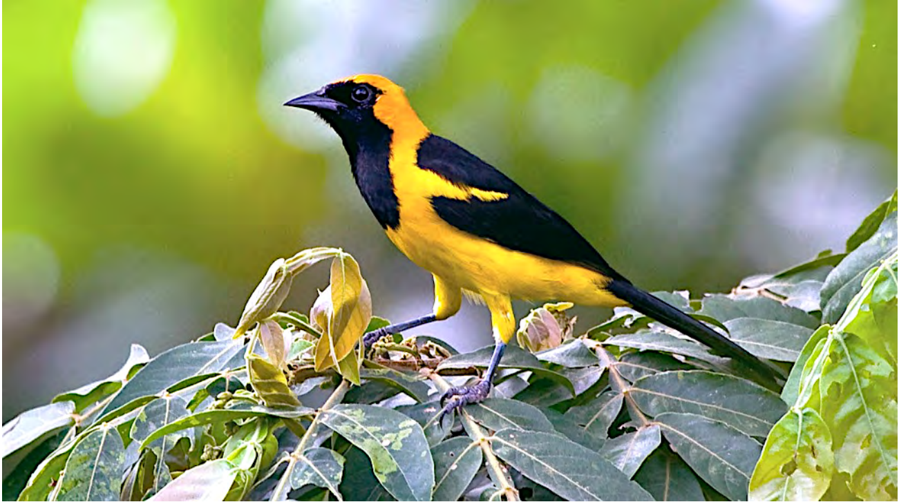
The Orange-crowned Oriole is restricted to the eastern half of Panama, and far northern South America. They are a localized species, not common, but we should see them near the camp.

We include here information for those interested in the 2019 Field Guides Panama's Canopy Camp tour: