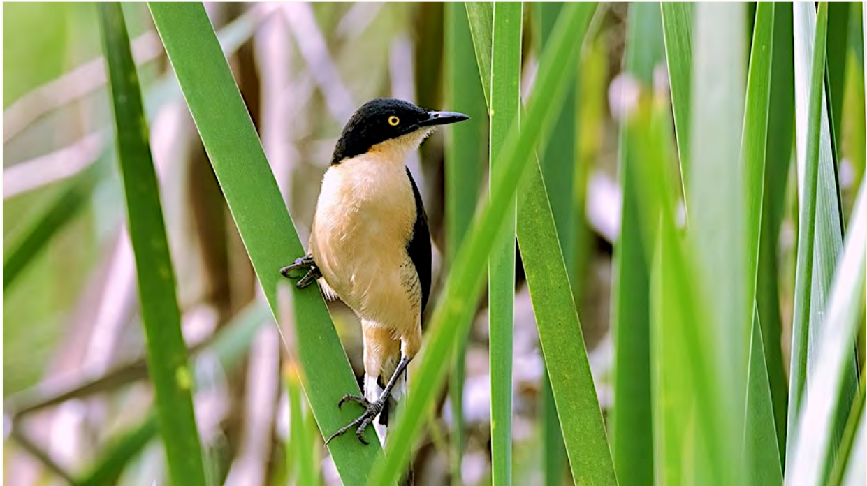
The Black-capped Donacobius is found in marshy areas from the Darien region of Panama south through much of South America.

reach, it may be necessary to walk a trail for up to two miles one-way. We will be out most of the day with a picnic lunch, returning to the camp in the late afternoon. Night at Canopy Camp.