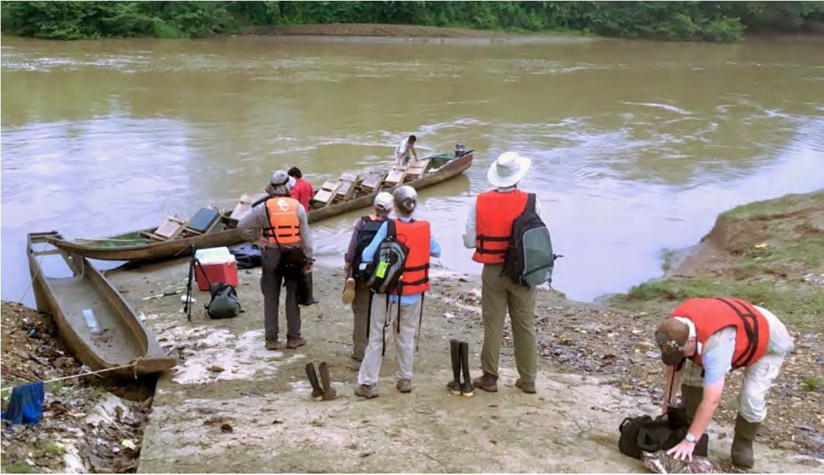
We will be using motorized “dugout” canoes to transport us along the rivers to reach several of our birding spots. We’ll also be walking on muddy trails: note the boots in this image!

We want to be sure you are on the right tour! Below is a description of the physical requirements of the tour. If you are concerned about the difficulty, please contact us about this and be sure to fully explain your concerns. We want to make sure you have a wonderful time with us, so if you are uncomfortable with the requirements, just let us know and we can help you find a better fitting tour! Field Guides will not charge you a change or cancellation fee if you opt out within 10 days of depositing.