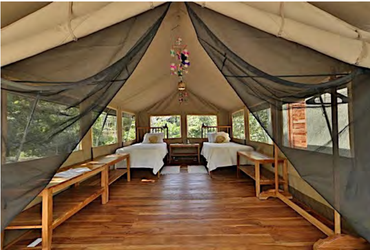
The Standard safari tents at the Canopy Camp are quite comfortable.

The standard tents are 173 square feet in area, and can be furnished with a queen bed or two single beds, plus bedside tables, chairs, and shelves for storage. The deluxe tents are a little larger (249 square feet), and can be furnished with a queen bed, or two twin beds, plus bedside tables, etc. The larger tents also have a small separate area that can be used for storage of your gear.