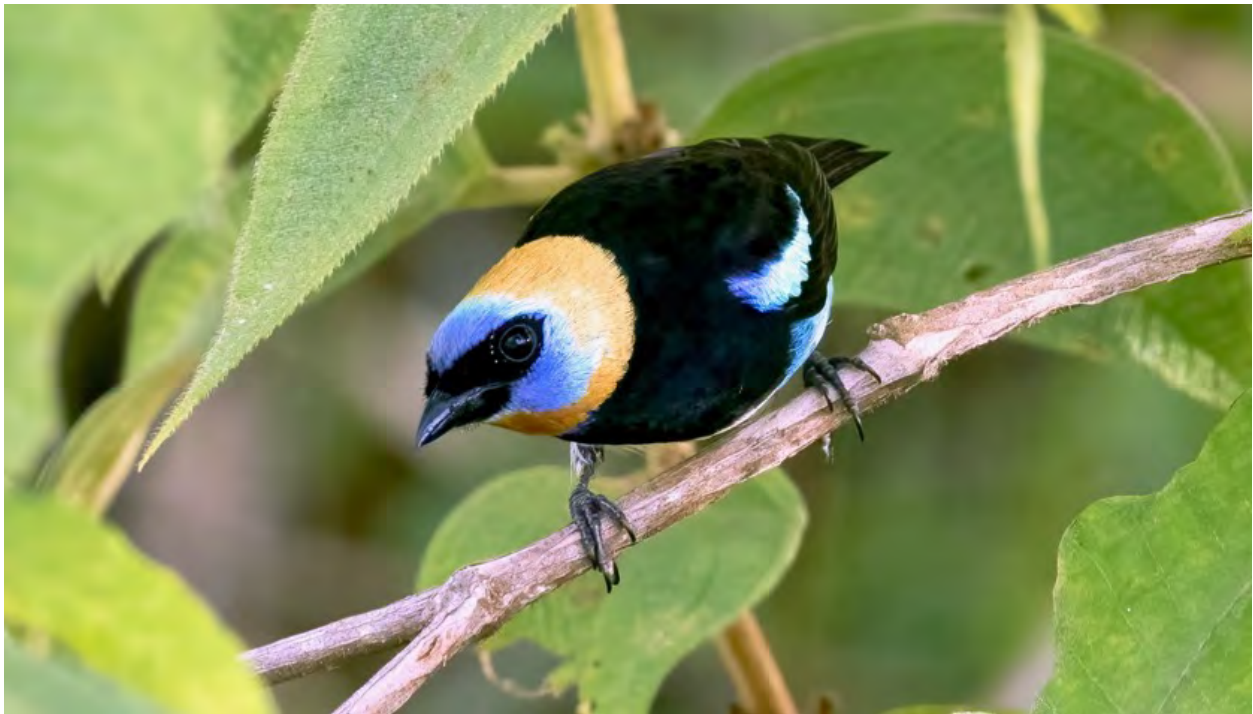
The lovely Golden-hooded Tanager is fairly common in Central America, and we should see them near the Canopy Camp.

All participants will be required to confirm they will have completed a full COVID vaccination course at least two weeks prior to the tour (which includes a booster for those eligible to have one). Note too, that many travel destinations may still require proof of vaccination for entry to bypass testing delays or quarantine, and that entry requirements for a destination can change at any time. Proof of a booster shot, too, may be a requirement for some travel destinations.