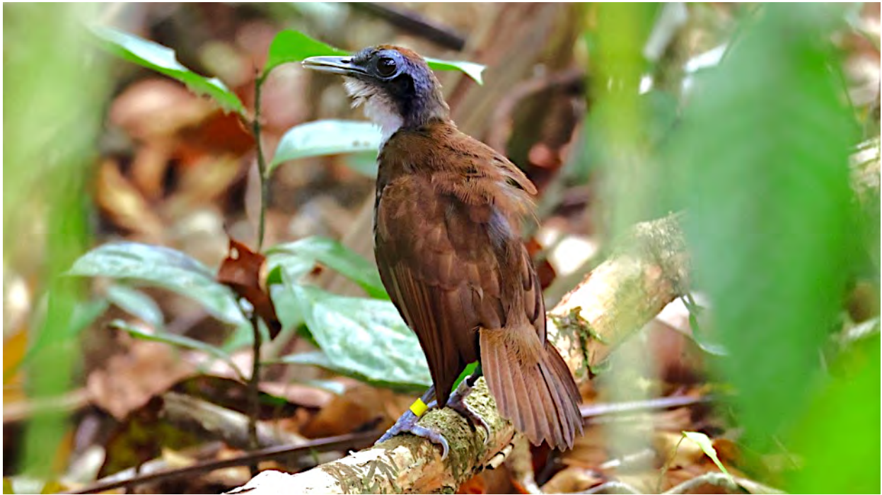
The Bicolored Antbird is an obligate ant-follower, so we'll hope to find a good army-ant swarm where we can view these and other insectivores.