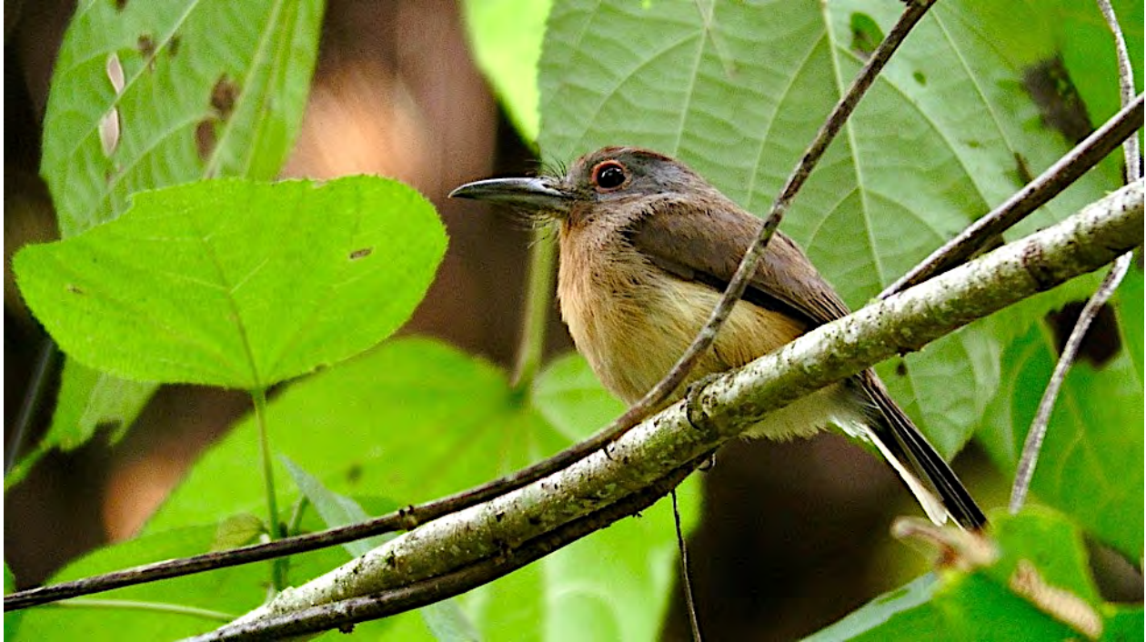
The Grey-cheeked Nunlet is a small puffbird with a limited range that includes the Darien region of Panama.

We include here information for those interested in the 2023 Field Guides Panama's Canopy Camp tour: