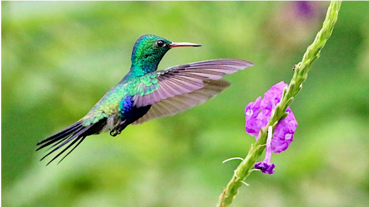
The Violet-bellied Hummingbird is one of the range-restricted birds we'll find in the Darien region of Panama.

We include here information for those interested in the 2024 Field Guides Panama's Canopy Camp tour: