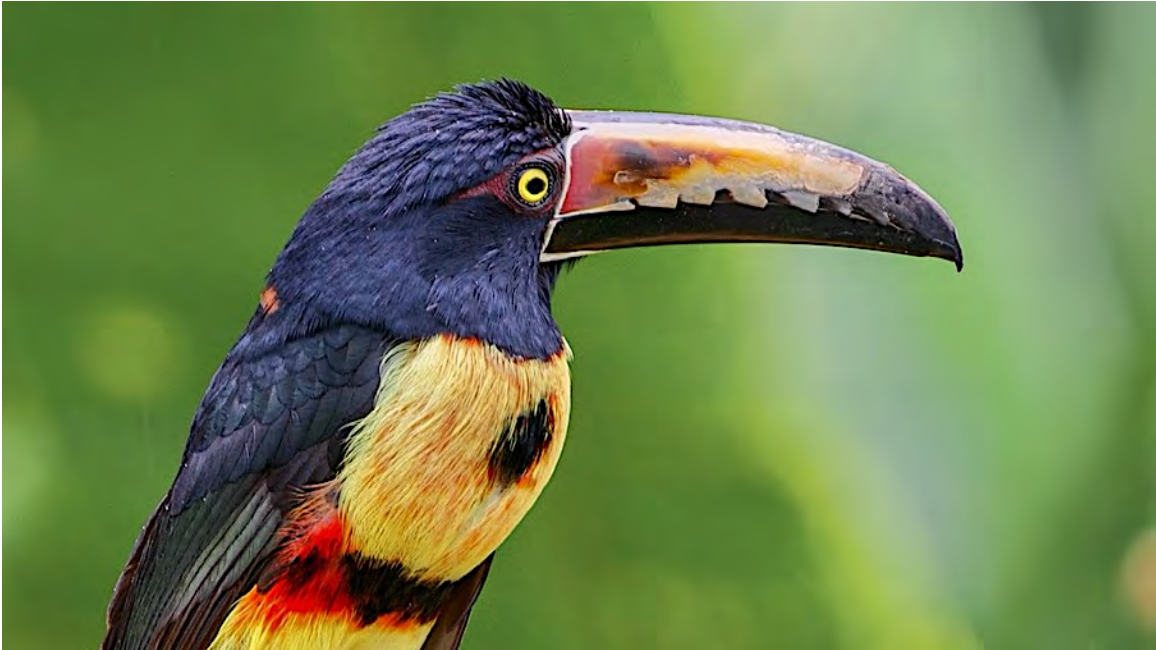
We'll see Collared Aracaris and many other tropical beauties around the camp itself. These small toucans are regulars at the banana feeders.

Day 3, Sun, 29 Dec. Canopy Camp birding. We will meet around dawn for birding the clearing of the camp. We will want to scan the forest treetops for perched parrots, toucans, and other delicacies. After breakfast, we'll walk one of the forest trails that leaves from the clearing. We will return to the camp for lunch and a siesta before checking a nearby birding site in the afternoon. Night at Canopy Camp.