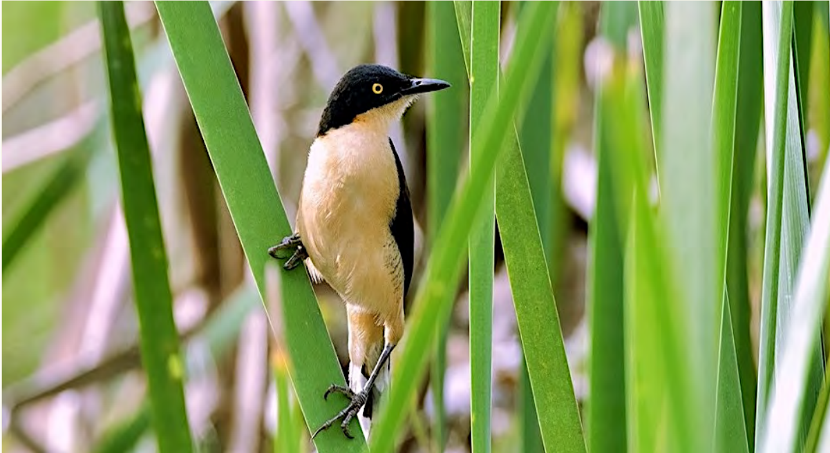
The Black-capped Donacobius is found in marshy areas from the Darien region of Panama south through much of South America.

village. If the river is still high we will take dugouts to the village. This recently “discovered” birding area allows access to habitat for Dusky-backed Jacamar. We will take a picnic lunch with us so we can stay a good part of the day in this excellent forest. Night at Canopy Camp.