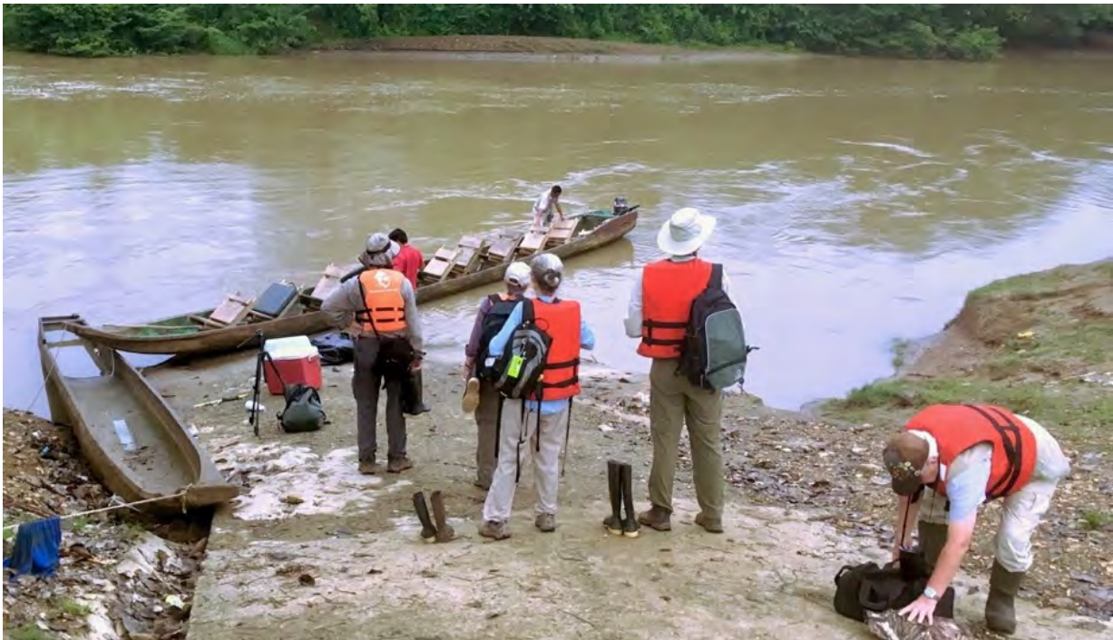
We will be using motorized "dugout" canoes to transport us along the rivers to reach several of our birding spots. We'll also be walking on muddy trails: note the boots in this image!

We want to be sure you are on the right tour! Below is a description of the physical requirements of the tour. If you are concerned about the difficulty, please contact us about this and be sure to fully explain your concerns. We want to make sure you have a wonderful time with us, so if you are uncomfortable with the requirements, just let us know and we can help you find a better fitting tour! Field Guides will not charge you a change or cancellation fee if you opt out within 10 days of depositing.