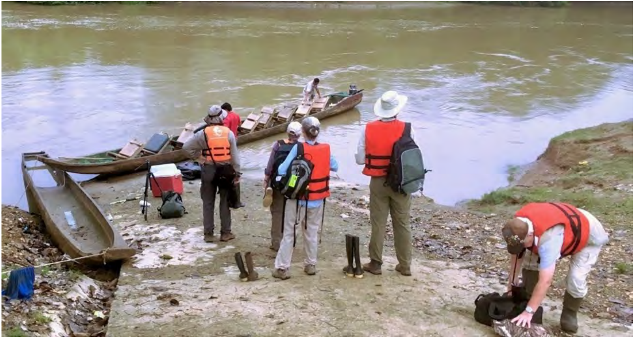
We will be using motorized “dugout” canoes to transport us along the rivers to reach several of our birding spots. We’ll also be walking on muddy trails: note the boots in this image!