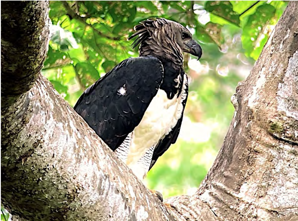
We'll hope that the Harpy Eagles will be nesting, and that we'll be able to see these impressive predators. This one was observed on our 2022 tour.

Day 3, Mon, 29 Dec. Canopy Camp birding. We will meet around dawn for birding the clearing of the camp. We will want to scan the forest treetops for perched parrots, toucans, and other delicacies. After breakfast, we'll walk one of the forest trails that leaves from the clearing. We will return to the camp for lunch and a siesta before checking a nearby birding site in the afternoon. Night at Canopy Camp.