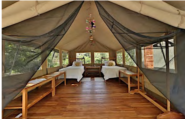
The Standard safari tents at the Canopy Camp are quite comfortable.

The standard tents are 173 square feet in area, and can be furnished with a queen bed or two single beds, plus