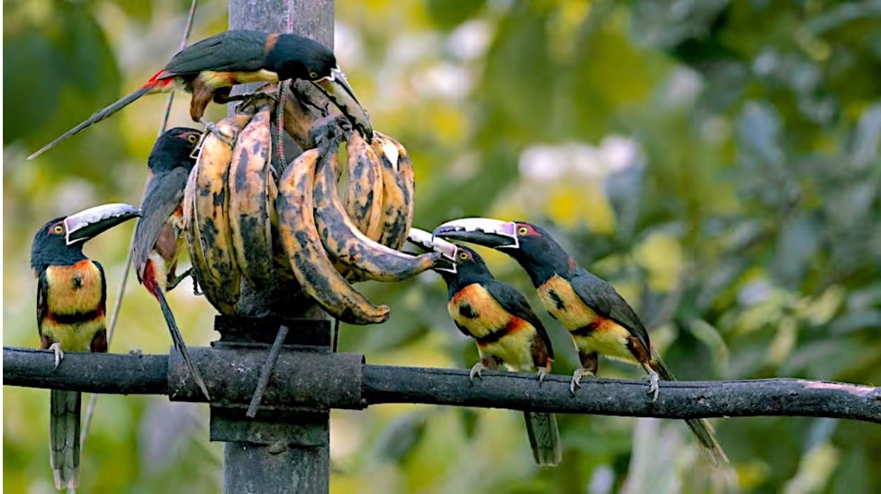
We'll see Collared Aracaris and many others around the camp itself. These small toucans are regulars at the banana feeders.

We include here information for those interested in the 2025 Field Guides Panama's Canopy Camp tour: