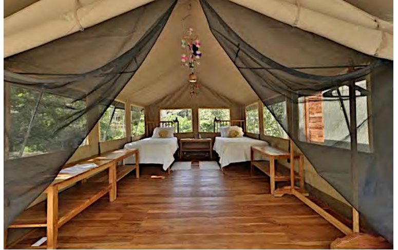
The Standard safari tents at the Canopy Camp are quite comfortable.

Detailed descriptions of the tents with photos are available at https://canopytower.com/canopy-camp/accommodations/ .