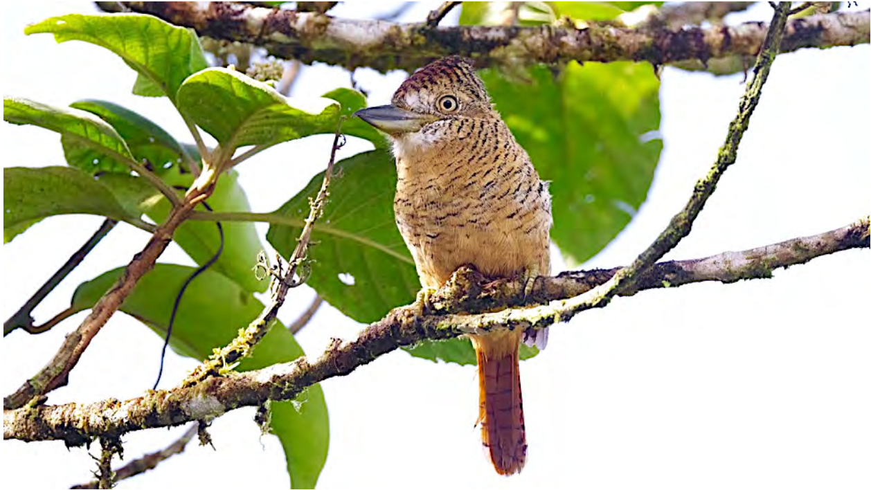
The Barred Puffbird has a small range that includes the Darien region of Panama. They are sit and wait predators, so we'll need to keep a sharp eye out to find one.

We include here information for those interested in the 2026 Field Guides Panama's Canopy Camp tour: