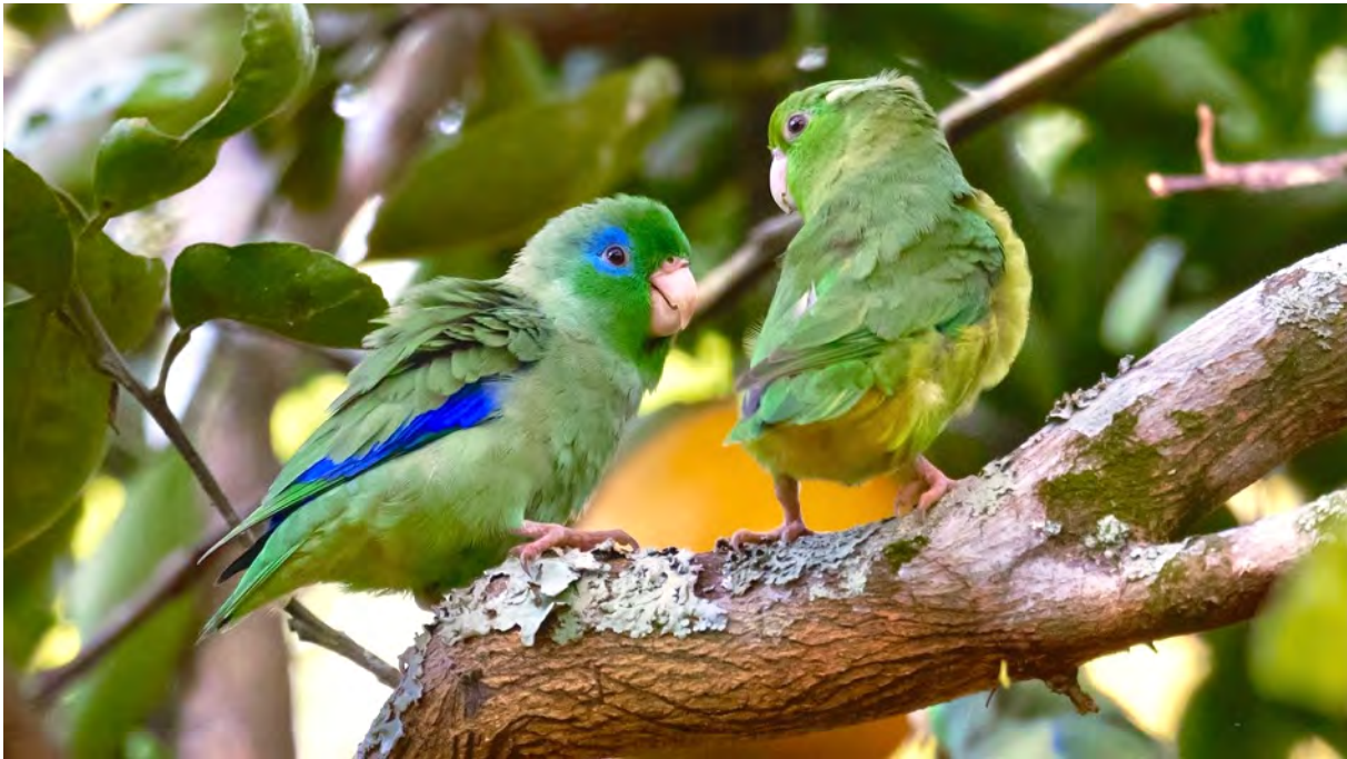
Spectacled Parrotlets have a limited range in eastern Panama, Colombia and Venezuela. They can often be found by listening for their vocalizations.

We want to be sure you are on the right tour! Below is a description of the physical requirements of the tour. If you are concerned about the difficulty, please contact us about this and be sure to fully explain your concerns. We want to make sure you have a wonderful time with us, so if you are uncomfortable with the requirements, just let us know and we can help you find a better fitting tour! Field Guides will not charge you a change or cancellation fee if you opt out within 10 days of depositing.