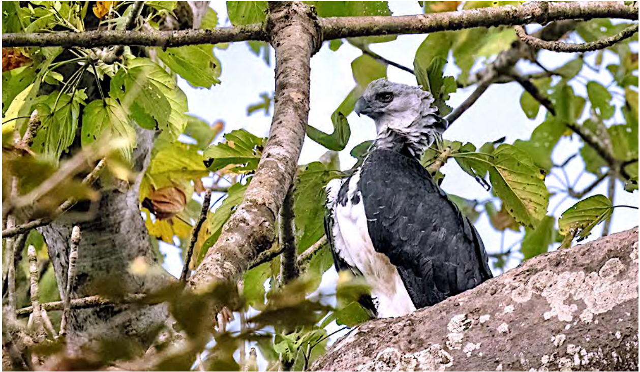
We'll hope that the Harpy Eagles will be nesting, and that we'll be able to see these impressive predators. This one was observed on our 2025 tour.

Day 3, Tue, 29 Dec. Canopy Camp birding. We will meet around dawn for birding the clearing of the camp. We will want to scan the forest treetops for perched parrots, toucans, and other delicacies. After breakfast, we'll walk one of the forest trails that leaves from the clearing. We will return to the camp for lunch and a siesta before checking a nearby birding site in the afternoon. Night at Canopy Camp.