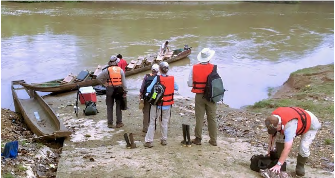
We will be using motorized “dugout” canoes to transport us along the rivers to reach several of our birding spots. We’ll also be walking on muddy trails: note the boots in this image!