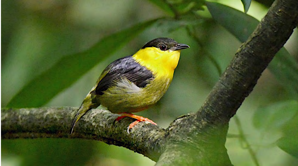
A male Golden-collared Manakin glows against the backdrop of the forest. These manakins reach their northern limit in Panama; they are restricted to Panama and northern Colombia.

The Fortuna Road also supports an impressive list of additional species restricted within Panama to the western foothills. Additional specialties such as Barred Hawk, Lattice-tailed Trogon, Spotted Woodcreeper, Russet Antshrike, Black-headed Antthrush, Rufous-browed Tyrannulet, Golden-bellied Flycatcher, Black-and-white Becard, Snowy Cotinga, Azure-hooded Jay, and the striking Sooty-faced Finch are present and we'll keep alert for these. The list of resident species is longer still and includes the spectacular Bare-necked Umbrellabird and Snowcap. The richness of this area is so remarkable that we'll have our hands full seeing just a healthy percentage of these birds.