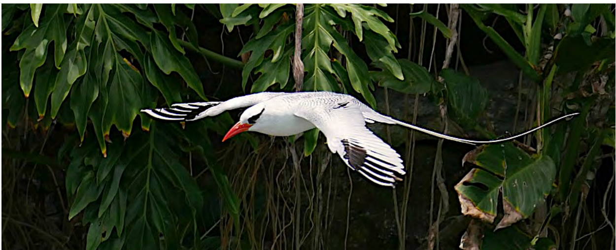
Red-billed Tropicbirds breed on Bird Island near Tranquilo Bay. We'll try to make a visit to the island to see them, and breeding Brown Boobies that also nest there.

Day 8, Fri, 8 Mar. La Fortuna Road. We'll have a full day to bird the exciting Fortuna Road that passes from Chiriqui north into Bocas del Toro. We'll depart early in the morning (after a good breakfast) and take a 45-minute boat ride to Puerto Robalo on the mainland to reach the best habitat for the peak of bird activity; the potential rewards are enormous. We'll have a picnic lunch in order to enjoy without interruption the variable vistas of undisturbed foothill forest, perhaps unsurpassed in all of Middle America. Night in Tranquilo Bay.