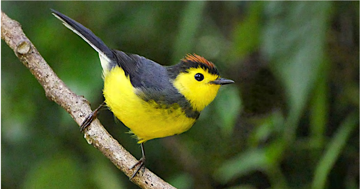
Collared Redstart is a near-endemic, found in the highlands of Panama and neighboring Costa Rica. These charming little warblers are active foragers, and one of over 30 warbler species that we might see.

We include here information for those interested in the 2019 Field Guides Western Panama tour: