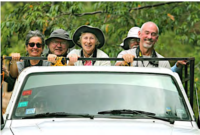
A recent Field Guides group enjoying a ride in a "Mount Totumas limousine", as they called the 4X4's that we use to get up the mountain.

Rest assured, you will not be disappointed in the remarkable avian richness this short tour has to offer.