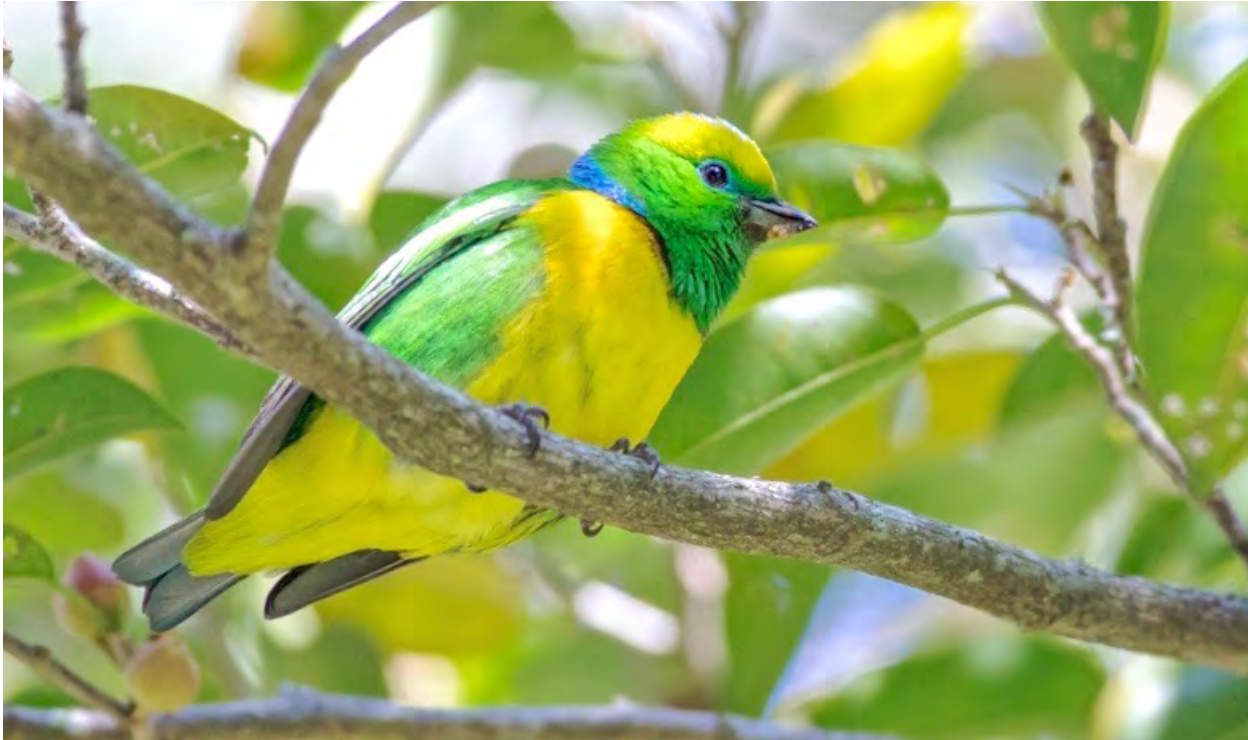
The lovely Golden-browed Chlorophonia is one of the near-endemics we'll look for in highlands of Western Panama. We'll look for these small colorful birds when we visit Mount Totumas.

We include here information for those interested in the 2022 Field Guides Western Panama tour: