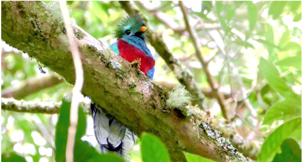
Many birders have the Resplendent Quetzal at the top of their "most-wanted" list. Mount Totumas is a wonderful place to find these magnificent birds.

umbrellas, sun, and fun. And birds...lots of birds. The lodge and island are part of the Isla Bastimentos Marine Park, and the property has recorded more than 200 species of birds. With day trips to the mainland and short excursions to other islands that total is pushed to 460 species. The lodge has six comfortable cabins with air-conditioning, coffee makers, and warm showers, and is located within a forest clearing near a 100-foot birding tower. Surrounding forest trails host leks of Golden-collared Manakins, Chestnut-backed Antbird is conspicuous, and this is one of the few sites in Panama to see Stub-tailed Spadebill. Green Ibis are quite common, along with soaring Double-toothed Kites and flocks of raucous Tawny-crested Tanagers. We will be scanning treetops for Snowy Cotinga; another target for us will be the local and limited-range Nicaraguan Seed-Finch. Other offshore islands hold breeding colonies of Brown Booby and Red-billed Tropicbird, which we should be able to get close to and observe well (weather dependent). In the evening we will dine in luxury with delicious local and international dishes.