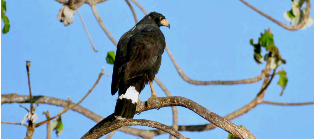
The Common Black Hawk can be quite plentiful near Tranquilo Bay. These water-loving raptors find abundant crabs and other delicacies in the mangroves.

Day 7, Thu, 3 Mar. Tranquilo Bay Lodge grounds and Isla Popa. Today we will enjoy the lodge grounds and trails along with a morning visit to the tower. We will have lunch at the lodge, an afternoon siesta, and then visit Isla Popa for a chance at Snowy Cotinga. Night at Tranquilo Bay.