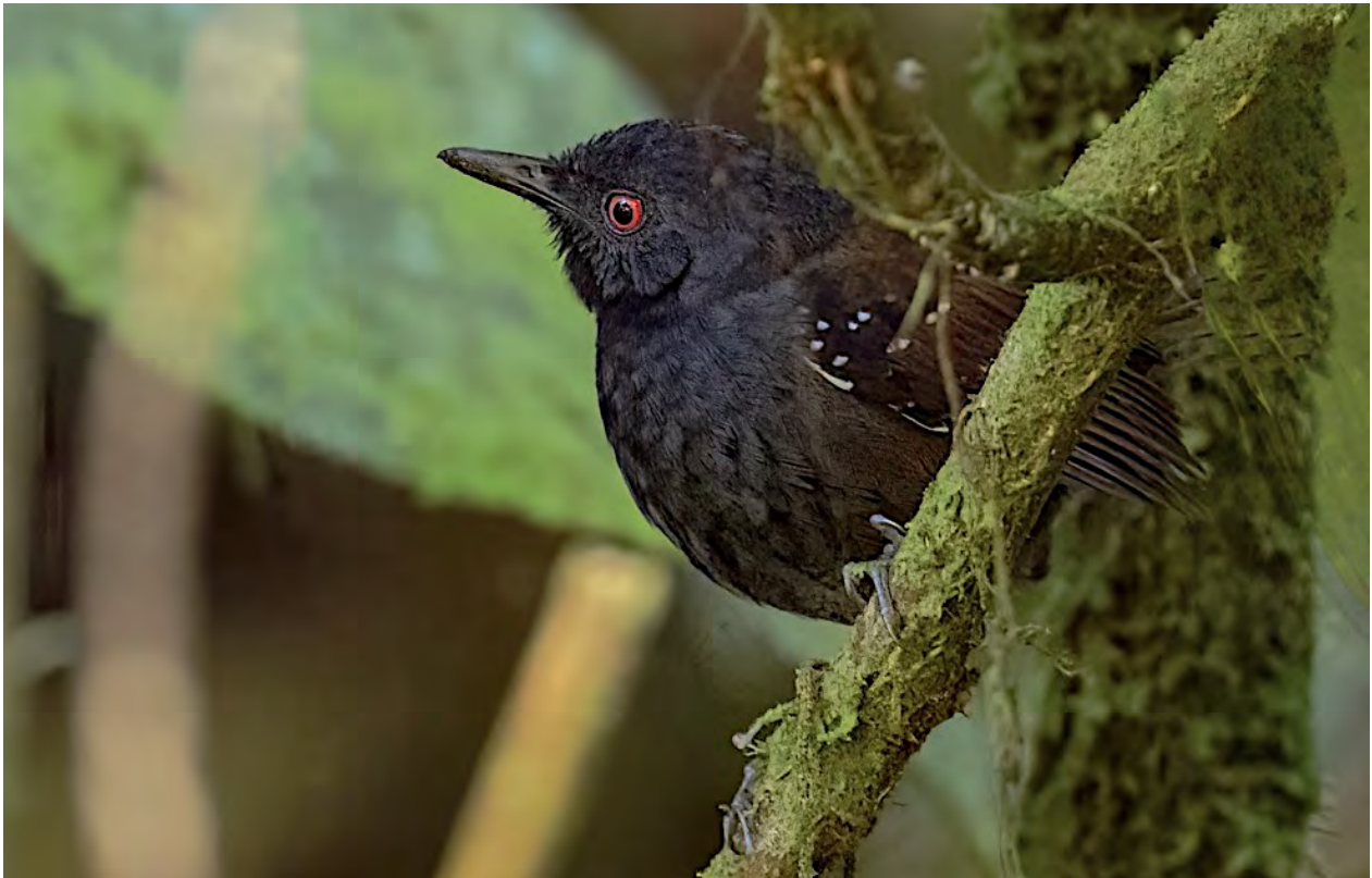
In the western foothills, we'll look for a number of understory inhabitants such as the attractive Dull-mantled Antbird.

Tranquilo Bay —Tranquilo Bay Lodge is located in the Bocas del Toro archipelago on the island of Bastimentos. It is a 35-minute boat ride to the south of Bocas del Toro (the provincial capital from which we fly out of), which is found on the island of Colon. This is the Caribbean lowland with its lush tropical forest, turquoise blue waters, fruity drinks with little umbrellas, sun, and fun. And birds...lots of birds. The lodge and island are part of the Isla Bastimentos Marine Park, and the property has recorded more than 200 species of birds. With day trips to the mainland and short excursions to other islands that total is pushed to 460 species. The lodge has six comfortable cabins with air-conditioning, coffee makers, and warm showers, and is located within a forest clearing near a 100-foot birding tower. Surrounding forest trails host leks of Golden-collared Manakins, Chestnut-backed Antbird is conspicuous, and this is one of the few sites in Panama to see Stub-tailed Spadebill. Green Ibis are quite common, along with soaring Double-toothed Kites and flocks of raucous Tawny-crested Tanagers. We will be scanning treetops for Snowy Cotinga; another target for us will be the local and limited-range Nicaraguan Seed-Finch. Other offshore islands hold breeding colonies of Brown Booby and Red-billed Tropicbird, which we should be able to get close to and observe well (weather dependent). In the evening we will dine in luxury with delicious local and international dishes.