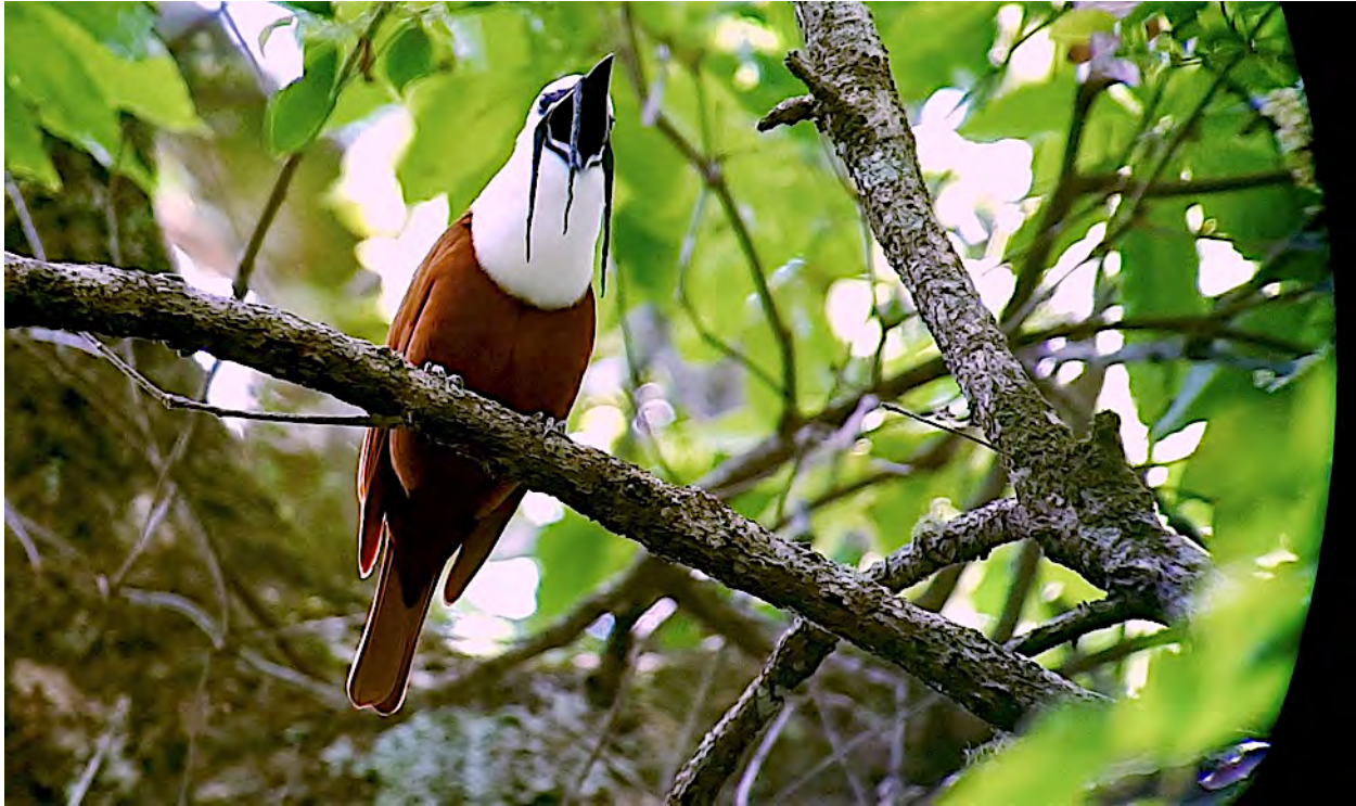
The Three-wattled Bellbird is a canopy-dweller that can be difficult to see when the males are not vocalizing. Our tour is timed to be at Mount Totomas when these spectacular birds are arriving for the breeding season.

We include here information for those interested in the 2023 Field Guides Western Panama tour: