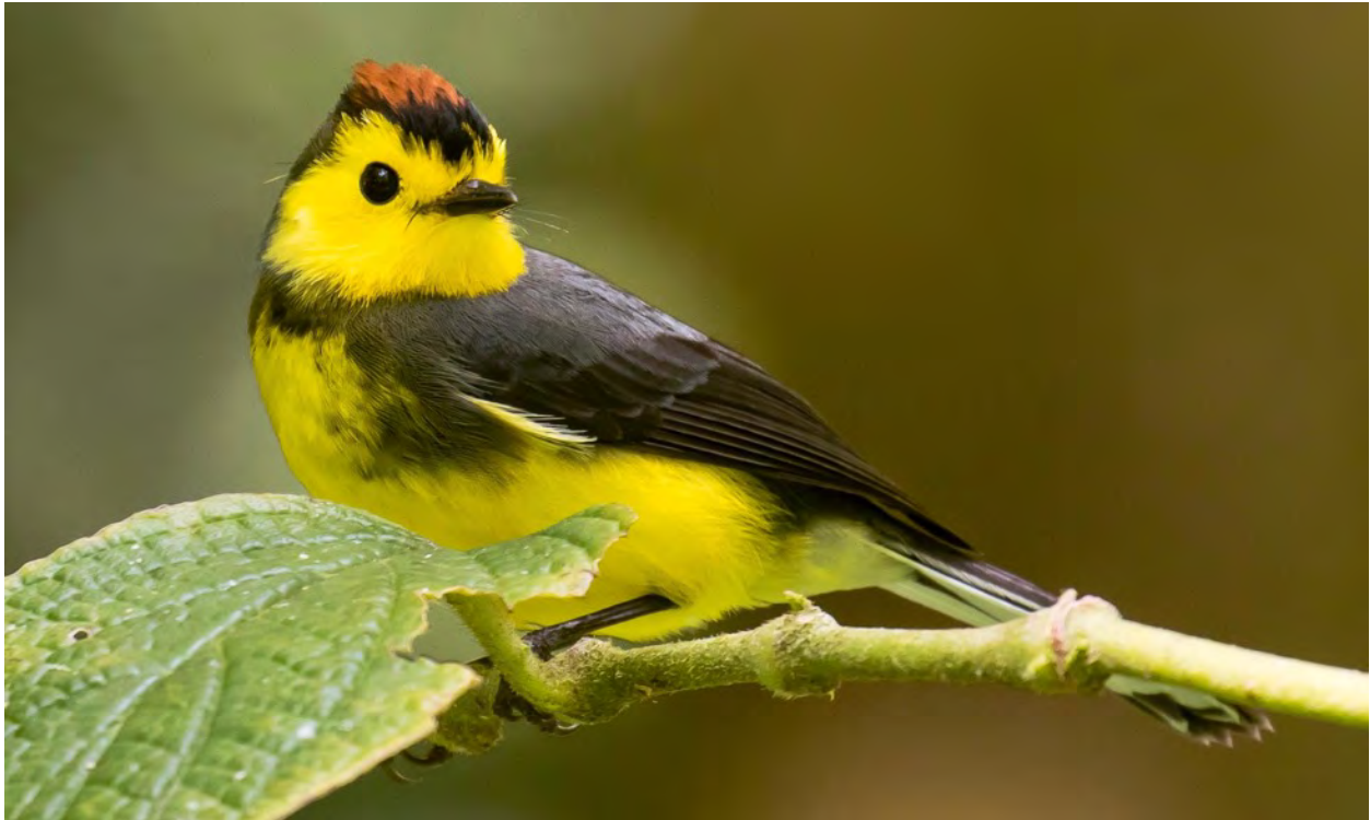
The charming Collared Redstart is a near-endemic of the Chiriqui highlands.

After arriving in Panama City on Day 1, we'll take the following morning's (Day 2) scheduled flight to David. Upon arrival we will be transferred via 4X4's to the location of the very comfortable Mount Totumas Cloud Forest Lodge. In the rich Chiriqui highlands we'll be looking for Three-wattled Bellbirds and Resplendent Quetzals—the real showstoppers—along with other fascinating birds such as Ornate Hawk-Eagle, Spotted Wood-Quail, Streak-breasted Treehunter, Stripe-tailed Hummingbird, Sulphur-winged Parakeet, and Flame-colored Tanager. We will also bird the foothills along the Fortuna Road, where the forest is some of the most beautiful in Central America. Among the many species we hope to see (and favorites of past tours) are Chiriqui Quail-Dove, Slaty-backed Nightingale-Thrush, Prong-billed Barbet, Golden-browed Chlorophonia, Azure-hooded Jay, Dull-mantled Antbird, Brown-billed Scythebill, Orange-bellied Trogon, and Crimson-collared Tanager.