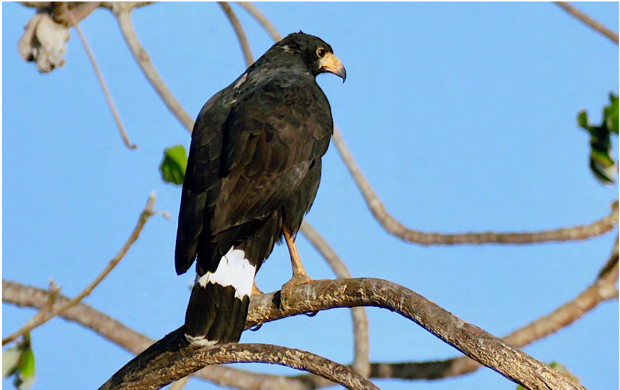
The Common Black Hawk can be quite plentiful near Tranquilo Bay. These water-loving raptors find abundant crabs and other delicacies in the mangroves.

Day 7, Thu, 2 Mar. Tranquilo Bay Lodge grounds and Isla Popa. Today we will enjoy the lodge grounds and trails along with a morning visit to the tower. We will have lunch at the lodge, an afternoon siesta, and then visit Isla Popa for a chance at Snowy Cotinga. Night at Tranquilo Bay.