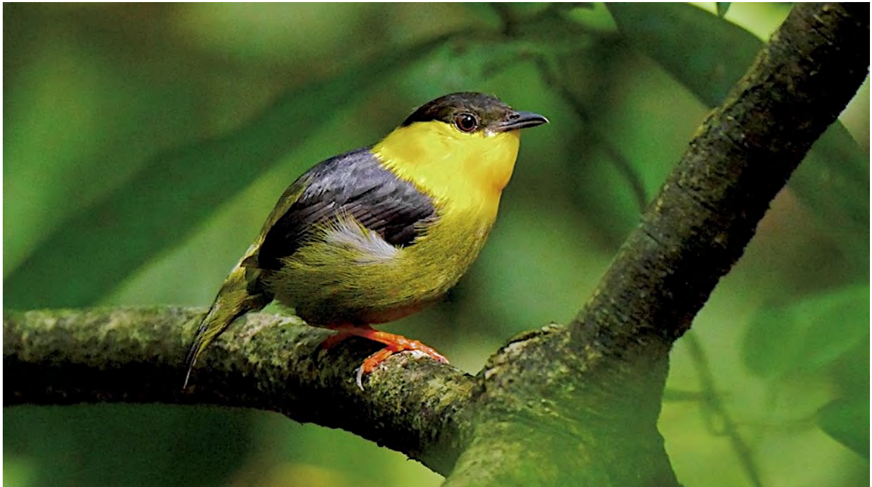
The Golden-collared Manakin is found in lowland forests from Costa Rica to the coastal regions of northern Colombia. These charismatic little birds can be seen near our lodging at Tranquilo Bay.