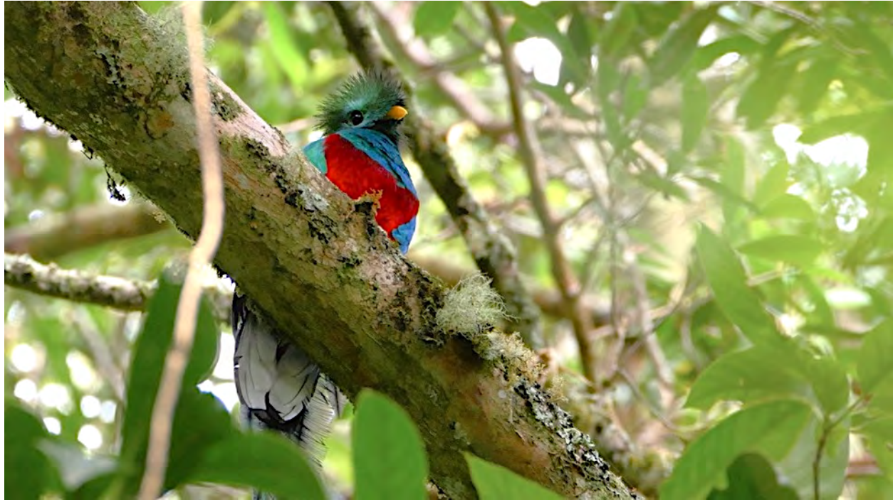
Resplendent Quetzal is one of the most spectacular birds of the American tropics. We've seen these beauties well at Mount Totomas.

We include here information for those interested in the 2025 Field Guides Western Panama: Chiriqui & Bocas del Toro tour: