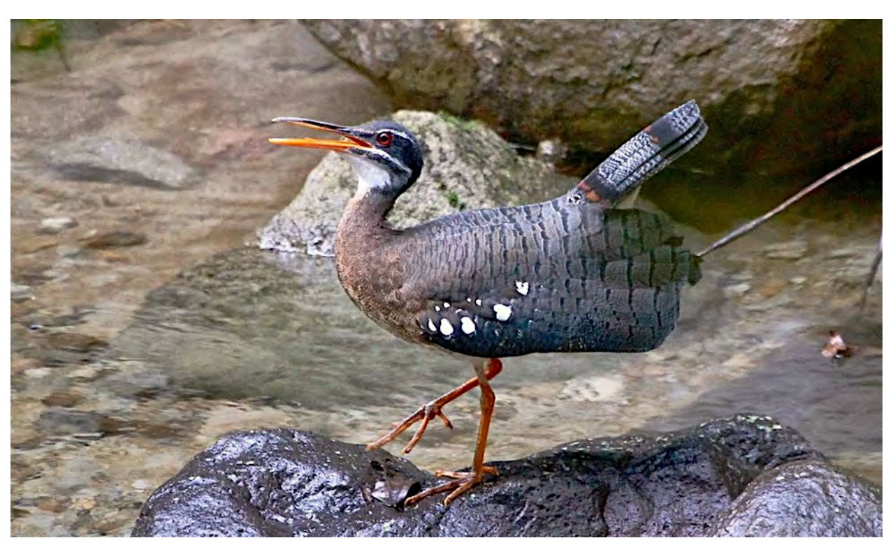
The spectacular Sunbittern can often be seen from the dining area of the lodge. That would be a great way to kick off a new year-list, for sure!

This location is such a splendid base for our birding that Panama's Canopy Lodge makes a perfect tour for spouses who might be "lite" birders. And it will certainly make a superb introductory tour to Neotropical birds, and an exciting tour for birders who have birded some in Middle America but are still looking for their first Tody Motmot or Rosy Thrush-Tanager, and for those who have birded widely but who are still looking for their first Black-crowned Antpitta or Rufous-browed Tyrannulet while at the same time looking to relax a bit on a birder's holiday.