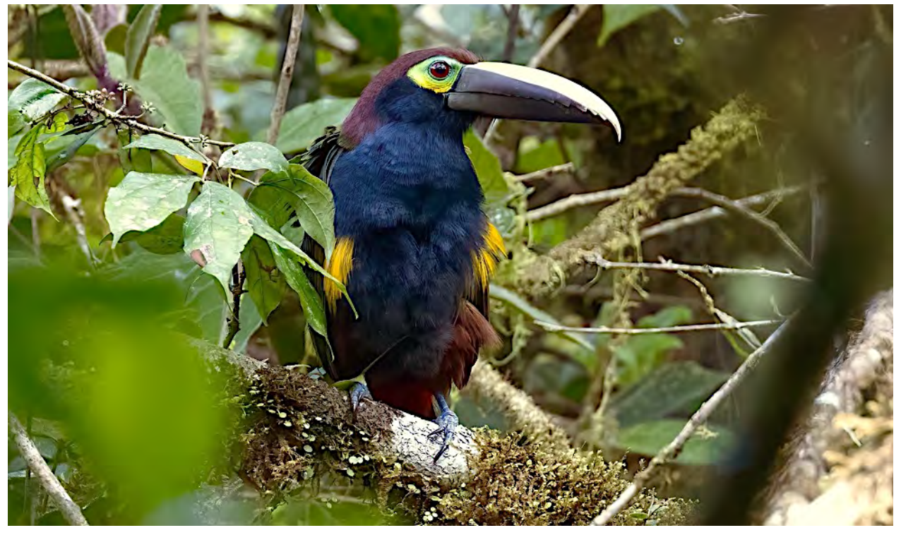
Yellow-eared Toucanet is a bird we don't always find, but we had great looks on last year's tour. We'll definitely be on the lookout this year!

We include here information for those interested in the 2023 Field Guides Panama's Canopy Lodge tour: