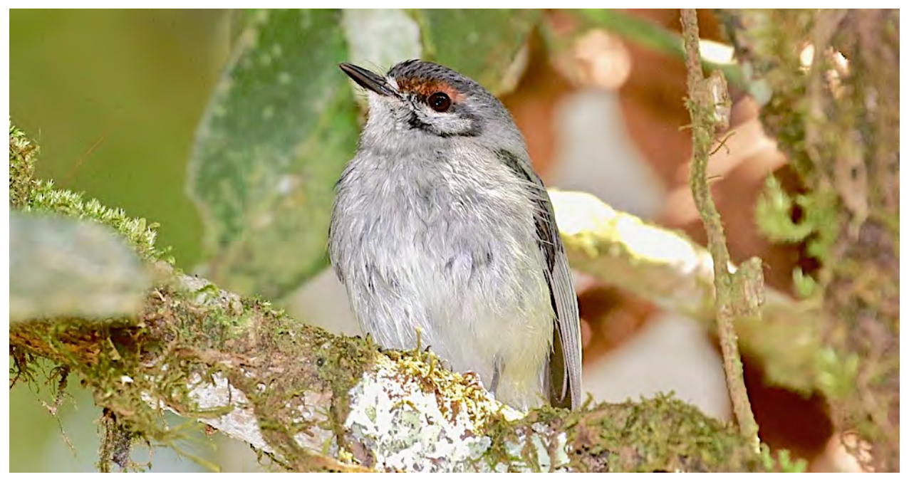
The Rufous-browed Tyrannulet is a small flycatcher found in the humid highland forests of Panama and neighboring Costa Rica.

We'll concentrate our effort along the ridge above Mata Ahogado. This ridge is blanketed in an impressive shroud of mature cloudforest. Birding mostly from the roadside, we will search for Double-toothed and Gray-headed kites, White Hawk, Brown-hooded Parrot, Violet Sabrewing, Green Thorntail, Northern Emerald Toucanet, Red-faced Spinetail, Spotted Barbtail, Russet Antshrike, Tufted Flycatcher, Rufous-browed Tyrannulet, White-throated Spadebill, Eye-ringed Flatbill, Pale-vented Thrush, and Black-and-yellow, Dusky-faced, and Tawny-crested tanagers. Rarer species, including Snowcap, Tawny-throated Leaftosser, Brown-billed Scythebill, and the spectacular Black-crowned Antpitta, occur in this area. Later in the morning, we will explore at least one trail, perhaps including a fairly steep, but well-maintained path to a lookout. Here we will have additional chances for secretive species of the forest interior. Because of the foothill altitude (up to 1200 meters, or 4000 feet), the temperatures frequently remain cool late in the day and mid-day birding can be surprisingly good. After a picnic lunch, we'll bird until mid-afternoon and then start back for the Lodge.