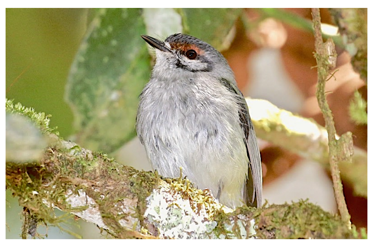
The Rufous-browed Tyrannulet is a small flycatcher found in the humid highland forests of Panama and neighboring Costa Rica.

Hawk, Brown-hooded Parrot, Green Thorntail, Northern Emerald Toucanet, Red-faced Spinetail, Spotted Barbtail, Russet Antshrike, Tufted Flycatcher, Rufous-browed Tyrannulet, White-throated Spadebill, Pale-vented Thrush, and Black-and-yellow, Dusky-faced, and Tawny-crested tanagers. Rarer species, including Snowcap, Brown-billed Scythebill, and the spectacular Black-crowned Antpitta, also occur in this area. Later in the morning, we will explore at least one trail, perhaps including a fairly steep (but well-maintained) path to a lookout. Here, we'll have additional chances for secretive species of the forest interior. Because of the foothill altitude (up to 1200 meters, or 4000 feet), the temperatures frequently remain cool late into the day and mid-day birding can be surprisingly good. After a picnic lunch, we'll bird until mid-afternoon and then start back to the Lodge.