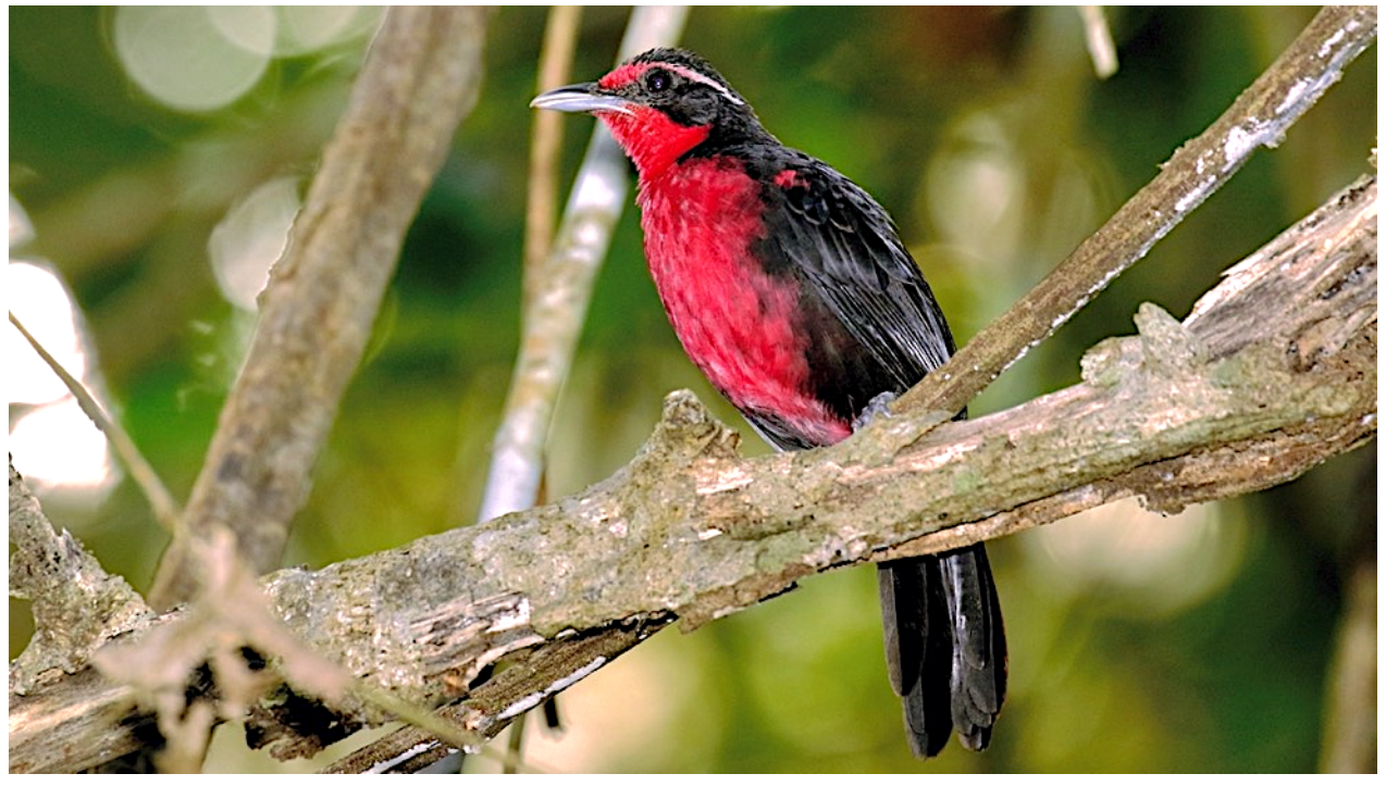
The Rosy Thrush-Tanager has an odd distribution that may indicate that more than one species is involved. Nevertheless, this lovely bird can be found in Panama, and we'll do our best to find one.

We include here information for those interested in the 2024 Field Guides Panama's Canopy Lodge tour: