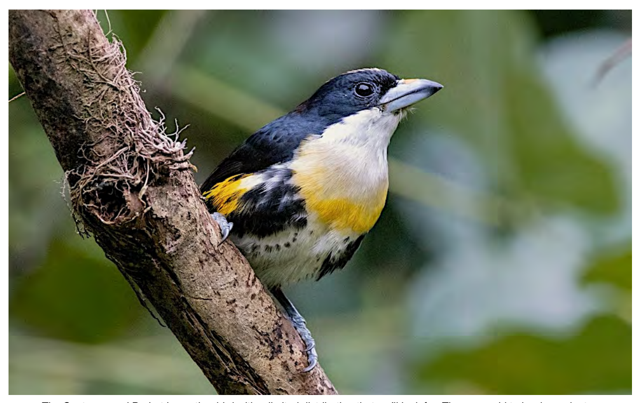
The Spot-crowned Barbet is another bird with a limited distribution that we'll look for. They are said to be dependent on lowland forests, where they feed on fruits and insects, and occasionally follow army ant swarms. They've also been seen at the Canopy Camp feeders.

We'll concentrate our efforts along the ridge above Mata Ahogado – a ridge blanketed in an impressive shroud of mature cloudforest. Birding mostly from the roadside, we will search for Double-toothed and Gray-headed kites, White Hawk, Brown-hooded Parrot, Green Thorntail, Northern Emerald Toucanet, Red-faced Spinetail, Spotted Barbtail, Russet Antshrike, Tufted Flycatcher, Rufous-browed Tyrannulet, White-throated Spadebill, Pale-vented Thrush, and Black-and-yellow, Emerald, and Tawny-crested tanagers. Rarer species, including Snowcap, Brown-billed Scythebill, and the spectacular Black-crowned Antpitta, also occur in this area. Later in the morning, we will explore at least one trail, perhaps including a fairly steep (but well-maintained) path to a lookout. Here, we'll have additional chances for secretive species of the forest interior. Because of the foothill altitude (up to 1200 meters, or 4000 feet), the temperatures frequently remain cool late into the day and mid-day birding can be surprisingly good. After a picnic lunch, we'll bird until mid-afternoon and then start back to the Lodge.