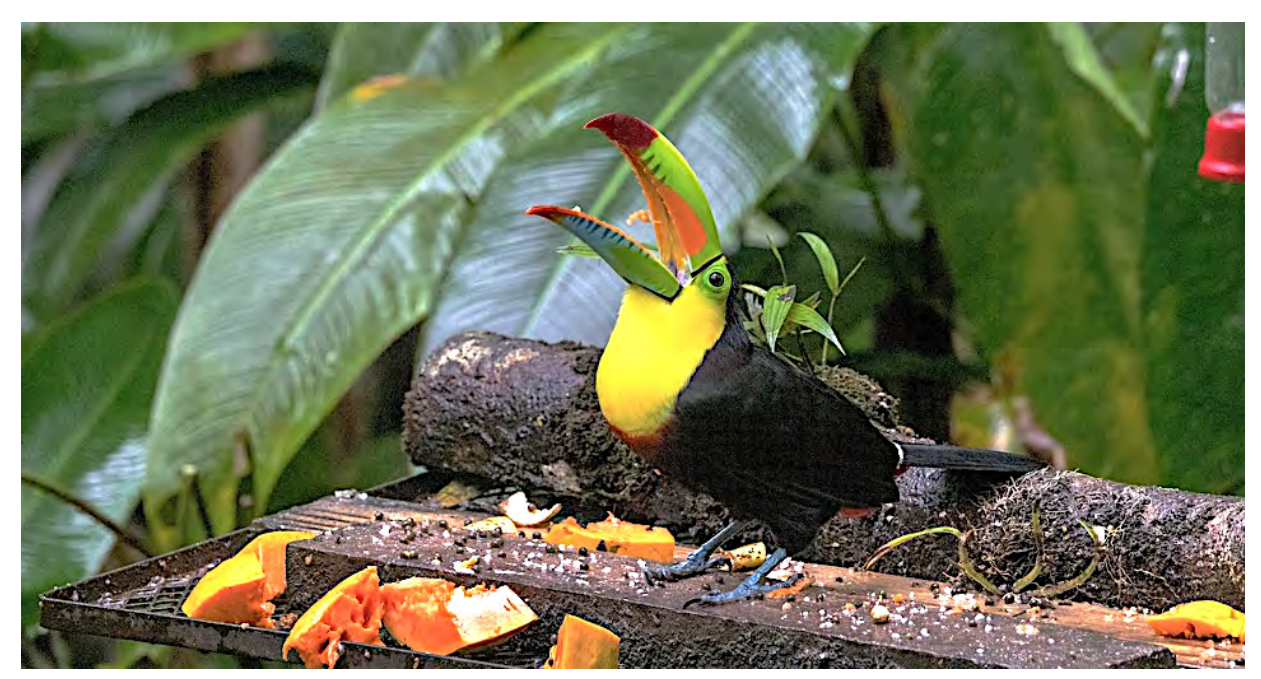
The feeders at the Canopy Lodge are well-known for attacting a wide variety of birds. Here, a Keel-billed Toucan is enjoying the buffet.