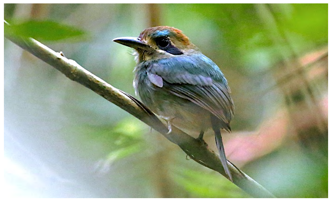
The Tody Motmot is the smallest of the motmots, and is one of the most difficult to see. These birds tend to be uncommon, but we've had good luck finding them near the Canopy Lodge.

We include here information for those interested in the 2025 Field Guides Panama's Canopy Lodge tour: