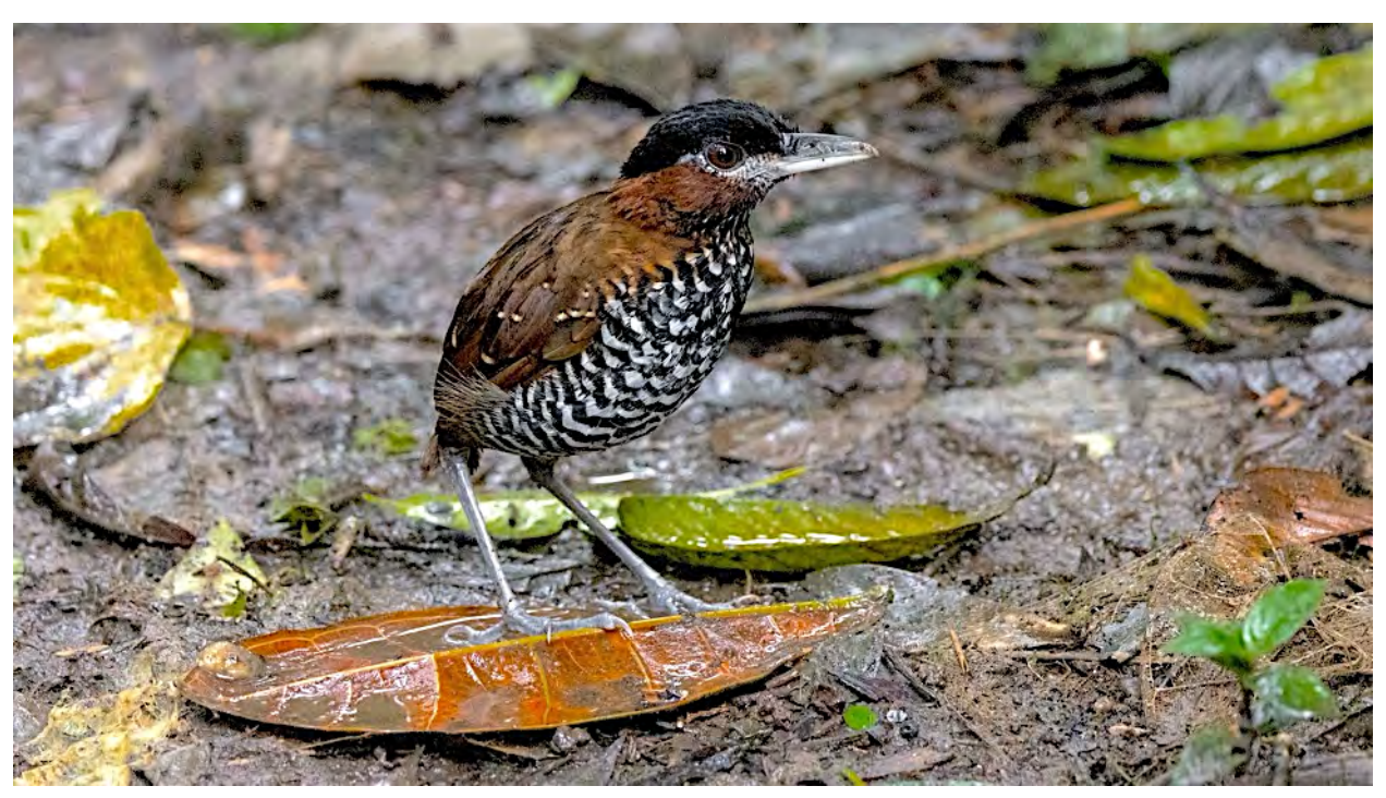
The Black-crowned Antpitta is a spectacular, large member of the family. These birds have a relatively small range from Costa Rica to northern Colombia, and Panama is a great place to see them.

This location is such a splendid base for our birding that Panama's Canopy Lodge makes a perfect tour for spouses who might be "lite" birders. And it will certainly make a superb introductory tour to Neotropical birds, and an exciting tour for birders who have birded some in Middle America but are still looking for their first Tody Motmot or Rosy Thrush-Tanager, or for those who have birded widely but who are still looking for their first Black-crowned Antpitta or Rufous-browed Tyrannulet while at the same time looking to relax a bit on a birder's holiday.