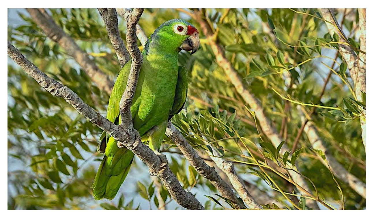
The Red-lored Amazon is one of several parrot species that we'll likely see from the Canopy Tower.