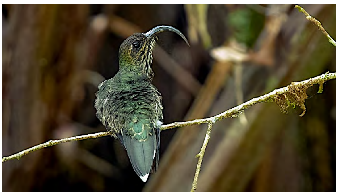
Near the Canopy Lodge we'll watch for local specialties such as this White-tipped Sicklebill. The amazing bill is adapted for feeding on Heliconia and other flowers.

One of the wonderful things about staying at the Canopy Tower is the access it affords to one of the best birding locales in the world, the Pipeline Road. The road is chock full of birds and winds through such high-quality forest that it is here that the Peregrine Fund and other biologists worked on a reintroduction program for the Harpy Eagle. It is also a good place to see several species of antibirds—little is quite as exciting as coming upon your first army ant swarm, attended, sometimes feverishly, by Ocellated, Bicolored, and Spotted antibirds, Plain-brown, Northern Barred-, Cocoa, and Black-striped woodcreepers, and Gray-headed Tanager. Neither is it uncommon to encounter a Cecropia tree full of frugivorous birds like Keel-billed and Yellow-throated (formerly Chestnut-mandibled) toucans or Red-capped and Velvety (Blue-crowned) manakins; and lethargic species like trogons, puffbirds, and motmots that sit almost motionless, seemingly content to watch forest life go by.