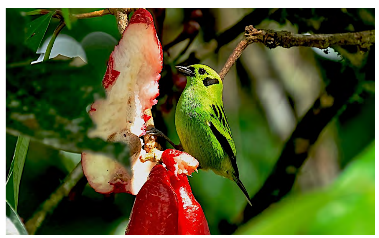
We'll see some gorgeous tanagers at the Canopy Lodge, including the brilliant Emerald Tanager.

El Valle—El Valle de Antón, located in bird-rich southeastern Coclé, was once seldom visited by birding groups. That has changed due to the efforts of Raúl Arias de Para, the conservationist and birder who transformed an old radar installation into the Canopy Tower and built the Canopy Lodge on his family property in El Valle. The Canopy Lodge duplicates the luxurious ambiance and amenities of the Canopy Tower in a cool environment. Our base of operations will be this lodge nestled under the watchful eye of an extinct volcano and within sight of the protected forests of Cerro Gaital Natural Monument. Along the trails around the lodge and at the Natural Monument we expect to see a variety of foothill species; high on our list will be Tody Motmot, Chestnut-backed Antbird, and an assortment of hummingbirds and tanagers, including Rufous-crested Coquette, White-tipped Sicklebill, and Bronze-tailed Plumeleteer, as well as Silver-throated, Emerald, Dusky-faced, and Tawny-crested tanagers, along with Rosy Thrush-Tanager. On our last morning at the Canopy Lodge we will make an early morning visit to the drier Pacific lowlands in search of Crested Bobwhite, Striped Cuckoo, Veraguan Mango and Mouse-colored Tyrannulet among other feathered residents of this habitat before having lunch at a beach house and continuing on to Panama City for the final night.