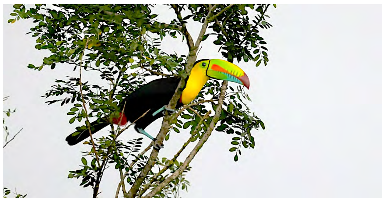
At the Canopy Tower, we'll be able to get up high enough to get good views of canopy dwellers like this Keel-billed Toucan.

Tour I: January 25-February 2, 2026 Tour II: March 6-14, 2026