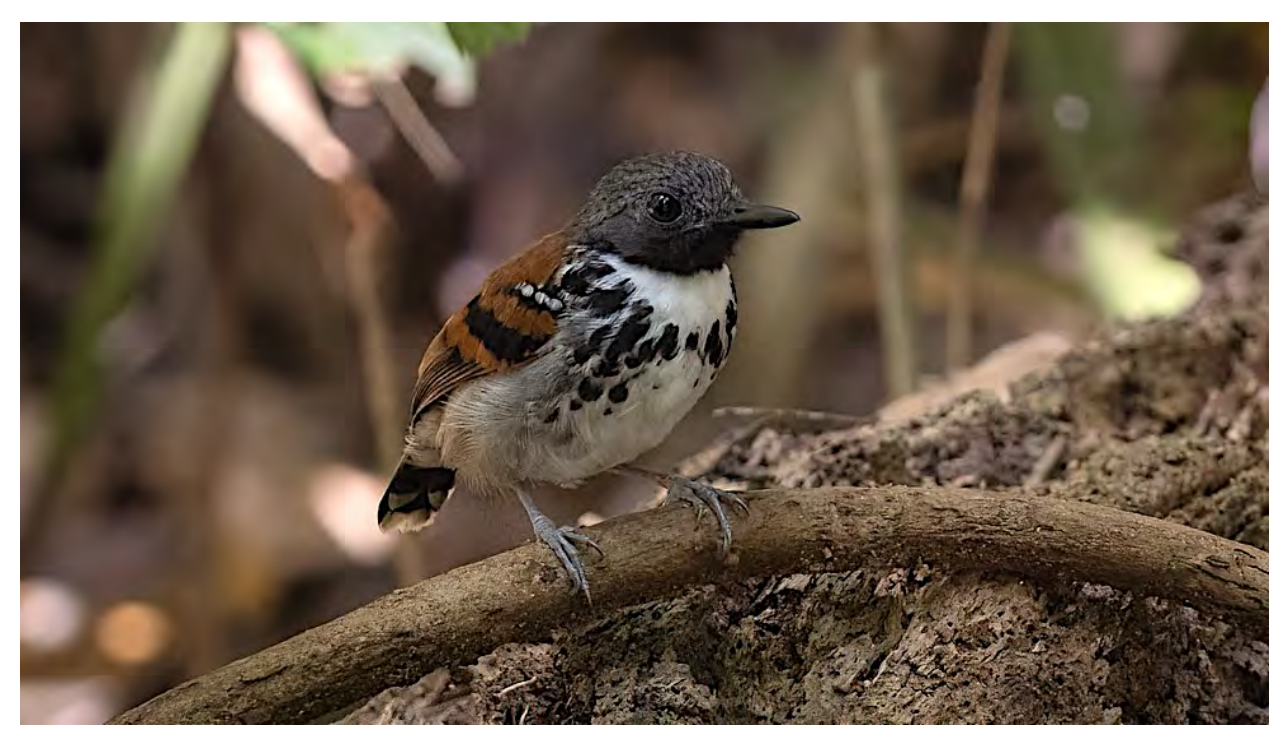
One of the birds we'll watch and listen for along Pipeline Road is the beautiful Spotted Antbird. They are often found following army ant swarms, although they are not obligate ant followers.