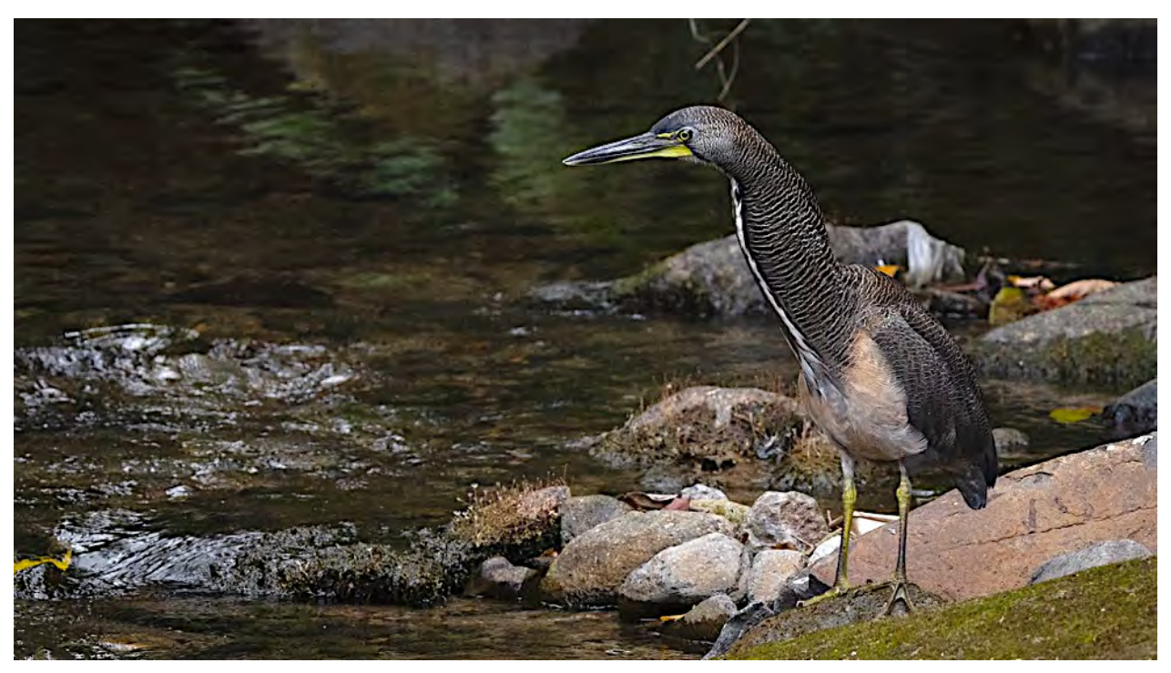
On recent tours, we've been lucky enough to find a Fasciated Tiger-Heron near the Canopy Lodge. They are generally uncommon, and prefer fast-flowing streams, unlike the Rufescent Tiger-Heron, which we may also see.

Day 5. Camino de Cruces National Park or Metropolitan Park in the morning; to Canopy Lodge. We will depart the Canopy Tower early this morning in order to visit some drier habitat forest before driving to the Canopy Lodge. Our choice between the two parks will depend on recent birding reports and traffic involved in getting there. Here Pacific-slope species make their home among the expanse of dry understory and scattered canopy. Species we'll be searching for include Lance-tailed Manakin, Rufous-and-white Wren, Rosy Thrush-Tanager, Golden-fronted and Scrub greenlets, Panama Flycatcher, and Yellow-green Tyrannulet, one of Panama's ten or so endemic birds. Bird activity wanes by midmorning, so we will plan to leave for the Canopy Lodge and arrive in time for lunch. After lunch we will bird some of the trails near the lodge. Night at the Canopy Lodge, El Valle.