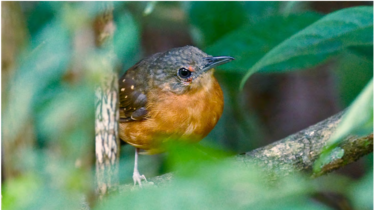
The Humaita Antbird (this is a female) is just one of many antbirds that we'll see on the tour.

We'll have adequate time to bird parts of the extensive cerrado enclave (open, savanna-like association of grass and low, corky-barked, fire-resistant trees) around the small town of Humaita. There are quite a few birds typical of the cerrado biome in this area, in addition to others of Amazonian origin that inhabit taller forest. Unfortunately, these open habitats around Humaita have recently (especially the past 20 or so years) come under great pressure from farmers who are plowing them up to plant soybeans, rice, and other crops. A huge amount of land was converted to rice just in the period 2019-2021. Thus, we'll bird several habitats, seeing many species that do not occur east of the Madeira, in the region of the Pousada Rio Roosevelt. A few examples in tall, humid forest include Ivory-billed Aracari, Golden-collared Toucanet, Gilded Barbet, Dusky-headed Parakeet, Fulvous Antshrike, Black Antbird, Predicted Antwren, and Inambari Woodcreeper. Even the rarely seen Fulvous-chinned Nunlet, Campina Jay, and Inambari Gnatcatcher are possibilities. Nights in Humaita.