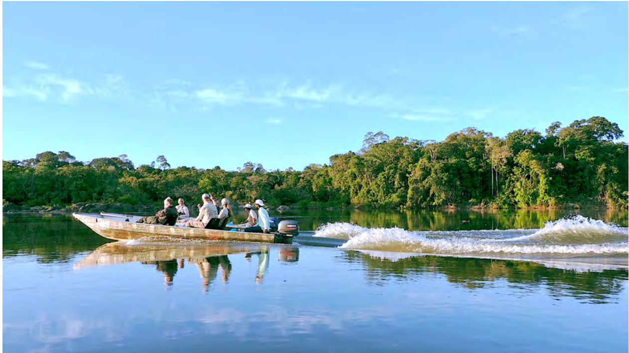
The beautiful Rio Roosevelt is one of the least developed regions in the Brazilian Amazon, and the only way to travel is by boat. We'll have six days to enjoy birding along the river and in the nearby forest.

We include here information for those interested in the 2022 Field Guides Brazil's Rio Roosevelt: Birding the River of Doubt tour: