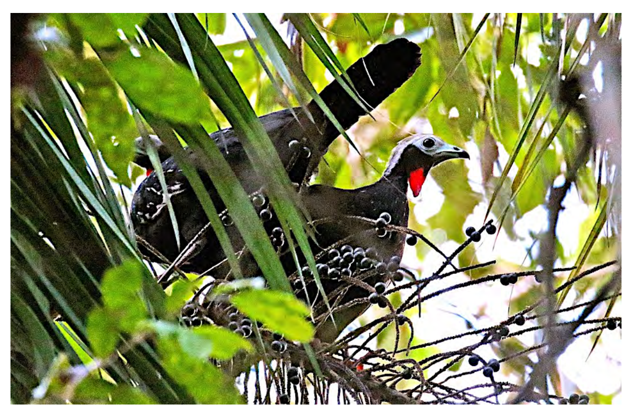
Large birds such as the Red-throated Piping-Guan are shy, but we've seen them well in the forests around the pousada.

As we leave the city behind, the Rio Madeira winding toward the Amazon out the left window, the flight traverses a half-hour of disturbed habitats before crossing a huge enclave of natural campos and scrub. There is a large gold-mining operation here, which represents a scar in this vast, forested landscape. The most exciting moments of the flight come as we descend toward the Rio Roosevelt, making a wide swing over the lodge and fantastic Santa Rita rapids to find the narrow, dirt-and-grass airstrip where our guys will be waiting for us. A new round of excitement begins as the doors open and we step off the plane! We'll walk along the wide (even clean-swept!) path from the airstrip to the pousada, the original path opened to portage the rapids on the Roosevelt-Rondon Expedition in 1914. It's an amazing feeling to walk under many of the same trees, to step over the same roots and boulders those men would have touched over 100 years earlier. We'll settle into our rooms, have our first delicious Poussada lunch, and then begin our birding of the Rio Roosevelt this afternoon, hoping for an early encounter with an antswarm! Night at Pousada Rio Roosevelt.