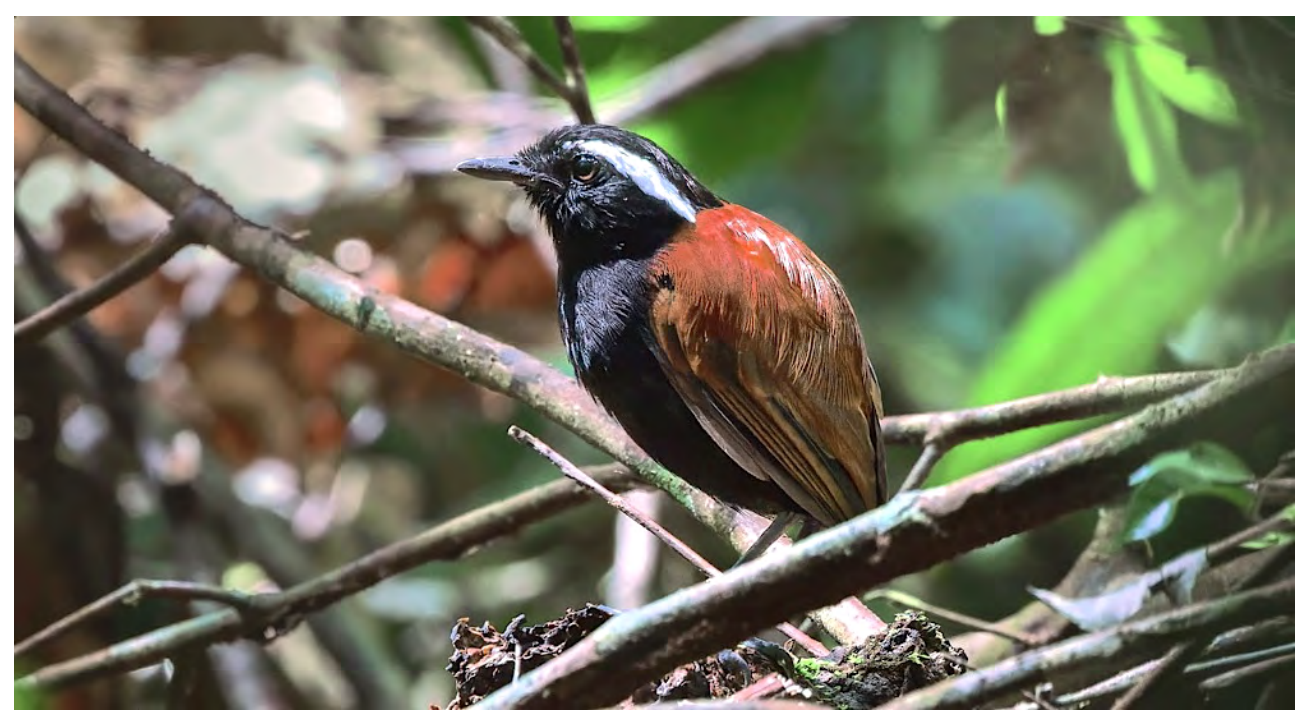
The Black-bellied Gnateater is endemic to the dense lowland forests south of the Amazon in Brazil. It is the largest of its genus, and can be difficult to see, but we've had some excellent experiences with this beautiful bird.

We include here information for those interested in the 2024 Field Guides Brazil's Rio Roosevelt: Birding the River of Doubt tour: