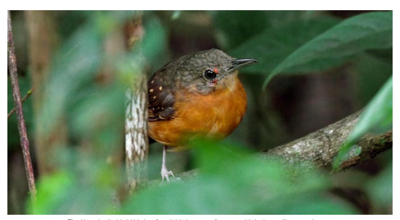
The Humaita Antbird (this is a female) is just one of many antbirds that we'll see on the tour.

We'll have adequate time to bird parts of the extensive cerrado enclave (open, savanna-like association of grass and low, corky-barked, fire-resistant trees) around the small town of Humaita. There are quite a few birds typical of the cerrado biome in this area, in addition to others of Amazonian origin that inhabit taller forest. Unfortunately, these open habitats around Humaita have recently (especially the past 20 or so years) come under great pressure from farmers who are plowing them up to plant soybeans, rice, and other crops. A huge amount of land was converted to rice just in the period 2019-2021. Thus, we'll bird several habitats, seeing many species that do not occur east of the Madeira, in the region of the Pousada Rio Roosevelt. A few examples in tall, humid forest include Brown-banded Puffbird, Ivory-billed and Curl-crested aracaris, Golden-collared Toucanet, Gilded Barbet, Bluish-fronted Jacamar, Dusky-headed Parakeet, Inambari Woodcreeper, Black Antbird, Predicted Antwren, and Short-billed Honeycreper. Even the rarely seen Fulvous-chinned Nunlet, Campina Jay, Inambari Gnatcatcher, Spotted Tanager, and White-bellied Dacnis are possibilities. Nights in Humaita.